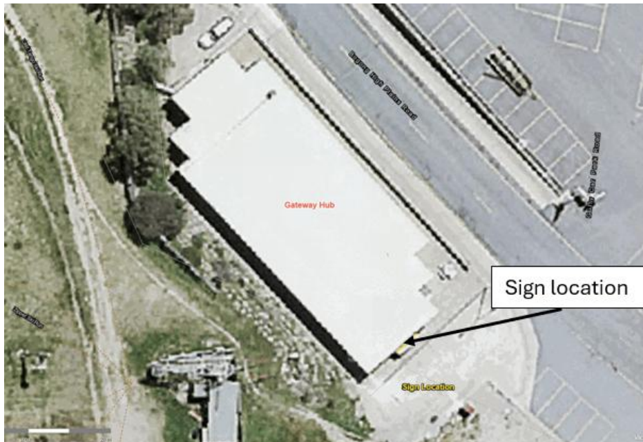
Figure 2: Location of sign