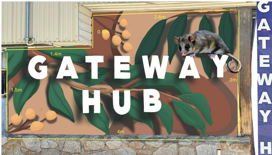
Figure 1: Proposed sign