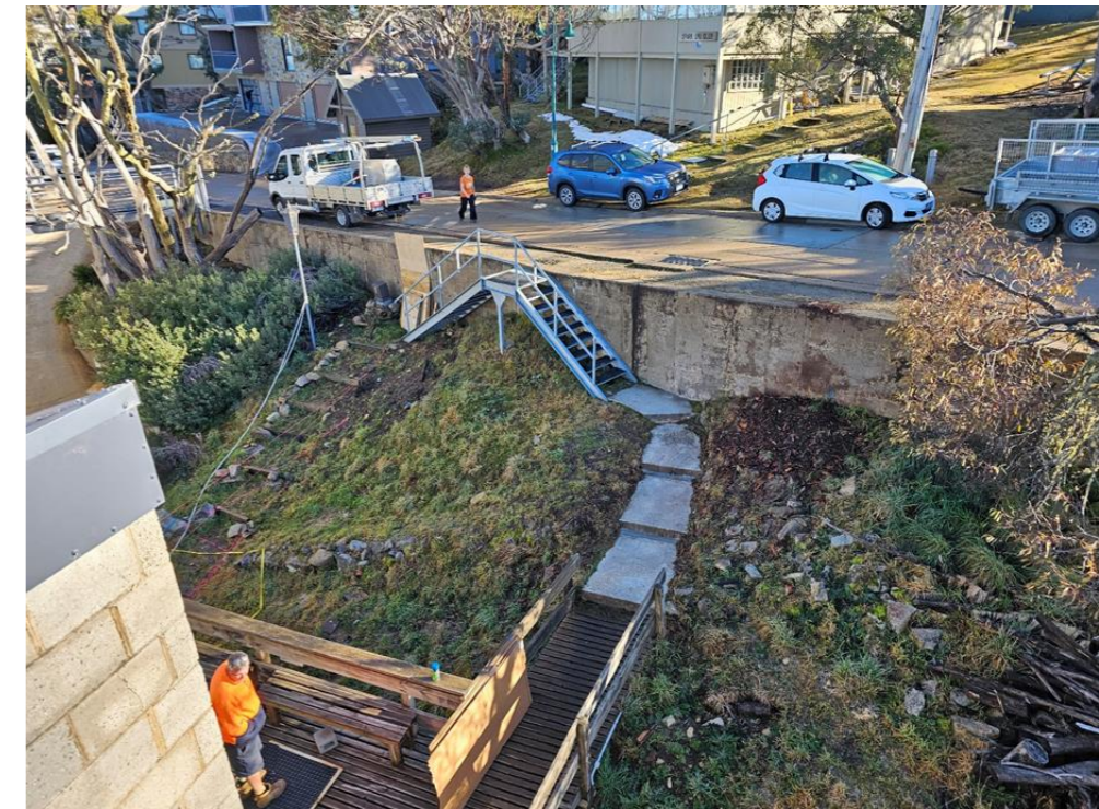
4. EXISTING DECK TO BE DEMOLISHED METAL STAIR ON FRONT (NORTH) BOUNDARY (TO BE RETAINED)