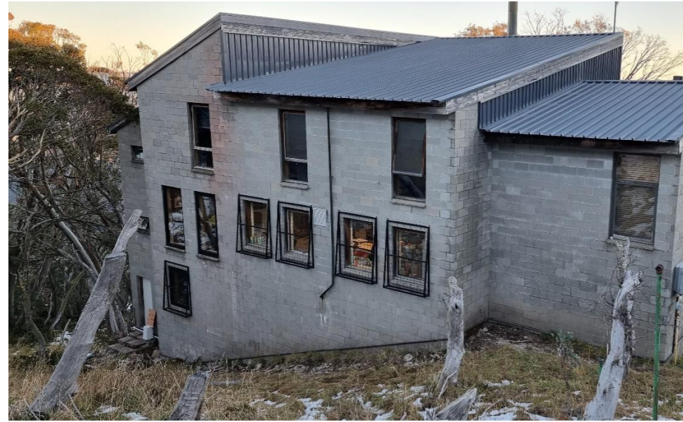
1. EXISTING BUILDING - EAST SIDE