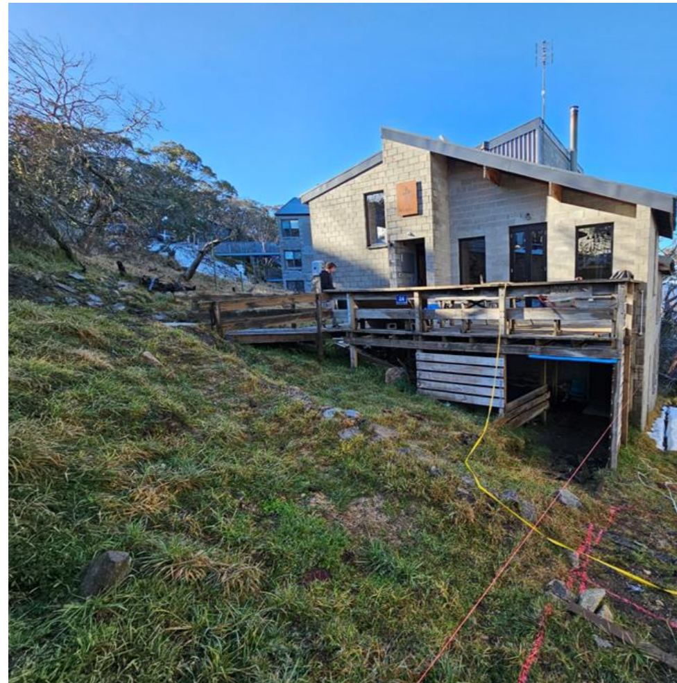
3. EXISTING BUILDING – NORTH SIDE

(Includes Deck to be demolished and replaced with new lwr ground level extension; also shows outline of proposed pathway to Winter entry door in western wall of extension)