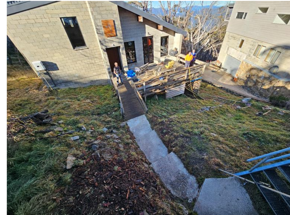
2. EXISTING BUILDING – NORTH SIDE INCL. SETBACK