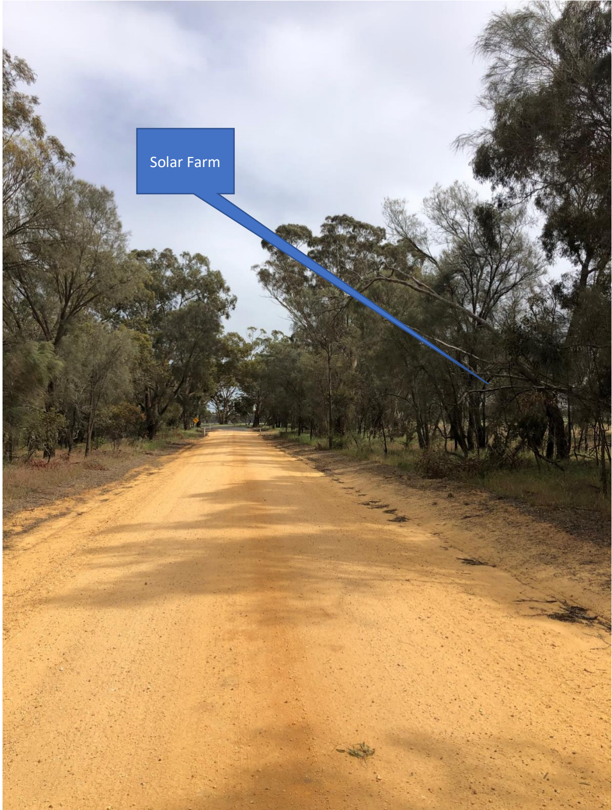
Looking North from Dane Road, Stawell towards 105 Dane Road, Stawell -37.011456, 142.801120