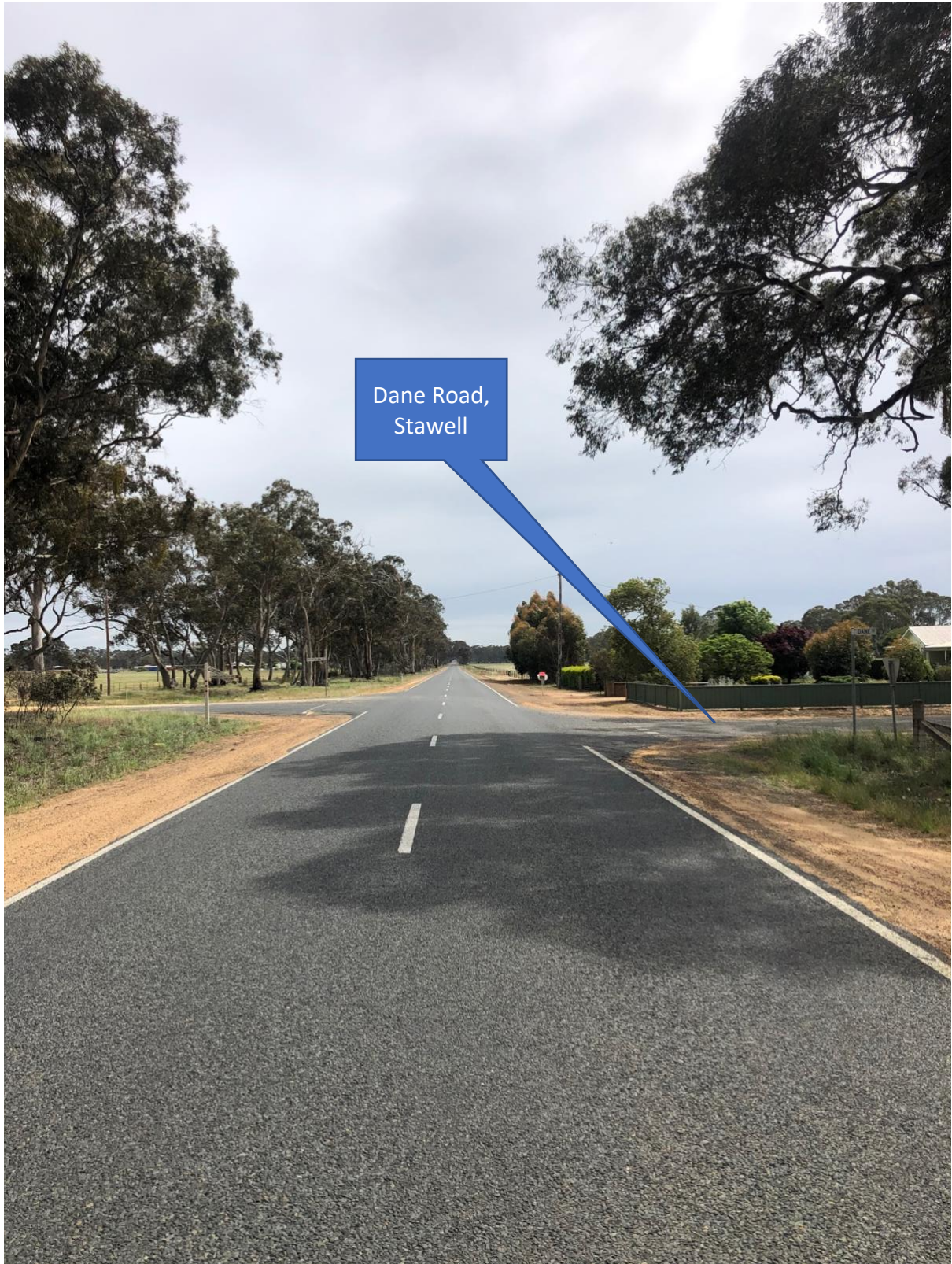
Looking North from Donald-Stawell Road, Stawell -37.008983, 142.785621