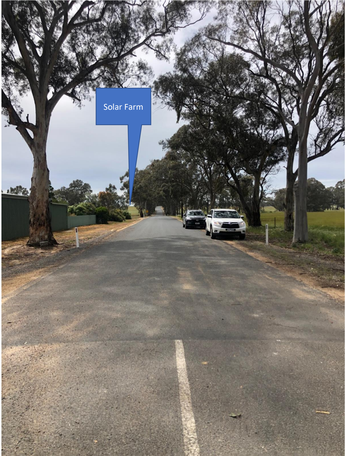
Looking East from junction of Dane Road/Donald-Stawell Road, Stawell -37.008761, 142.785749