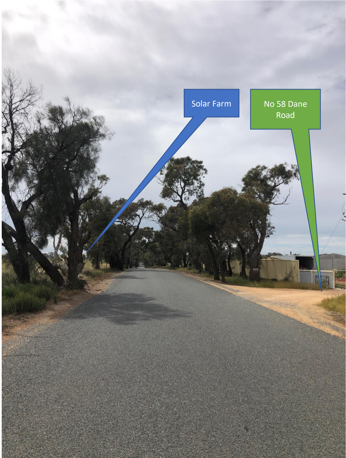
Looking East along Dane Road, Stawell -37.008709, 142.791715