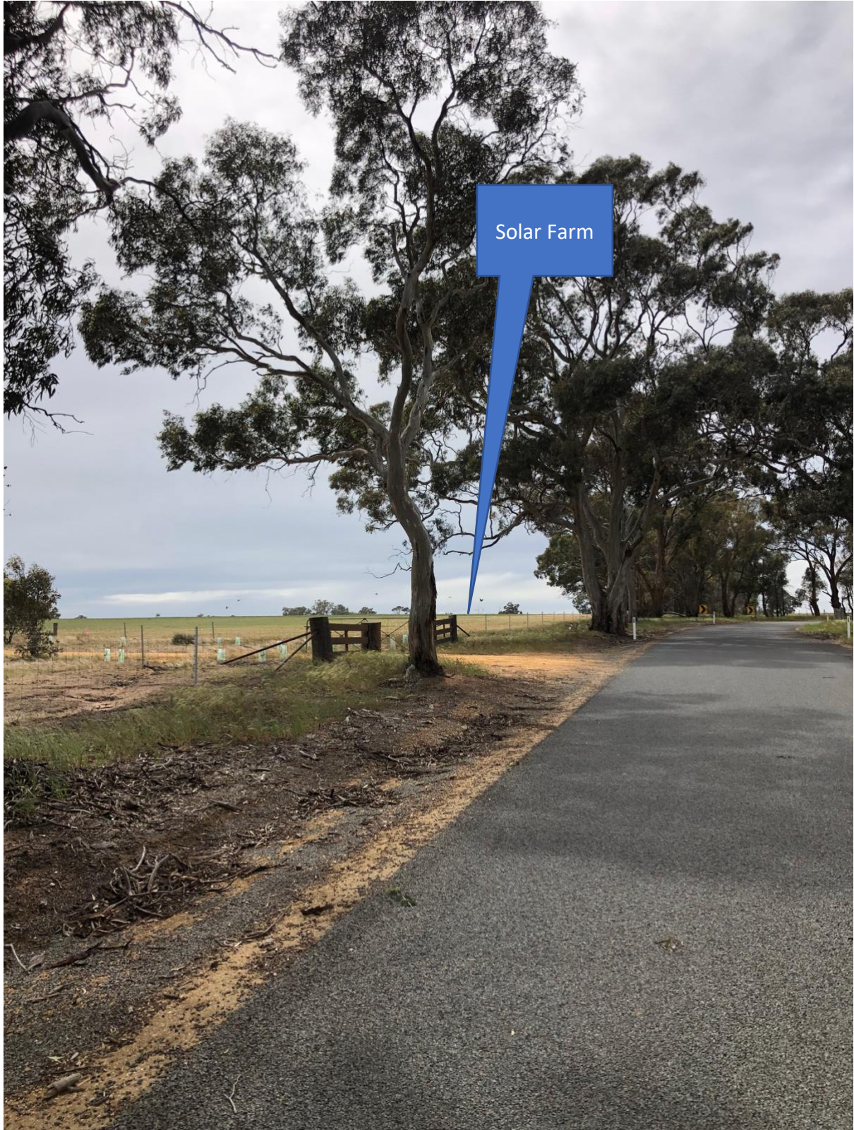
Looking East from Dane Road towards driveway of 105 Dane Road, Stawell -37.008686, 142.797107