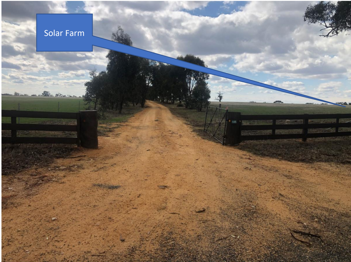
Looking North towards 105 Dane Road, Stawell existing driveway -37.008693, 142.797386