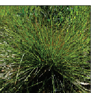
E Carex inversa 'Knob Sedge'