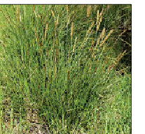
C Carex appressa 'Tall Sedge'