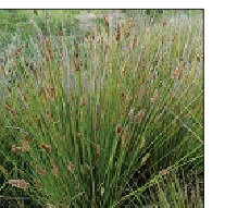
D Carex tereticaulis 'Common Sedge'