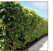
A Waterhousia 'Weeping Lilly Pilly'