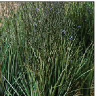
B Dianella revolute 'Blue Flax-lily'