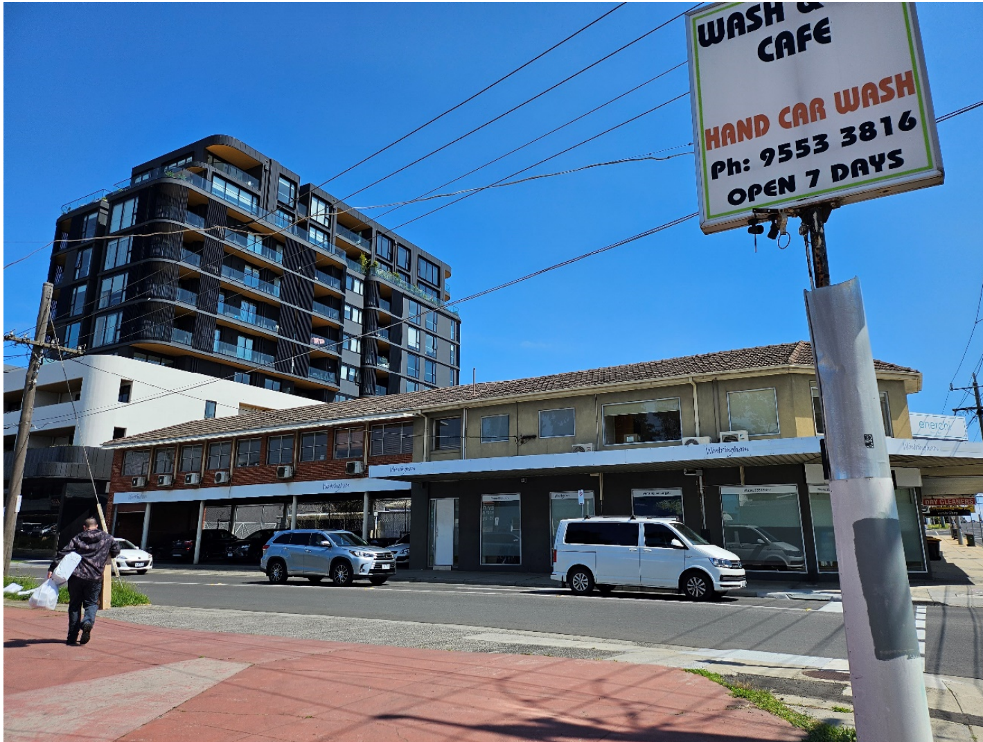
Figure 3 – Subject site viewed from Taylor Street

This copied document to be made available for the sole purpose of enabling its consideration and review as part of a planning process under the Planning and Environment Act 1987. The document must not be used for any purpose which may breach any copyright