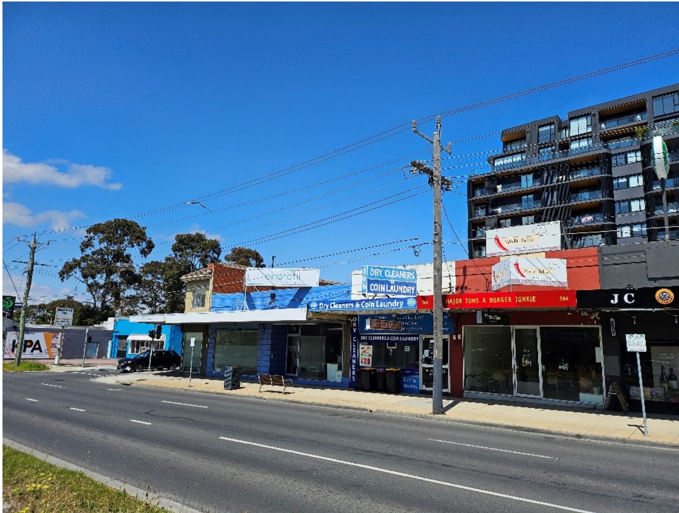
Figure 1 – Subject site viewed from South Road

This copied document to be made available for the sole purpose of enabling its consideration and review as part of a planning process under the Planning and Environment Act 1987. The document must not be used for any purpose which may breach any copyright