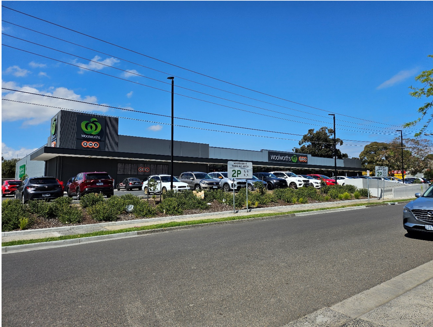
Figure 9 - 2 Taylor Street

This copied document to be made available for the sole purpose of enabling its consideration and review as part of a planning process under the Planning and Environment Act 1987. The document must not be used for any purpose which may breach any copyright