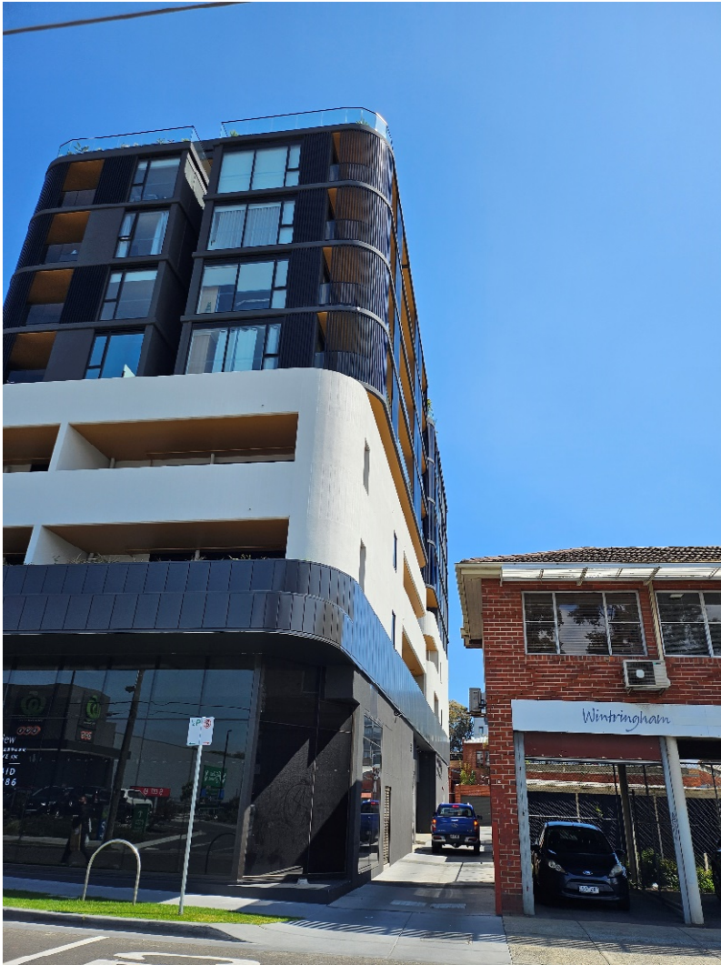
Figure 4 - 17 Taylor Street & Access to (ROWY) Laneway, adjacent to 17 Taylor Street

This copied document to be made available for the sole purpose of enabling its consideration and review as part of a planning process under the Planning and Environment Act 1987. The document must not be used for any purpose which may breach any copyright