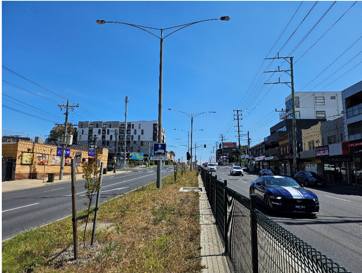
Figure 5 – South Road (facing west)

This copied document to be made available for the sole purpose of enabling its consideration and review as part of a planning process under the Planning and Environment Act 1987. The document must not be used for any purpose which may breach any copyright