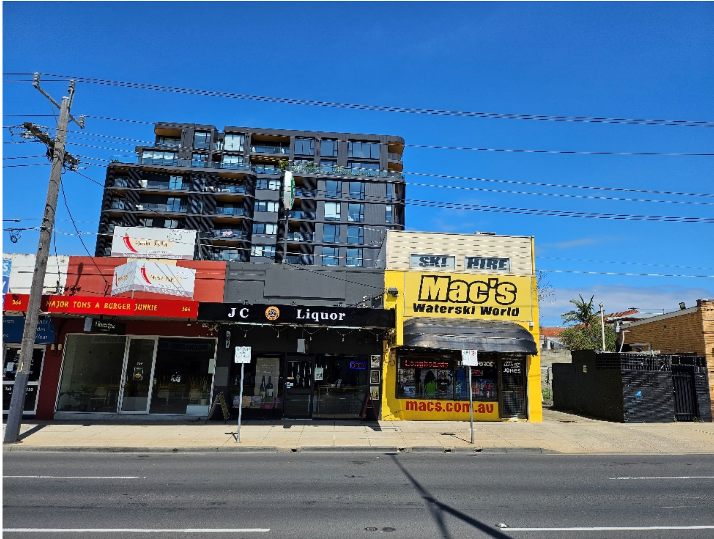
Figure 2 – Subject site viewed from South Road

This copied document to be made available for the sole purpose of enabling its consideration and review as part of a planning process under the Planning and Environment Act 1987. The document must not be used for any purpose which may breach any copyright