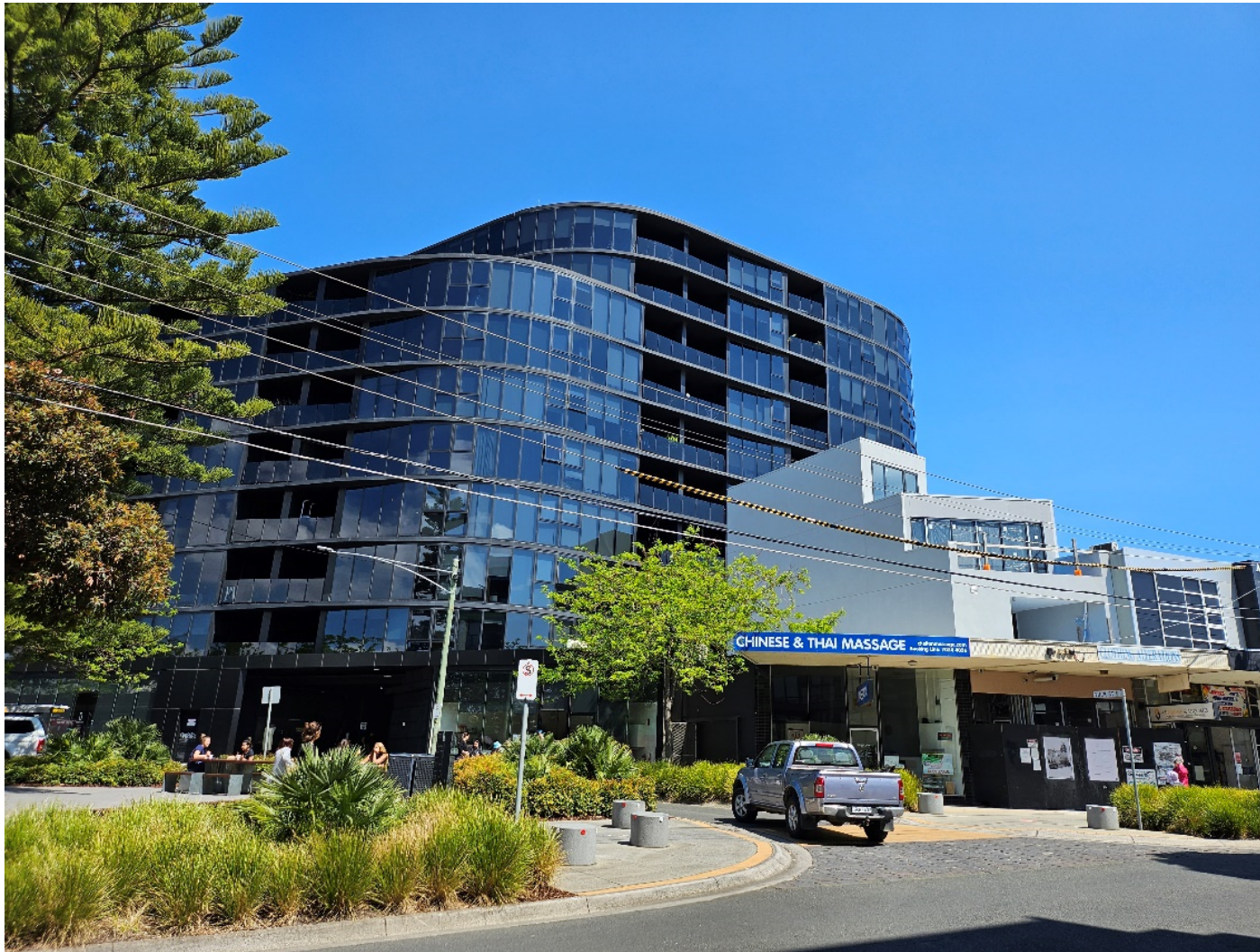
Figure 12 - 4-7 Station Street

This copied document to be made available for the sole purpose of enabling its consideration and review as part of a planning process under the Planning and Environment Act 1987. The document must not be used for any purpose which may breach any copyright