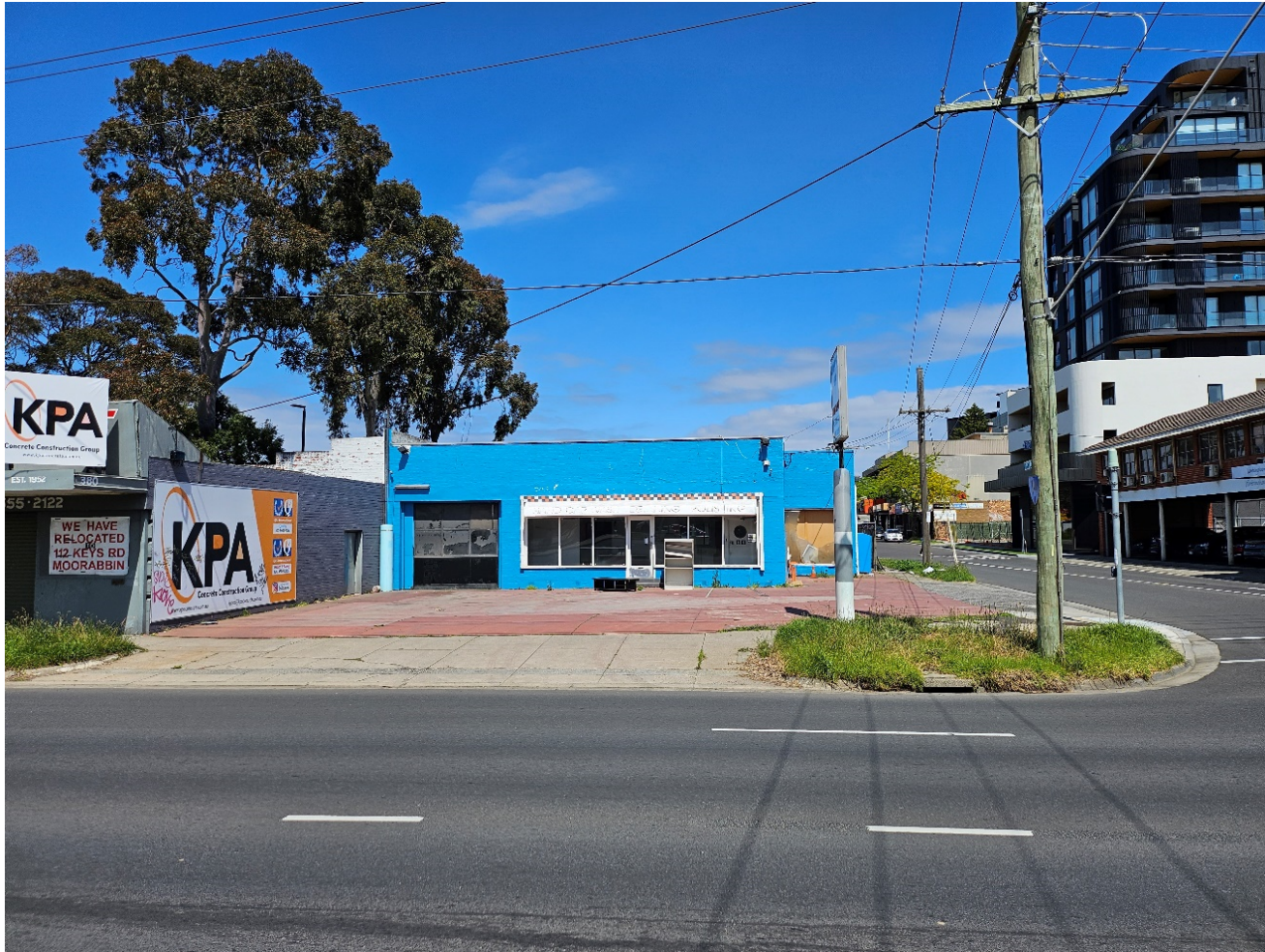
Figure 8 - 374-378 South Road

This copied document to be made available for the sole purpose of enabling its consideration and review as part of a planning process under the Planning and Environment Act 1987. The document must not be used for any purpose which may breach any copyright