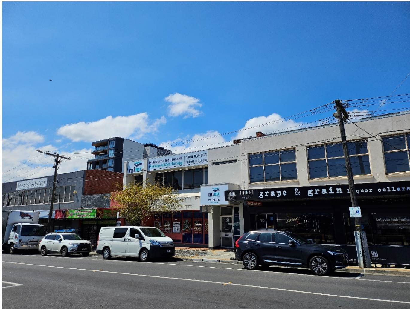
Figure 13 - 16-24 Station Street

This copied document to be made available for the sole purpose of enabling its consideration and review as part of a planning process under the Planning and Environment Act 1987. The document must not be used for any purpose which may breach any copyright