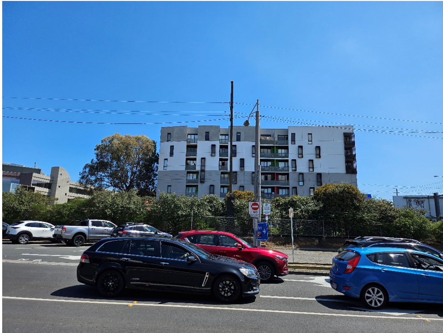
Figure 15 – 1 Station Street with 358a South Road beyond the Railway concourse

This copied document to be made available for the sole purpose of enabling its consideration and review as part of a planning process under the Planning and Environment Act 1987. The document must not be used for any purpose which may breach any copyright