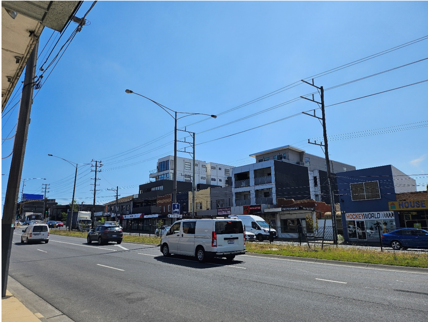
Figure 7 – South Road viewed from subject site

This copied document to be made available for the sole purpose of enabling its consideration and review as part of a planning process under the Planning and Environment Act 1987. The document must not be used for any purpose which may breach any copyright