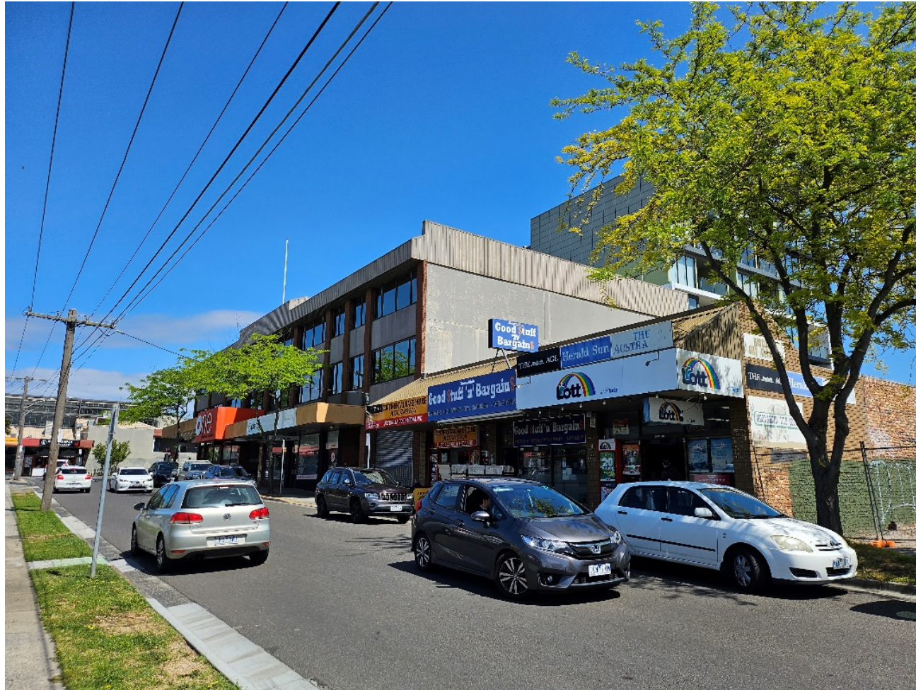
Figure 11 – 1-11 Taylor Street

This copied document to be made available for the sole purpose of enabling its consideration and review as part of a planning process under the Planning and Environment Act 1987. The document must not be used for any purpose which may breach any copyright