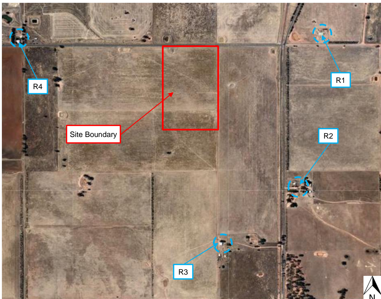
Figure 1: Aerial Photograph of Subject Site and Surrounds

The aerial photo shown below in Figure 1 identifies the subject site under consideration and the nearby noise sensitive receptors considered relevant for this assessment.