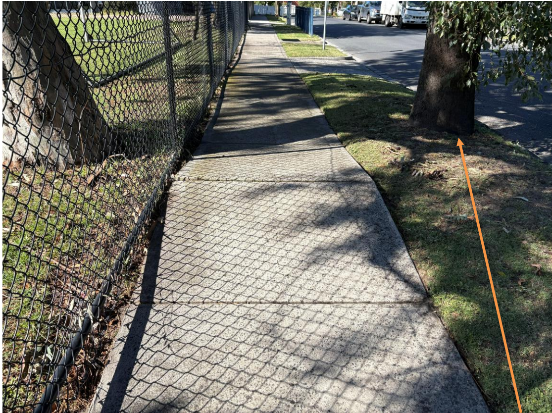
Pronounced lifting of footpath opposite Tree 42