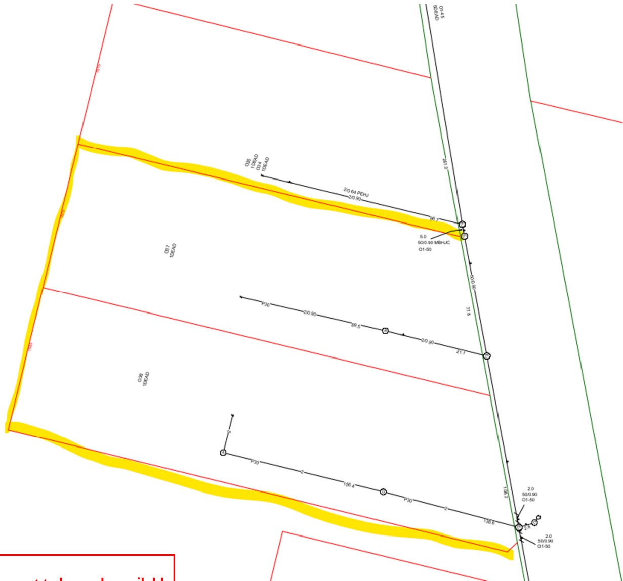
Figure 1 – Telstra Copper Infrastructure