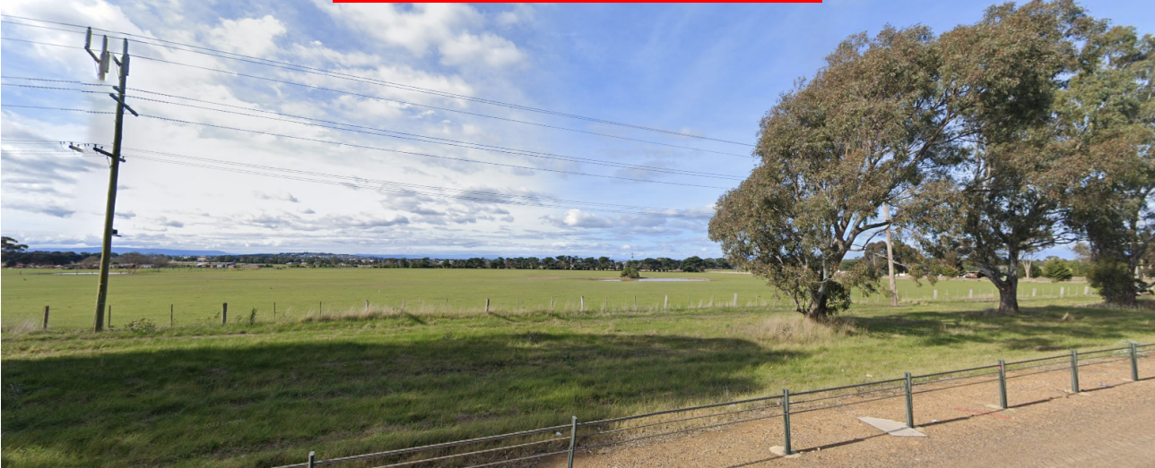
Figure 3 – Photo of overhead Power infrastructure on Mickleham Road