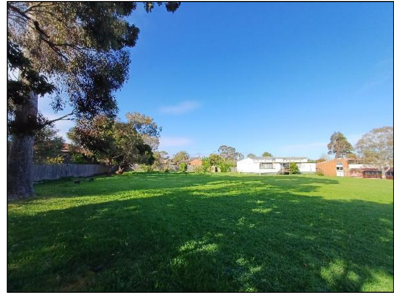
Subject site as viewed from north