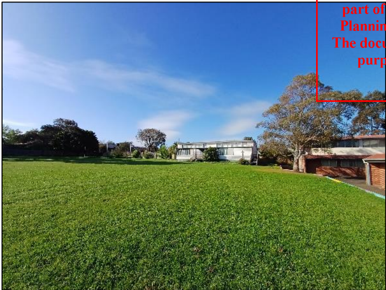
Subject site as viewed from west

This copied document to be made available for the sole purpose of enabling its consideration and review as part of a planning process under the Planning and Environment Act 1987. The document must not be used for any purpose which may breach any copyright