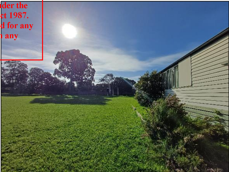
Subject site as viewed from south