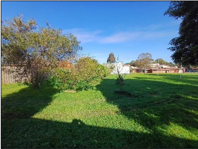
Subject site as viewed from east