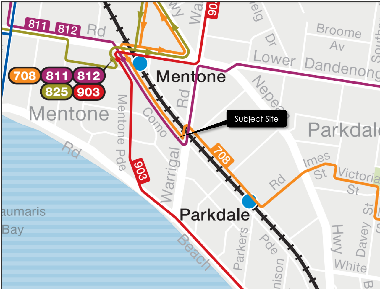
Table 1 Public Transport Provision