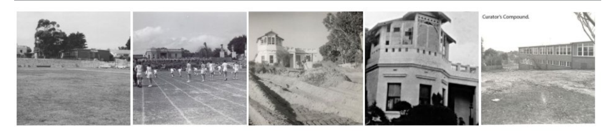
'Bay View' - the original homestead