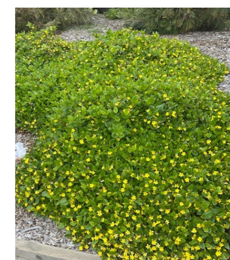
Goodenia ovata prostrate 'Gold cover'