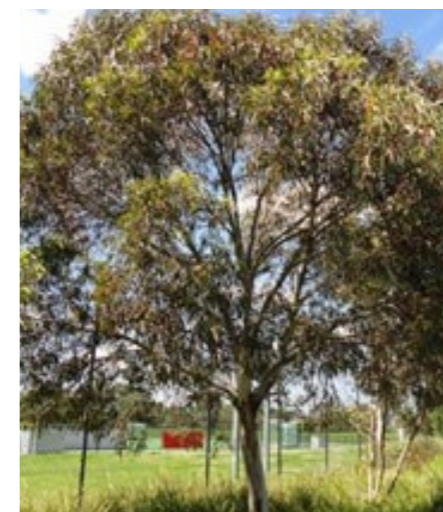
Eucalyptus leucoxylon 'Euky Dwarf'