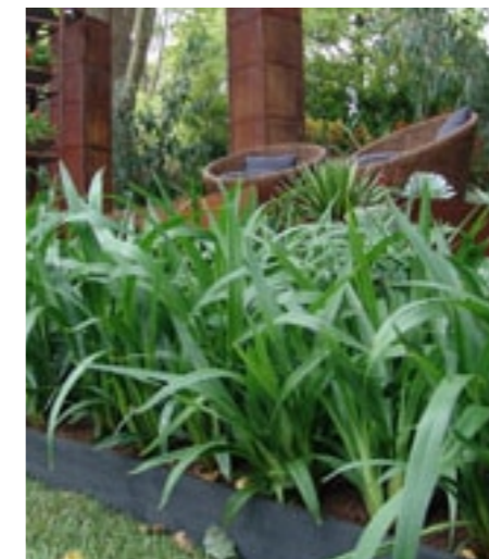
Dianella tasmanica 'Emerald Arch'