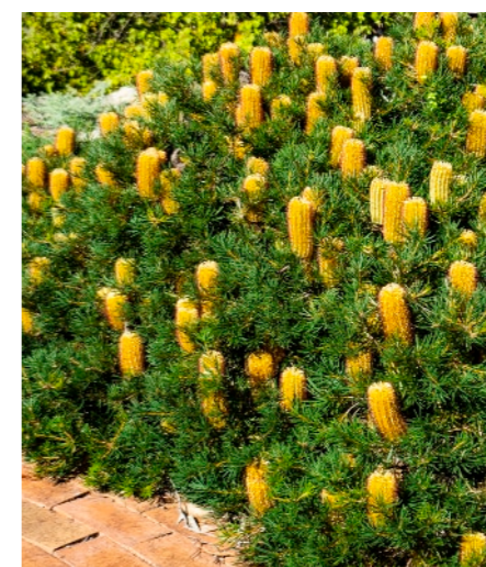
Banksia marginata dwarf 'Mini Marg'