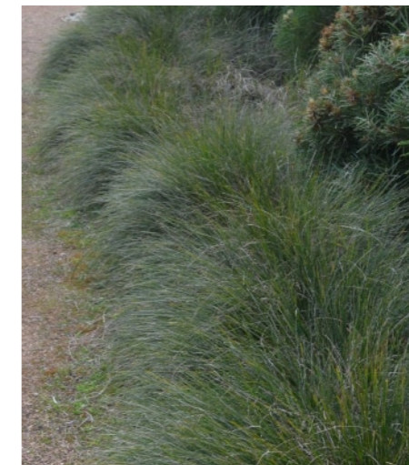
Lomandra confertifolia rubiginosa Seascape