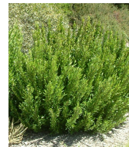
Correa glabra 'Coliban River'