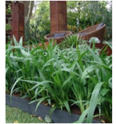
Dianella tasmanica 'Emerald Arch'