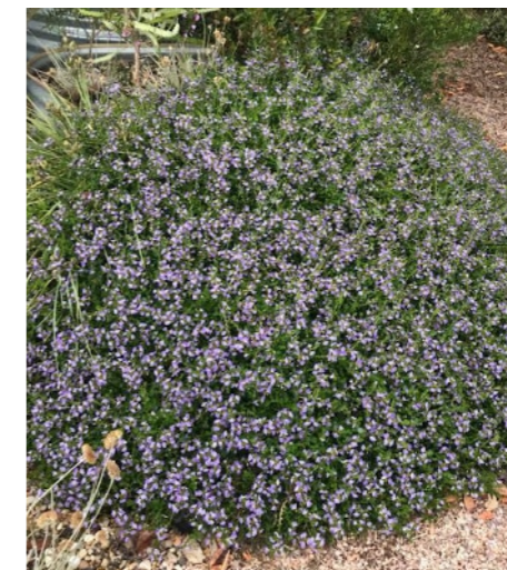
Scaevola albida 'Super Clusters'