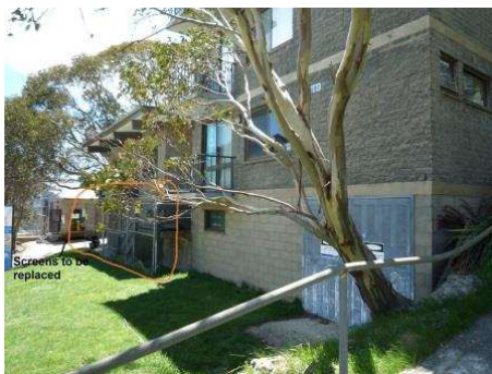
Snow screens replacement

The construction sites are located on the footprint of existing structures, so there will be no removal of flora. Refer photos below.