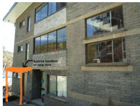
Entry roof addition