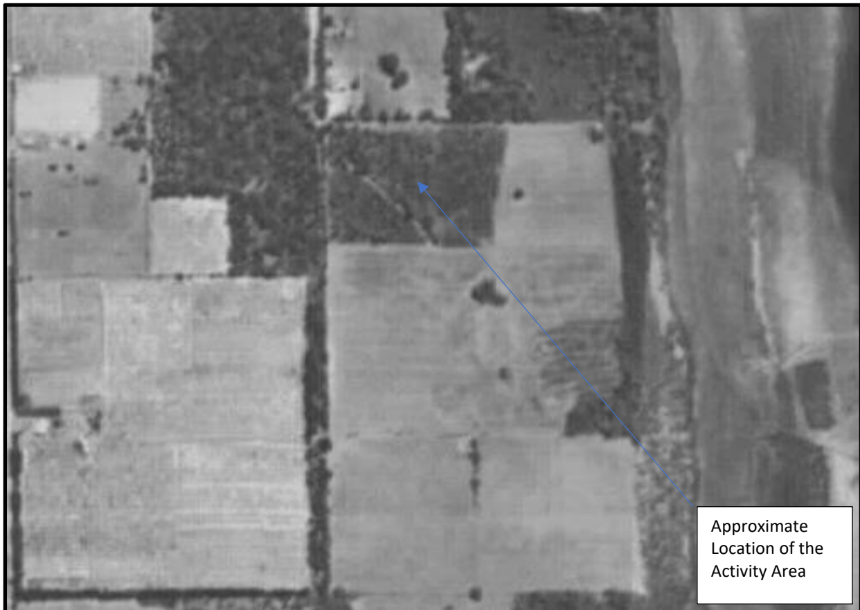
Figure 1: 1957 Aerial Photograph (DELWP 2020b)

Figure 2 shows the general location of the Activity Area in 1957. The location of the Activity Area is clearly undeveloped and still covered by open woodland.