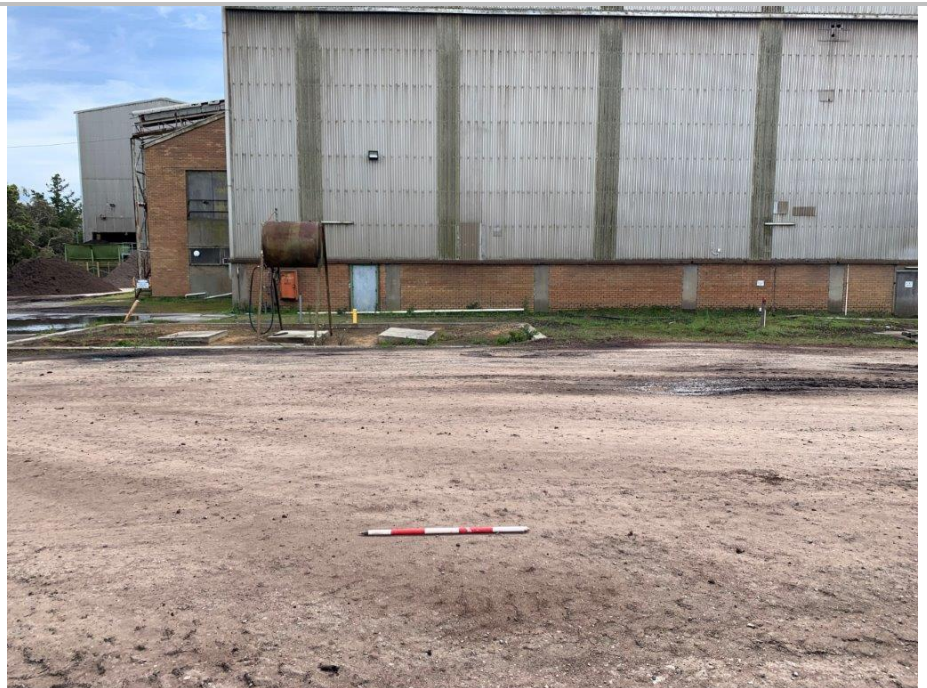
Table 1: Survey Photographs