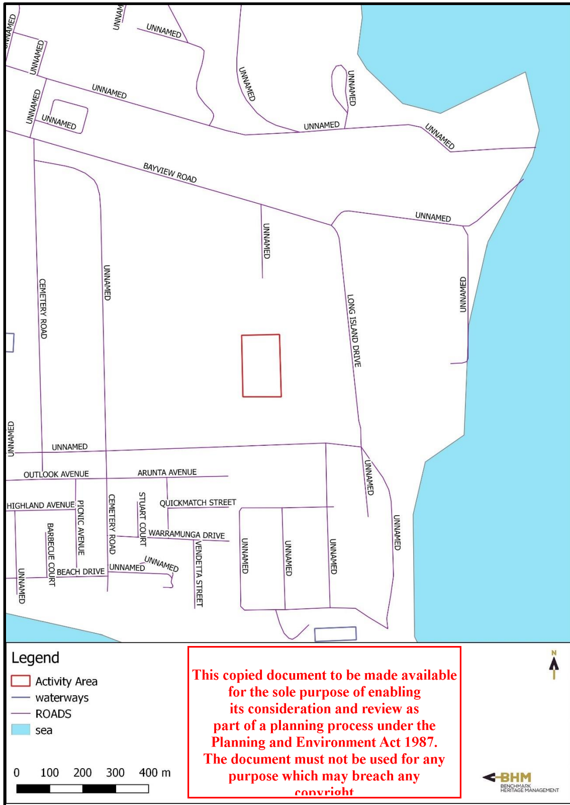
Map 1: Location of Activity Area in a Local Context