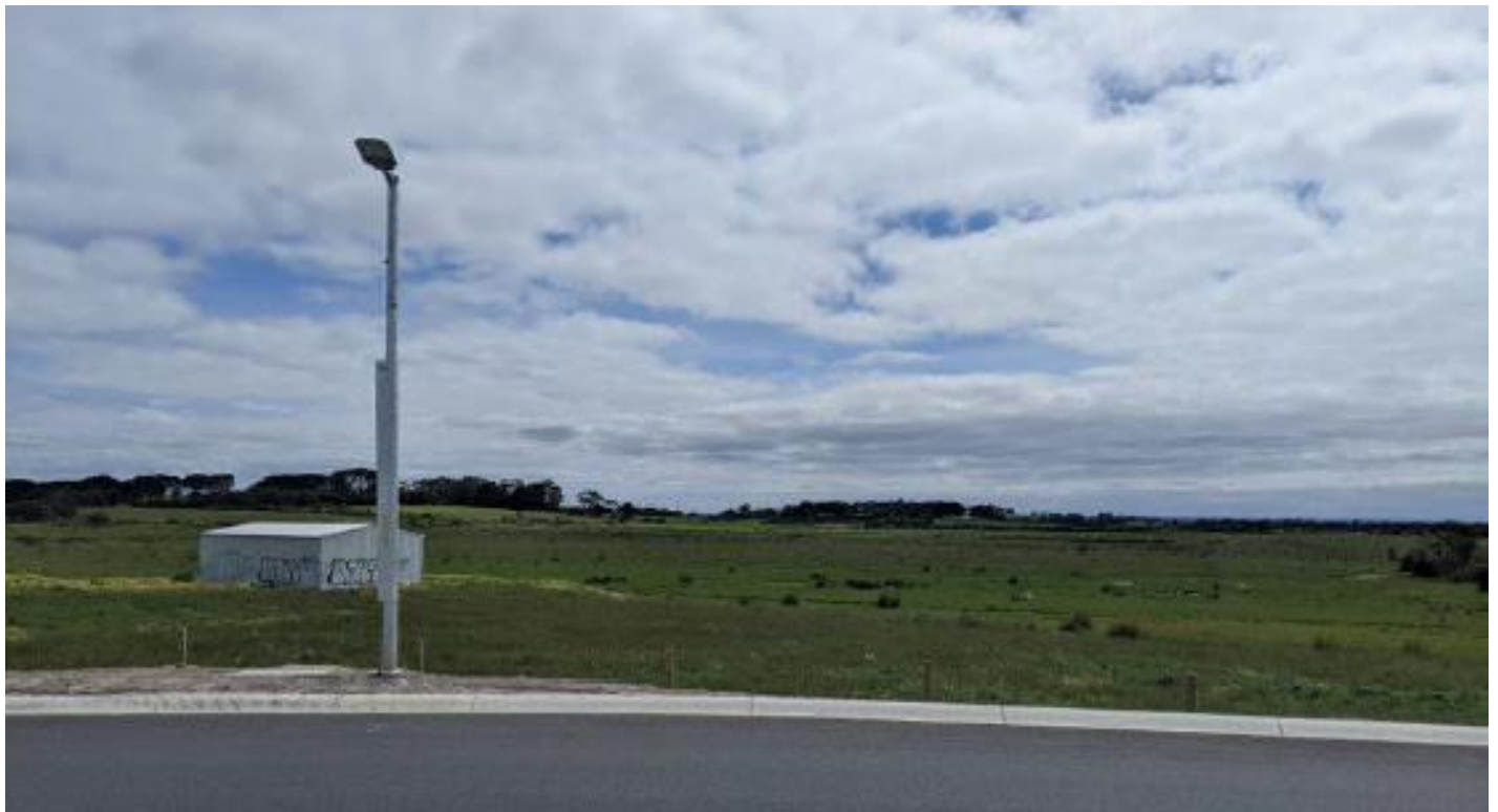
Figure 6: View of the site from the Phillip Island Road roundabout, looking north (Source: Application documents).