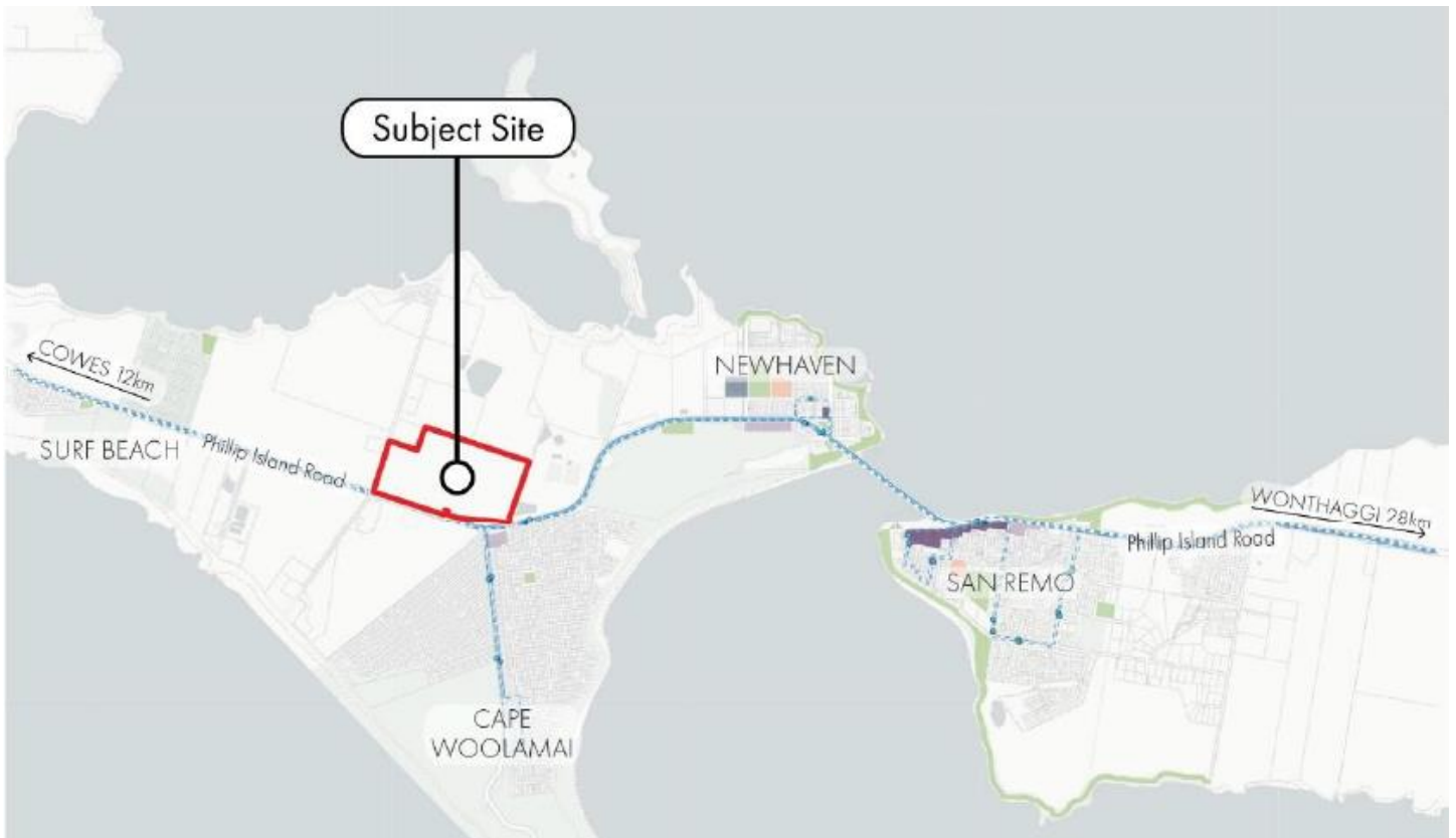
Figure 7: Site context map.