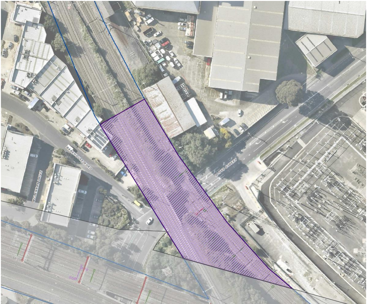
Figure 2.0 Lloyd Street – works outside project land boundary