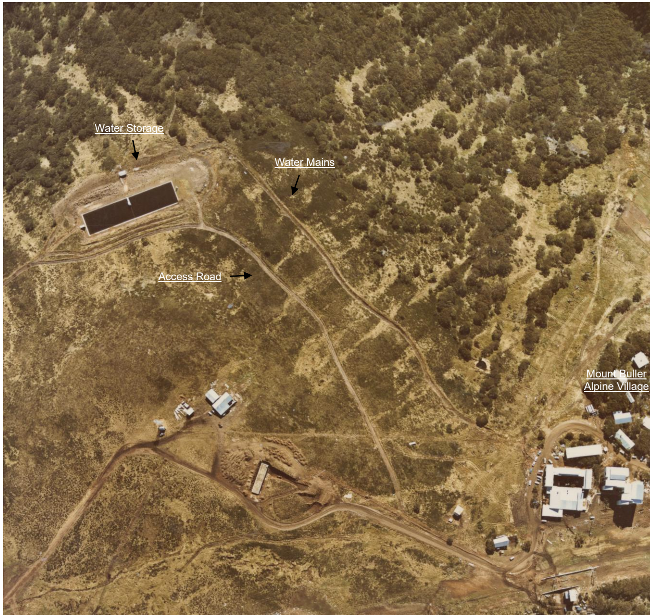
Burnt Hut Spur Water Storage and Northside Express Top Station Area – May 1970

This copied document to be made available for the sole purpose of enabling its consideration and review as part of a planning process under the Planning and Environment Act 1987. The document must not be used for any purpose which may breach any copyright