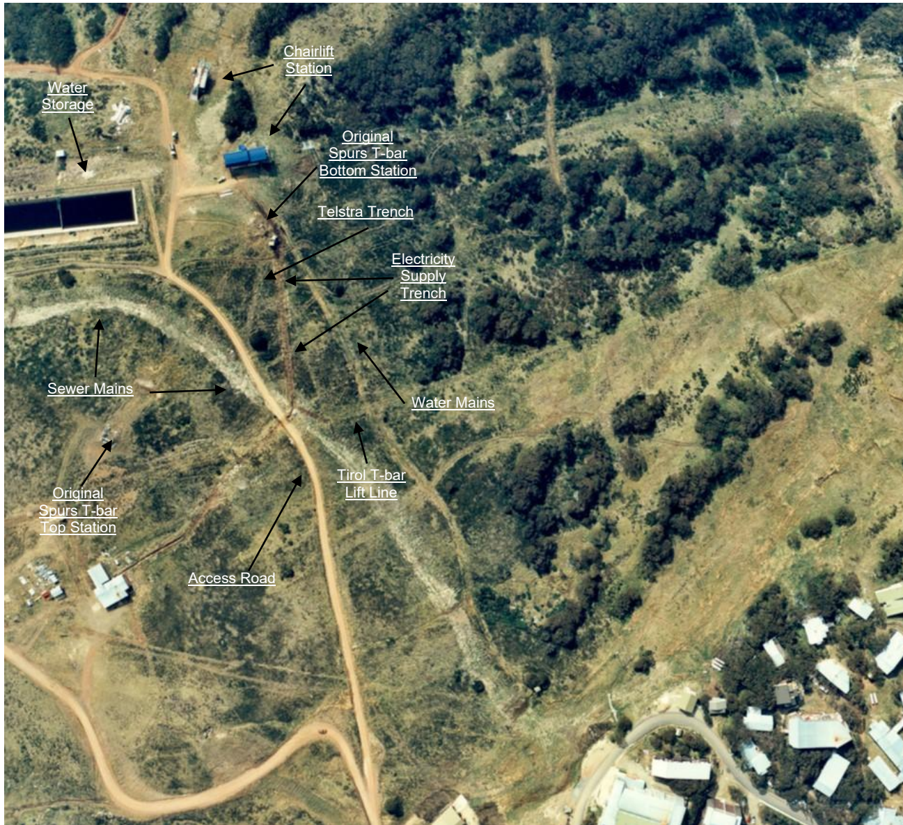
Burnt Hut Spur Water Storage and Northside Express Top Station Area – March 1987

This copied document to be made available for the sole purpose of enabling its consideration and review as part of a planning process under the Planning and Environment Act 1987. The document must not be used for any purpose which may breach any copyright