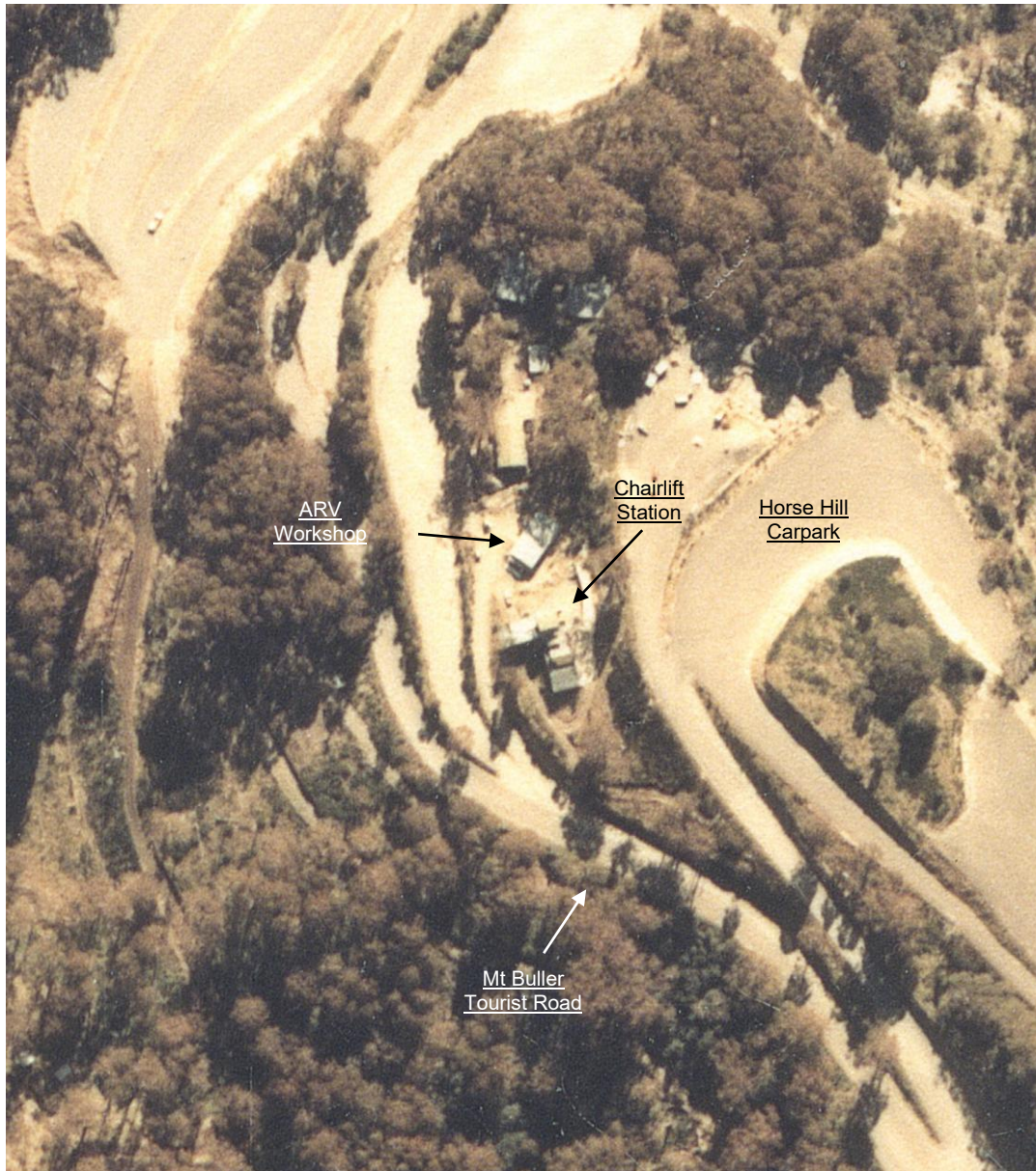
Horse Hill Carpark and Northside Express Chairlift Bottom Station Area – April 1985

This copied document to be made available for the sole purpose of enabling its consideration and review as part of a planning process under the Planning and Environment Act 1987. The document must not be used for any purpose which may breach any copyright