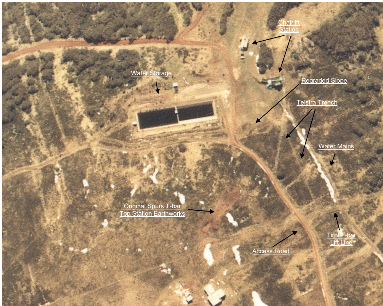
Burnt Hut Spur Water Storage and Northside Express Top Station Area – April 1985