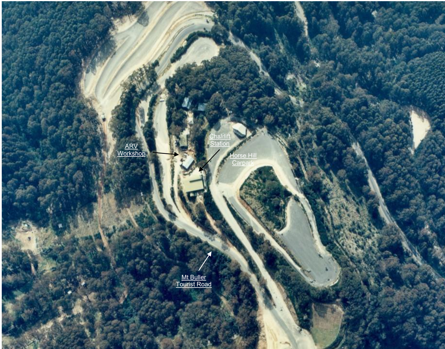
Horse Hill Carpark and Northside Express Chairlift Bottom Station Area – March 1987

This copied document to be made available for the sole purpose of enabling its consideration and review as part of a planning process under the Planning and Environment Act 1987. The document must not be used for any purpose which may breach any copyright