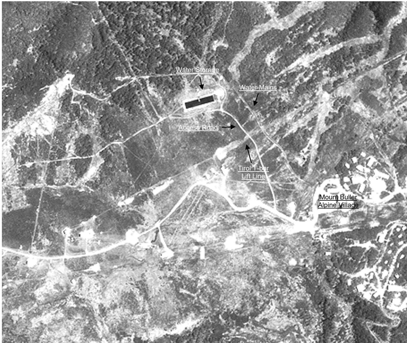
Burnt Hut Spur Water Storage and Northside Express Top Station Area – Feb/Mar 1977

This copied document to be made available for the sole purpose of enabling its consideration and review as part of a planning process under the Planning and Environment Act 1987. The document must not be used for any purpose which may breach any copyright