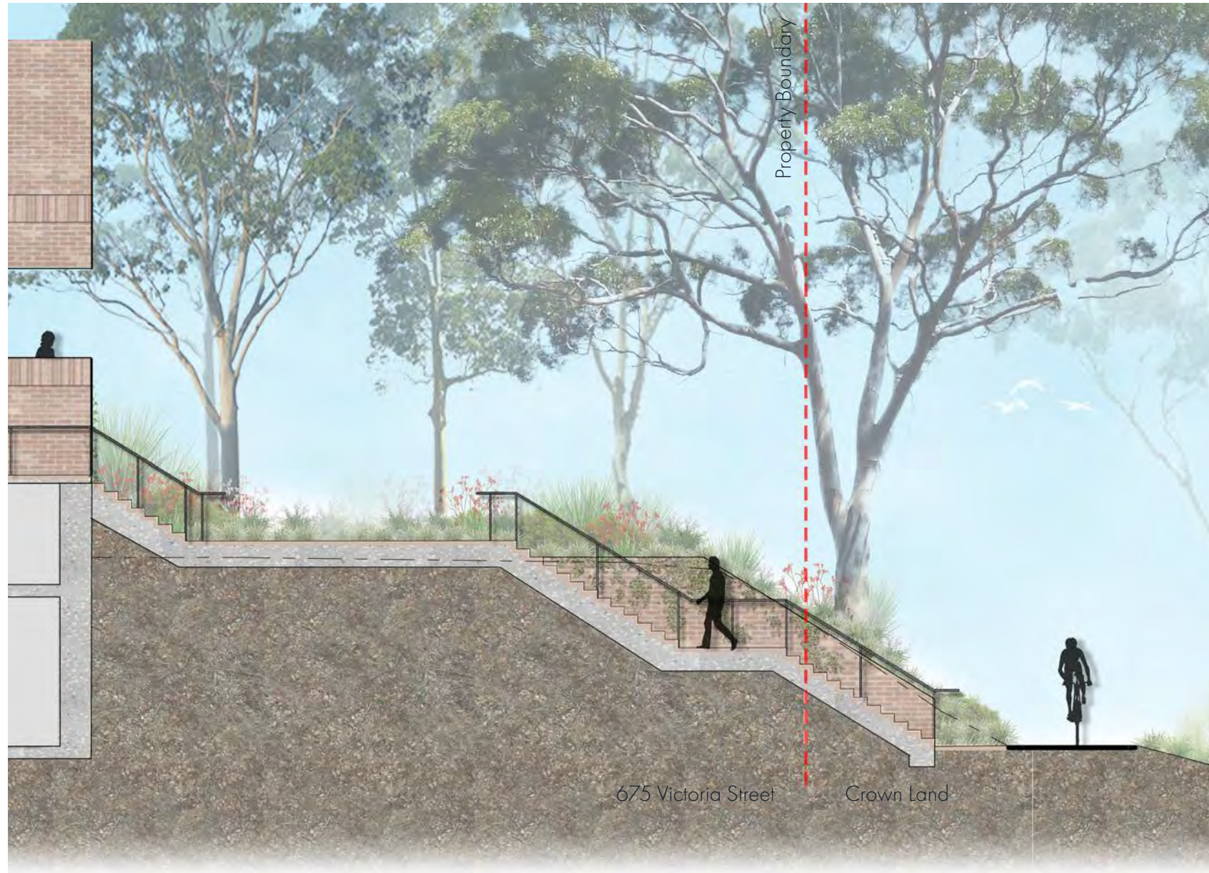
Section A - 1:100 @A3