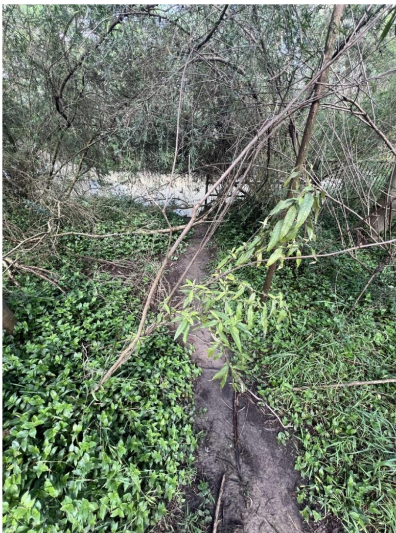
Figure 3: Existing access track