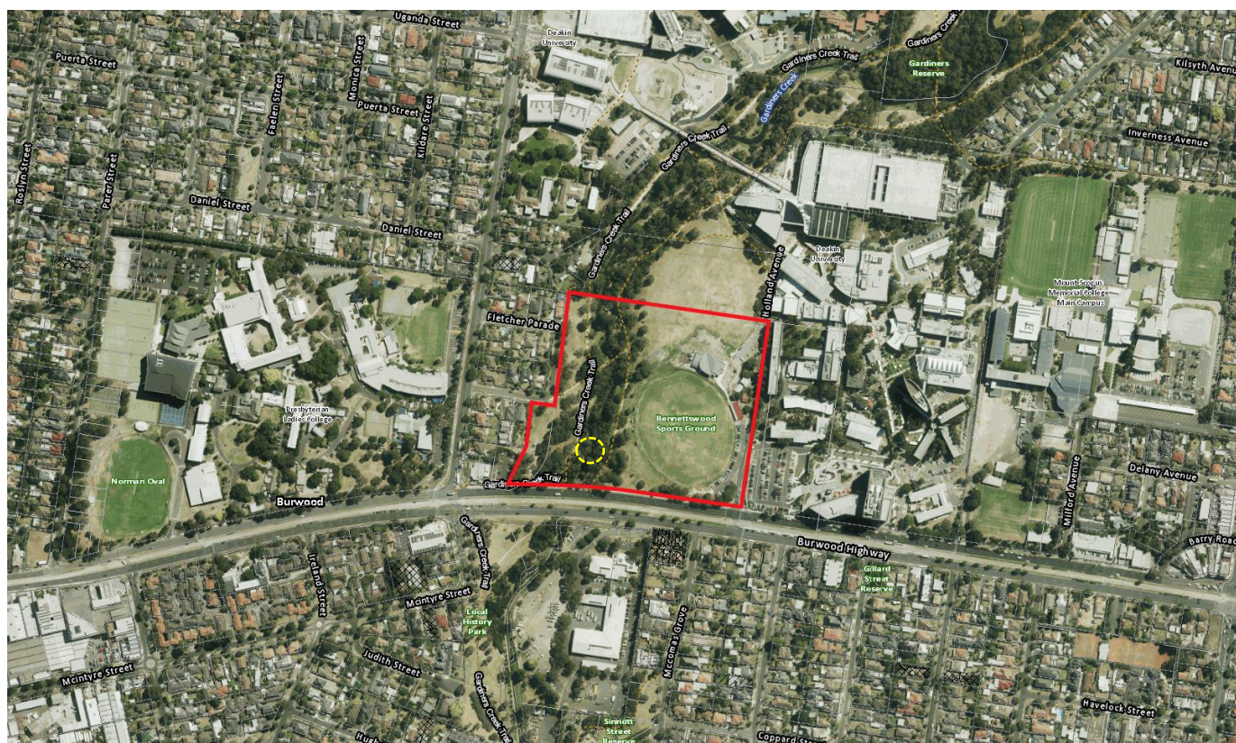
Figure 1: Aerial imaging of the site context - site marked in red, proposal area marked (approximately) in yellow