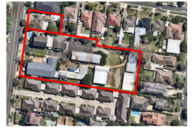
AERIAL PHOTO (NOT TO SCALE)