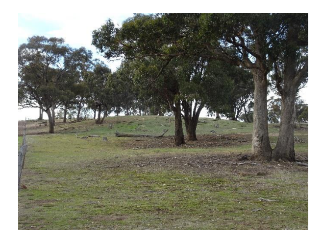
Looking upslope to the tailings heap.