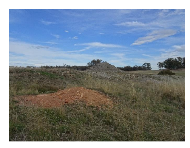
View of mullock heap looking south-east. Small pile of soil in foreground is recent and does not appear to be associated with mining site remains.