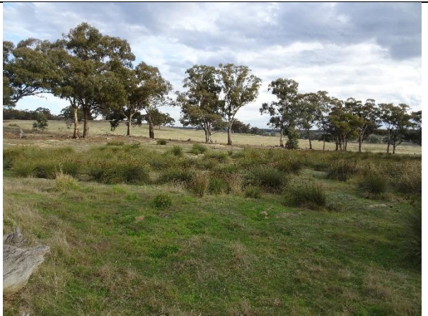
Looking across the tailings dam area. The Petersen property is beyond the tree line which marks the property boundary fence.