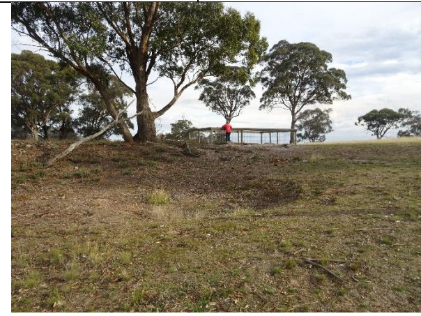
Area to the north of the shaft, perhaps the location described as 'largely buried stone winder bed' by Bannear.