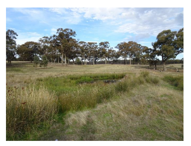
Looking from the top of the rise into a higher dam, probably the water dam Bannear describes It is upslope of the tailings dam.