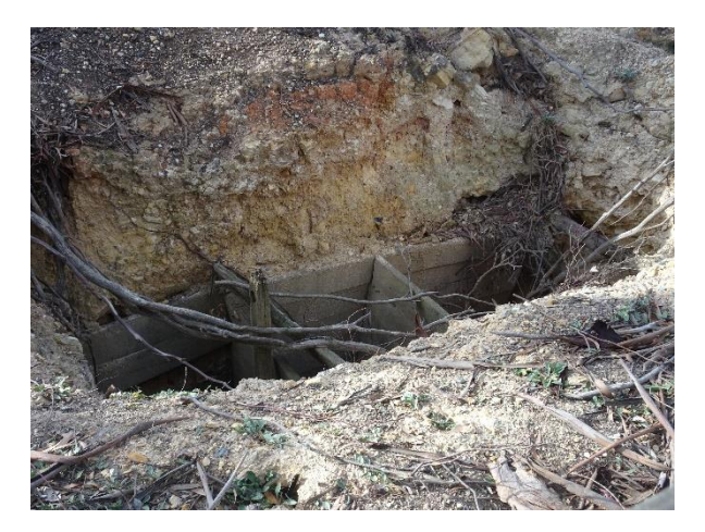
The three compartment shaft retaining extensive timbering