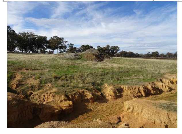
View across the erosion gully below the large dam and towards to mullock heap. On the Petersen property.