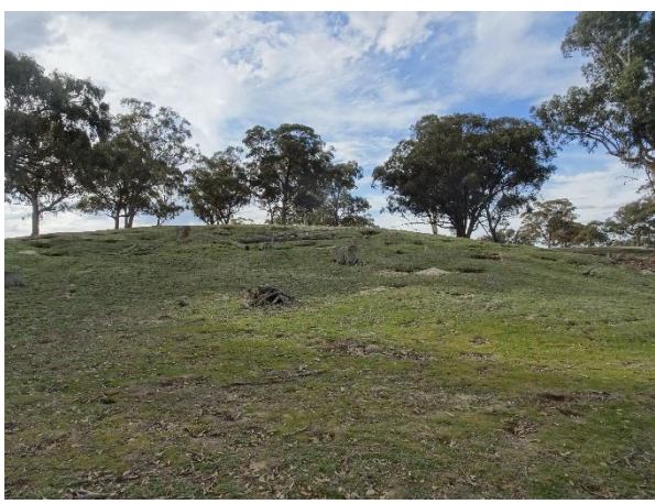
Further detail of the tailings area, showing rabbit warrens into the tailings.