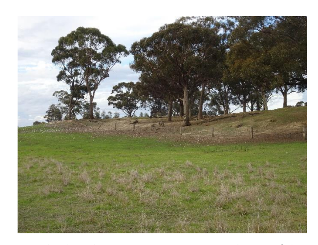
View back to the Denton property towards part of the tailings dump, that is the ungrassed area.

This copied document to be made available for the sole purpose of enabling its consideration and review as part of a planning process under the 7 Planning and Environment Act 1987. The document must not be used for any purpose which may breach any