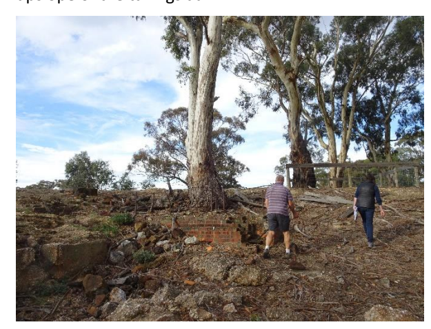
Battery area to the west of the fenced shaft – top right in the image