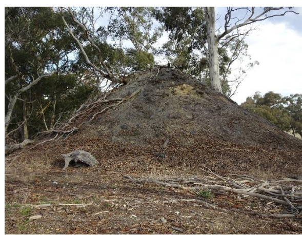
The mullock heap