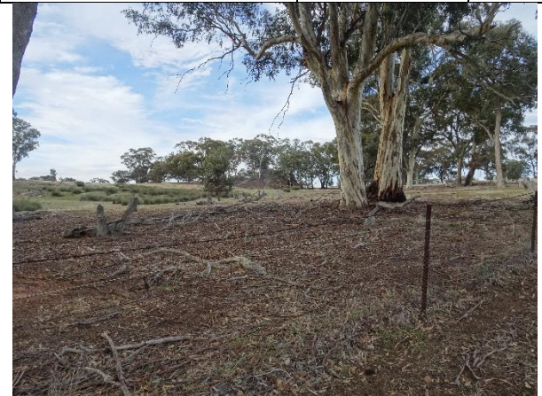
Looking towards the Byrons Reef Co. site from the south at the Petersen property boundary fence, looking into the Denton property. The edge of the tailings dam is visible (rushes) and the mullock heap.