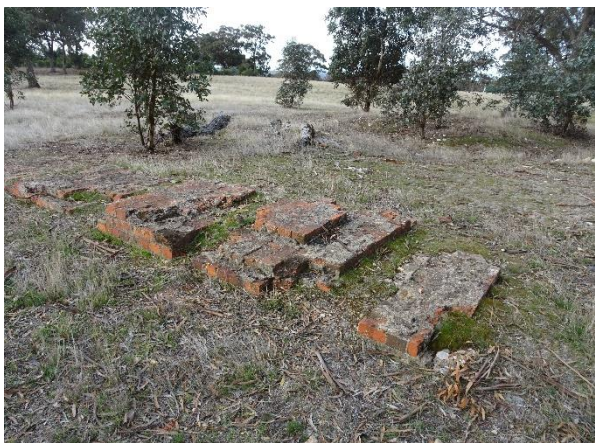
Brick engine bed to the east of the shaft