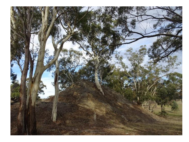
The mullock heap