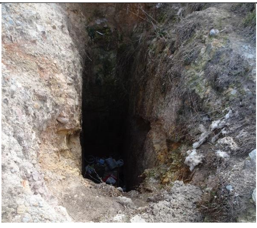
Detail of shaft: appears to be used for disposal of rubbish.