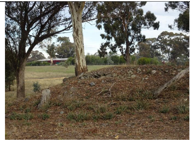
Small mullock heap.