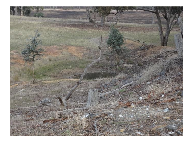
Another small dam.