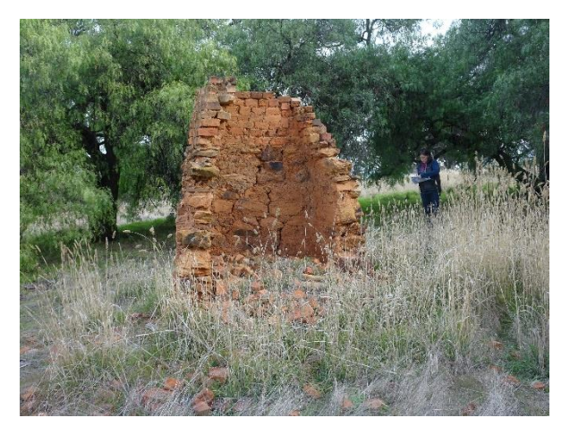
Remants of stone and timber (?) cottage, with random rubble stone chimney, some loose bricks. Enclosed in a 'grove' of preppercorn trees, some in a line suggesting a windbreak planting.