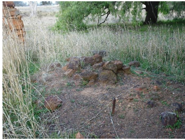
Other features on the cottage site