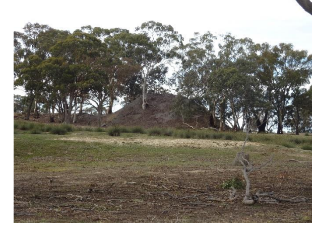
The large mullock heap.