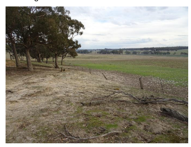
View from the Denton property western boundary fence looking across to the Petersen property. This appears to be the base of the tailings dump that is eroding downslope. The spill of quartze fragments on the Petersen side of the fence appears to be from the eroding tailings dump.