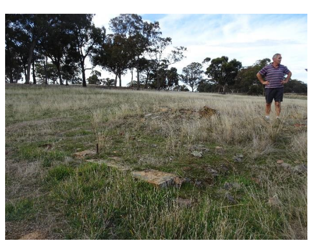
Remnants of brick engine bed.