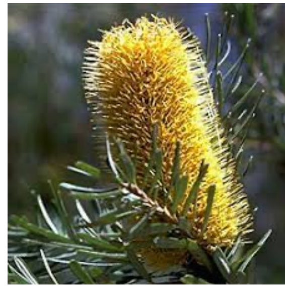
BANKSIA SPINOSA * - SILVER BANKSIA