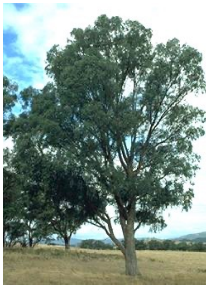
EUCALYPTUS RADIATA * - NARROW LEAVED PEPPERMINT