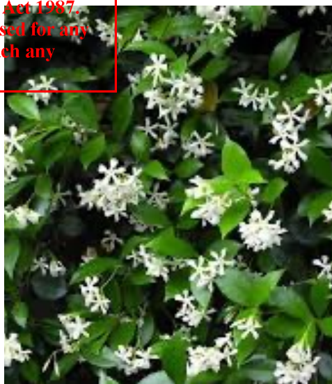
STAR JASMINE #