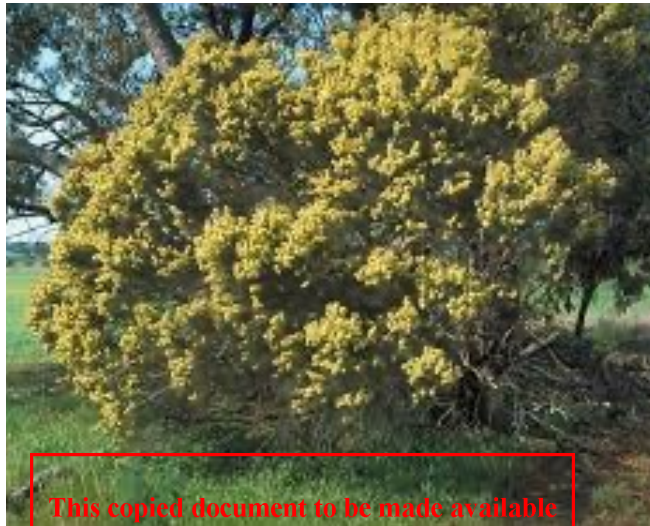
HAKEA NODOSA # YELLOW HAKEA

This copied document to be made available for the sole purpose of enabling part of a planning process under the Planning and Environment Act 1987. The document must not be used for any purpose which may breach any copyright