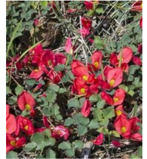
KENNEDIA PROSTRATA *