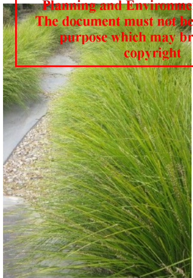
LOMANDRA TANIKA ~