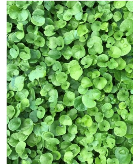
DICHONDRA REPENS *