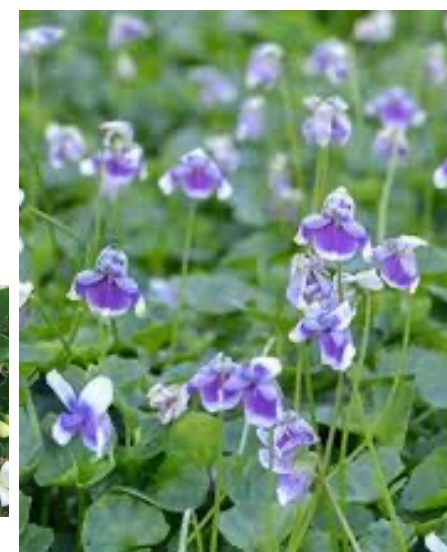
VIOLA HEDERACEA * NATIVE VIOLET