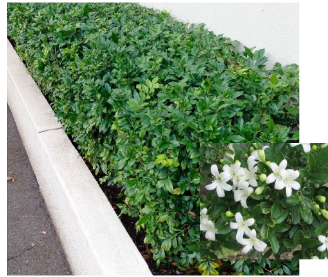
MURRAYA PANICULATA HEDGE *