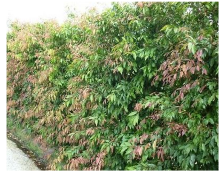
WATERHOUSIA SCREEN HEDGE ~