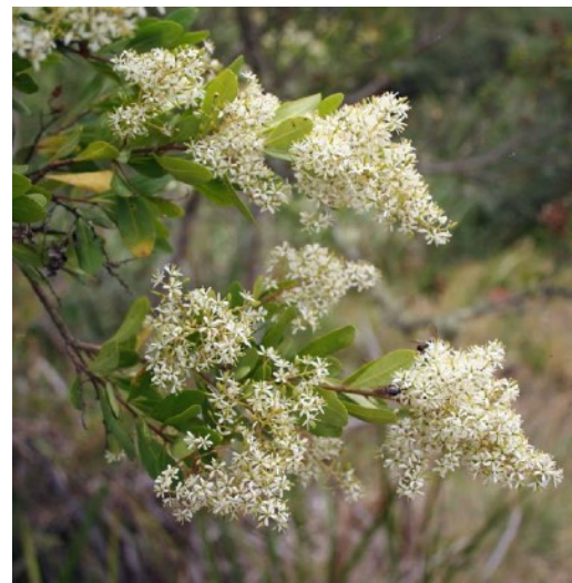
BURSARIA SPINOSA * HOP BUSH