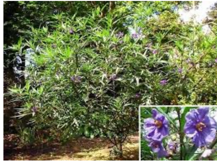
SOLANUM LACINIATUM - KANGAROO APPLE *

This copied document to be made available for the sole purpose of enabling part of a planning process under the Planning and Environment Act 1987. The document must not be used for any purpose which may breach any copyright