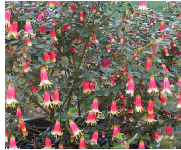
CORREA REFLEXA * ROCK CORREA