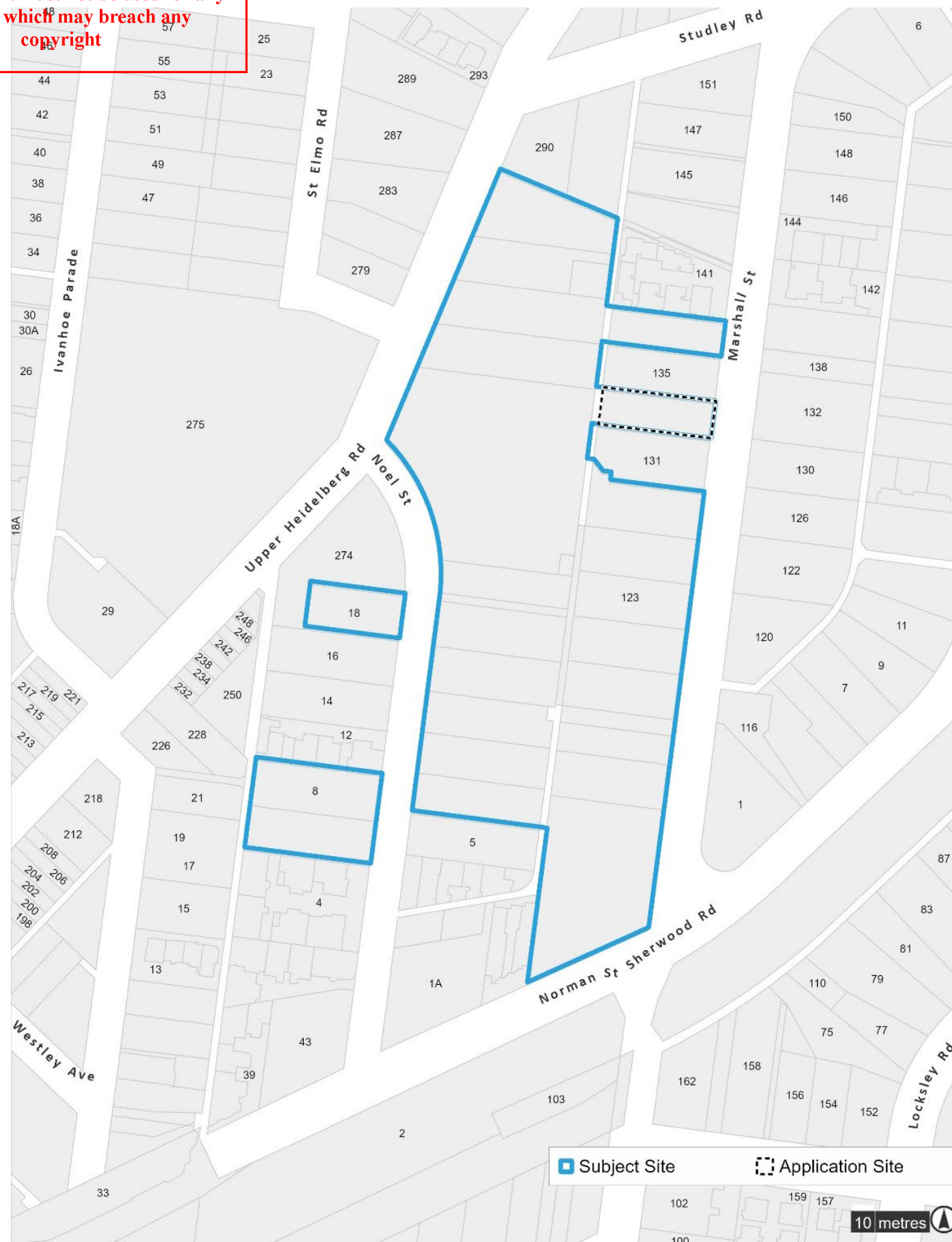
Figure 1 – IGGS Campus