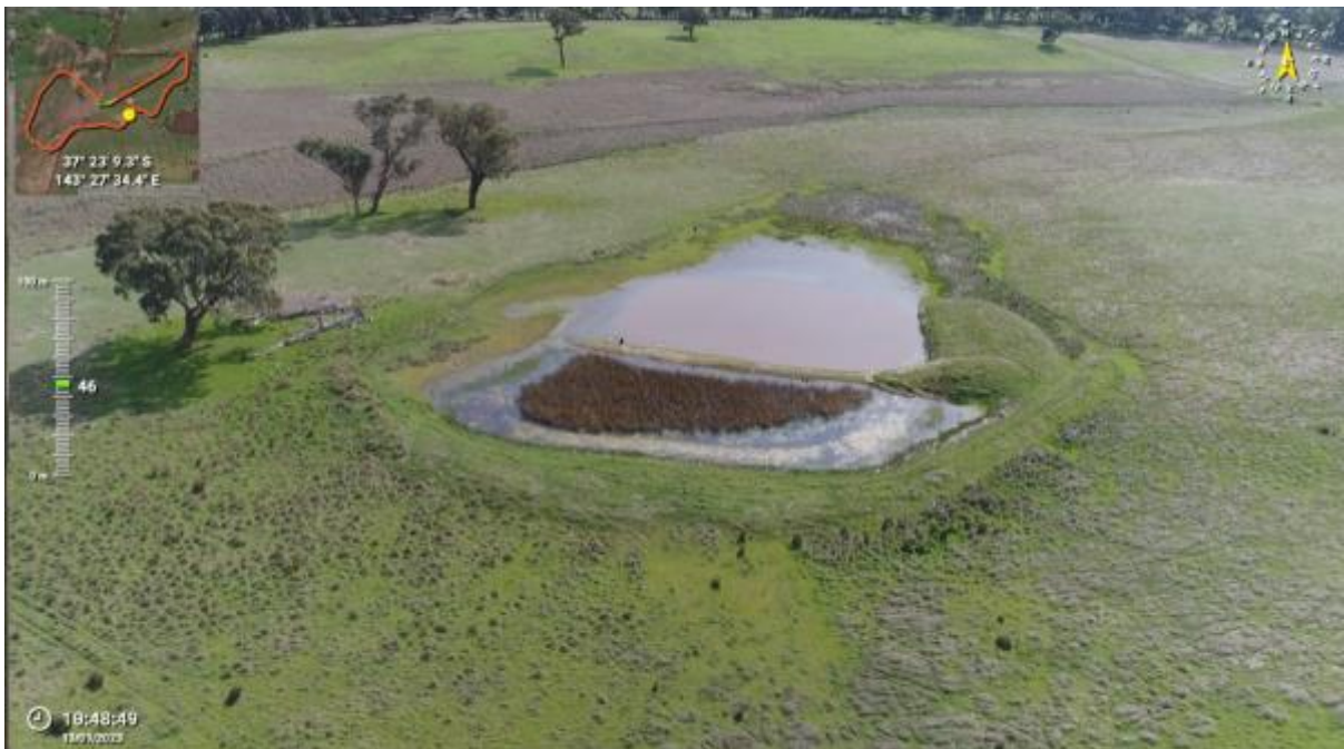
Appendix Plate 10. Waterbody 7; Moderate habitat quality (Ecology and Heritage Partners Pty Ltd 09/2023).

This copied document to be made available for the sole purpose of enabling its consideration and review as part of a planning process under the Planning and Environment Act 1987. The document must not be used for any purpose which may breach any copyright