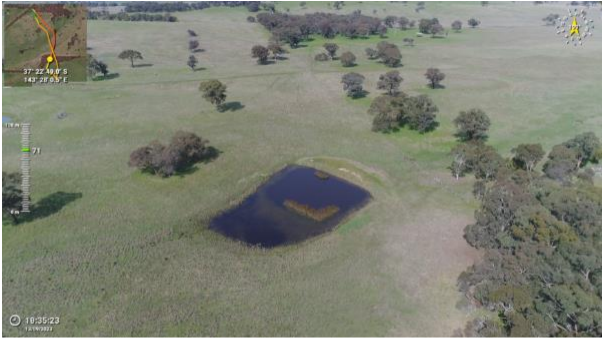
Appendix Plate 15. Waterbody 11; Low habitat quality (Ecology and Heritage Partners Pty Ltd 09/2023).