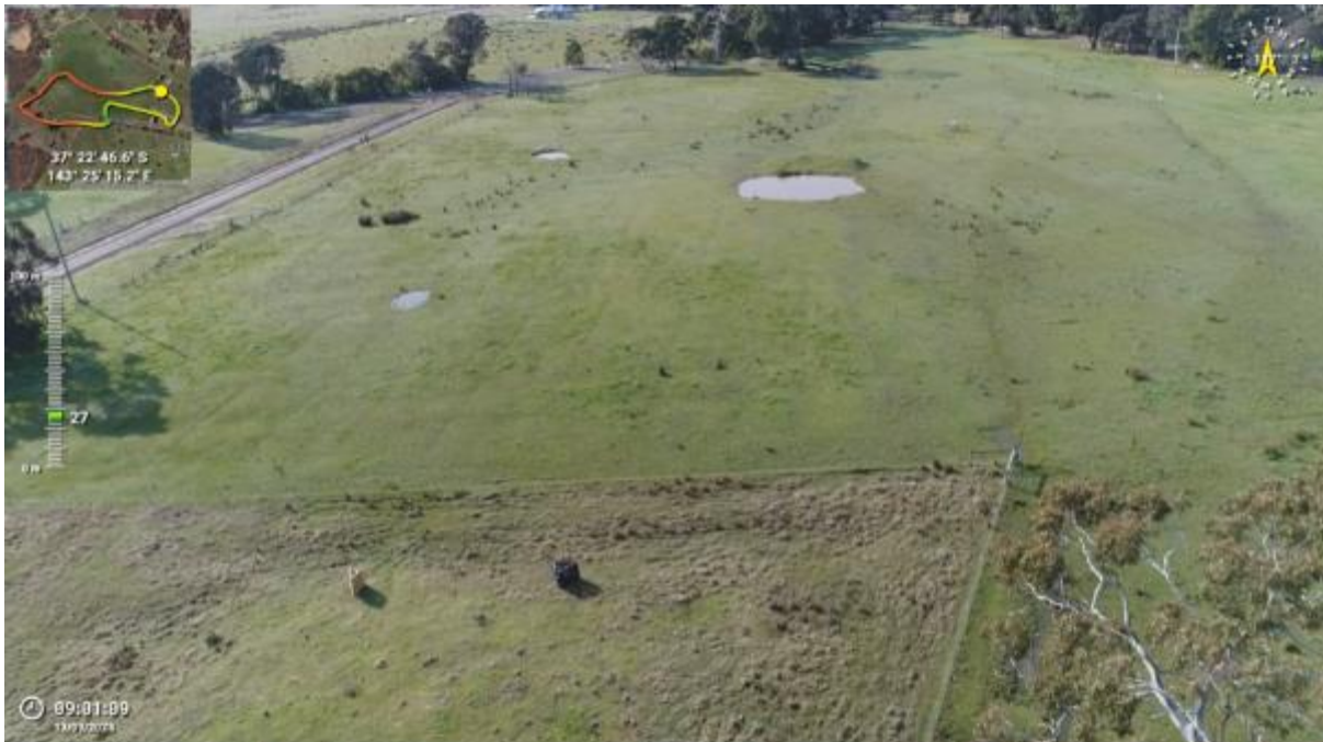
Appendix Plate 30. Waterbody 24; Low habitat quality.

This copied document to be made available for the sole purpose of enabling its consideration and review as part of a planning process under the Planning and Environment Act 1987. The document must not be used for any purpose which may breach any copyright