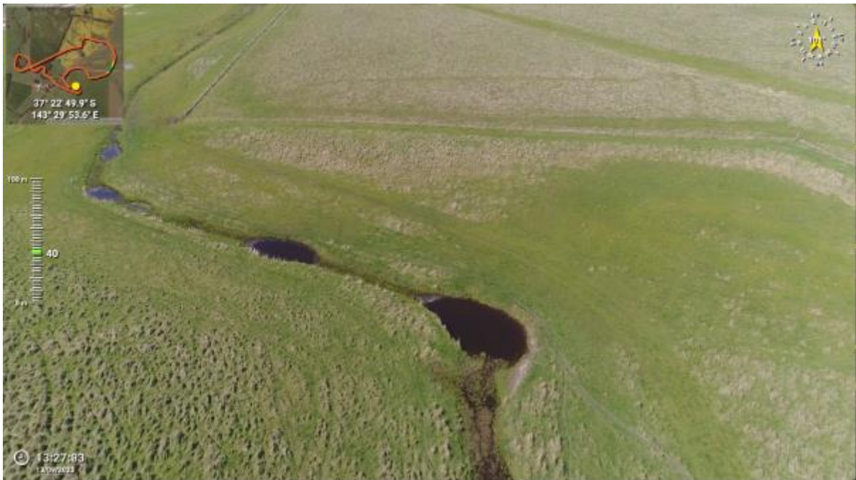
Appendix Plate 86. Waterbody 71; Low habitat quality (Ecology and Heritage Partners Pty Ltd 09/2023).

This copied document to be made available for the sole purpose of enabling its consideration and review as part of a planning process under the Planning and Environment Act 1987. The document must not be used for any purpose which may breach any copyright