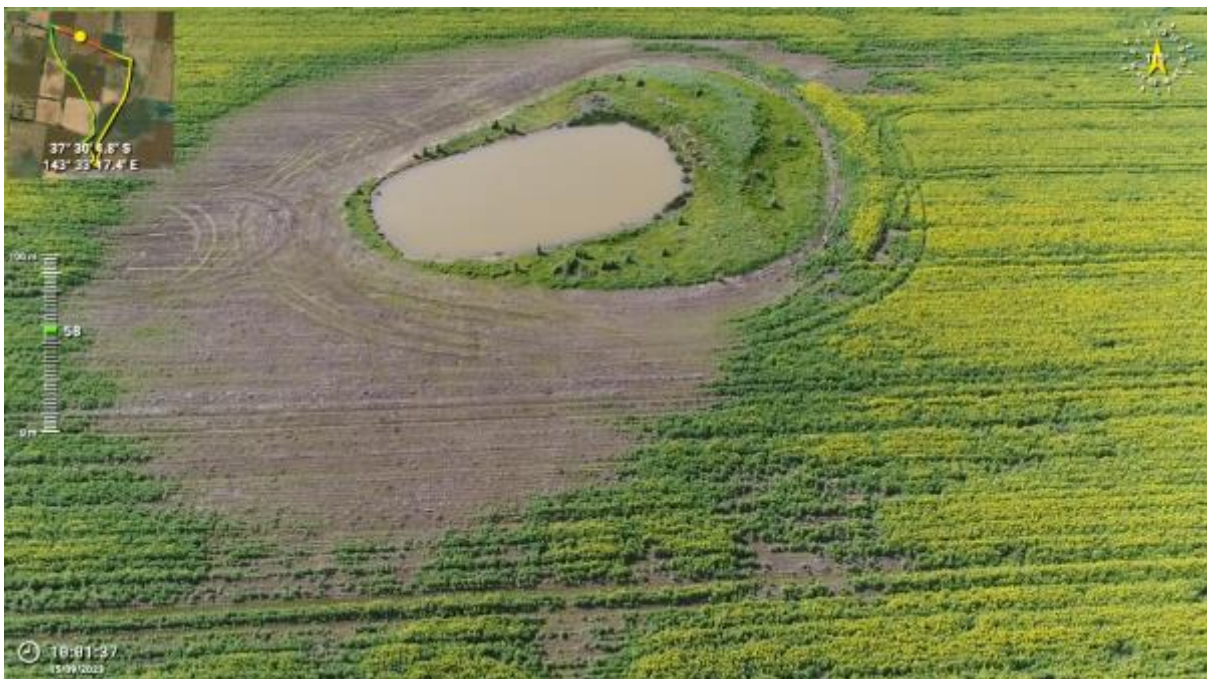
Appendix Plate 258. Waterbody 231; Low habitat quality (Ecology and Heritage Partners Pty Ltd 09/2023).

This copied document to be made available for the sole purpose of enabling its consideration and review as part of a planning process under the Planning and Environment Act 1987. The document must not be used for any purpose which may breach any copyright