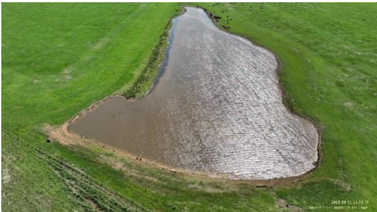
Appendix Plate 254. Waterbody 228; Low habitat quality (Ecology and Heritage Partners Pty Ltd 09/2023).

This copied document to be made available for the sole purpose of enabling its consideration and review as part of a planning process under the Planning and Environment Act 1987. The document must not be used for any purpose which may breach any copyright