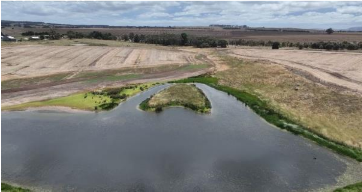
Appendix Plate 285. Waterbody 254; High habitat quality (Ecology and Heritage Partners Pty Ltd 09/2023).