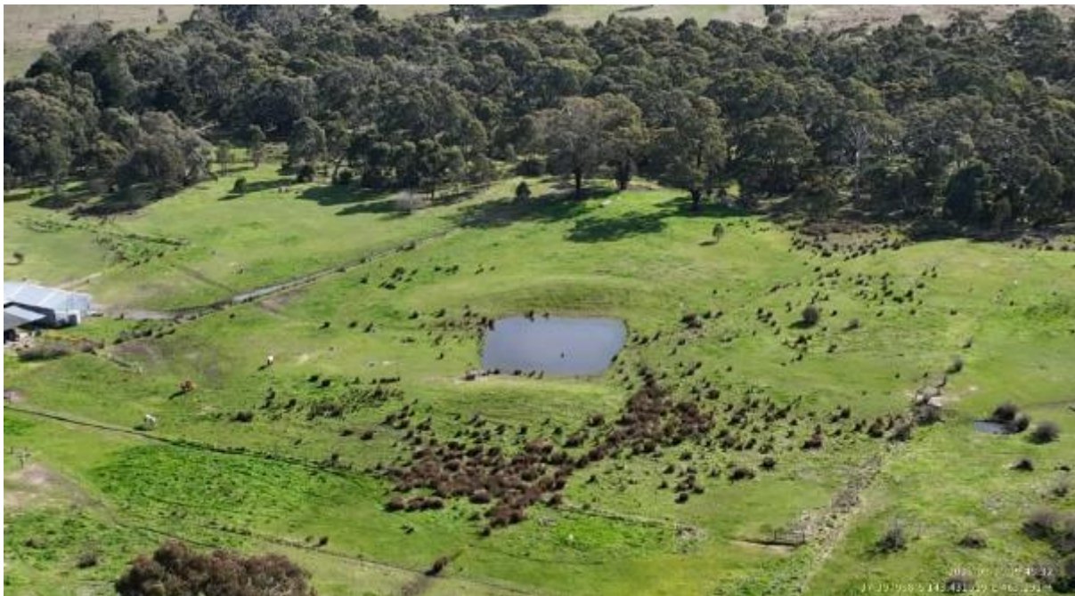
Appendix Plate 60. Waterbody 49; Low habitat quality (Ecology and Heritage Partners Pty Ltd 09/2023).

This copied document to be made available for the sole purpose of enabling its consideration and review as part of a planning process under the Planning and Environment Act 1987. The document must not be used for any purpose which may breach any copyright