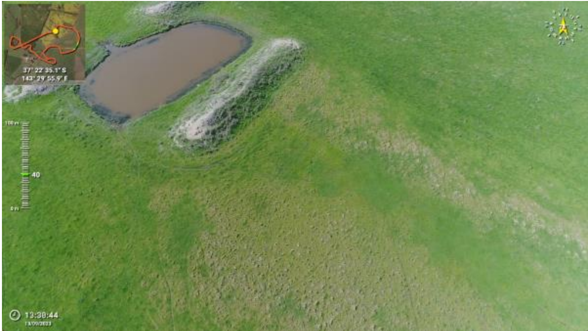
Appendix Plate 87. Waterbody 72; Low habitat quality (Ecology and Heritage Partners Pty Ltd 09/2023).