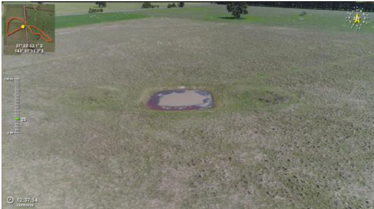
Appendix Plate 115. Waterbody 98; Low habitat quality.