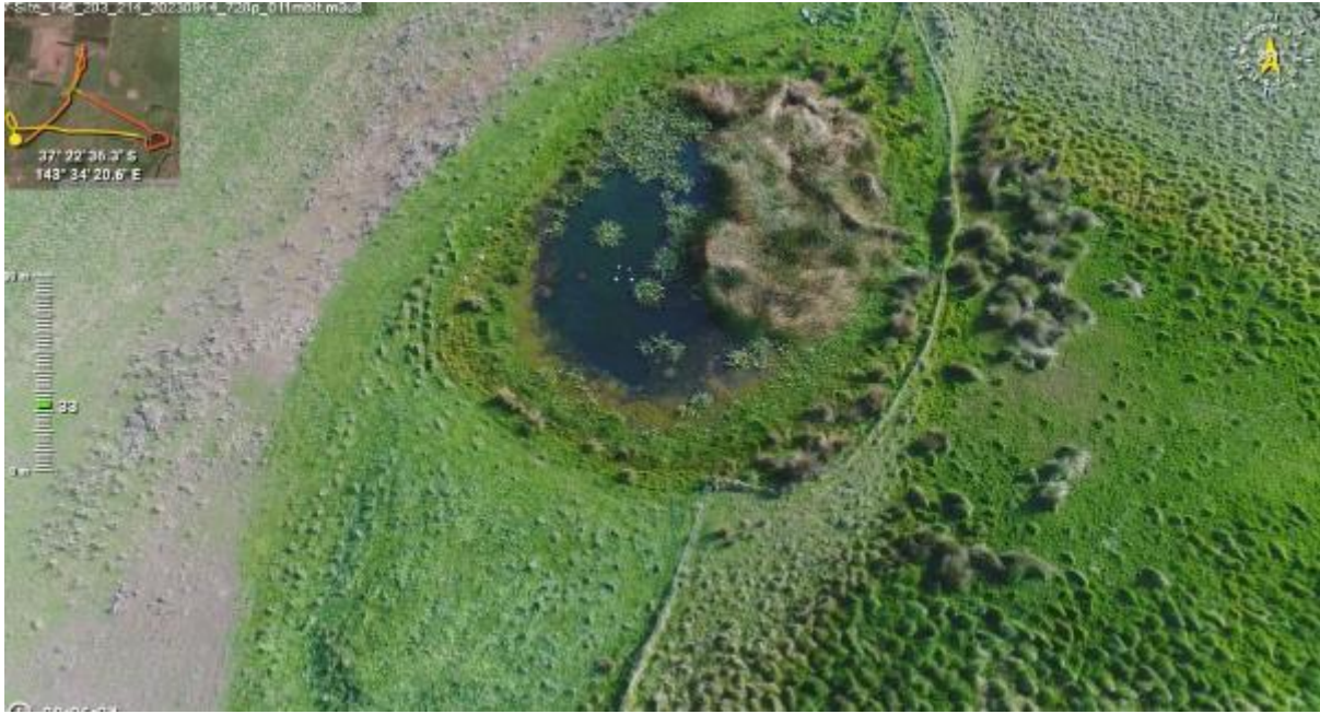
Appendix Plate 227. Waterbody 203; Moderate habitat quality (Ecology and Heritage Partners Pty Ltd 09/2023).