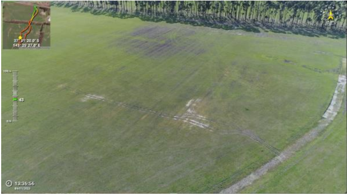
Appendix Plate 323. Waterbody 283; Low habitat quality (Ecology and Heritage Partners Pty Ltd 09/2023).