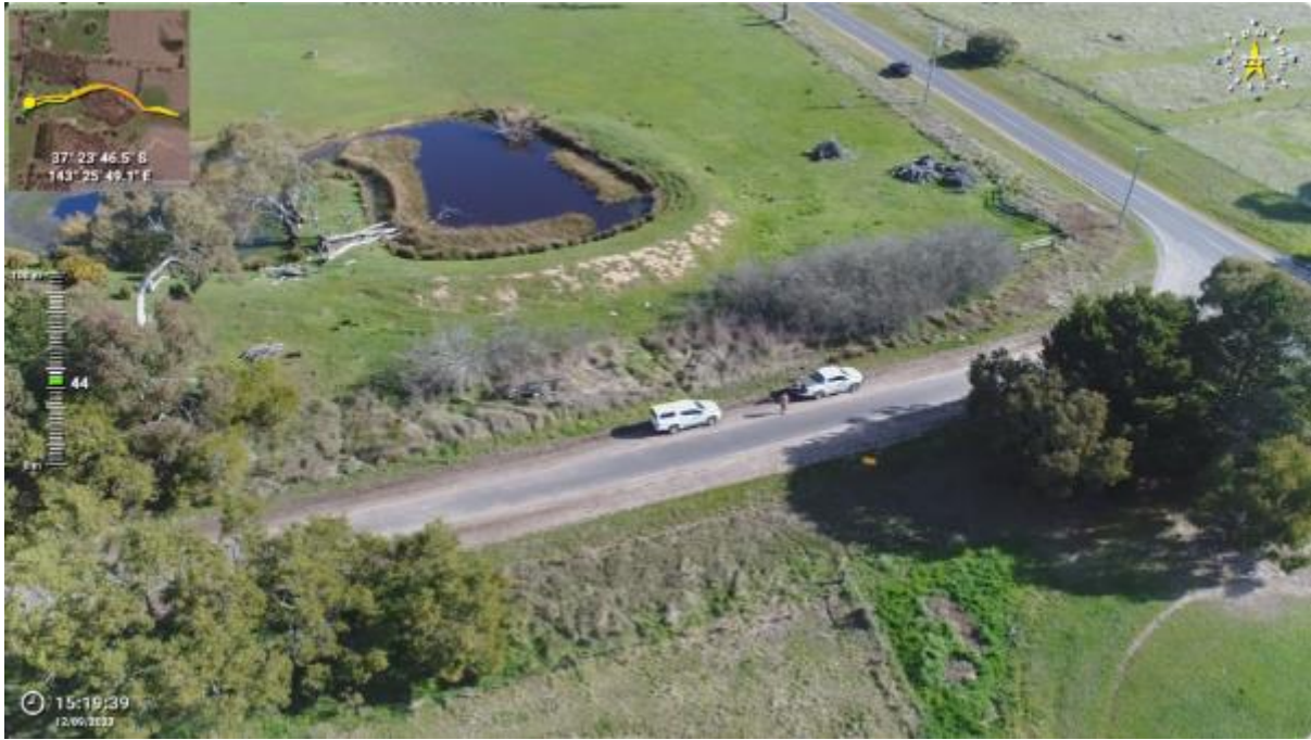
Appendix Plate 43. Waterbody 34; Moderate habitat quality (Ecology and Heritage Partners Pty Ltd 09/2023).