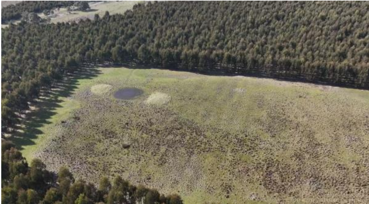
Appendix Plate 59. Waterbody 48; Low habitat quality (Ecology and Heritage Partners Pty Ltd 09/2023).