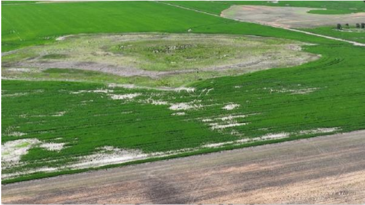
Appendix Plate 141. Waterbody 121; High habitat quality.