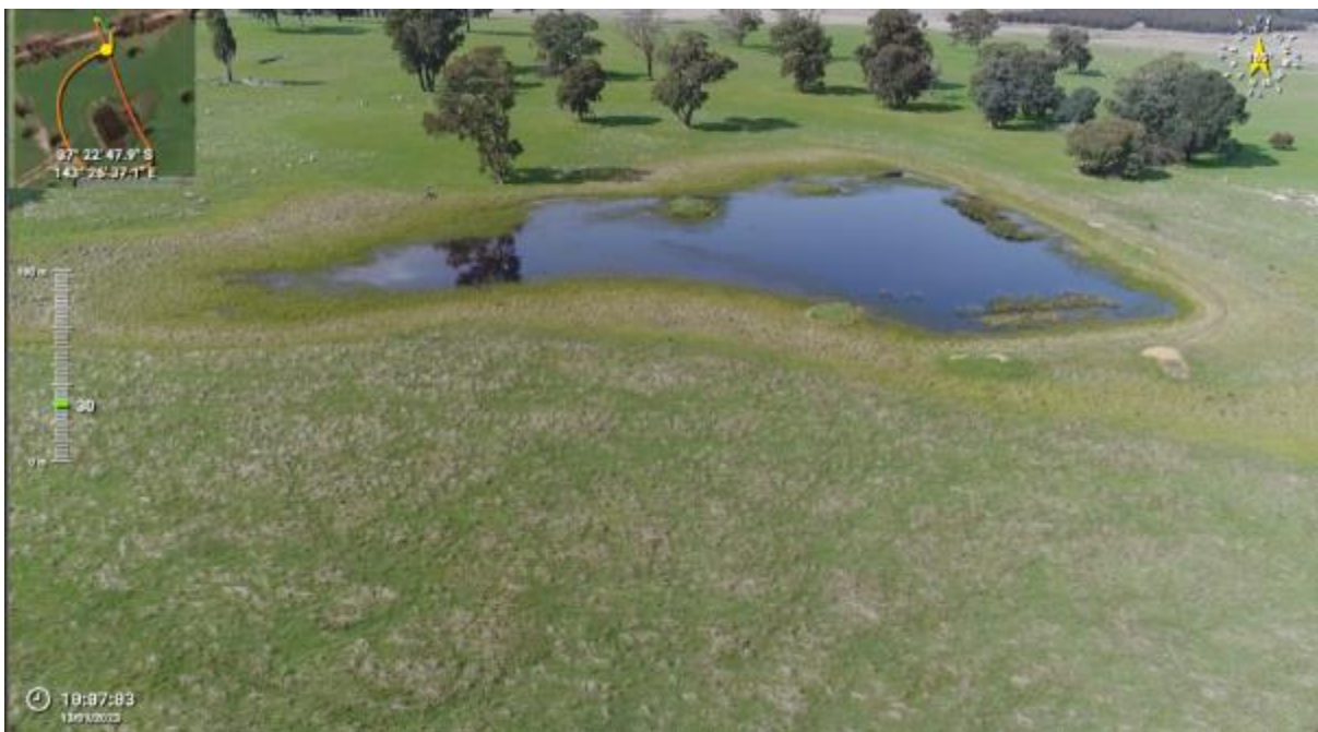
Appendix Plate 22. Waterbody 17; Moderate habitat quality (Ecology and Heritage Partners Pty Ltd 09/2023).

This copied document to be made available for the sole purpose of enabling its consideration and review as part of a planning process under the Planning and Environment Act 1987. The document must not be used for any purpose which may breach any copyright