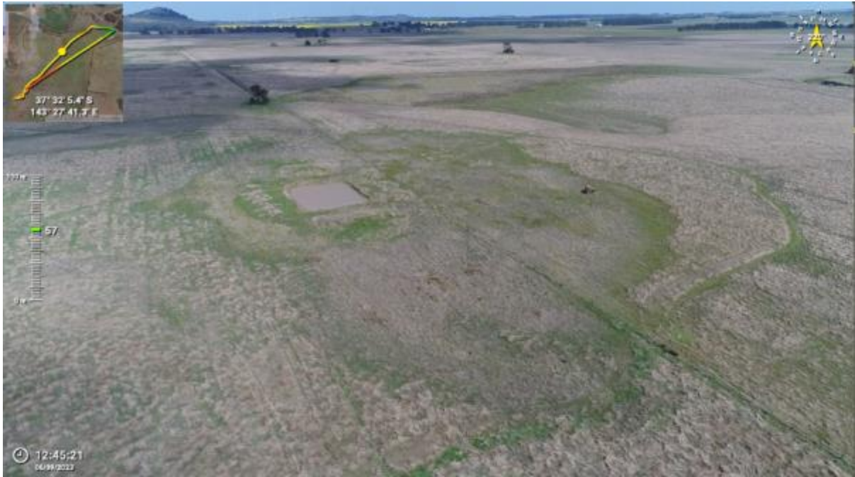
Appendix Plate 307. Waterbody 270; Low habitat quality (Ecology and Heritage Partners Pty Ltd 09/2023).