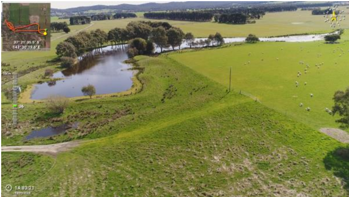
Appendix Plate 94. Waterbody 79; Moderate habitat quality.

This copied document to be made available for the sole purpose of enabling its consideration and review as part of a planning process under the Planning and Environment Act 1987. The document must not be used for any purpose which may breach any copyright