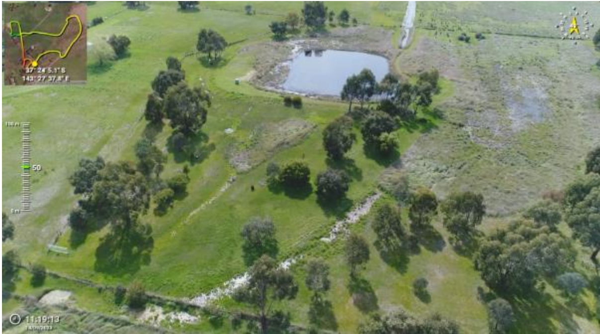
Appendix Plate 79. Waterbody 65; Low habitat quality (Ecology and Heritage Partners Pty Ltd 09/2023).