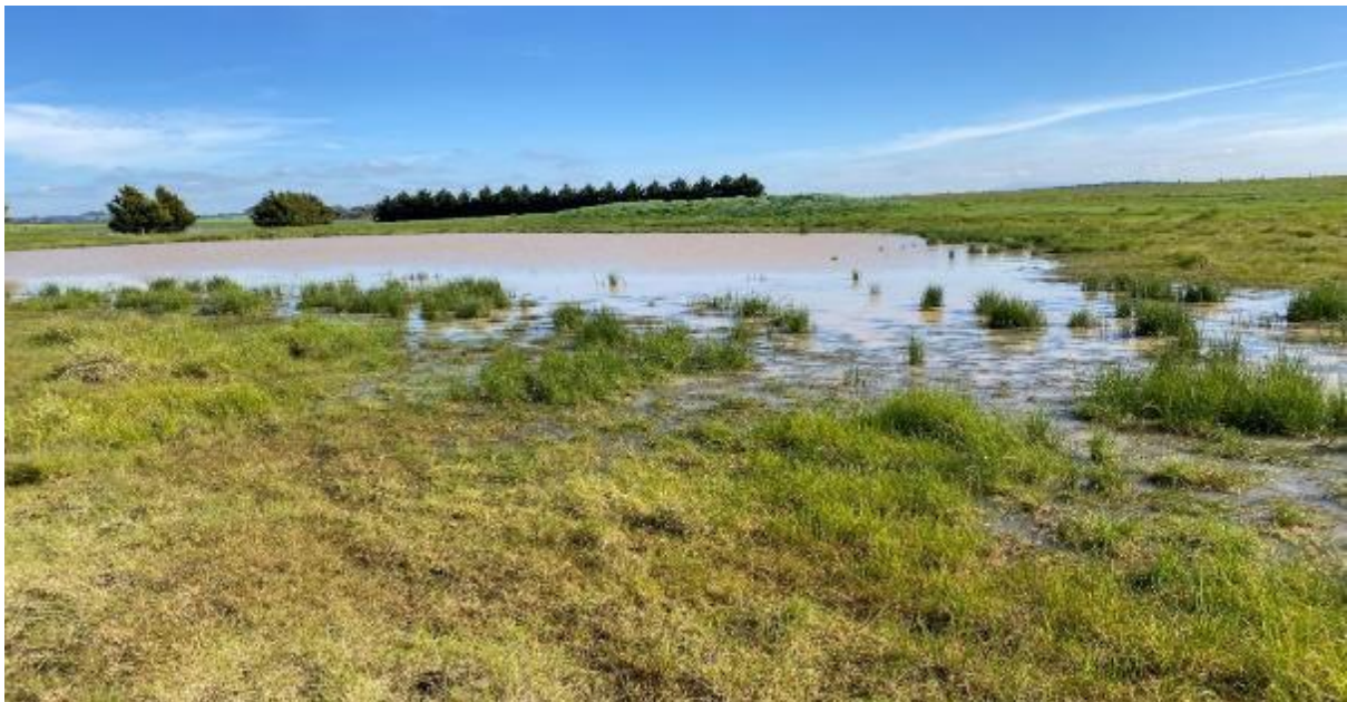
Appendix Plate 340. Waterbody 298; Moderate habitat quality (Ecology and Heritage Partners Pty Ltd 09/2023).