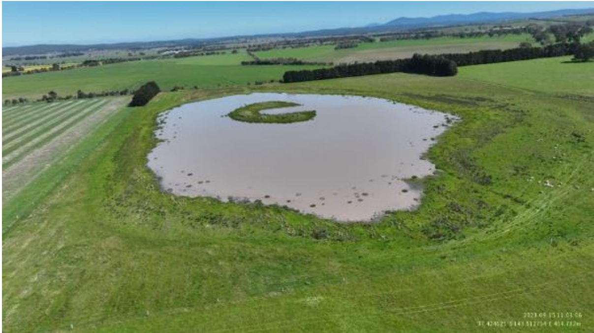
Appendix Plate 291. Waterbody 258; Moderate habitat quality (Ecology and Heritage Partners Pty Ltd 09/2023).