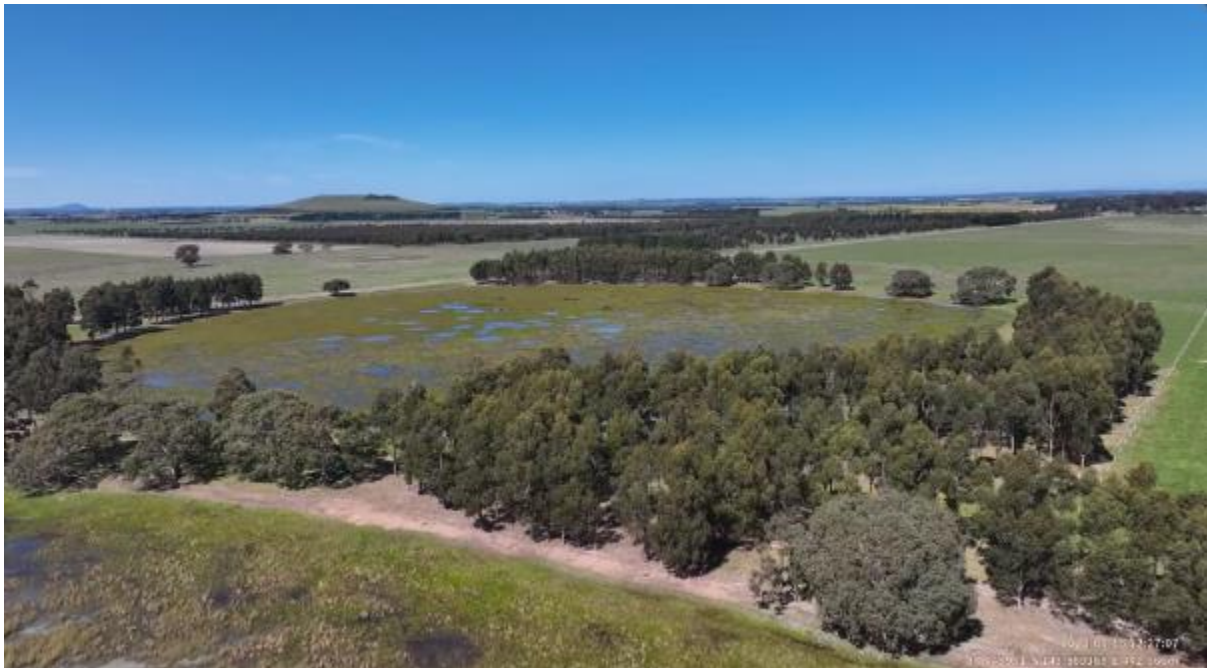
Appendix Plate 288. Waterbody 256; High habitat quality (Ecology and Heritage Partners Pty Ltd 09/2023).

This copied document to be made available for the sole purpose of enabling its consideration and review as part of a planning process under the Planning and Environment Act 1987. The document must not be used for any purpose which may breach any copyright