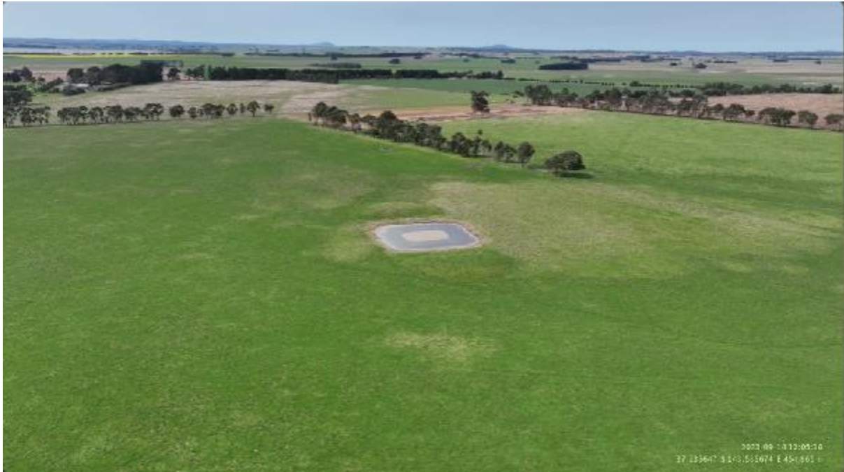
Appendix Plate 209. Waterbody 185; Low habitat quality (Ecology and Heritage Partners Pty Ltd 09/2023).