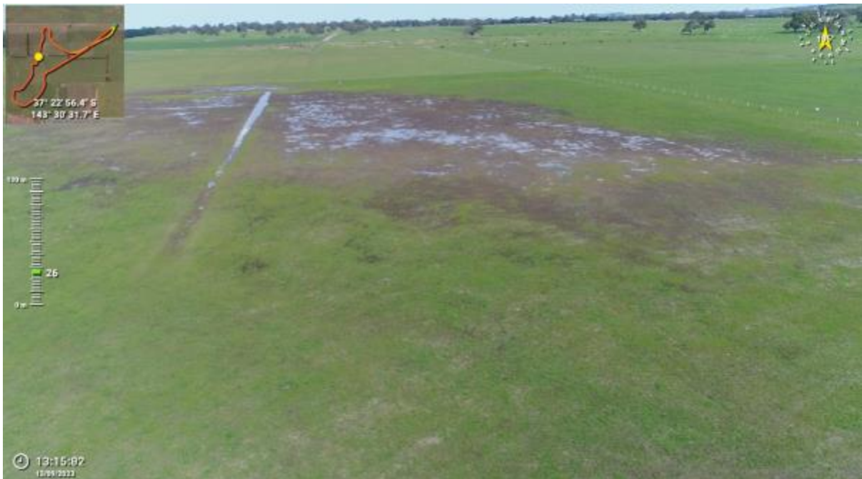
Appendix Plate 112. Waterbody 95; Low habitat quality (Ecology and Heritage Partners Pty Ltd 09/2023).

This copied document to be made available for the sole purpose of enabling its consideration and review as part of a planning process under the Planning and Environment Act 1987. The document must not be used for any purpose which may breach any copyright