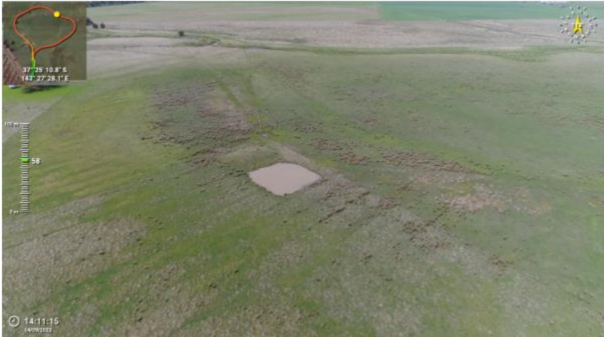
Appendix Plate 129. Waterbody 111; Low habitat quality (Ecology and Heritage Partners Pty Ltd 09/2023).