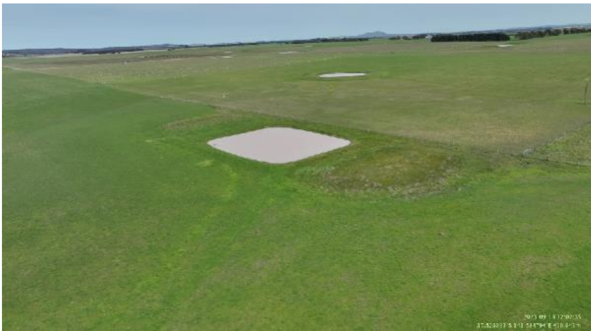
Appendix Plate 268. Waterbody 239; Low habitat quality (Ecology and Heritage Partners Pty Ltd 09/2023).

This copied document to be made available for the sole purpose of enabling its consideration and review as part of a planning process under the Planning and Environment Act 1987. The document must not be used for any purpose which may breach any copyright