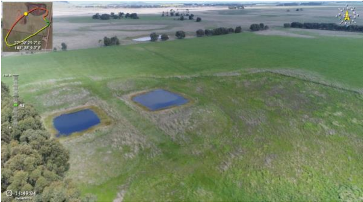
Appendix Plate 251. Waterbody 225; Low habitat quality (Ecology and Heritage Partners Pty Ltd 09/2023).