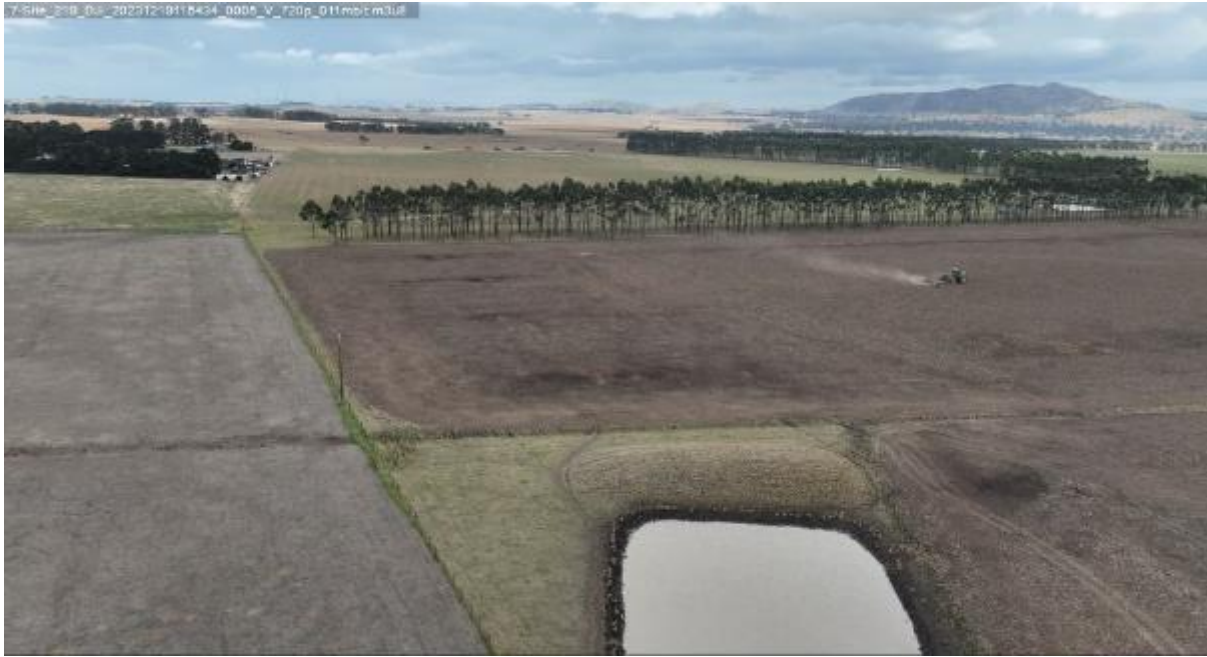
Appendix Plate 245. Waterbody 219; Low habitat quality (Ecology and Heritage Partners Pty Ltd 12/2023).