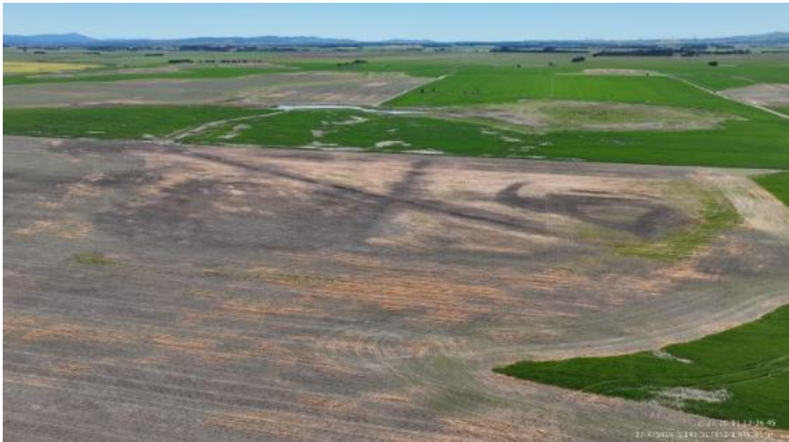
Appendix Plate 140. Waterbody 120; High habitat quality (Ecology and Heritage Partners Pty Ltd 09/2023).

This copied document to be made available for the sole purpose of enabling its consideration and review as part of a planning process under the Planning and Environment Act 1987. The document must not be used for any purpose which may breach any copyright