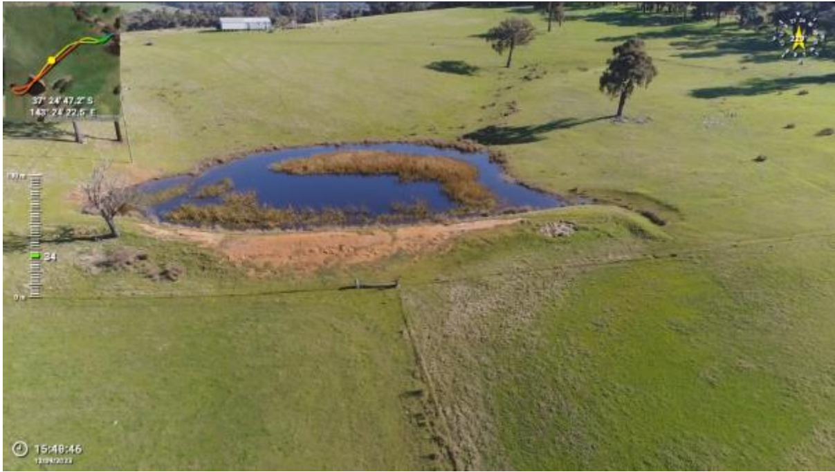
Appendix Plate 49. Waterbody 38; Moderate habitat quality (Ecology and Heritage Partners Pty Ltd 09/2023).