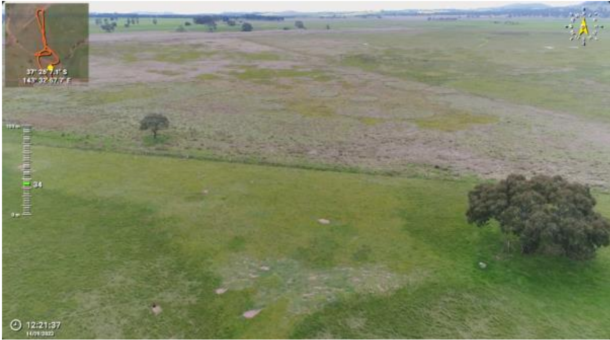
Appendix Plate 155. Waterbody 134; Low habitat quality (Ecology and Heritage Partners Pty Ltd 09/2023).