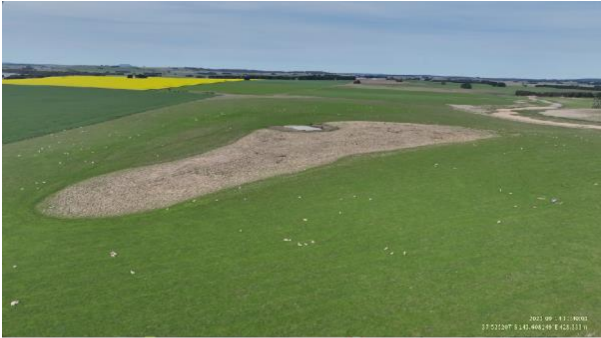
Appendix Plate 315. Waterbody 276; Low habitat quality (Ecology and Heritage Partners Pty Ltd 09/2023).