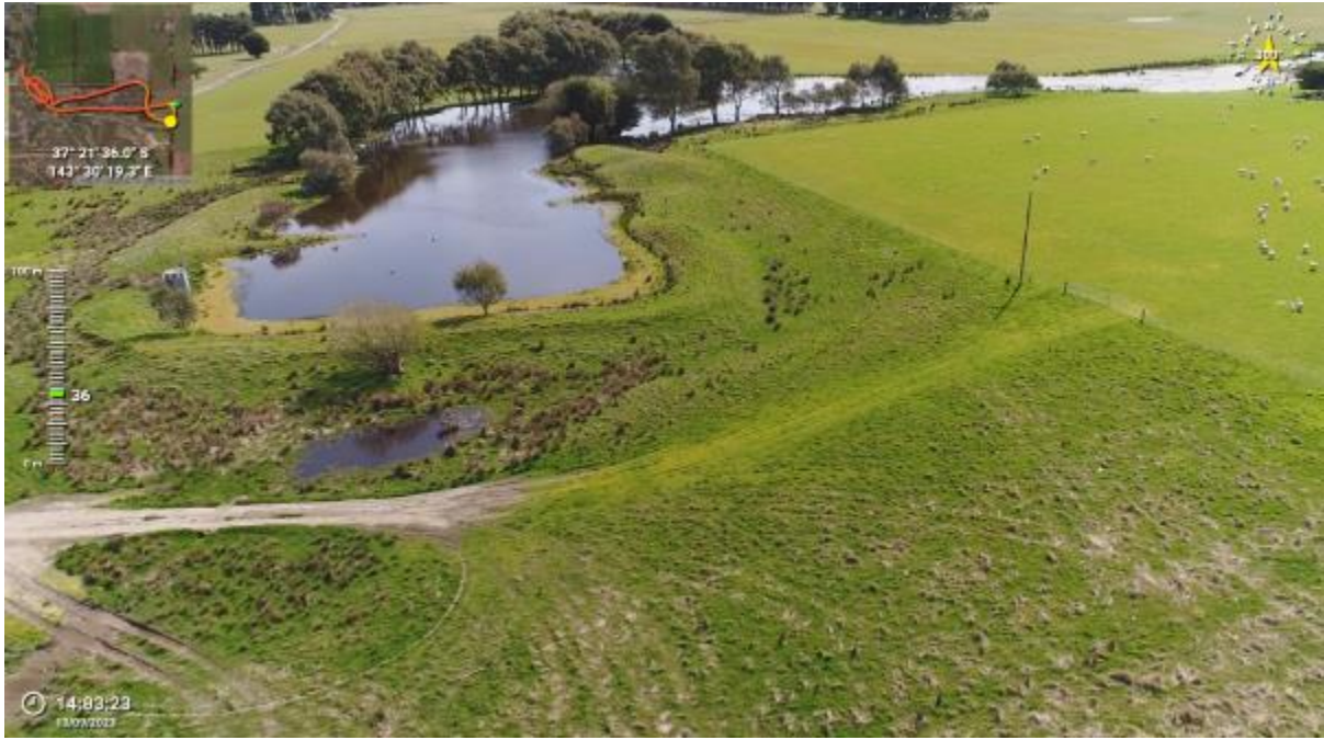
Appendix Plate 281. Waterbody 250; Moderate habitat quality (Ecology and Heritage Partners Pty Ltd 09/2023).