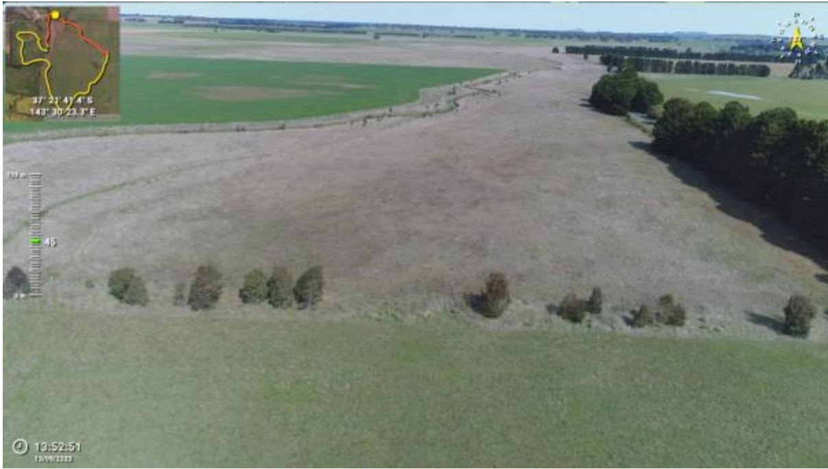
Appendix Plate 93. Waterbody 78; Low habitat quality (Ecology and Heritage Partners Pty Ltd 09/2023).