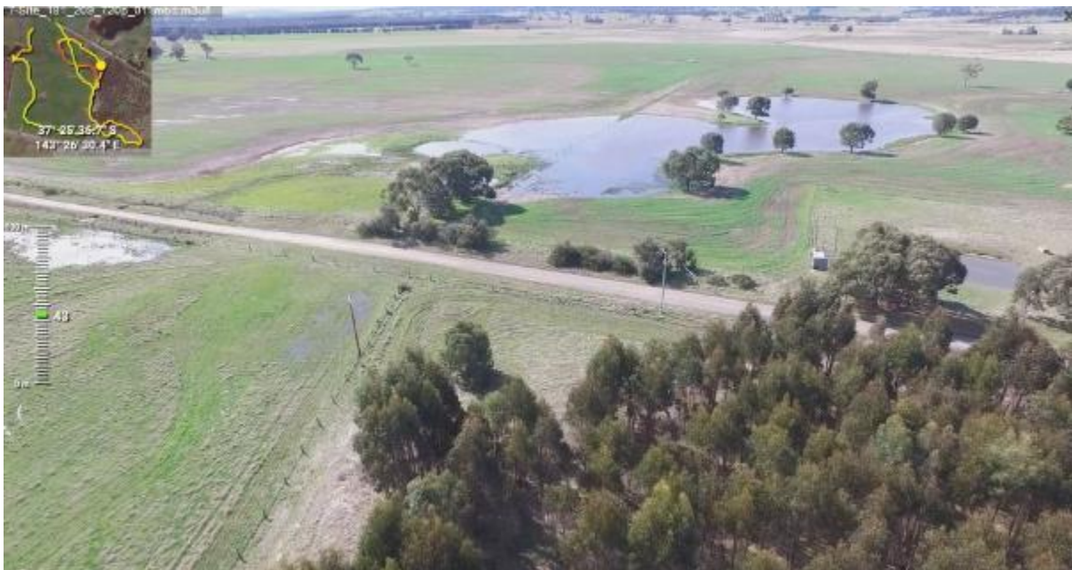
Appendix Plate 234. Waterbody 209; Moderate habitat quality (Ecology and Heritage Partners Pty Ltd 09/2023).