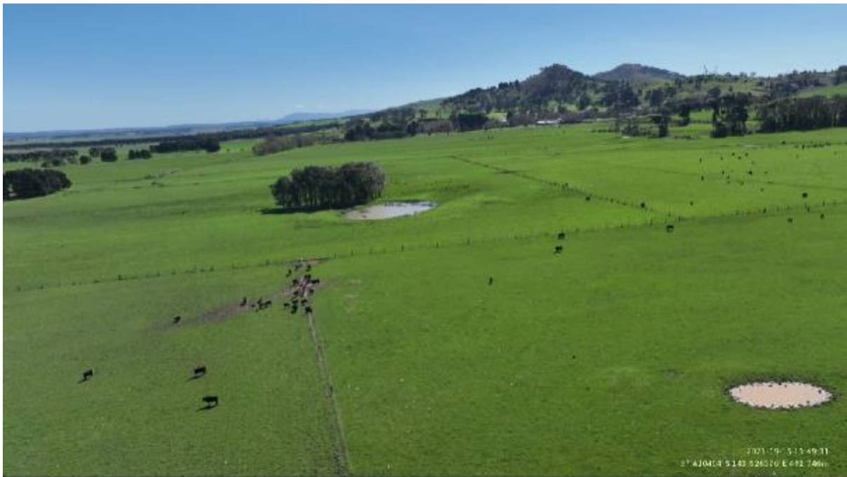
Appendix Plate 228. Waterbody 204; Low habitat quality.

This copied document to be made available for the sole purpose of enabling its consideration and review as part of a planning process under the Planning and Environment Act 1987. The document must not be used for any purpose which may breach any copyright