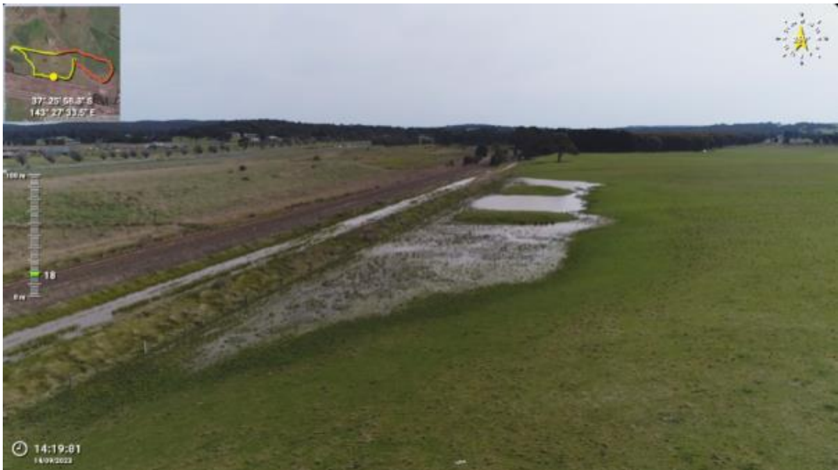
Appendix Plate 130. Waterbody 112; Low habitat quality.

This copied document to be made available for the sole purpose of enabling its consideration and review as part of a planning process under the Planning and Environment Act 1987. The document must not be used for any purpose which may breach any copyright