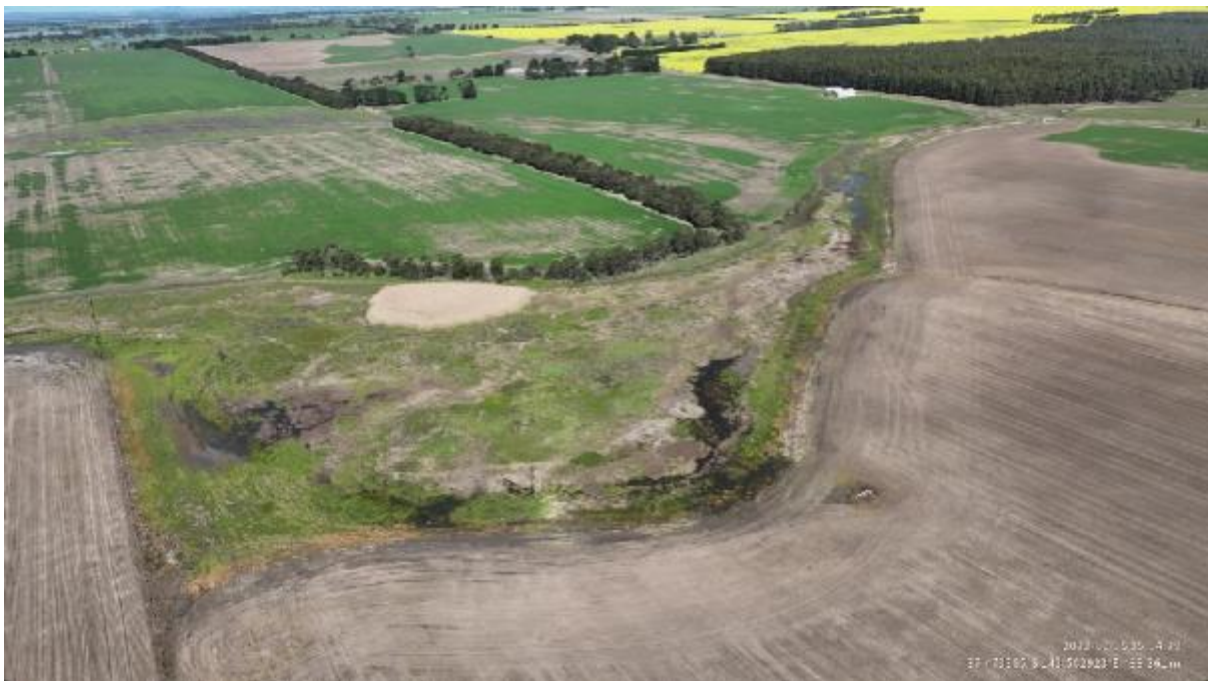
Appendix Plate 142. Waterbody 122; Low habitat quality.

This copied document to be made available for the sole purpose of enabling its consideration and review as part of a planning process under the Planning and Environment Act 1987. The document must not be used for any purpose which may breach any copyright