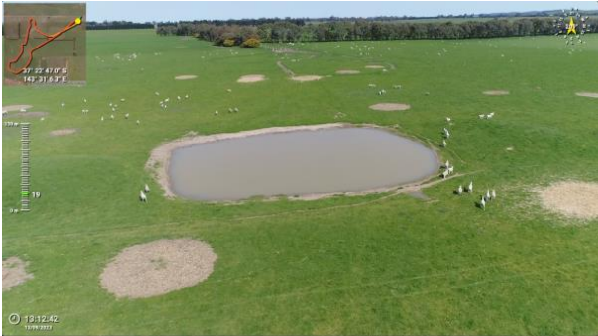
Appendix Plate 109. Waterbody 93; Low habitat quality (Ecology and Heritage Partners Pty Ltd 09/2023).