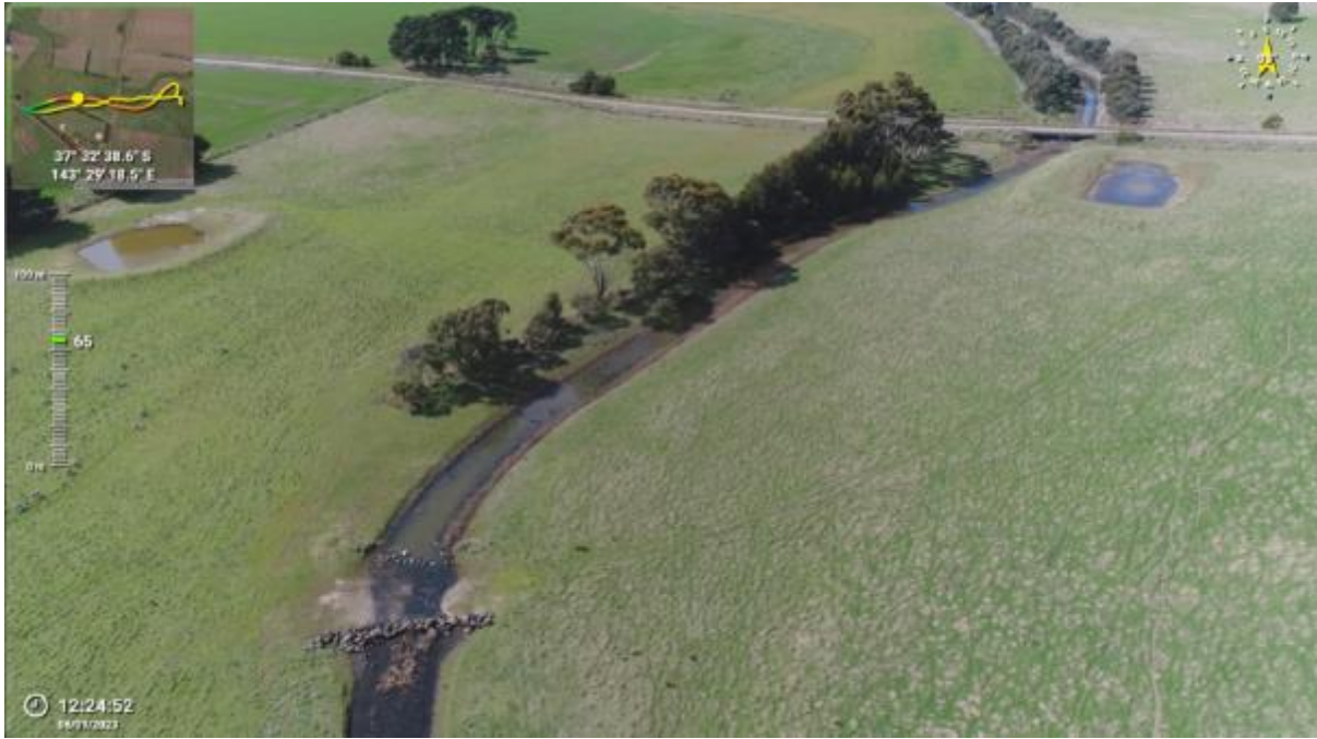
Appendix Plate 231. Waterbody 207; Low habitat quality.