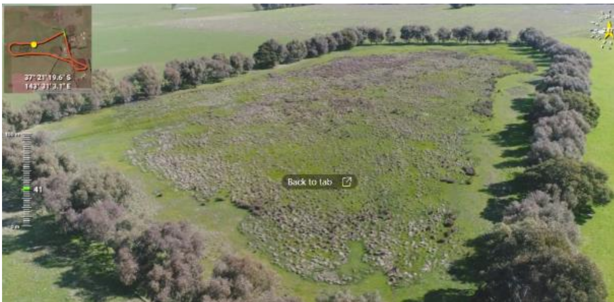
Appendix Plate 96. Waterbody 81; Low habitat quality.

This copied document to be made available for the sole purpose of enabling its consideration and review as part of a planning process under the Planning and Environment Act 1987. The document must not be used for any purpose which may breach any copyright