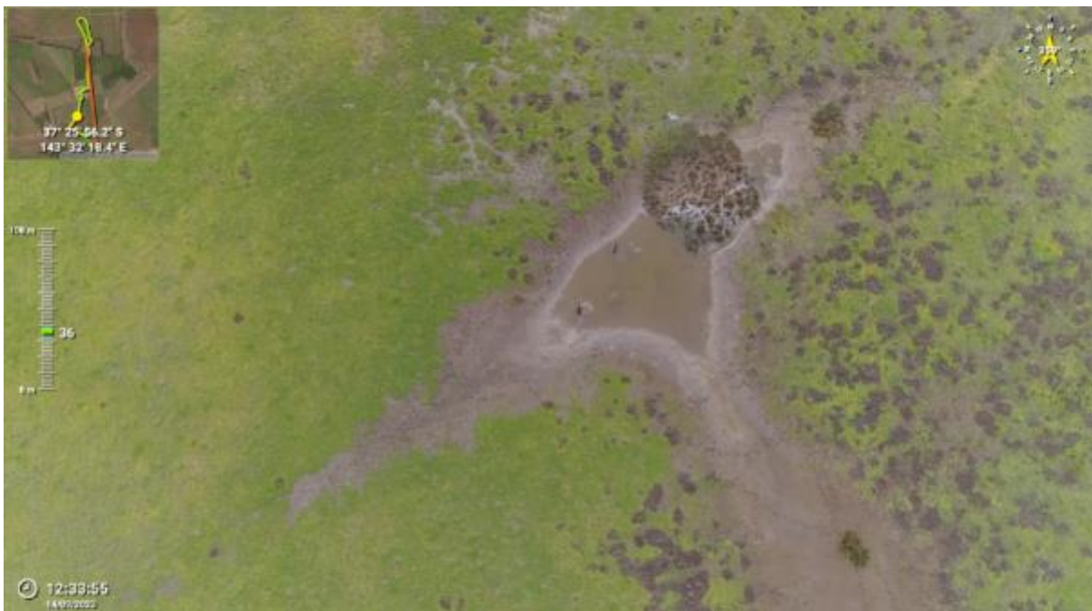
Appendix Plate 226. Waterbody 202; Moderate habitat quality.