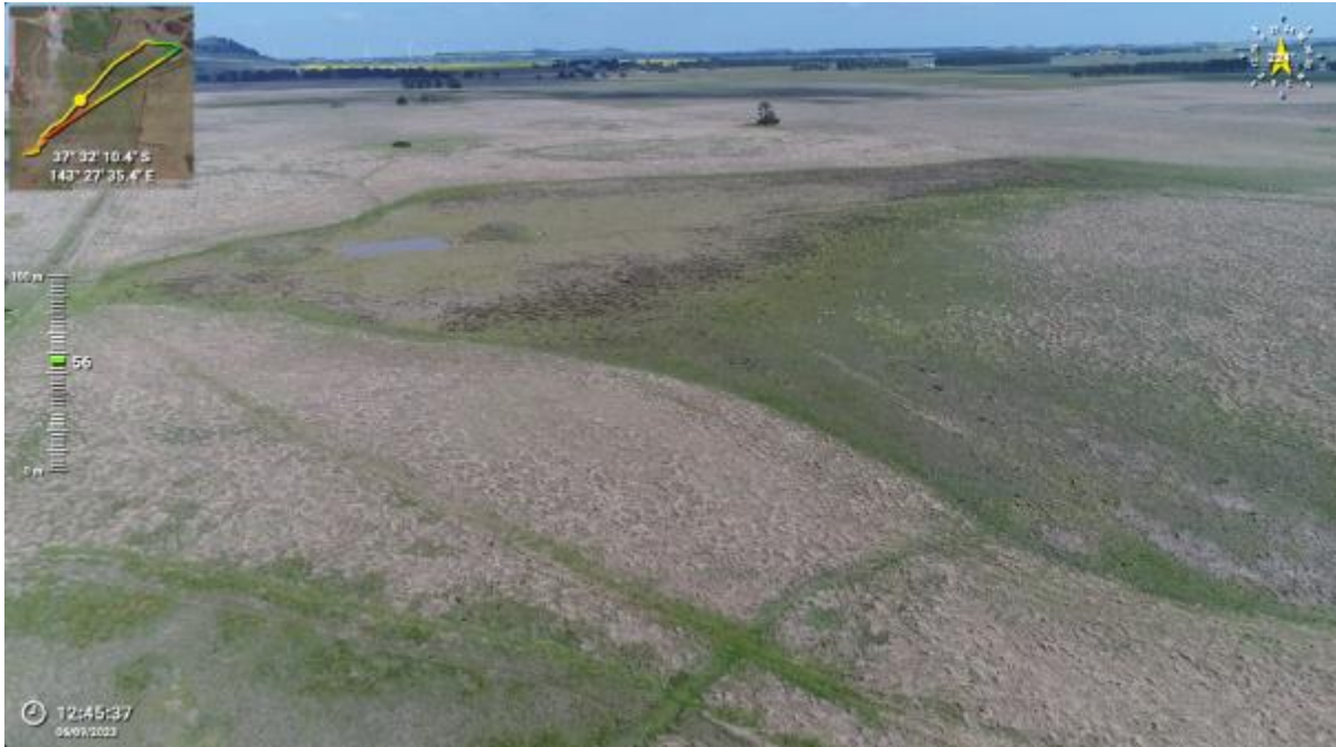
Appendix Plate 193. Waterbody 168; Moderate habitat quality (Ecology and Heritage Partners Pty Ltd 09/2023).