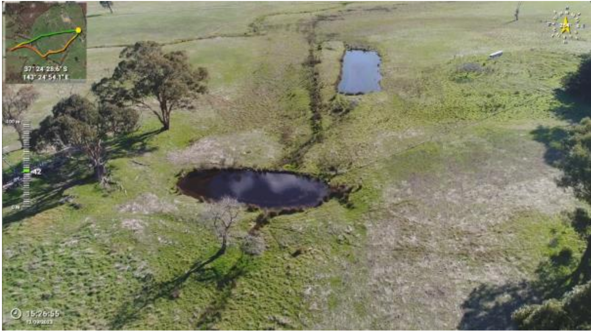
Appendix Plate 51. Waterbody 41; Low habitat quality.