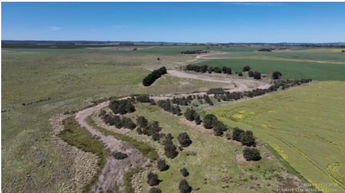
Appendix Plate 278. Waterbody 247; Low habitat quality (Ecology and Heritage Partners Pty Ltd 09/2023).

This copied document to be made available for the sole purpose of enabling its consideration and review as part of a planning process under the Planning and Environment Act 1987. The document must not be used for any purpose which may breach any copyright