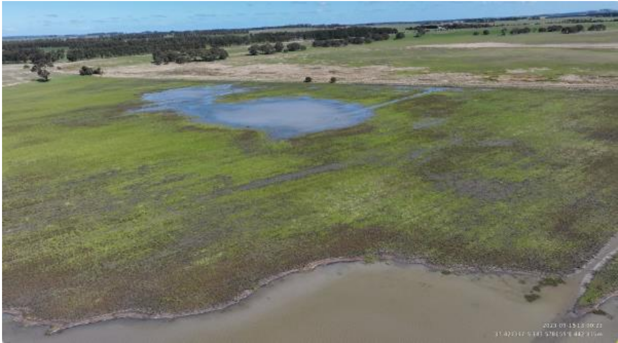
Appendix Plate 149. Waterbody 130; Moderate habitat quality.