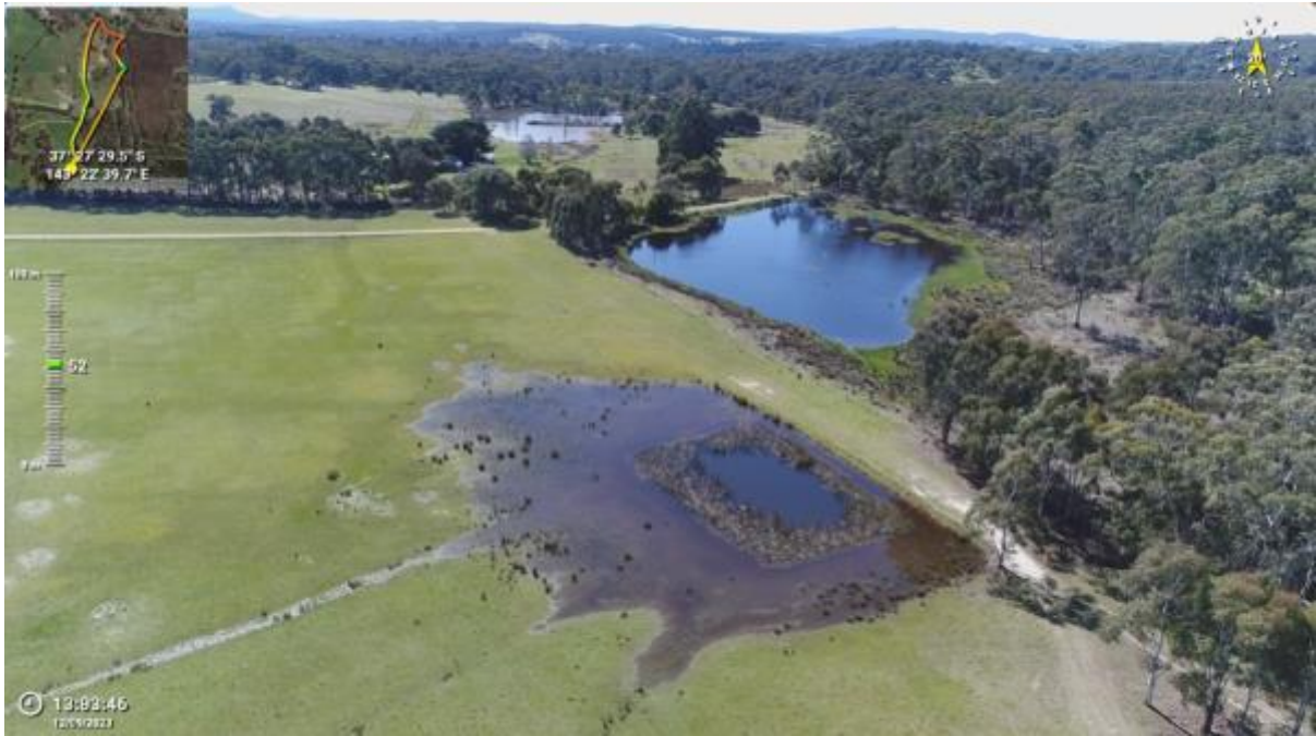
Appendix Plate 327. Waterbody 287; Moderate habitat quality (Ecology and Heritage Partners Pty Ltd 09/2023).