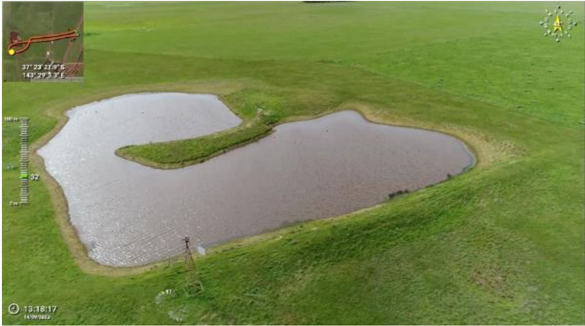
Appendix Plate 85. Waterbody 70; Low habitat quality (Ecology and Heritage Partners Pty Ltd 09/2023).