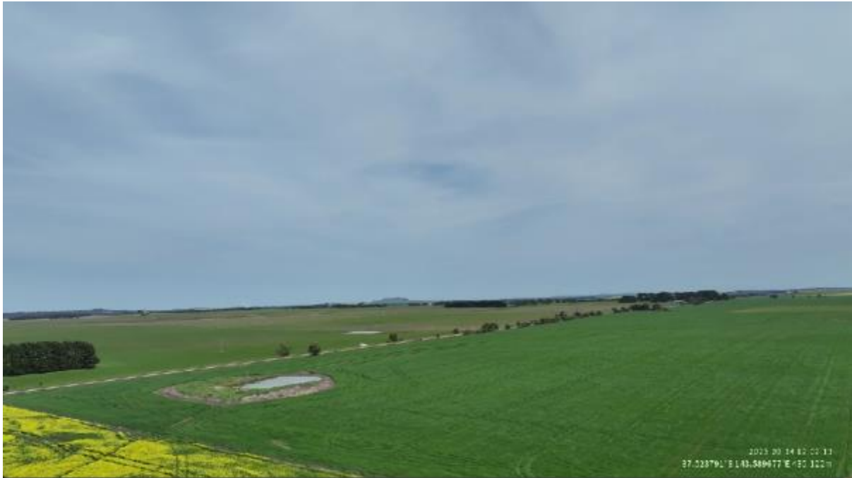
Appendix Plate 309. Waterbody 272; Low habitat quality (Ecology and Heritage Partners Pty Ltd 09/2023).