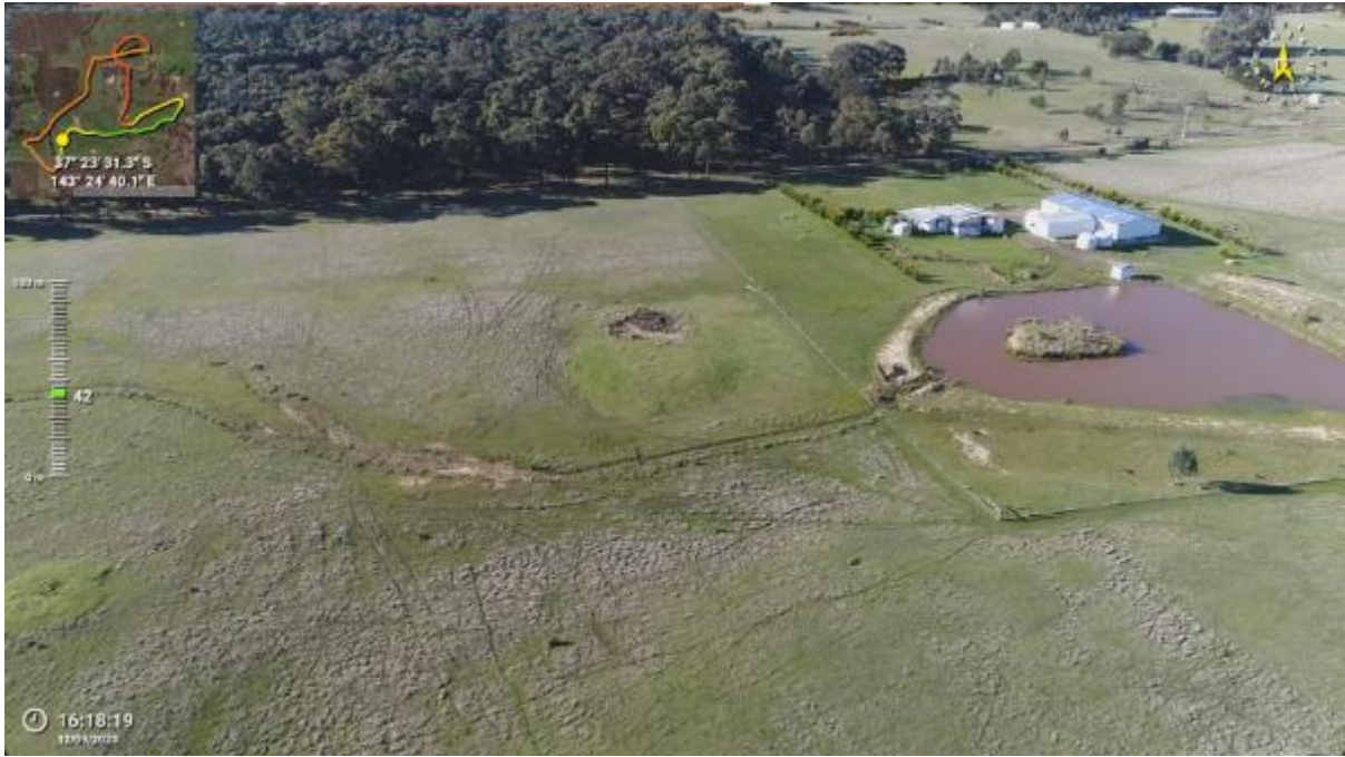
Appendix Plate 41. Waterbody 32; Low habitat quality.