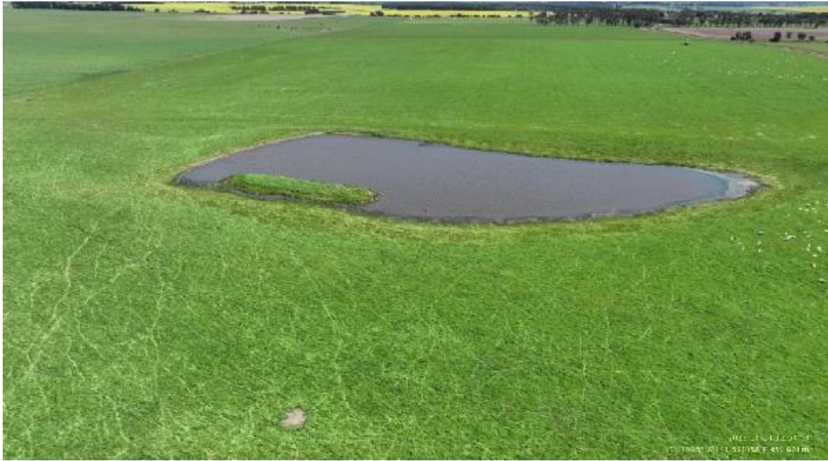
Appendix Plate 153. Waterbody 133; Low habitat quality.