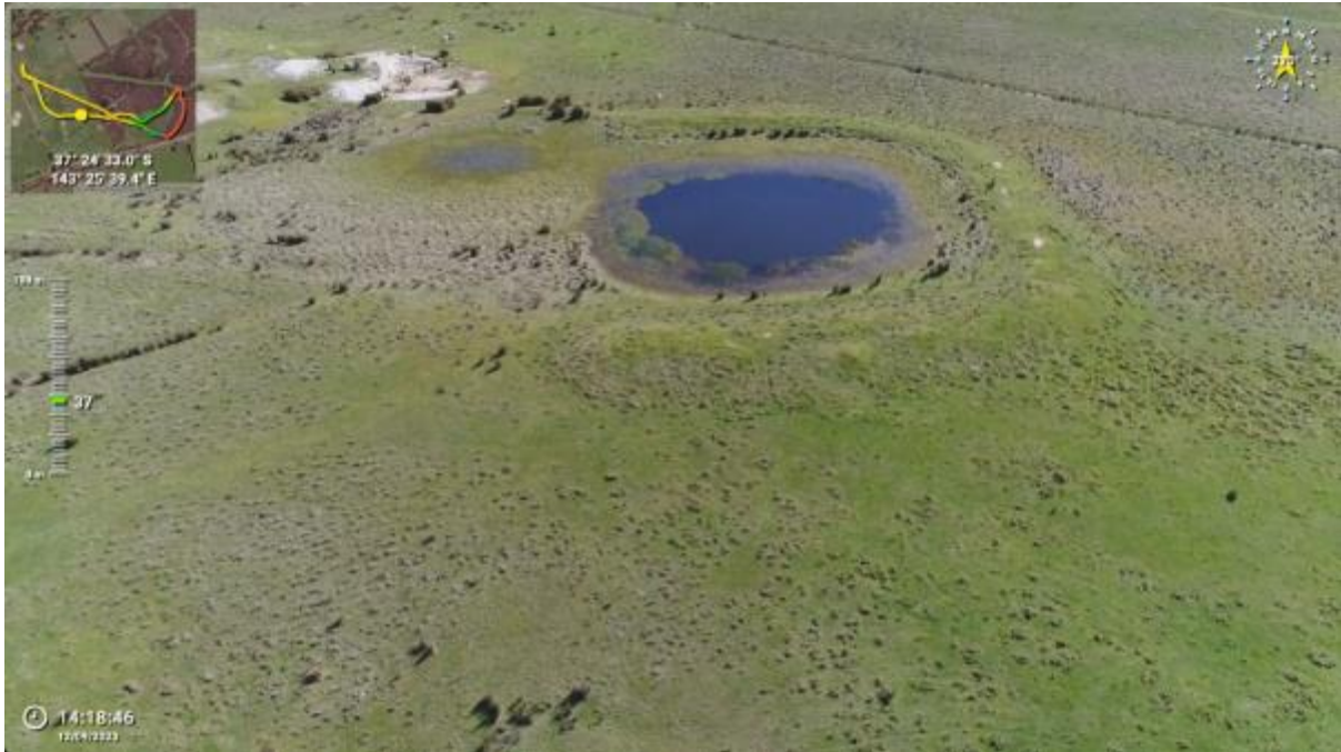
Appendix Plate 55. Waterbody 45; Moderate habitat quality (Ecology and Heritage Partners Pty Ltd 09/2023).