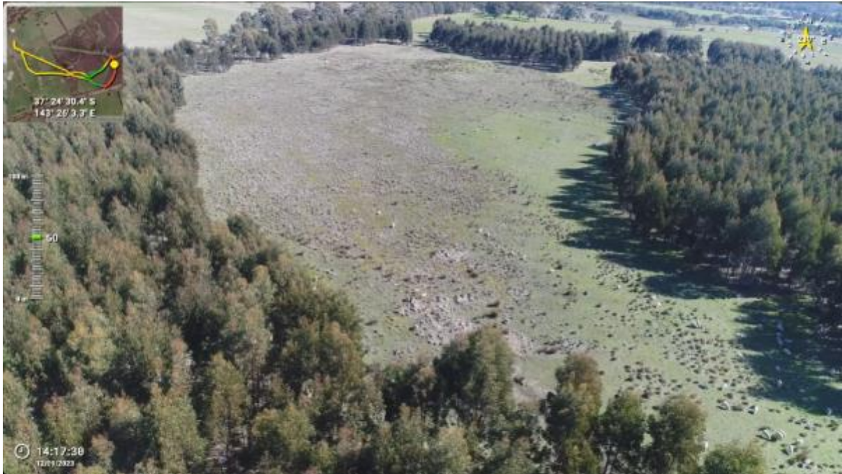
Appendix Plate 57. Waterbody 46; Low habitat quality (Ecology and Heritage Partners Pty Ltd 09/2023).