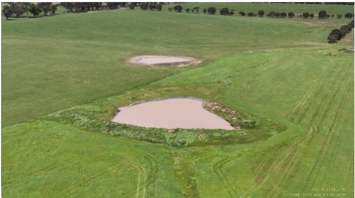
Appendix Plate 144. Waterbody 124 and 125; Low habitat quality (Ecology and Heritage Partners Pty Ltd 09/2023).