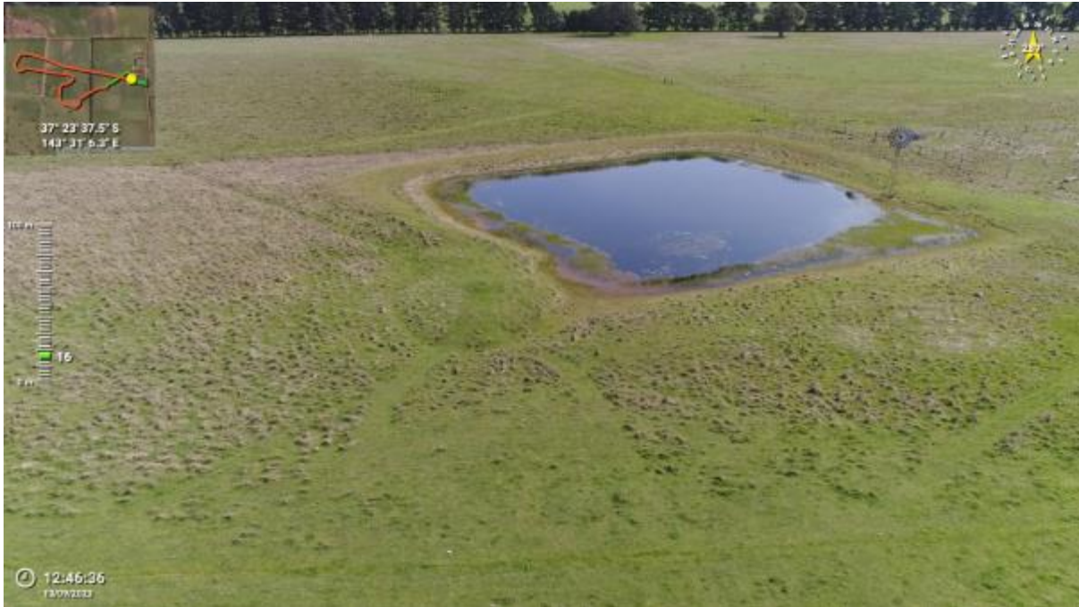
Appendix Plate 121. Waterbody 104; Moderate habitat quality (Ecology and Heritage Partners Pty Ltd 09/2023).