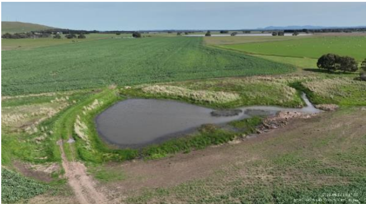
Appendix Plate 298. Waterbody 263; Low habitat quality (Ecology and Heritage Partners Pty Ltd 09/2023).

This copied document to be made available for the sole purpose of enabling its consideration and review as part of a planning process under the Planning and Environment Act 1987. The document must not be used for any purpose which may breach any copyright