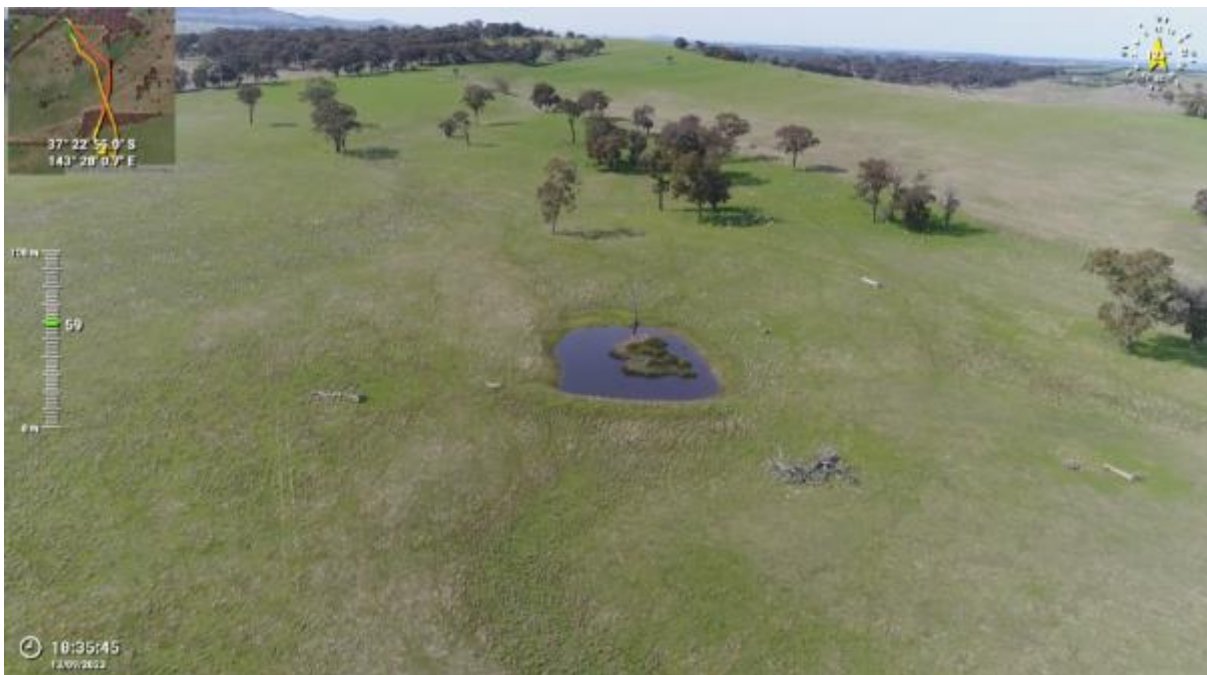
Appendix Plate 16. Waterbody 12; Low habitat quality (Ecology and Heritage Partners Pty Ltd 09/2023).

This copied document to be made available for the sole purpose of enabling its consideration and review as part of a planning process under the Planning and Environment Act 1987. The document must not be used for any purpose which may breach any copyright