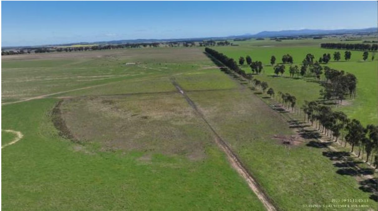
Appendix Plate 221. Waterbody 196; Low habitat quality (Ecology and Heritage Partners Pty Ltd 09/2023).