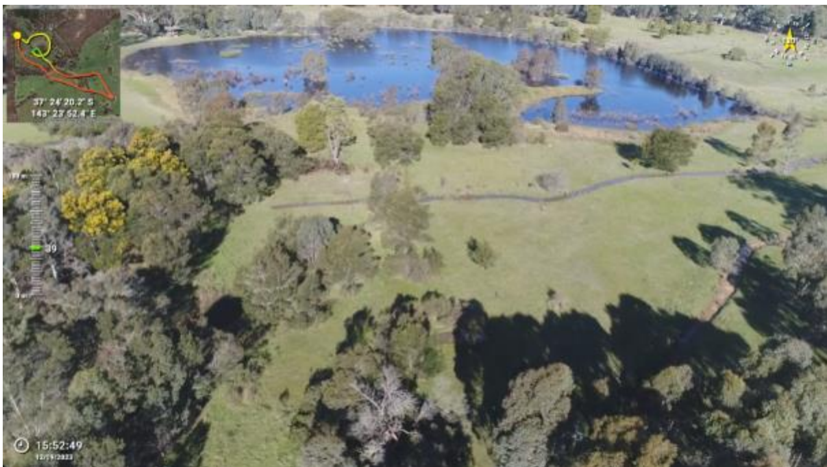
Appendix Plate 72. Waterbody 58; High habitat quality.

This copied document to be made available for the sole purpose of enabling its consideration and review as part of a planning process under the Planning and Environment Act 1987. The document must not be used for any purpose which may breach any copyright