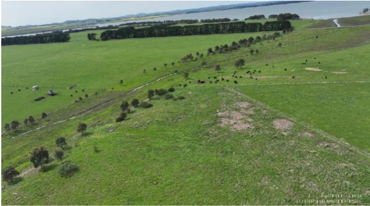
Appendix Plate 299. Waterbody 264; Low habitat quality (Ecology and Heritage Partners Pty Ltd 09/2023).