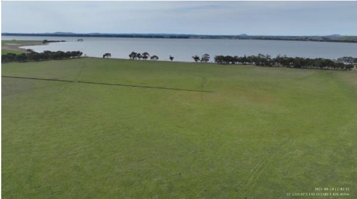
Appendix Plate 191. Waterbody 166; Low habitat quality.