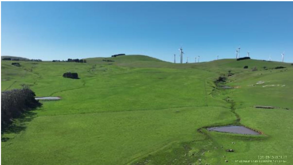
Appendix Plate 274. Waterbody 244; Moderate habitat quality (Ecology and Heritage Partners Pty Ltd 09/2023).