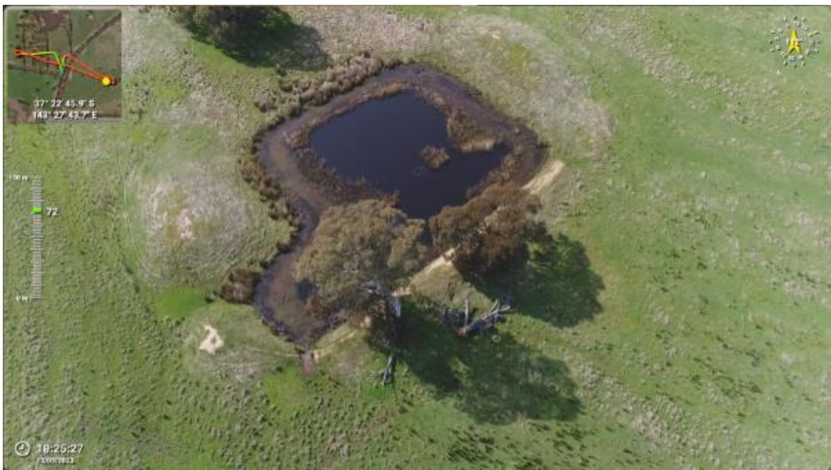
Appendix Plate 14. Waterbody 10; Moderate habitat quality (Ecology and Heritage Partners Pty Ltd 09/2023).

This copied document to be made available for the sole purpose of enabling its consideration and review as part of a planning process under the Planning and Environment Act 1987. The document must not be used for any purpose which may breach any copyright