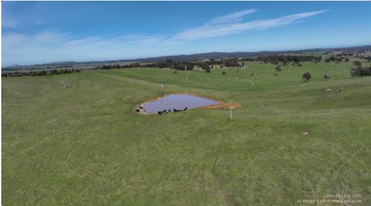
Appendix Plate 81. Waterbody 67; Low habitat quality.