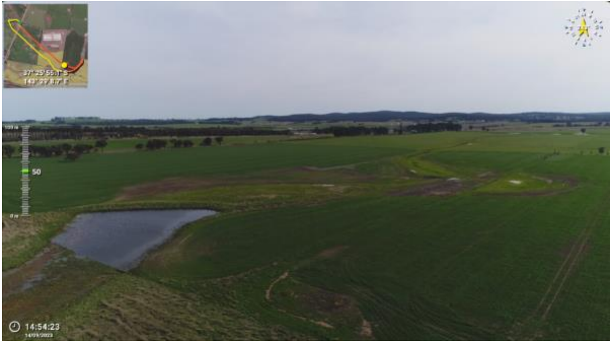
Appendix Plate 255. Waterbody 229; Low habitat quality (Ecology and Heritage Partners Pty Ltd 09/2023).