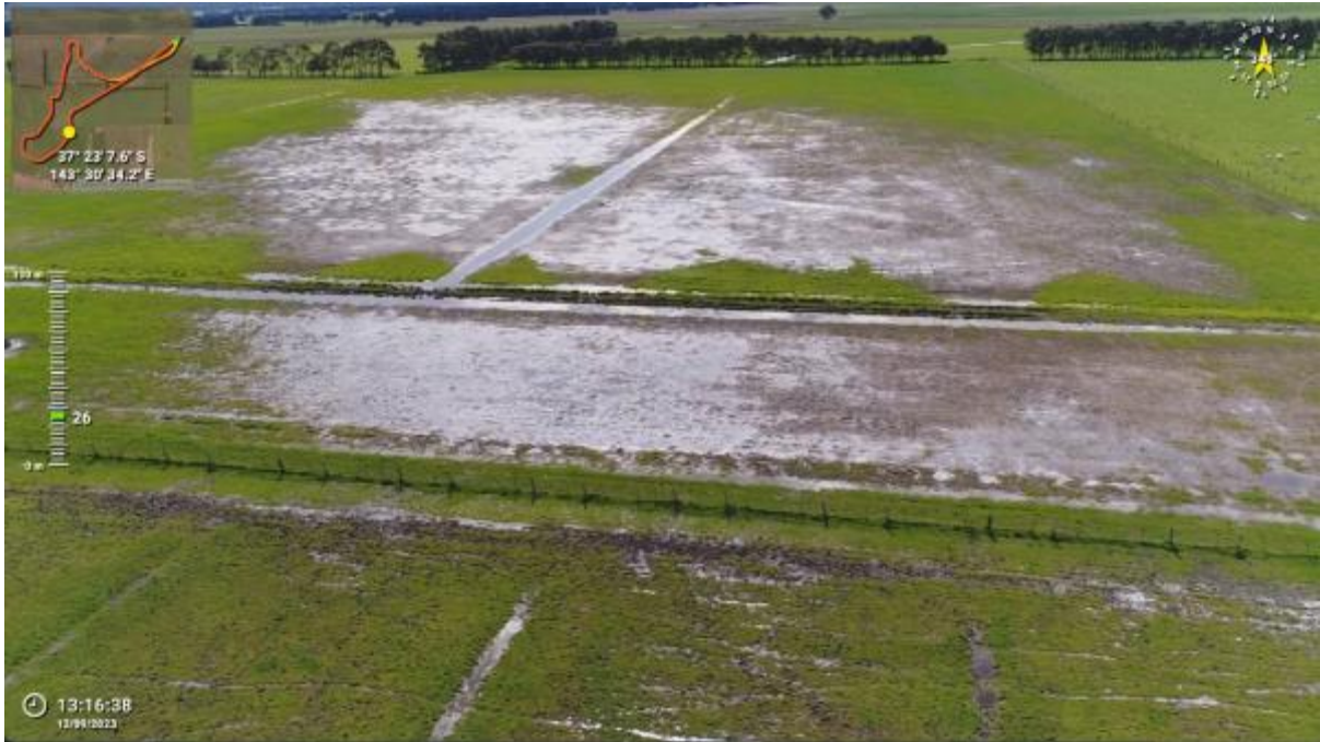
Appendix Plate 113. Waterbody 96; Low habitat quality (Ecology and Heritage Partners Pty Ltd 09/2023).