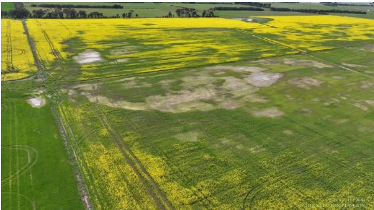
Appendix Plate 310. Waterbody 273; Low habitat quality (Ecology and Heritage Partners Pty Ltd 09/2023).

This copied document to be made available for the sole purpose of enabling its consideration and review as part of a planning process under the Planning and Environment Act 1987. The document must not be used for any purpose which may breach any copyright