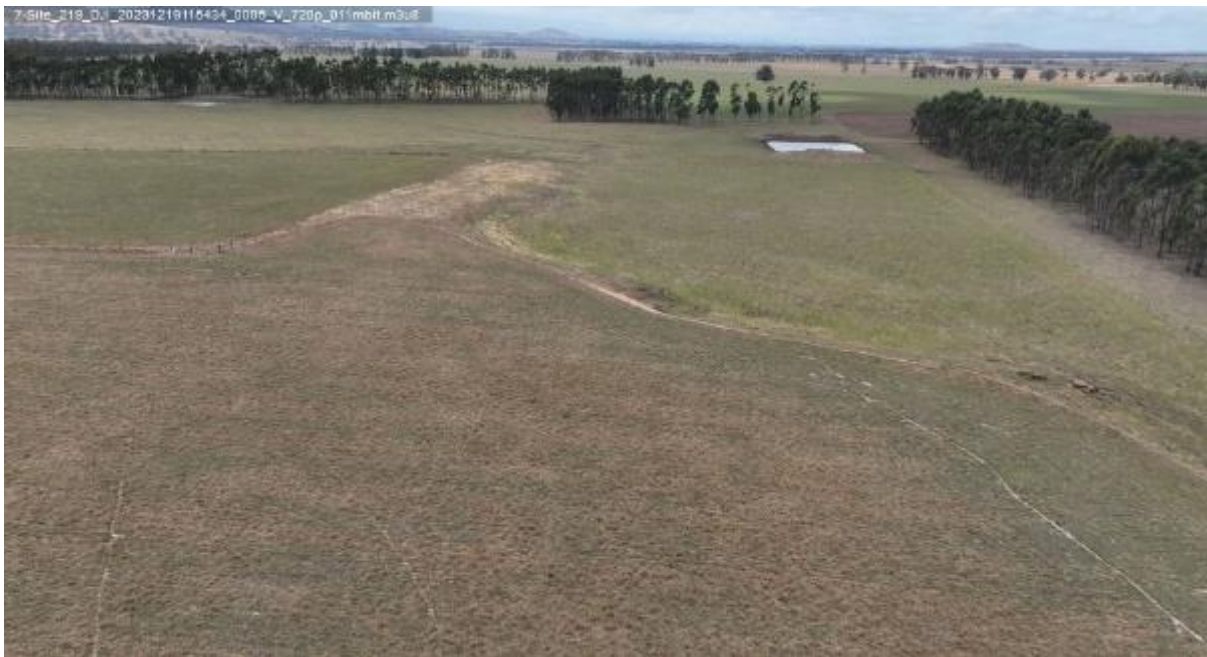
Appendix Plate 246. Waterbody 219; Low habitat quality (Ecology and Heritage Partners Pty Ltd 12/2023).

This copied document to be made available for the sole purpose of enabling its consideration and review as part of a planning process under the Planning and Environment Act 1987. The document must not be used for any purpose which may breach any copyright