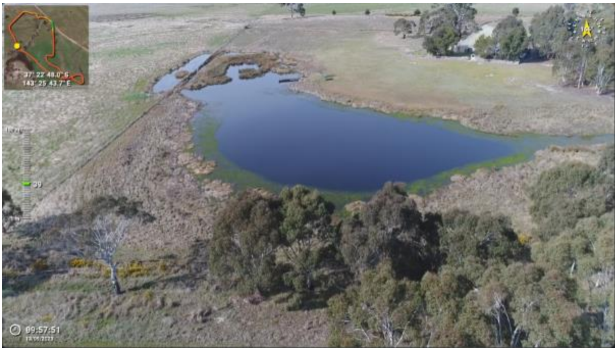
Appendix Plate 34. Waterbody 26; High habitat quality (Ecology and Heritage Partners Pty Ltd 09/2023).

This copied document to be made available for the sole purpose of enabling its consideration and review as part of a planning process under the Planning and Environment Act 1987. The document must not be used for any purpose which may breach any copyright