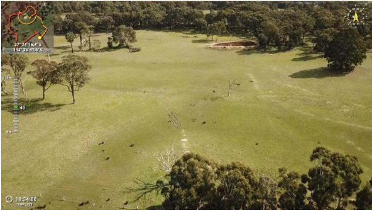
Appendix Plate 65. Waterbody 53; Low habitat quality (Ecology and Heritage Partners Pty Ltd 09/2023).