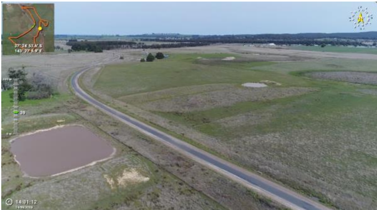
Appendix Plate 318. Waterbody 278; Low habitat quality (Ecology and Heritage Partners Pty Ltd 09/2023).

This copied document to be made available for the sole purpose of enabling its consideration and review as part of a planning process under the Planning and Environment Act 1987. The document must not be used for any purpose which may breach any copyright