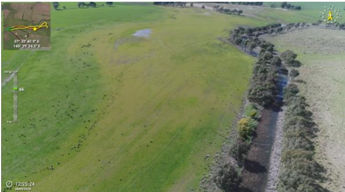
Appendix Plate 232. Waterbody 207; Low habitat quality (Ecology and Heritage Partners Pty Ltd 09/2023).

This copied document to be made available for the sole purpose of enabling its consideration and review as part of a planning process under the Planning and Environment Act 1987. The document must not be used for any purpose which may breach any copyright