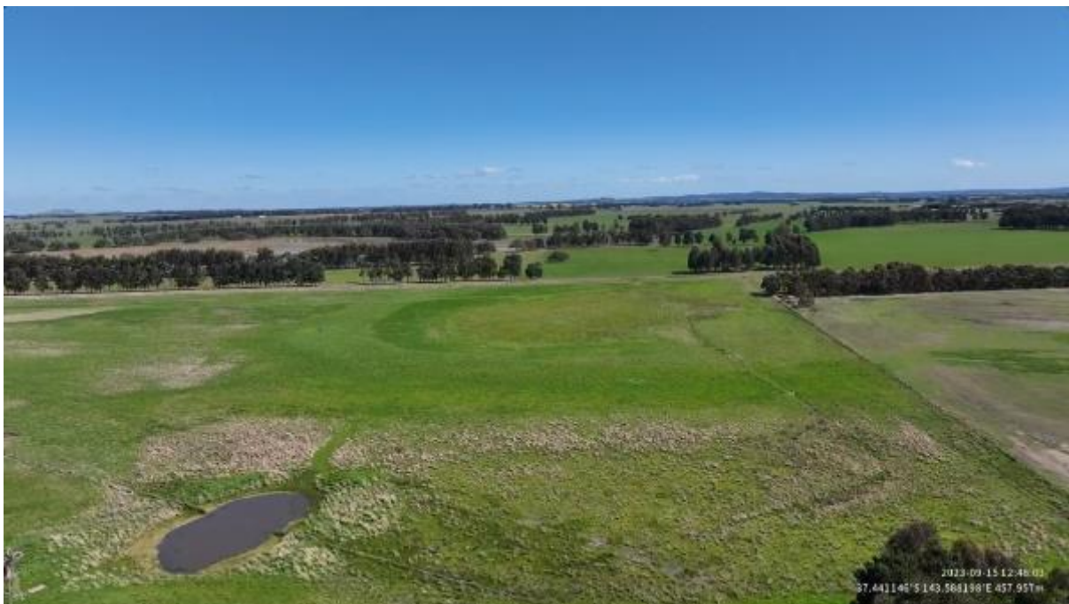
Appendix Plate 164. Waterbody 140; Low habitat quality.

This copied document to be made available for the sole purpose of enabling its consideration and review as part of a planning process under the Planning and Environment Act 1987. The document must not be used for any purpose which may breach any copyright