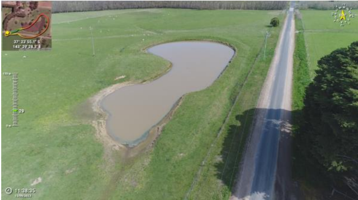
Appendix Plate 127. Waterbody 109; Low habitat quality (Ecology and Heritage Partners Pty Ltd 09/2023).