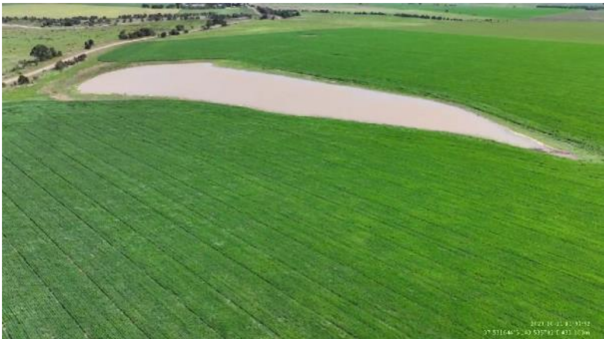
Appendix Plate 292. Waterbody 259; Low habitat quality.

This copied document to be made available for the sole purpose of enabling its consideration and review as part of a planning process under the Planning and Environment Act 1987. The document must not be used for any purpose which may breach any copyright