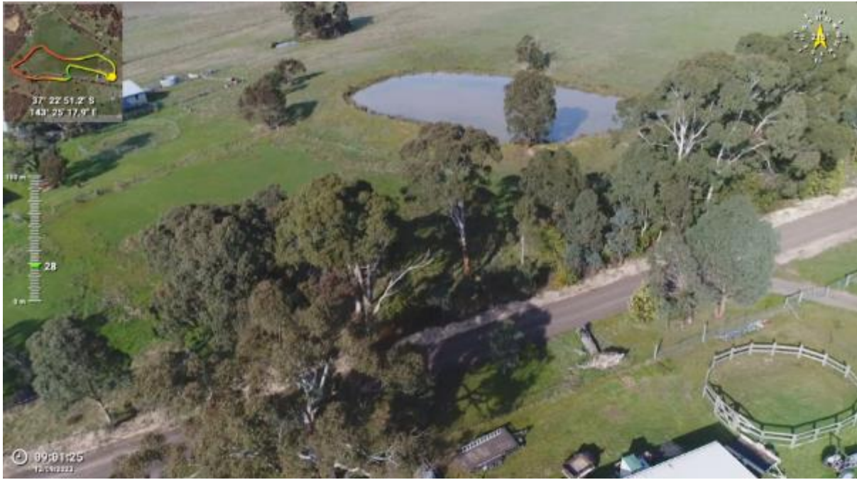
Appendix Plate 31. Waterbody 24; Low habitat quality (Ecology and Heritage Partners Pty Ltd 09/2023).