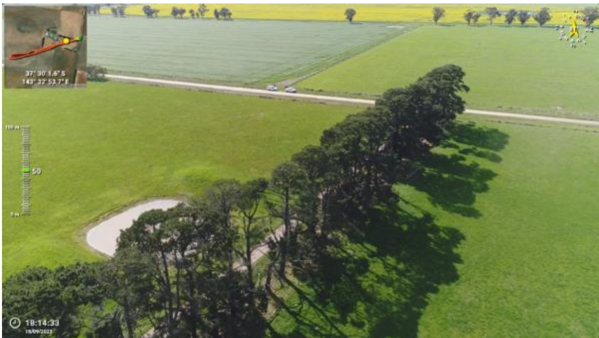
Appendix Plate 202. Waterbody 178; Low habitat quality.

This copied document to be made available for the sole purpose of enabling its consideration and review as part of a planning process under the Planning and Environment Act 1987. The document must not be used for any purpose which may breach any copyright