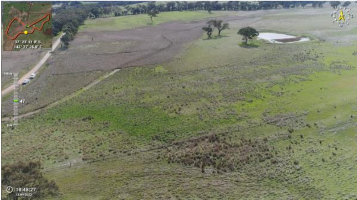
Appendix Plate 9. Waterbody 6; Low habitat quality (Ecology and Heritage Partners Pty Ltd 09/2023).