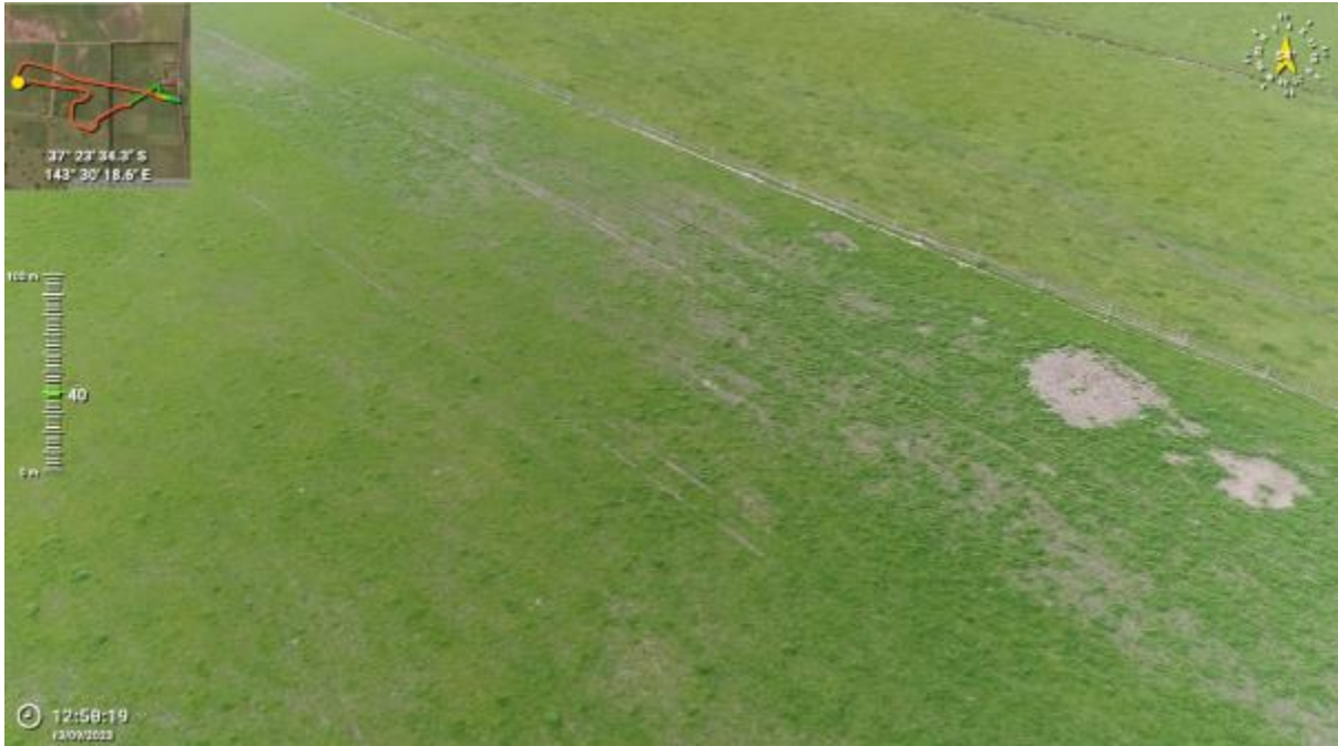
Appendix Plate 119. Waterbody 102; Low habitat quality (Ecology and Heritage Partners Pty Ltd 09/2023).