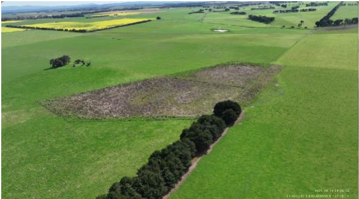
Appendix Plate 238. Waterbody 212; Moderate habitat quality (Ecology and Heritage Partners Pty Ltd 09/2023).