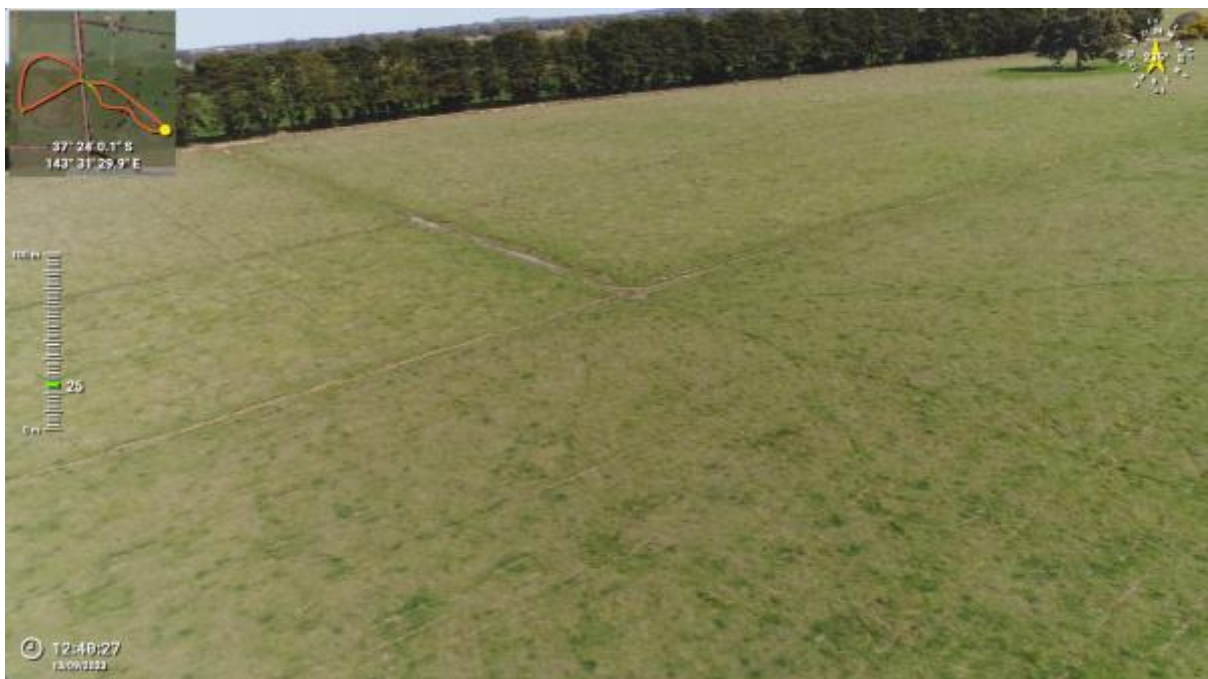
Appendix Plate 116. Waterbody 99; Low habitat quality.

This copied document to be made available for the sole purpose of enabling its consideration and review as part of a planning process under the Planning and Environment Act 1987. The document must not be used for any purpose which may breach any copyright