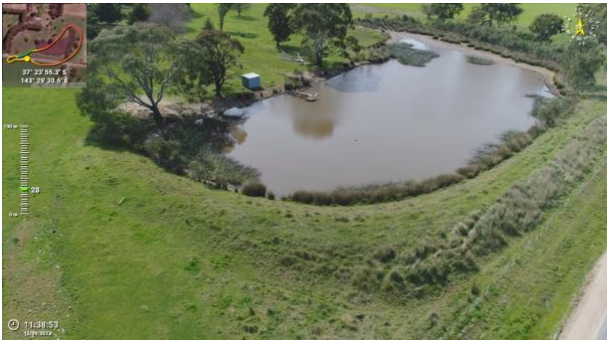
Appendix Plate 126. Waterbody 108; Low habitat quality (Ecology and Heritage Partners Pty Ltd 09/2023).

This copied document to be made available for the sole purpose of enabling its consideration and review as part of a planning process under the Planning and Environment Act 1987. The document must not be used for any purpose which may breach any copyright