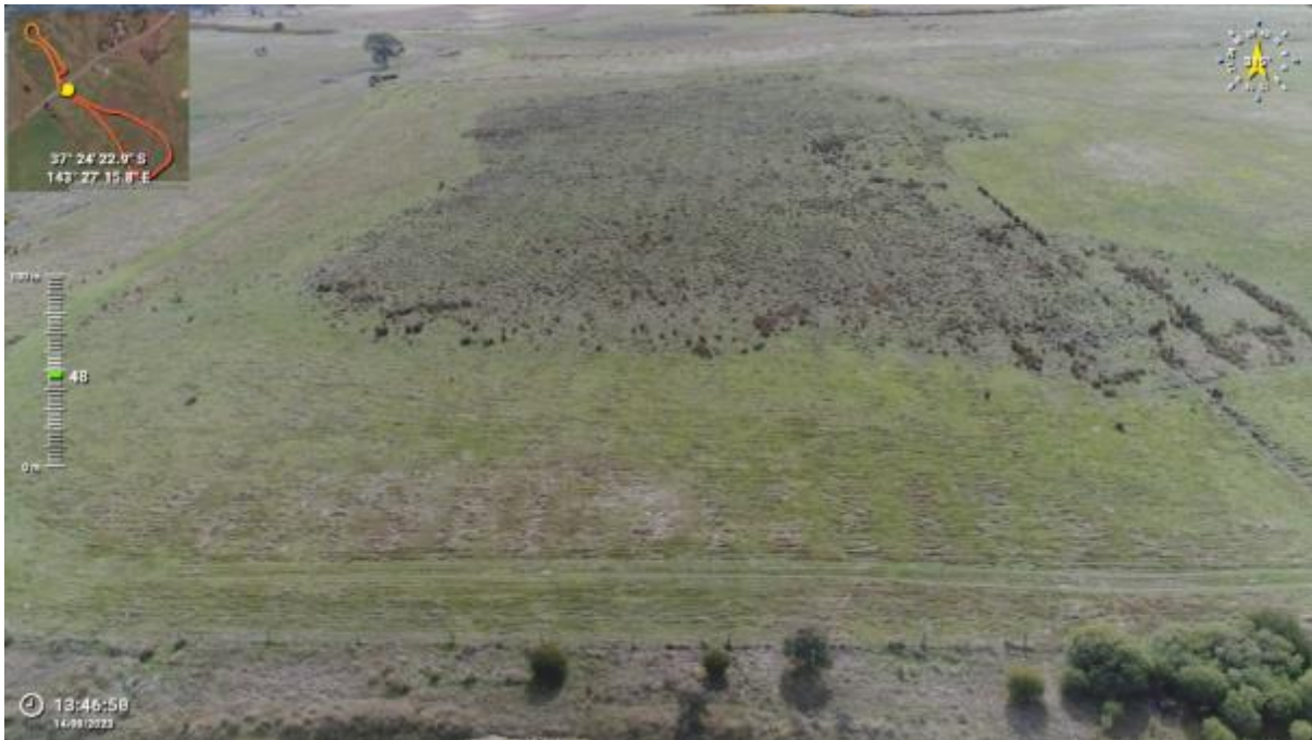
Appendix Plate 336. Waterbody 295; Low habitat quality (Ecology and Heritage Partners Pty Ltd 09/2023).

This copied document to be made available for the sole purpose of enabling its consideration and review as part of a planning process under the Planning and Environment Act 1987. The document must not be used for any purpose which may breach any copyright