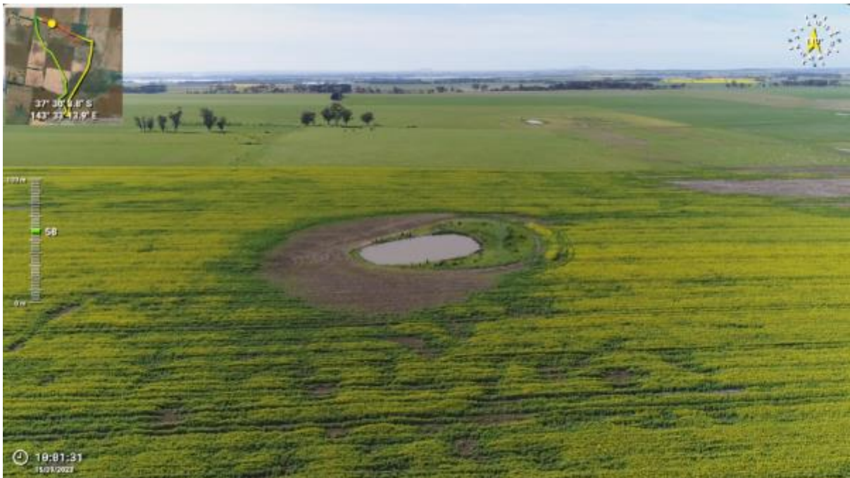
Appendix Plate 208. Waterbody 184; Low habitat quality (Ecology and Heritage Partners Pty Ltd 09/2023).

This copied document to be made available for the sole purpose of enabling its consideration and review as part of a planning process under the Planning and Environment Act 1987. The document must not be used for any purpose which may breach any copyright