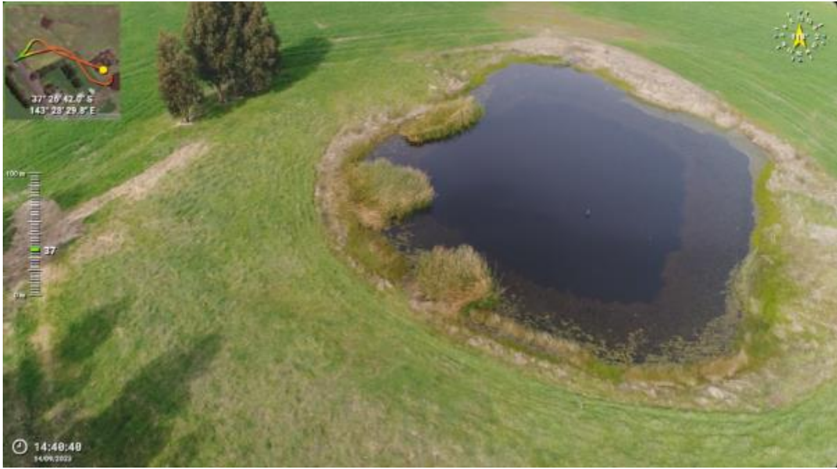
Appendix Plate 135. Waterbody 115; Moderate habitat quality (Ecology and Heritage Partners Pty Ltd 09/2023).