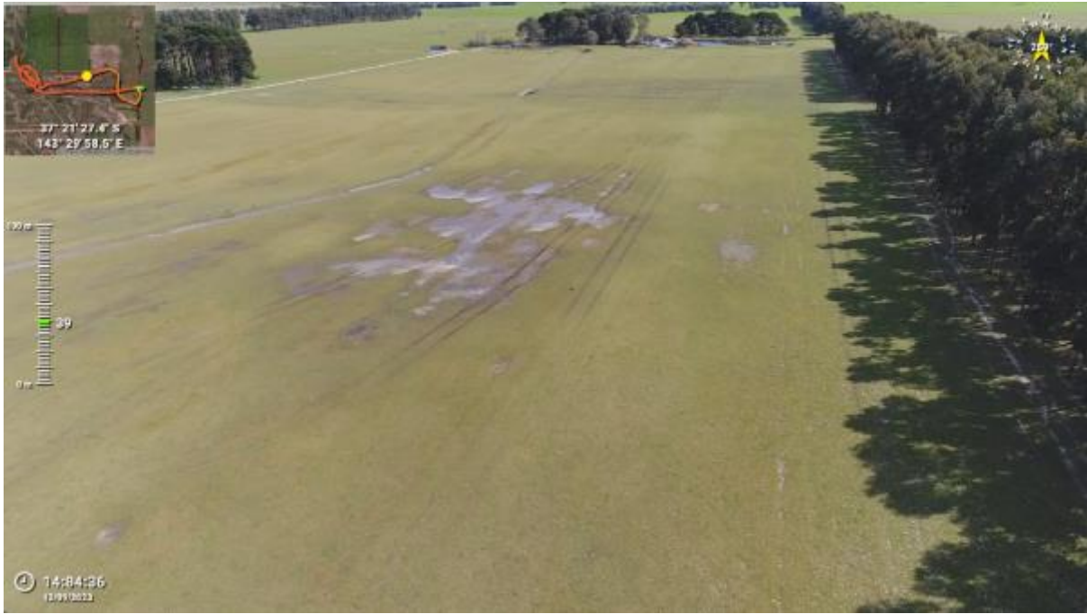
Appendix Plate 187. Waterbody 162; Low habitat quality (Ecology and Heritage Partners Pty Ltd 09/2023).