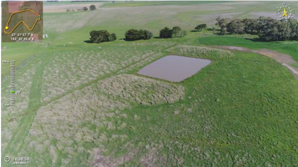
Appendix Plate 101. Waterbody 86; Low habitat quality (Ecology and Heritage Partners Pty Ltd 09/2023).