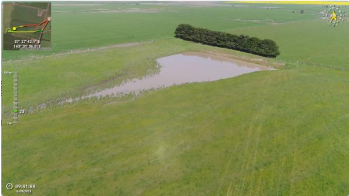
Appendix Plate 179. Waterbody 154; Low habitat quality (Ecology and Heritage Partners Pty Ltd 09/2023).