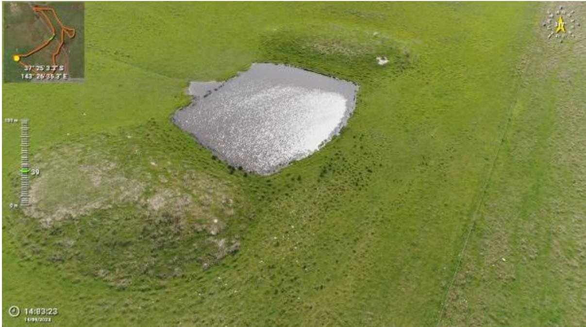
Appendix Plate 263. Waterbody 235; Low habitat quality.