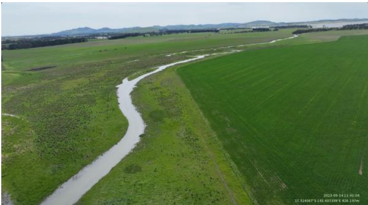
Appendix Plate 192. Waterbody 167; Low habitat quality (Ecology and Heritage Partners Pty Ltd 09/2023).

This copied document to be made available for the sole purpose of enabling its consideration and review as part of a planning process under the Planning and Environment Act 1987. The document must not be used for any purpose which may breach any copyright