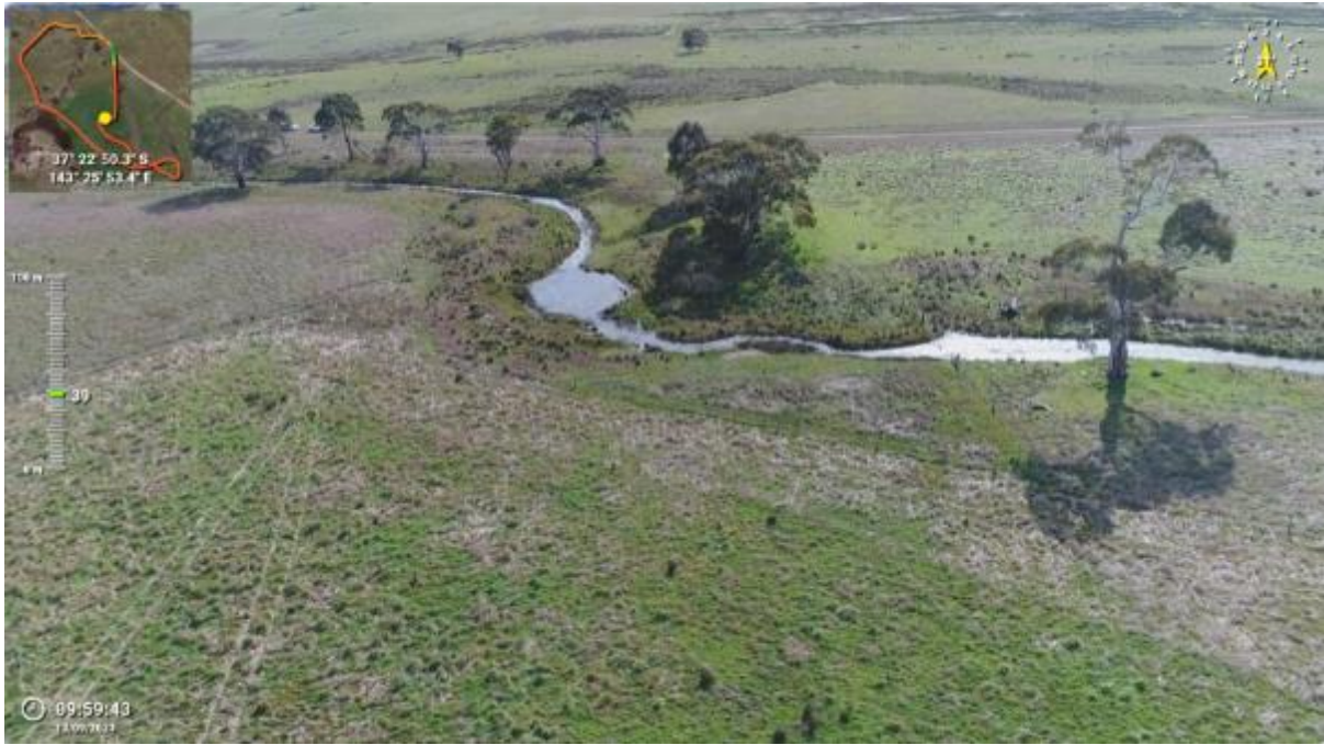
Appendix Plate 25. Waterbody 19; Low habitat quality (Ecology and Heritage Partners Pty Ltd 09/2023).