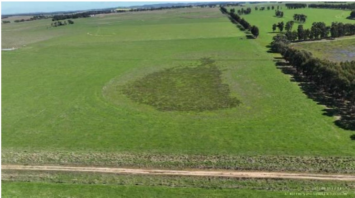
Appendix Plate 276. Waterbody 245; Low habitat quality.

This copied document to be made available for the sole purpose of enabling its consideration and review as part of a planning process under the Planning and Environment Act 1987. The document must not be used for any purpose which may breach any copyright