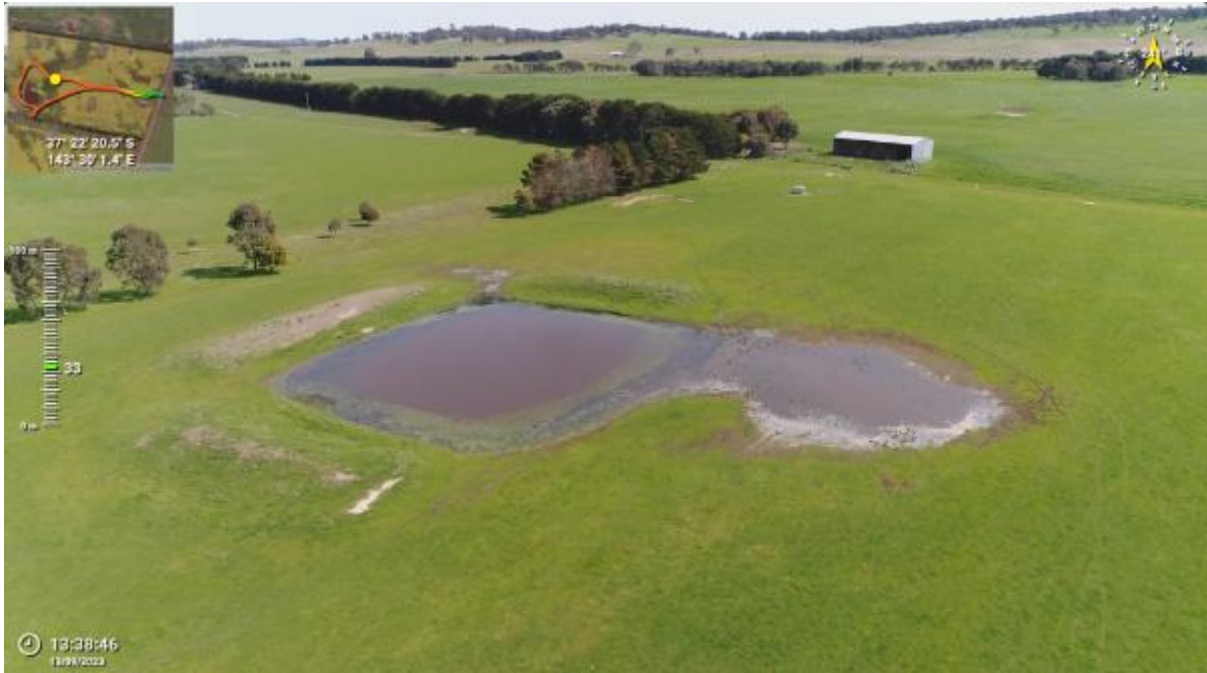
Appendix Plate 89. Waterbody 74; Low habitat quality (Ecology and Heritage Partners Pty Ltd 09/2023).