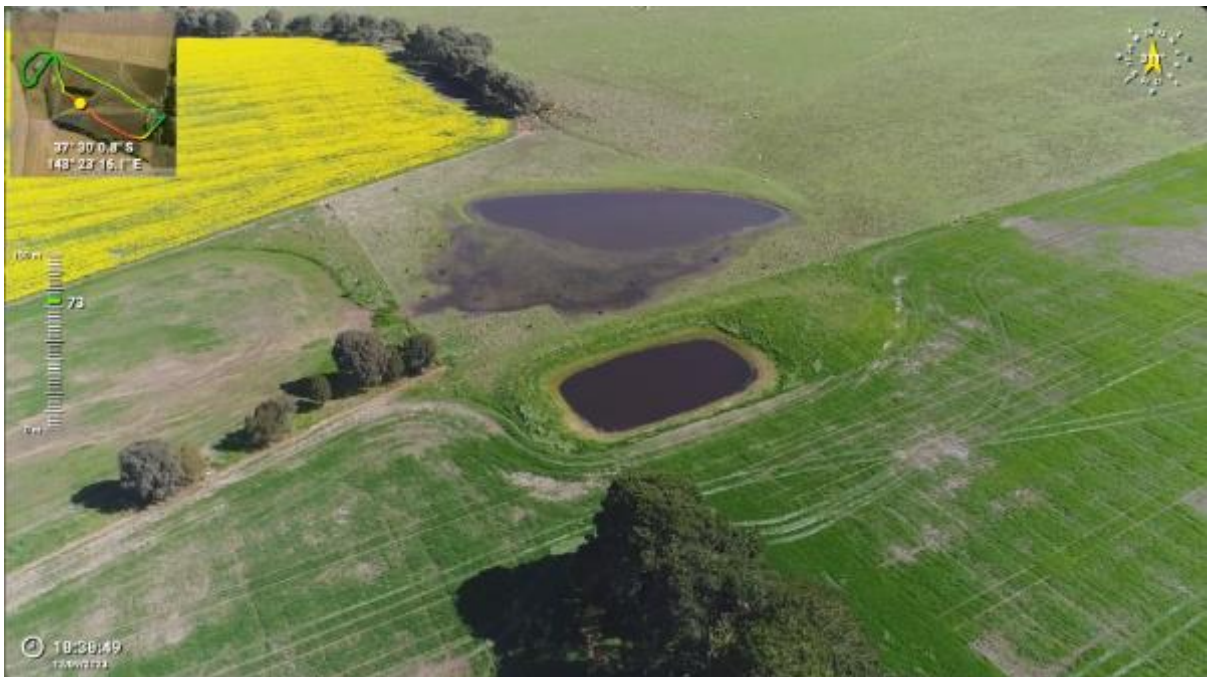
Appendix Plate 330. Waterbody 290; Low habitat quality (Ecology and Heritage Partners Pty Ltd 09/2023).

This copied document to be made available for the sole purpose of enabling its consideration and review as part of a planning process under the Planning and Environment Act 1987. The document must not be used for any purpose which may breach any copyright