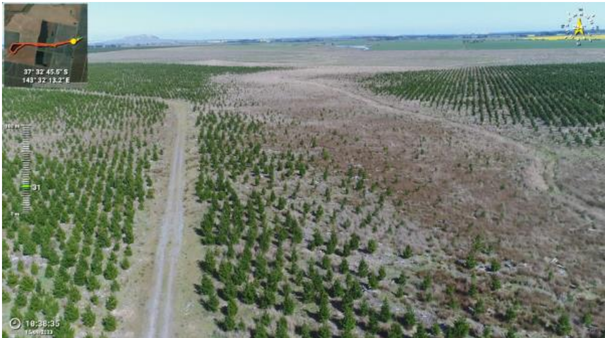
Appendix Plate 200. Waterbody 176; Low habitat quality (Ecology and Heritage Partners Pty Ltd 09/2023).

This copied document to be made available for the sole purpose of enabling its consideration and review as part of a planning process under the Planning and Environment Act 1987. The document must not be used for any purpose which may breach any copyright