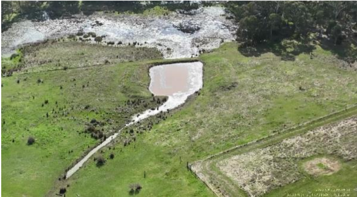
Appendix Plate 61. Waterbody 50; Low habitat quality (Ecology and Heritage Partners Pty Ltd 09/2023).