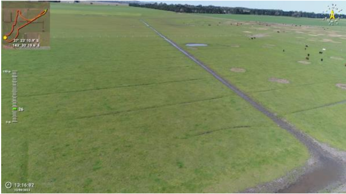
Appendix Plate 111. Waterbody 95; Low habitat quality (Ecology and Heritage Partners Pty Ltd 09/2023).