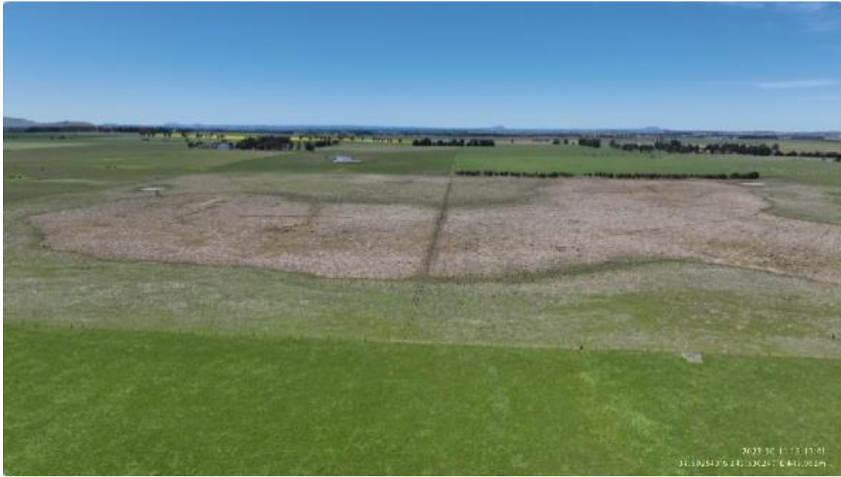
Appendix Plate 283. Waterbody 252; Moderate habitat quality (Ecology and Heritage Partners Pty Ltd 09/2023).