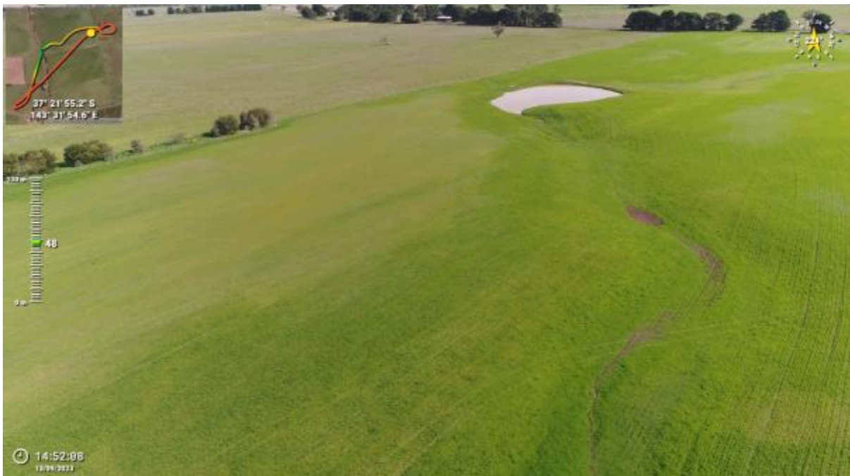
Appendix Plate 106. Waterbody 90; Low habitat quality (Ecology and Heritage Partners Pty Ltd 09/2023).

This copied document to be made available for the sole purpose of enabling its consideration and review as part of a planning process under the Planning and Environment Act 1987. The document must not be used for any purpose which may breach any copyright