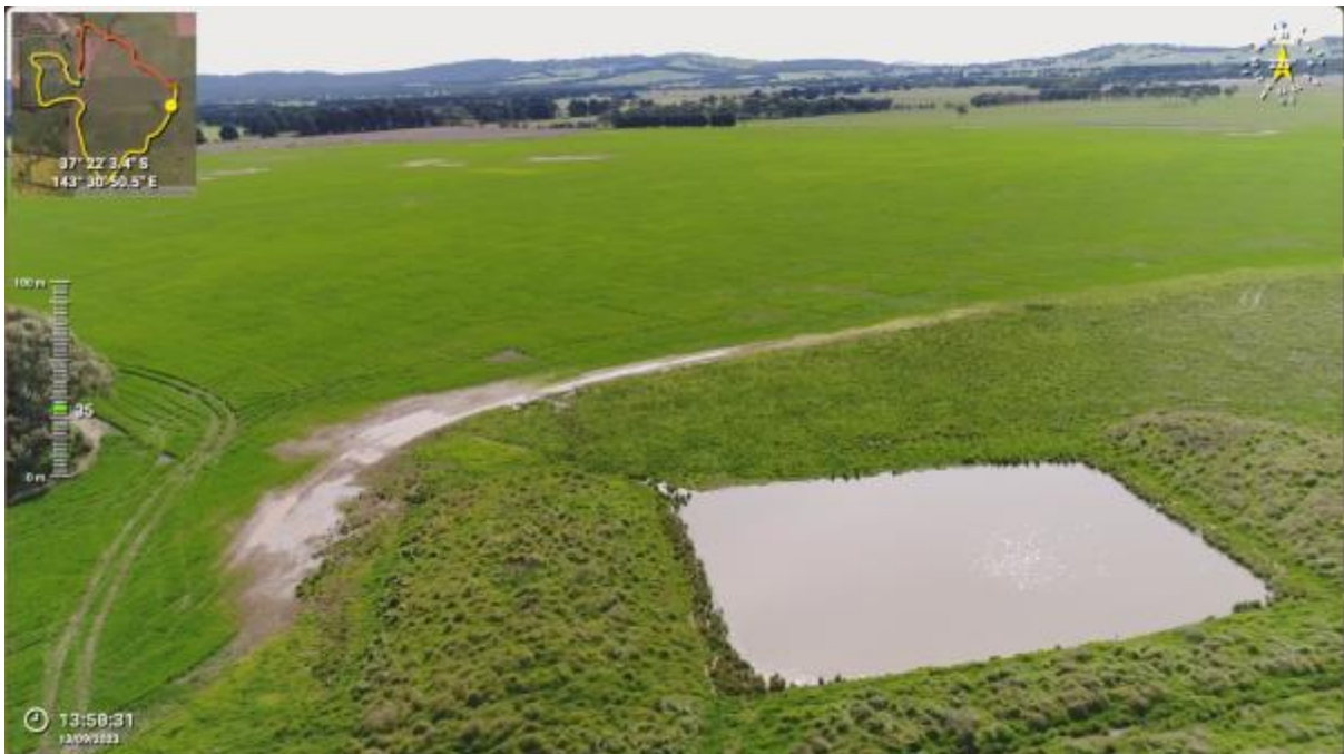
Appendix Plate 102. Waterbody 87; Low habitat quality (Ecology and Heritage Partners Pty Ltd 09/2023).

This copied document to be made available for the sole purpose of enabling its consideration and review as part of a planning process under the Planning and Environment Act 1987. The document must not be used for any purpose which may breach any copyright