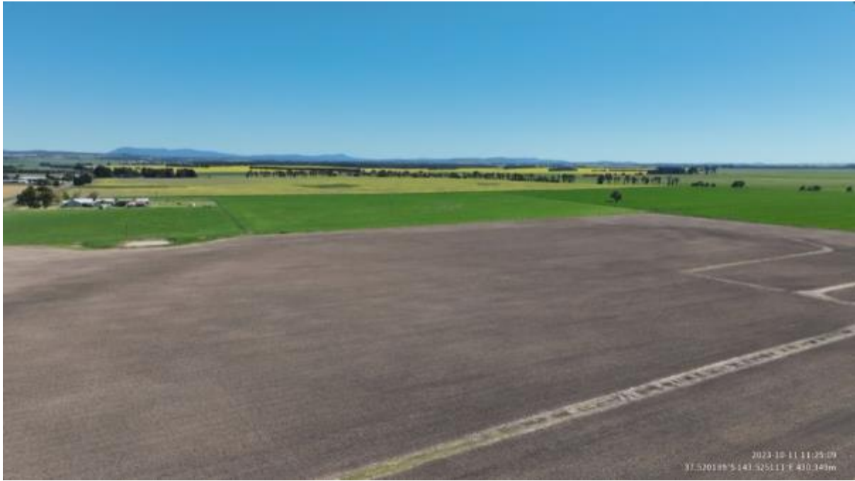
Appendix Plate 199. Waterbody 175; Low habitat quality.