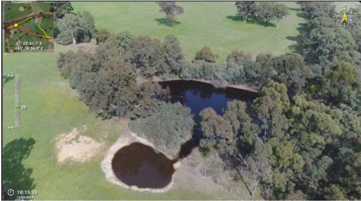
Appendix Plate 21. Waterbody 16; Low habitat quality (Ecology and Heritage Partners Pty Ltd 09/2023).