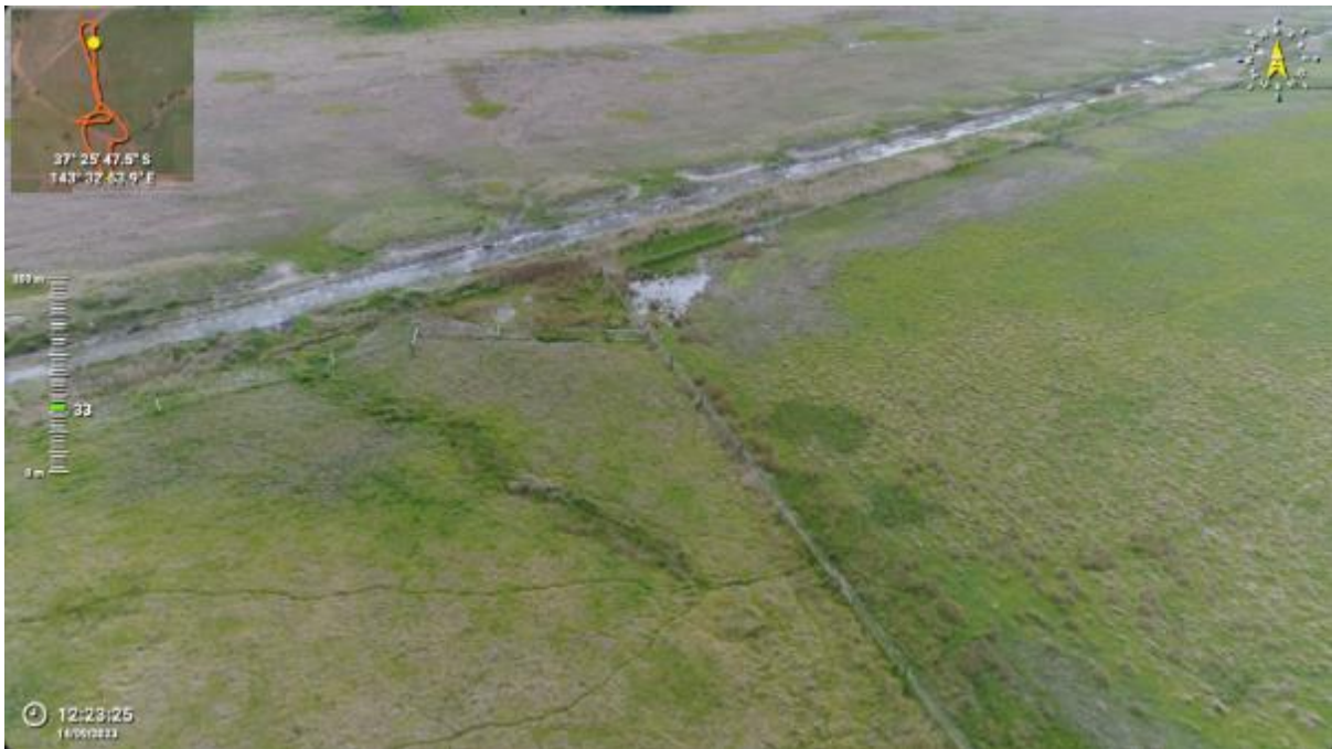
Appendix Plate 154. Waterbody 134; Low habitat quality (Ecology and Heritage Partners Pty Ltd 09/2023).

This copied document to be made available for the sole purpose of enabling its consideration and review as part of a planning process under the Planning and Environment Act 1987. The document must not be used for any purpose which may breach any copyright