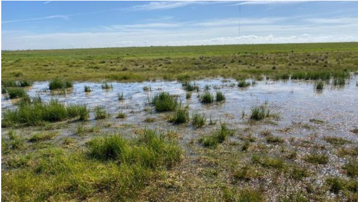
Appendix Plate 339. Waterbody 298; Moderate habitat quality (Ecology and Heritage Partners Pty Ltd 09/2023).