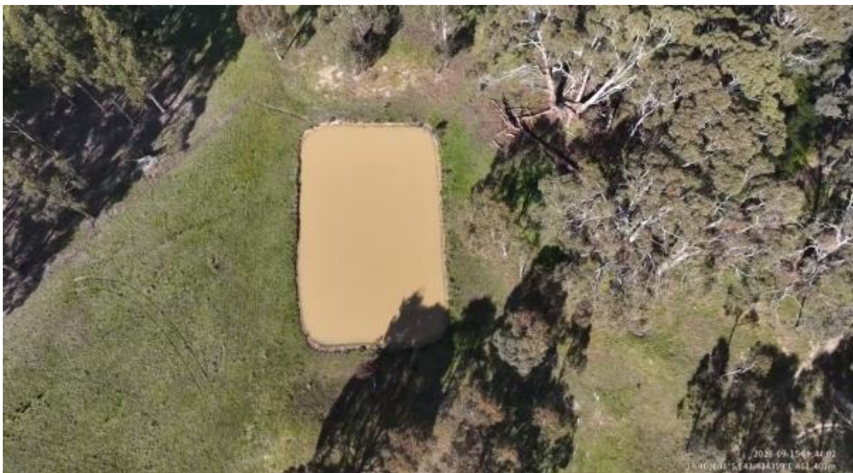
Appendix Plate 58. Waterbody 47; Low habitat quality (Ecology and Heritage Partners Pty Ltd 09/2023).

This copied document to be made available for the sole purpose of enabling its consideration and review as part of a planning process under the Planning and Environment Act 1987. The document must not be used for any purpose which may breach any copyright