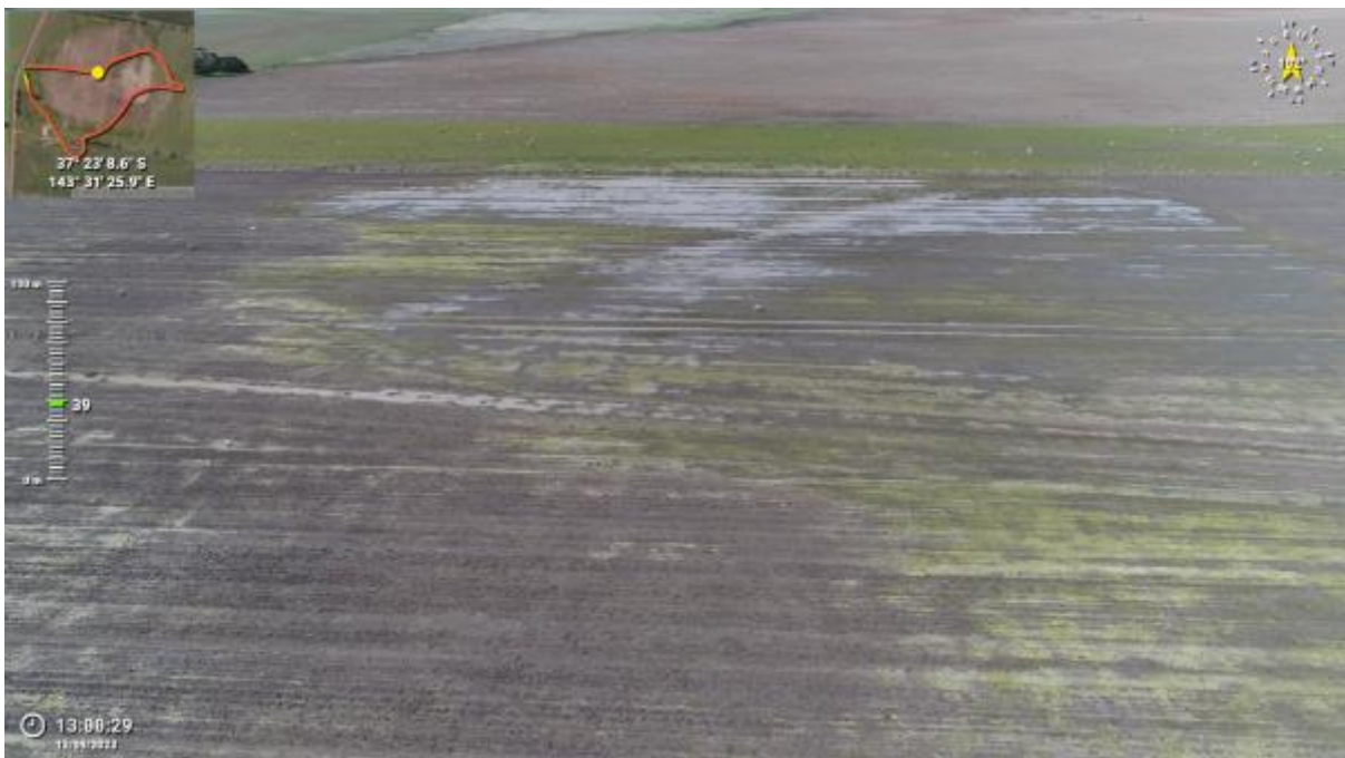
Appendix Plate 114. Waterbody 97; Low habitat quality.

This copied document to be made available for the sole purpose of enabling its consideration and review as part of a planning process under the Planning and Environment Act 1987. The document must not be used for any purpose which may breach any copyright