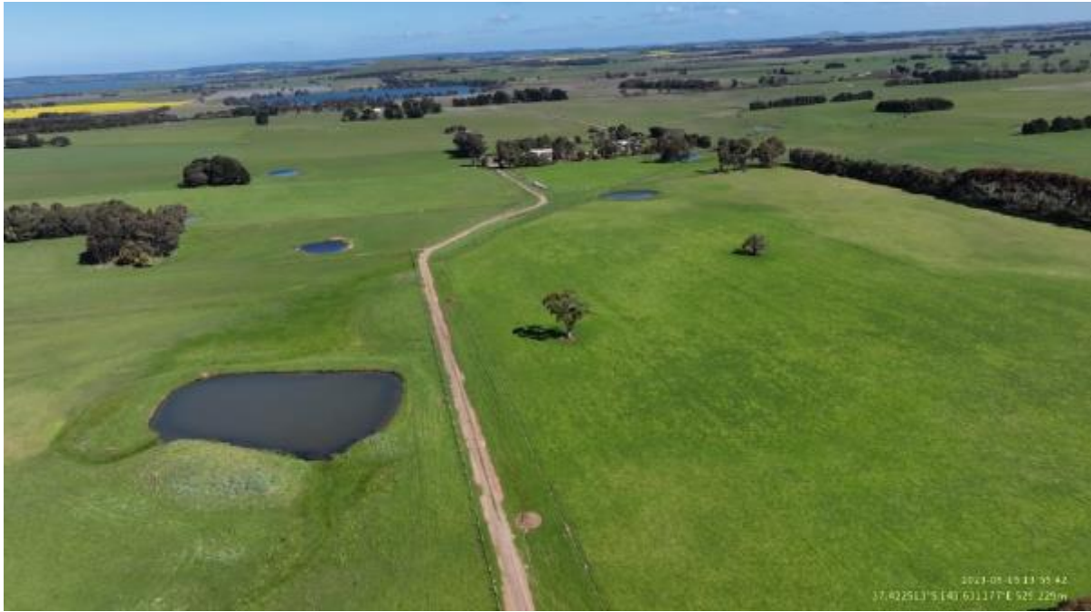
Appendix Plate 293. Waterbody 260; Low habitat quality (Ecology and Heritage Partners Pty Ltd 09/2023).