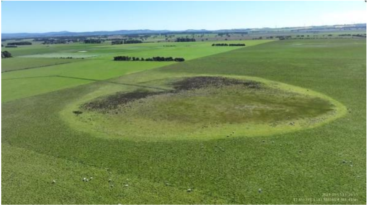
Appendix Plate 219. Waterbody 194; Moderate habitat quality (Ecology and Heritage Partners Pty Ltd 09/2023).