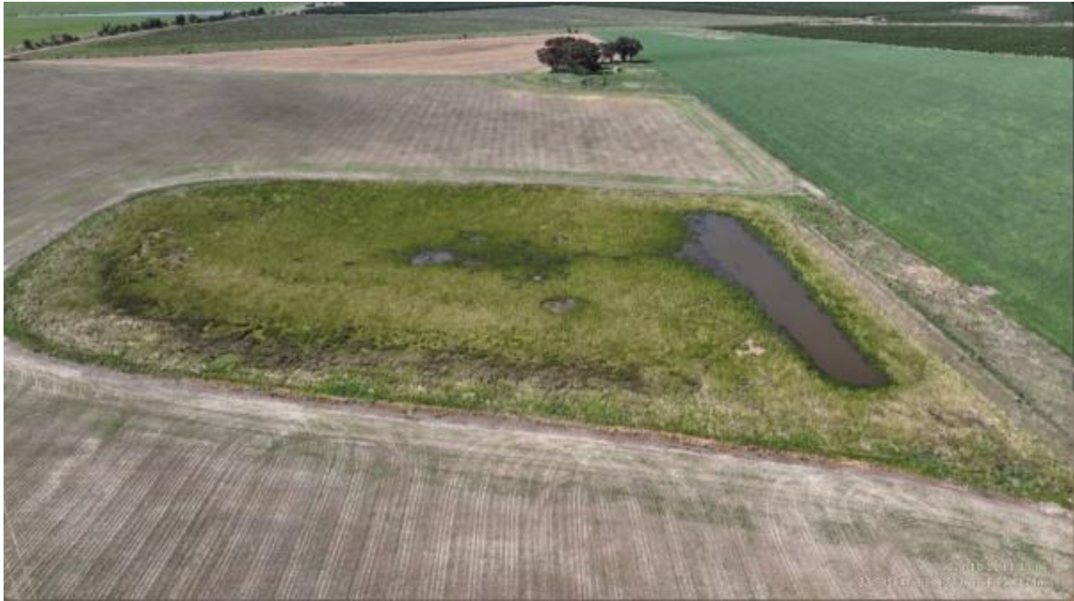
Appendix Plate 253. Waterbody 227; Low habitat quality (Ecology and Heritage Partners Pty Ltd 09/2023).