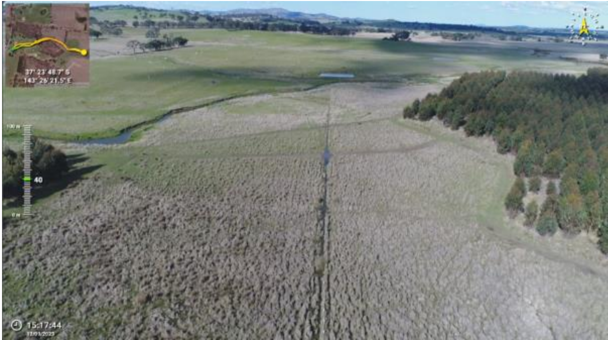
Appendix Plate 5. Waterbody 2; High habitat quality.