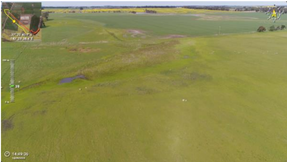
Appendix Plate 256. Waterbody 229; Low habitat quality (Ecology and Heritage Partners Pty Ltd 09/2023).

This copied document to be made available for the sole purpose of enabling its consideration and review as part of a planning process under the Planning and Environment Act 1987. The document must not be used for any purpose which may breach any copyright