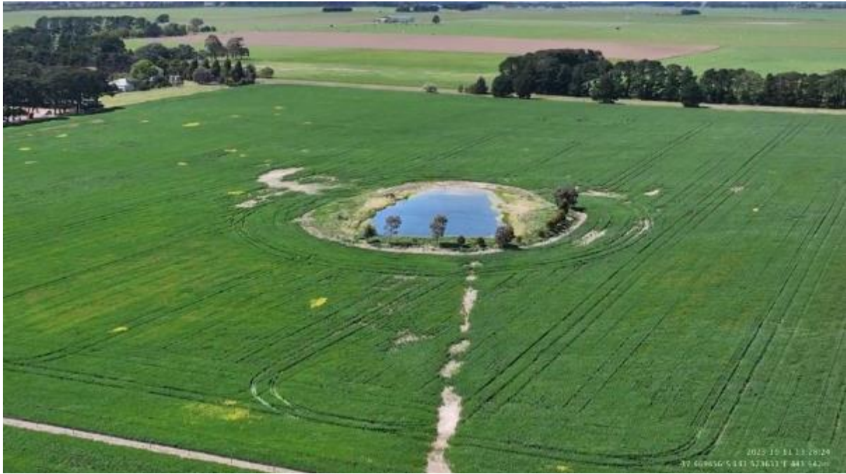
Appendix Plate 337. Waterbody 296; Low habitat quality (Ecology and Heritage Partners Pty Ltd 09/2023).