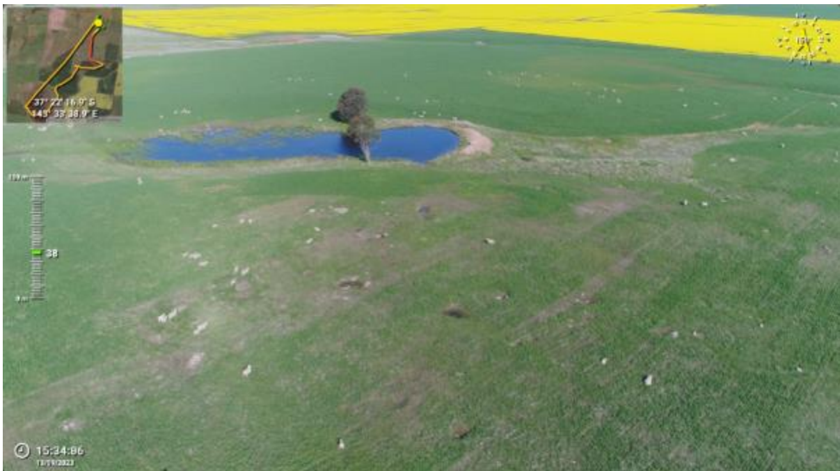
Appendix Plate 266. Waterbody 237; Moderate habitat quality (Ecology and Heritage Partners Pty Ltd 09/2023).