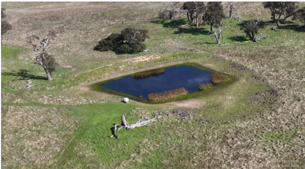
Appendix Plate 280. Waterbody 249; Low habitat quality.

This copied document to be made available for the sole purpose of enabling its consideration and review as part of a planning process under the Planning and Environment Act 1987. The document must not be used for any purpose which may breach any copyright