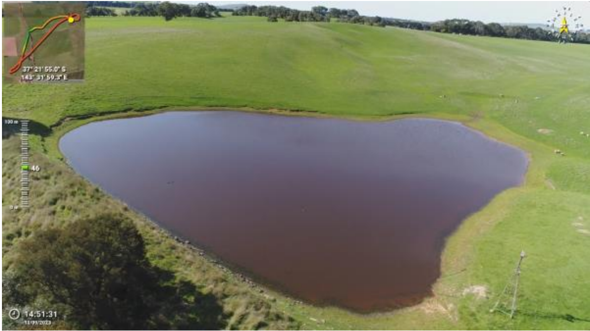
Appendix Plate 105. Waterbody 90; Low habitat quality (Ecology and Heritage Partners Pty Ltd 09/2023).