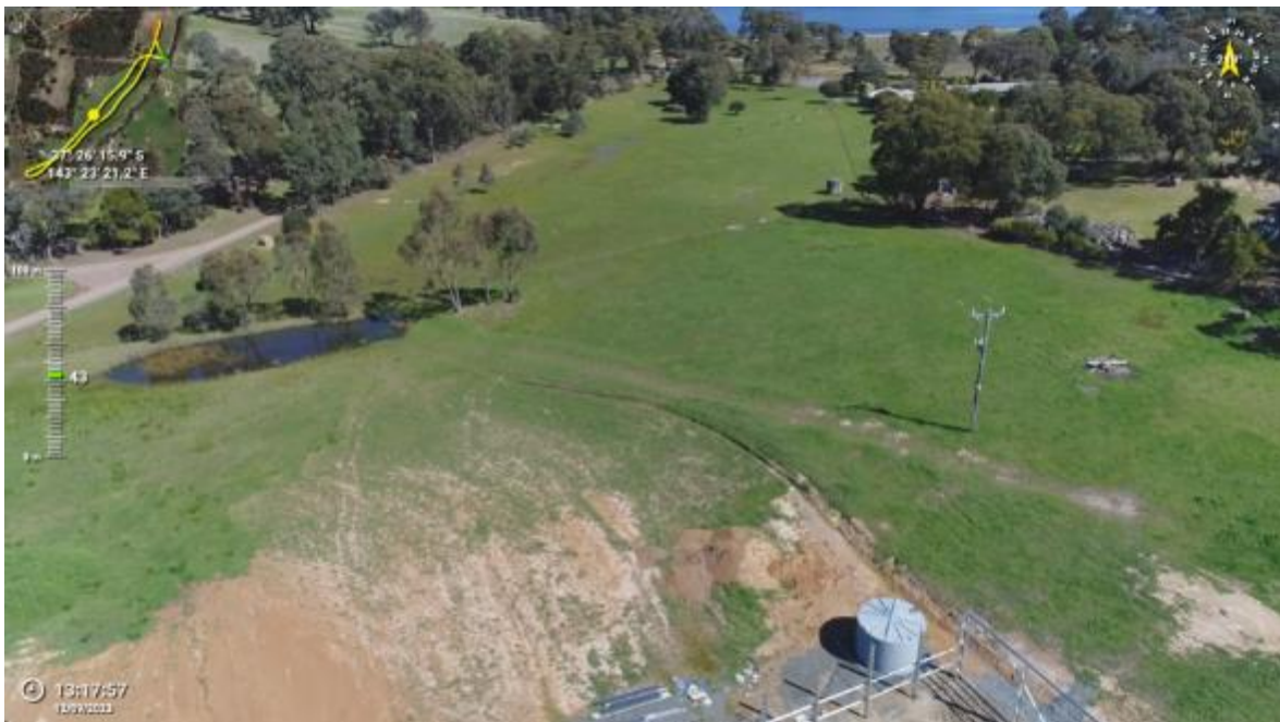
Appendix Plate 236. Waterbody 210; Low habitat quality (Ecology and Heritage Partners Pty Ltd 09/2023).

This copied document to be made available for the sole purpose of enabling its consideration and review as part of a planning process under the Planning and Environment Act 1987. The document must not be used for any purpose which may breach any copyright