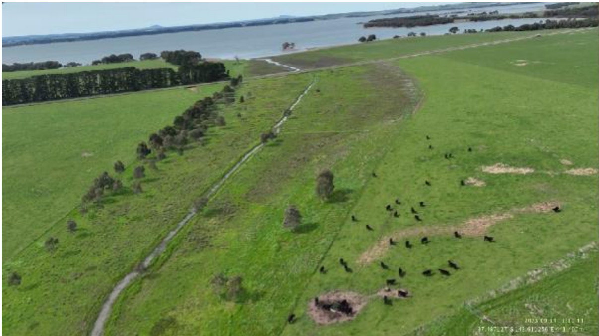
Appendix Plate 300. Waterbody 264; Low habitat quality (Ecology and Heritage Partners Pty Ltd 09/2023).

This copied document to be made available for the sole purpose of enabling its consideration and review as part of a planning process under the Planning and Environment Act 1987. The document must not be used for any purpose which may breach any copyright