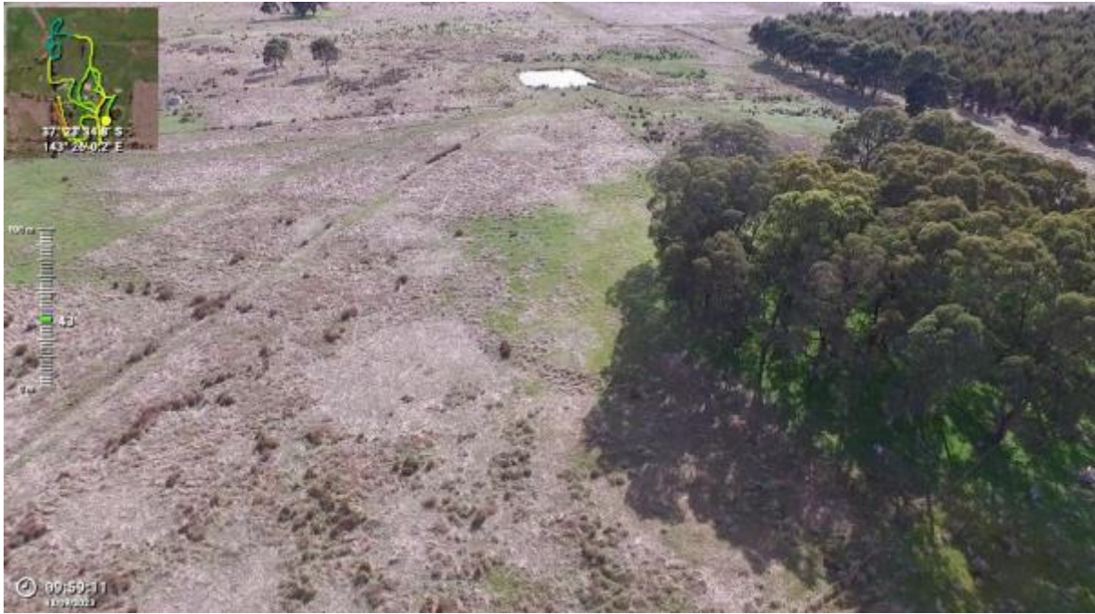
Appendix Plate 45. Waterbody 35; Low habitat quality (Ecology and Heritage Partners Pty Ltd 09/2023).