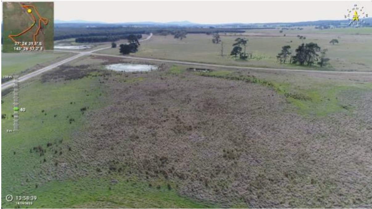
Appendix Plate 75. Waterbody 61; Moderate habitat quality (Ecology and Heritage Partners Pty Ltd 09/2023).