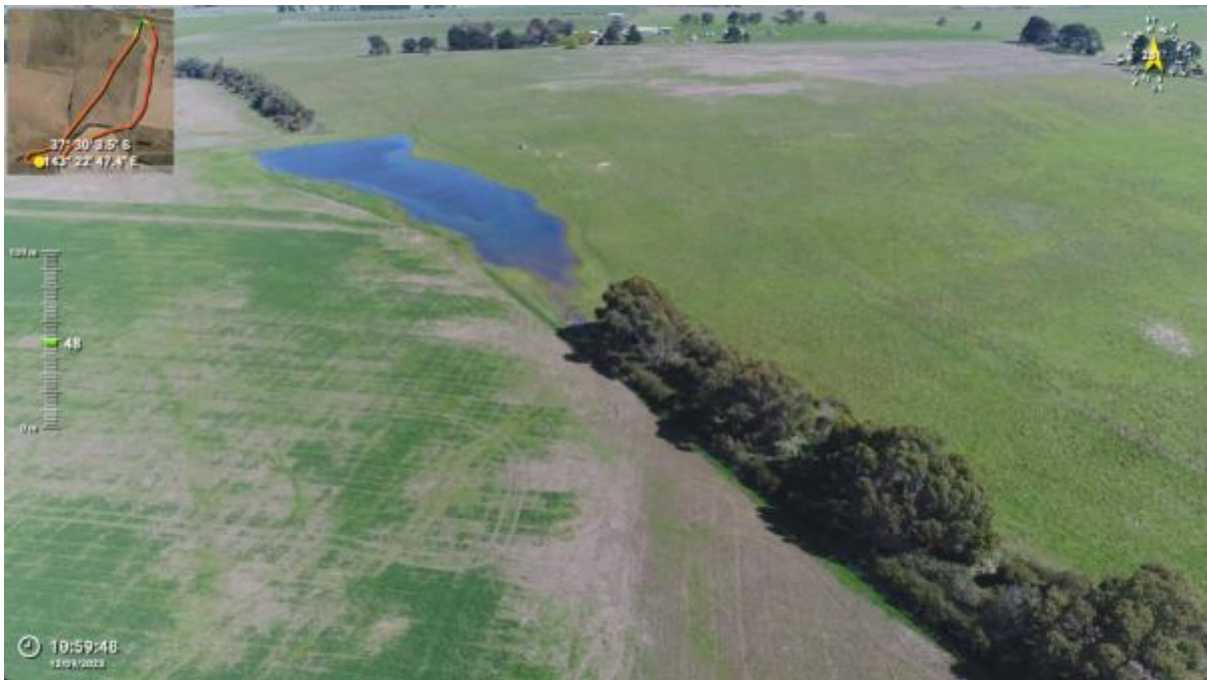
Appendix Plate 332. Waterbody 292; Low habitat quality.

This copied document to be made available for the sole purpose of enabling its consideration and review as part of a planning process under the Planning and Environment Act 1987. The document must not be used for any purpose which may breach any copyright