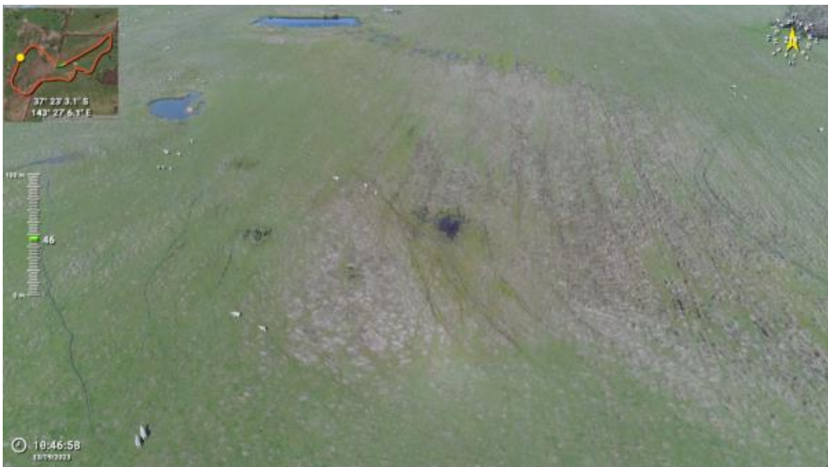
Appendix Plate 8. Waterbody 5; Low habitat quality.

This copied document to be made available for the sole purpose of enabling its consideration and review as part of a planning process under the Planning and Environment Act 1987. The document must not be used for any purpose which may breach any copyright