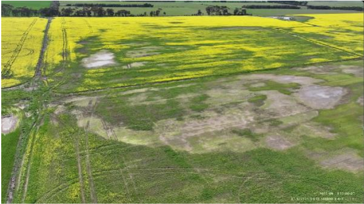
Appendix Plate 269. Waterbody 240; Low habitat quality (Ecology and Heritage Partners Pty Ltd 09/2023).