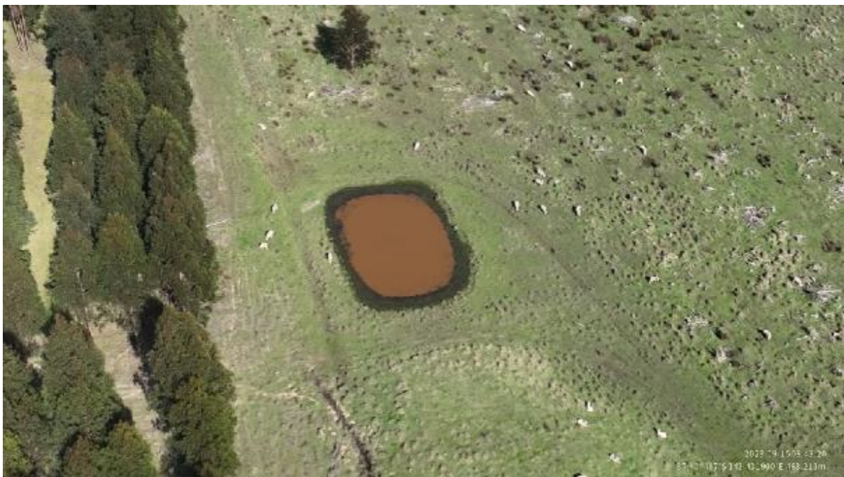
Appendix Plate 62. Waterbody 51; Low habitat quality.

This copied document to be made available for the sole purpose of enabling its consideration and review as part of a planning process under the Planning and Environment Act 1987. The document must not be used for any purpose which may breach any copyright