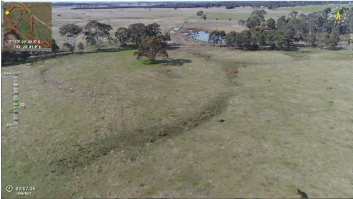
Appendix Plate 33. Waterbody 25; Low habitat quality.