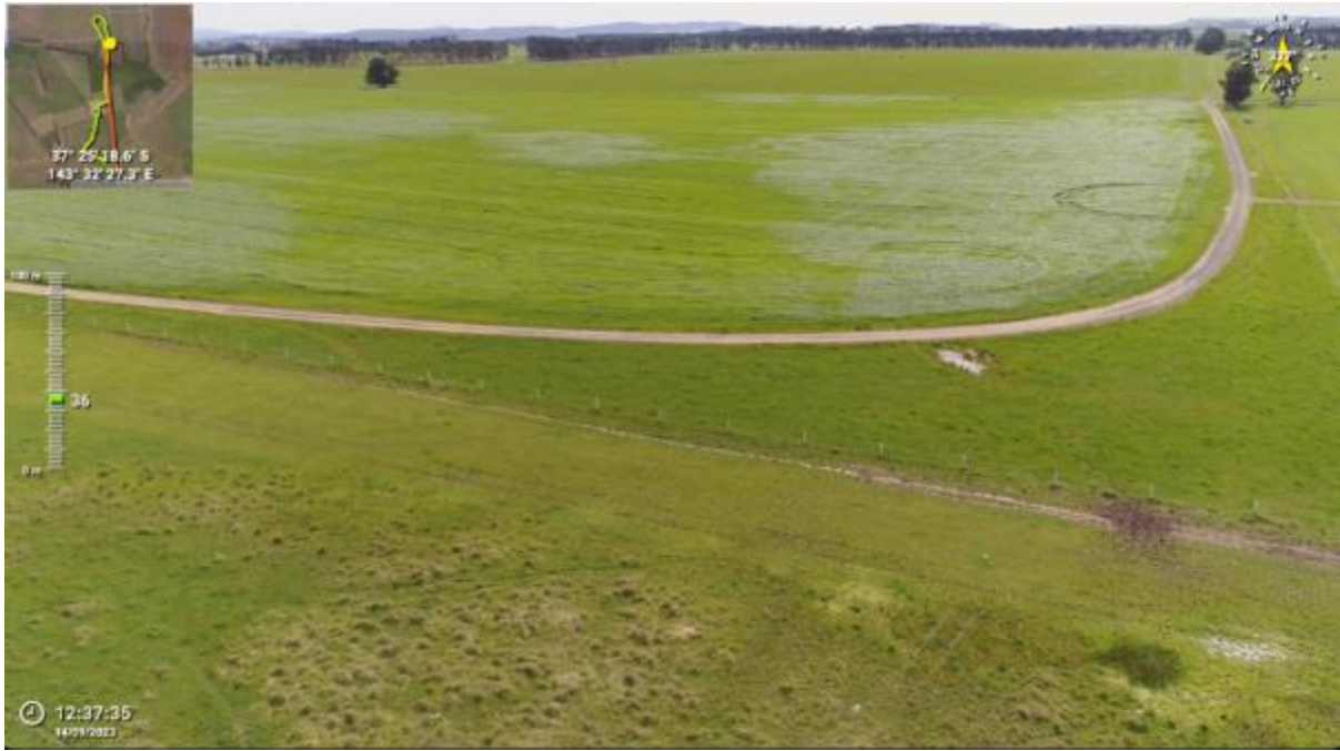
Appendix Plate 157. Waterbody 136; Low habitat quality (Ecology and Heritage Partners Pty Ltd 09/2023).