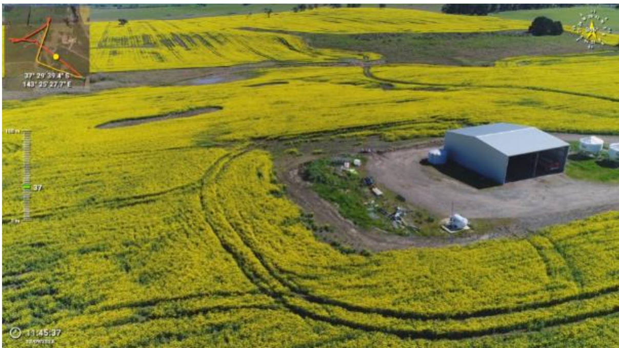
Appendix Plate 244. Waterbody 218; Low habitat quality.

This copied document to be made available for the sole purpose of enabling its consideration and review as part of a planning process under the Planning and Environment Act 1987. The document must not be used for any purpose which may breach any copyright