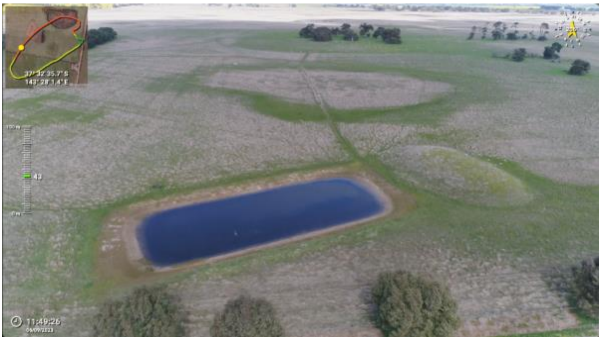
Appendix Plate 212. Waterbody 187; Low habitat quality (Ecology and Heritage Partners Pty Ltd 09/2023).

This copied document to be made available for the sole purpose of enabling its consideration and review as part of a planning process under the Planning and Environment Act 1987. The document must not be used for any purpose which may breach any copyright