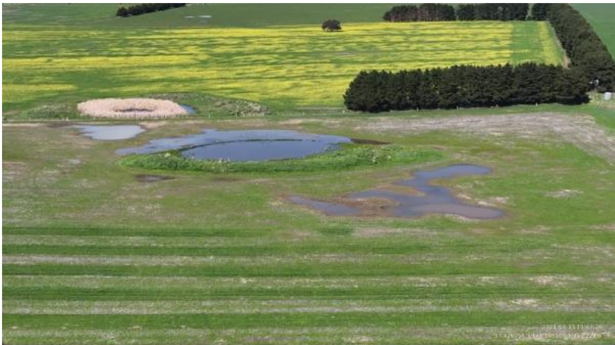
Appendix Plate 290. Waterbody 258; Moderate habitat quality (Ecology and Heritage Partners Pty Ltd 09/2023).