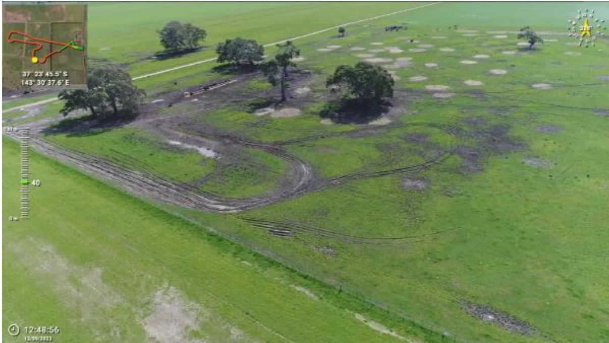
Appendix Plate 123. Waterbody 105; Low habitat quality (Ecology and Heritage Partners Pty Ltd 09/2023).