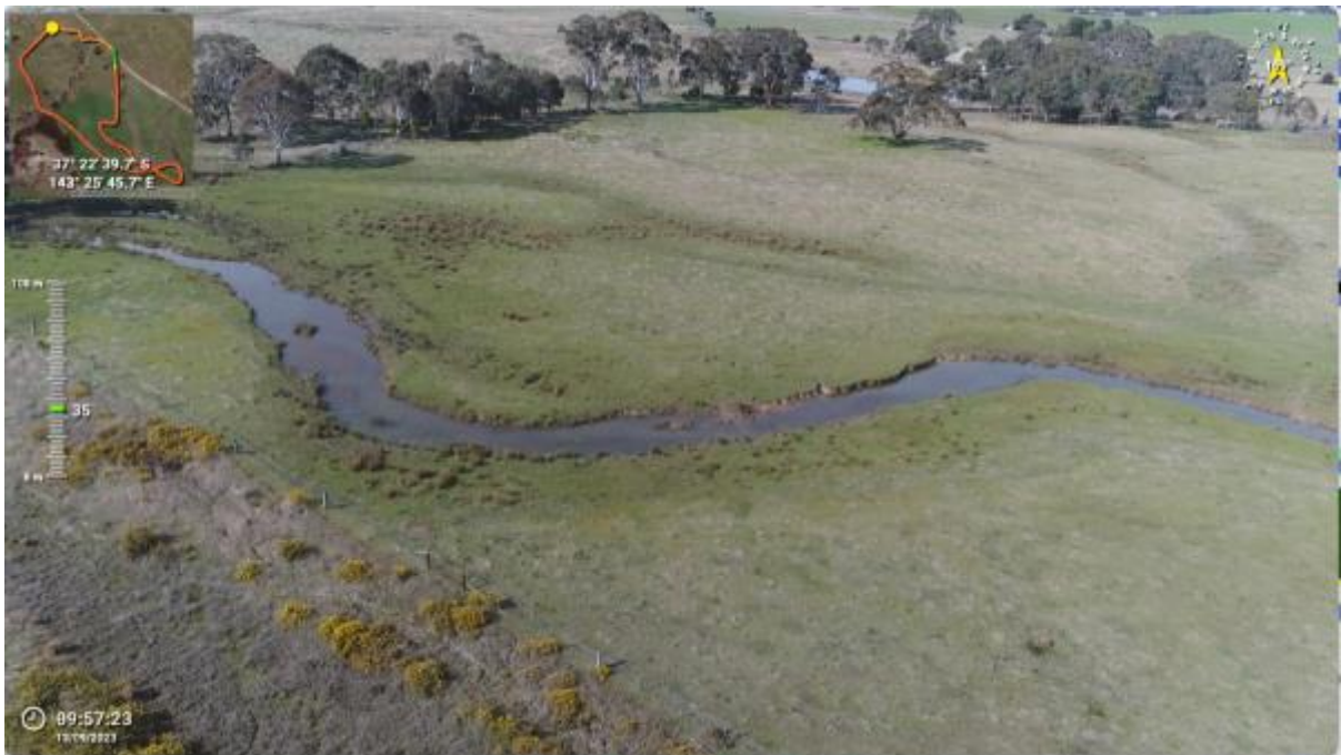
Appendix Plate 36. Waterbody 27; Moderate habitat quality.

This copied document to be made available for the sole purpose of enabling its consideration and review as part of a planning process under the Planning and Environment Act 1987. The document must not be used for any purpose which may breach any copyright