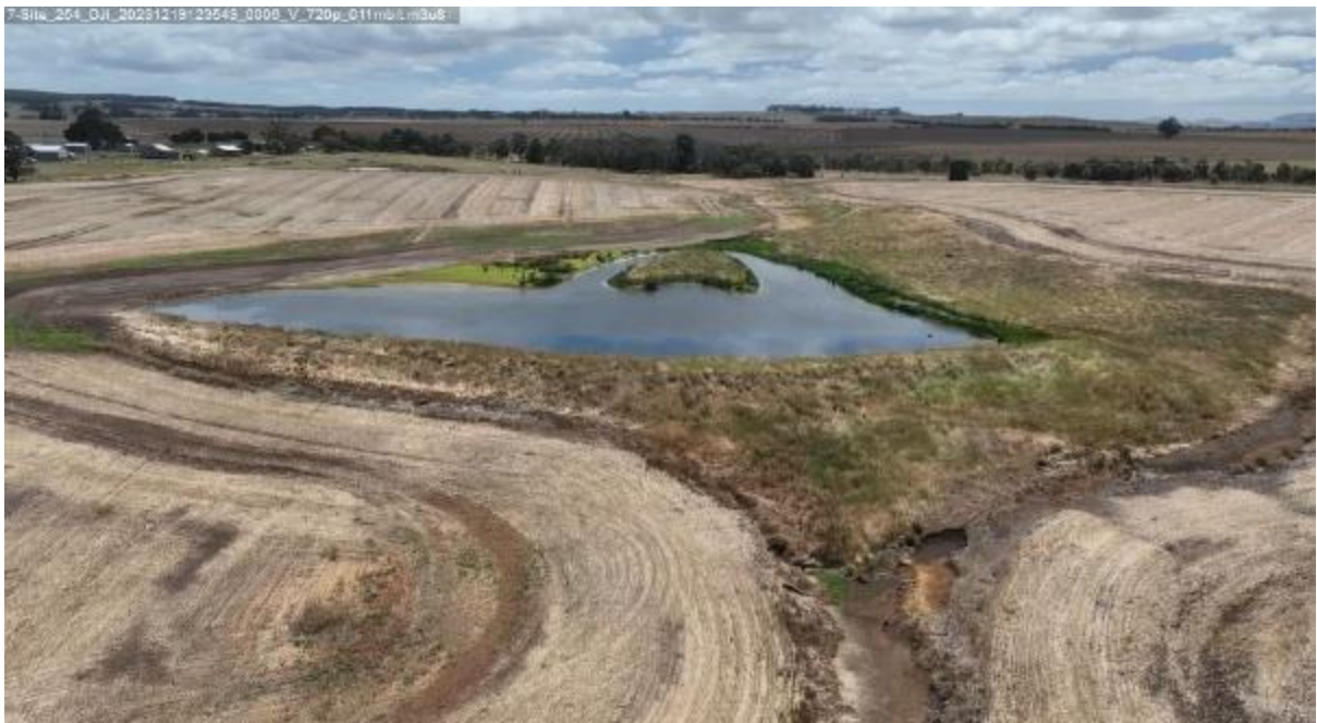
Appendix Plate 286. Waterbody 254; High habitat quality (Ecology and Heritage Partners Pty Ltd 09/2023).

This copied document to be made available for the sole purpose of enabling its consideration and review as part of a planning process under the Planning and Environment Act 1987. The document must not be used for any purpose which may breach any copyright