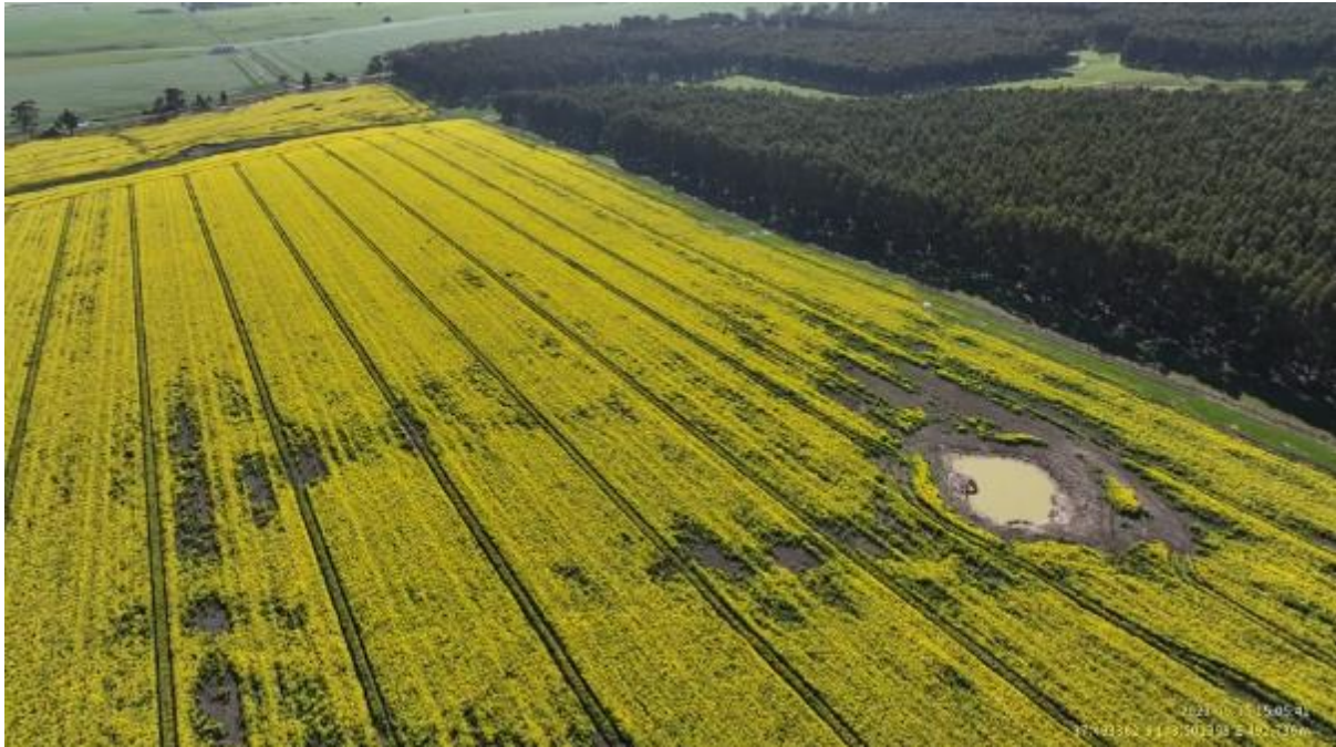
Appendix Plate 215. Waterbody 190; Low habitat quality (Ecology and Heritage Partners Pty Ltd 09/2023).