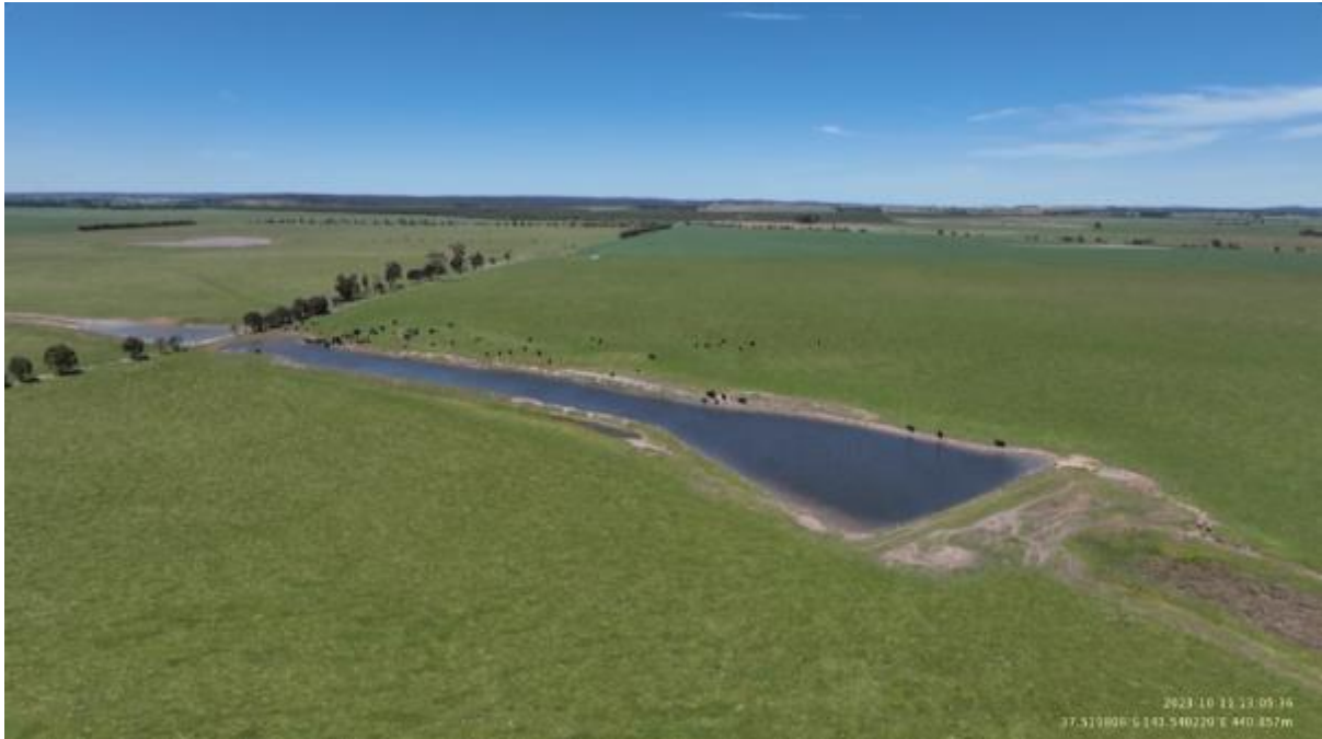
Appendix Plate 189. Waterbody 164; Low habitat quality (Ecology and Heritage Partners Pty Ltd 09/2023).