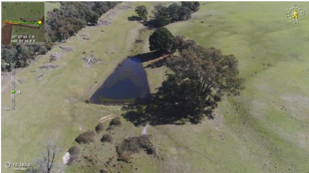
Appendix Plate 224. Waterbody 200; Low habitat quality (Ecology and Heritage Partners Pty Ltd 09/2023).

This copied document to be made available for the sole purpose of enabling its consideration and review as part of a planning process under the Planning and Environment Act 1987. The document must not be used for any purpose which may breach any copyright