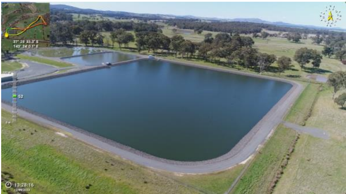
Appendix Plate 206. Waterbody 182; Low habitat quality (Ecology and Heritage Partners Pty Ltd 09/2023).

This copied document to be made available for the sole purpose of enabling its consideration and review as part of a planning process under the Planning and Environment Act 1987. The document must not be used for any purpose which may breach any copyright