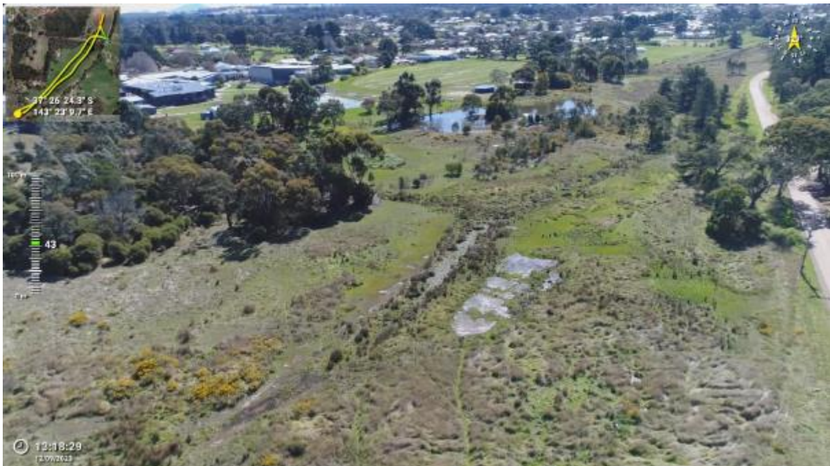
Appendix Plate 334. Waterbody 293; Moderate habitat quality (Ecology and Heritage Partners Pty Ltd 09/2023).