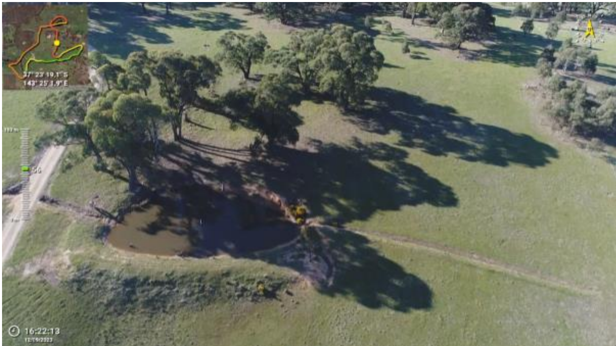
Appendix Plate 38. Waterbody 30; Low habitat quality (Ecology and Heritage Partners Pty Ltd 09/2023).

This copied document to be made available for the sole purpose of enabling its consideration and review as part of a planning process under the Planning and Environment Act 1987. The document must not be used for any purpose which may breach any copyright