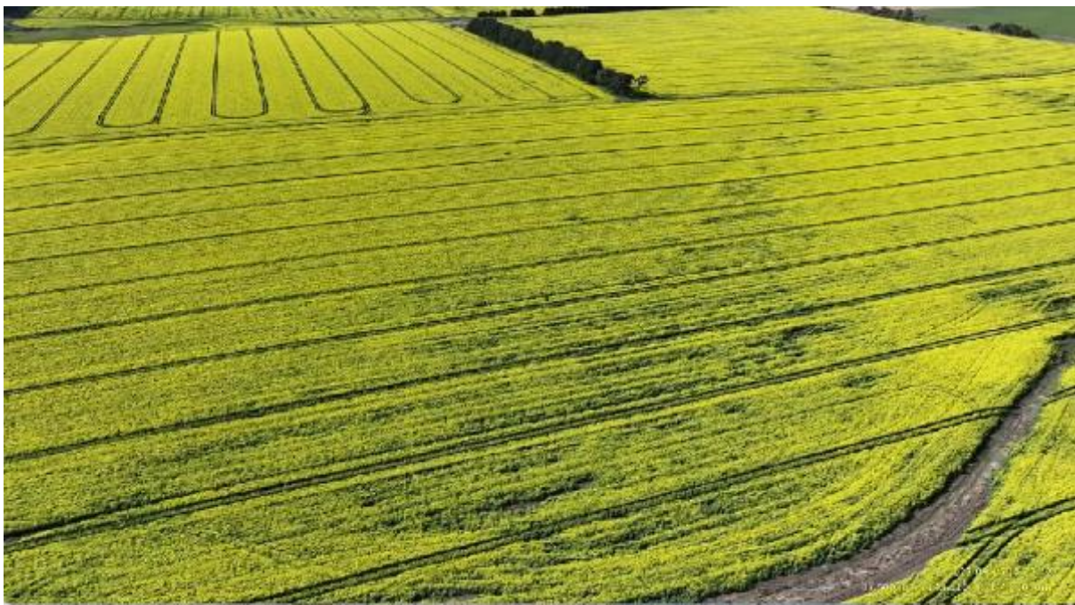
Appendix Plate 260. Waterbody 233; Low habitat quality (Ecology and Heritage Partners Pty Ltd 09/2023).

This copied document to be made available for the sole purpose of enabling its consideration and review as part of a planning process under the Planning and Environment Act 1987. The document must not be used for any purpose which may breach any copyright