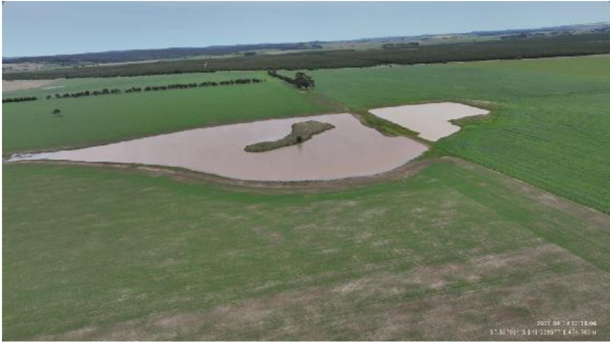
Appendix Plate 203. Waterbody 179; Low habitat quality.