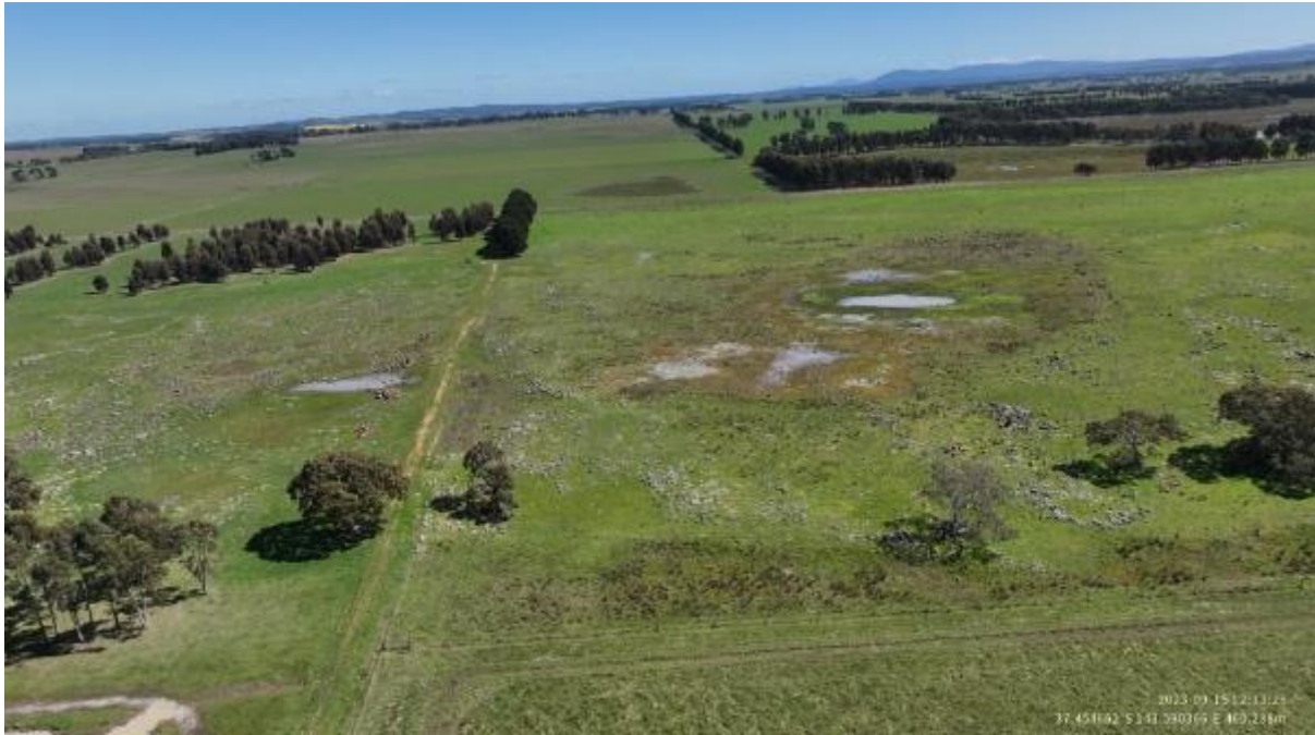
Appendix Plate 295. Waterbody 261; Moderate habitat quality (Ecology and Heritage Partners Pty Ltd 09/2023).