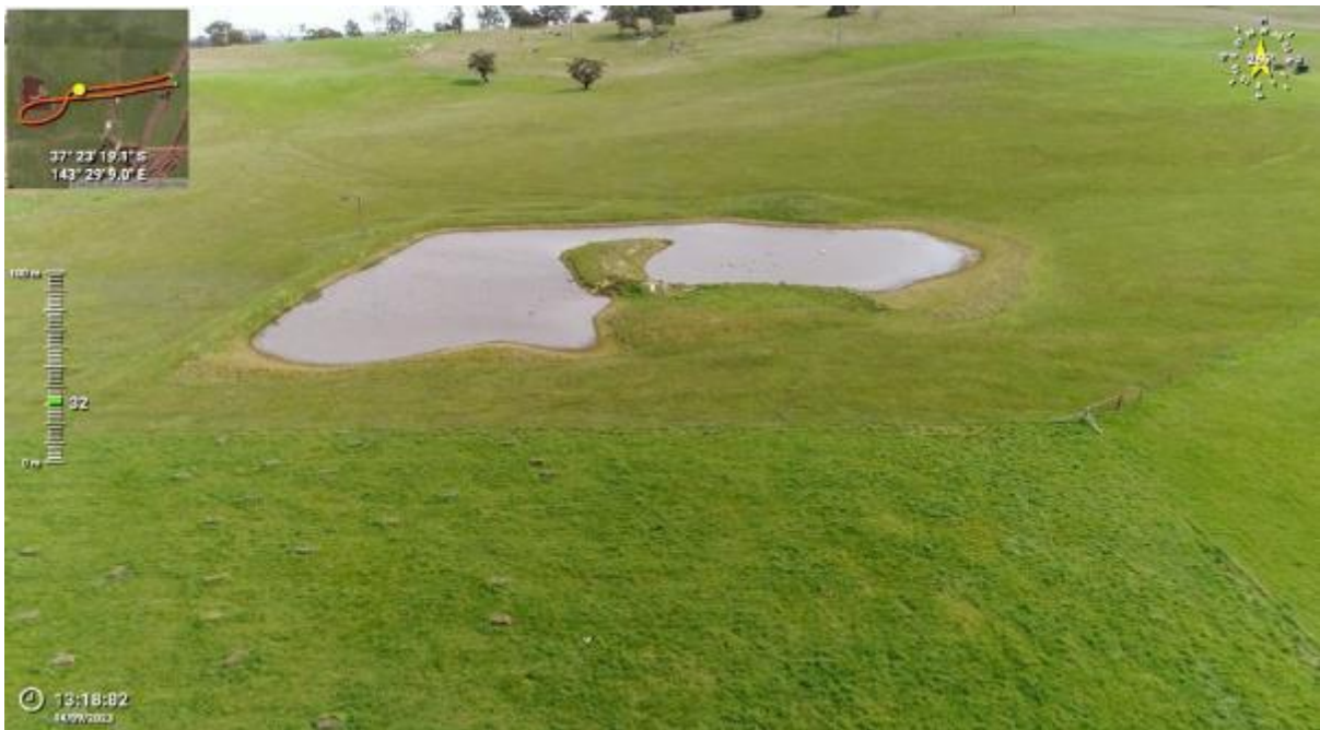
Appendix Plate 84. Waterbody 70; Low habitat quality (Ecology and Heritage Partners Pty Ltd 09/2023).

This copied document to be made available for the sole purpose of enabling its consideration and review as part of a planning process under the Planning and Environment Act 1987. The document must not be used for any purpose which may breach any copyright