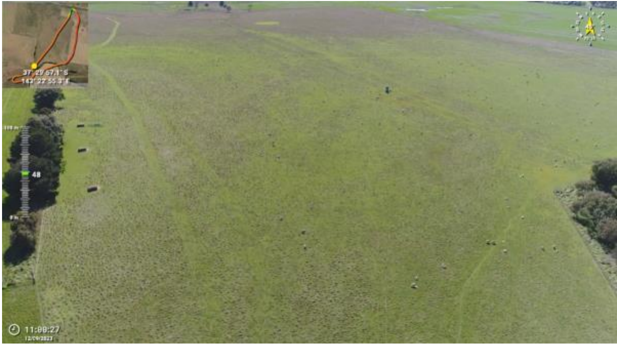
Appendix Plate 333. Waterbody 292; Low habitat quality (Ecology and Heritage Partners Pty Ltd 09/2023).