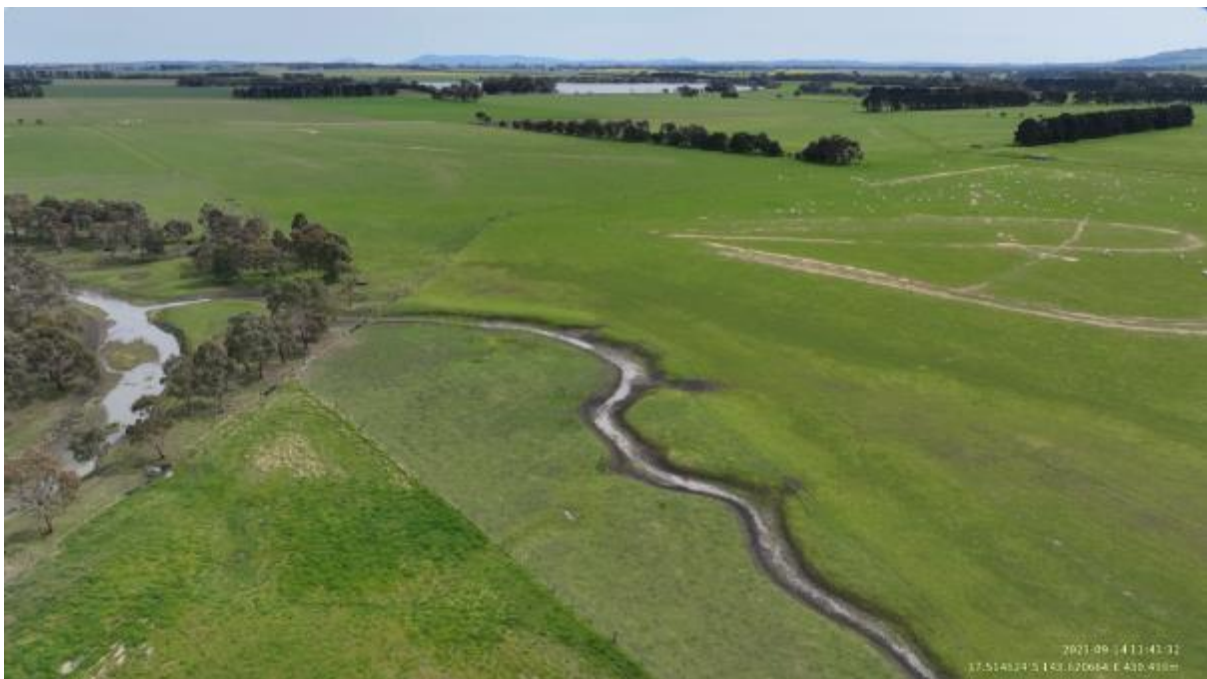
Appendix Plate 210. Waterbody 186; Moderate habitat quality (Ecology and Heritage Partners Pty Ltd 09/2023).