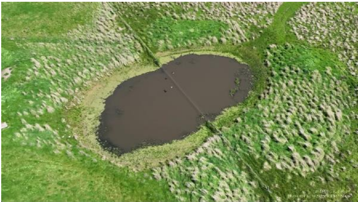
Appendix Plate 162. Waterbody 140; Low habitat quality (Ecology and Heritage Partners Pty Ltd 09/2023).

This copied document to be made available for the sole purpose of enabling its consideration and review as part of a planning process under the Planning and Environment Act 1987. The document must not be used for any purpose which may breach any copyright