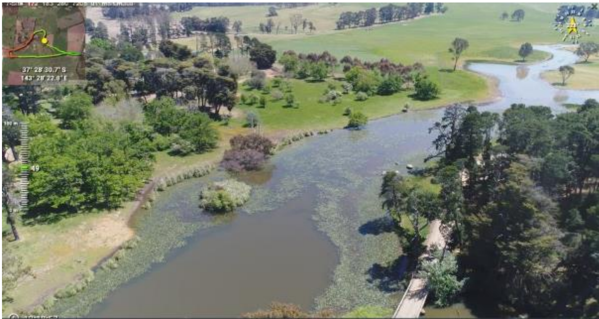
Appendix Plate 320. Waterbody 280; High habitat quality (Ecology and Heritage Partners Pty Ltd 09/2023).

This copied document to be made available for the sole purpose of enabling its consideration and review as part of a planning process under the Planning and Environment Act 1987. The document must not be used for any purpose which may breach any copyright