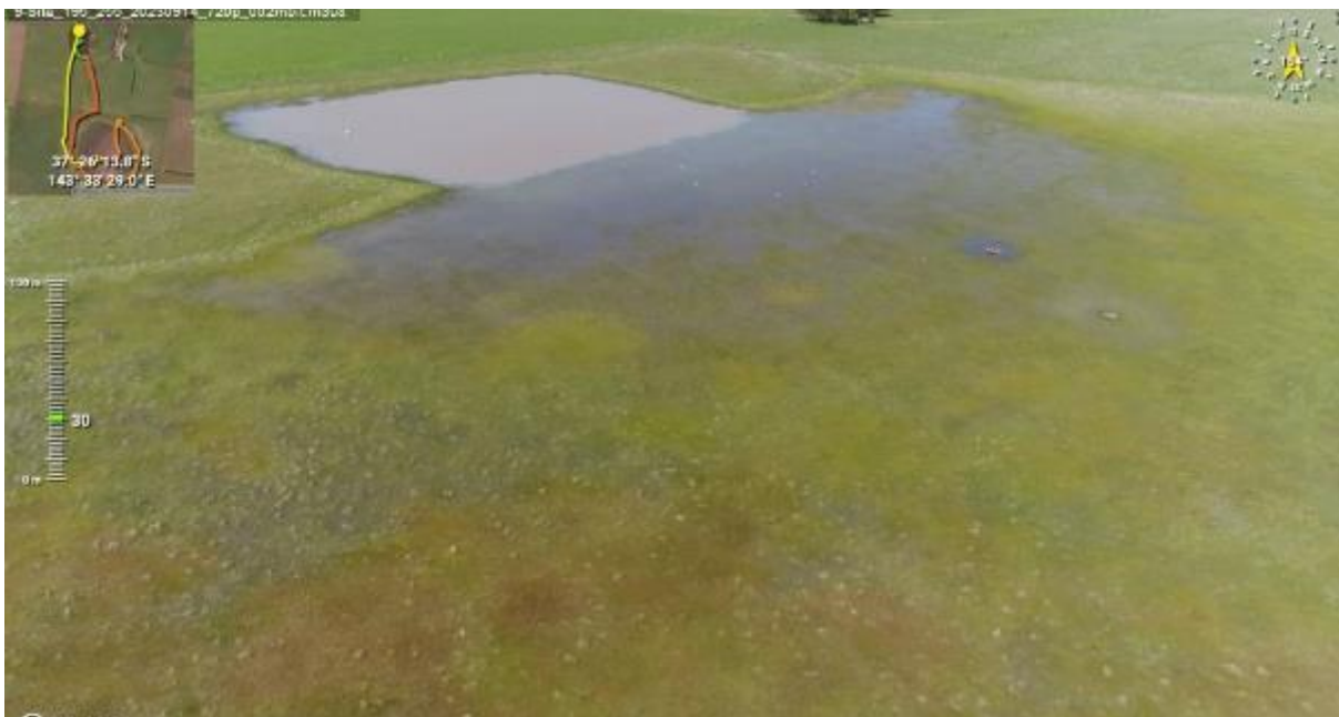
Appendix Plate 220. Waterbody 195; Moderate habitat quality (Ecology and Heritage Partners Pty Ltd 09/2023).