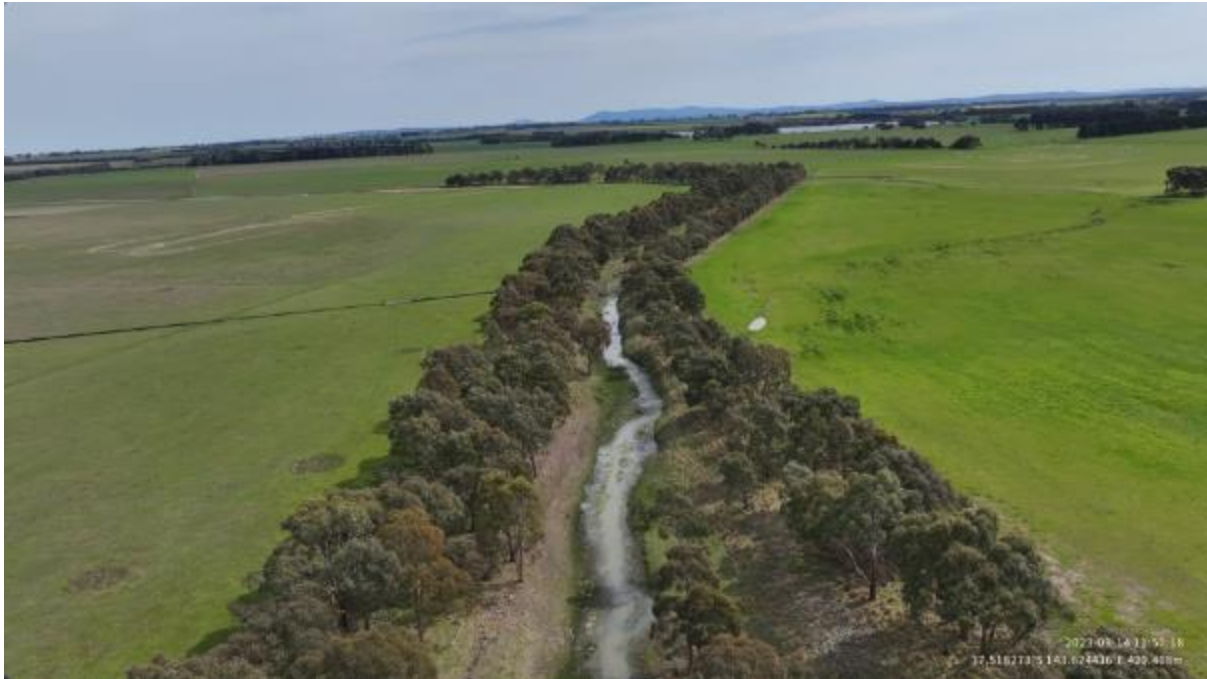
Appendix Plate 211. Waterbody 186; Moderate habitat quality (Ecology and Heritage Partners Pty Ltd 09/2023).