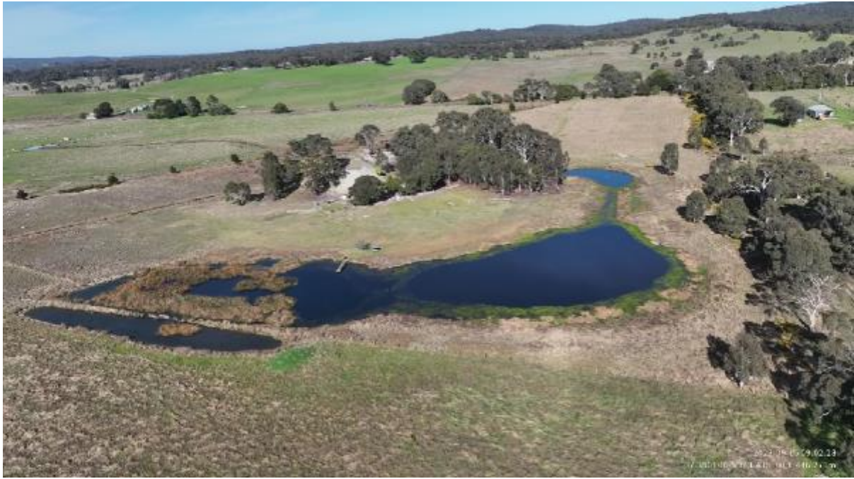
Appendix Plate 35. Waterbody 27; Moderate habitat quality (Ecology and Heritage Partners Pty Ltd 09/2023).