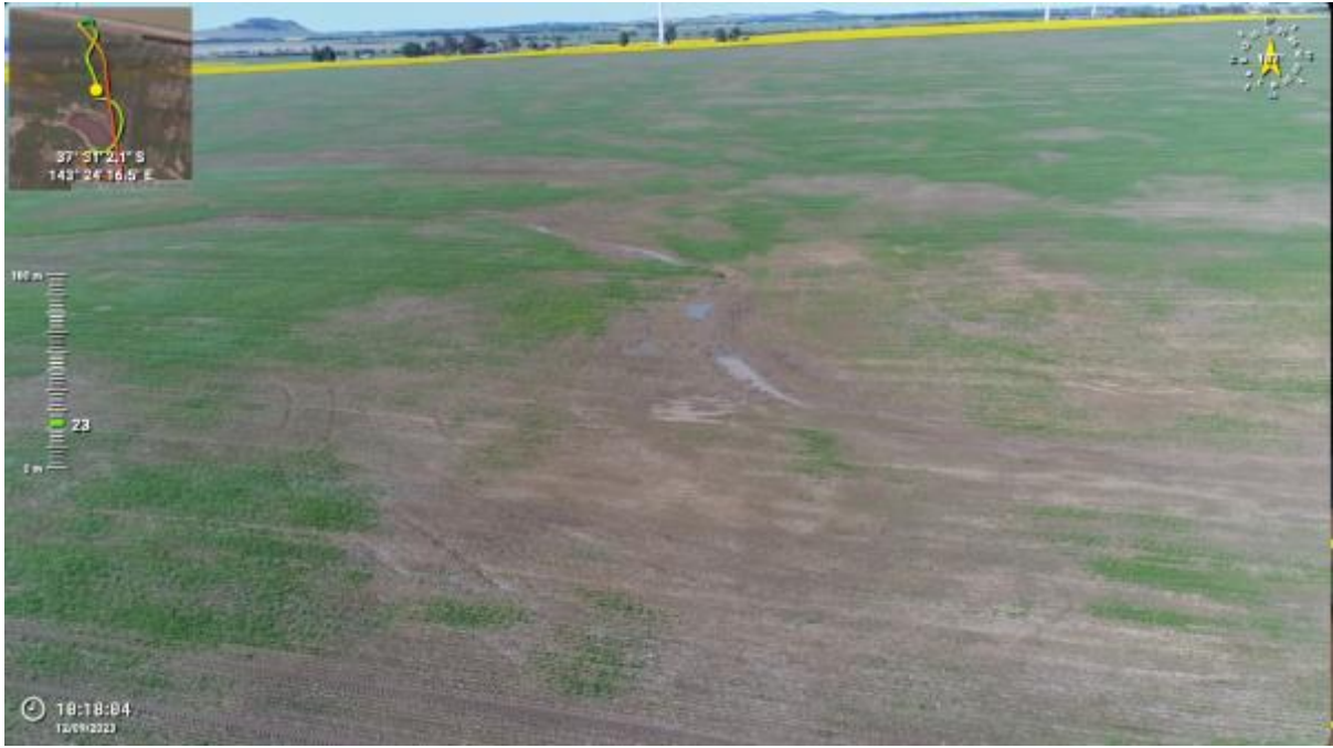
Appendix Plate 331. Waterbody 291; Low habitat quality (Ecology and Heritage Partners Pty Ltd 09/2023).