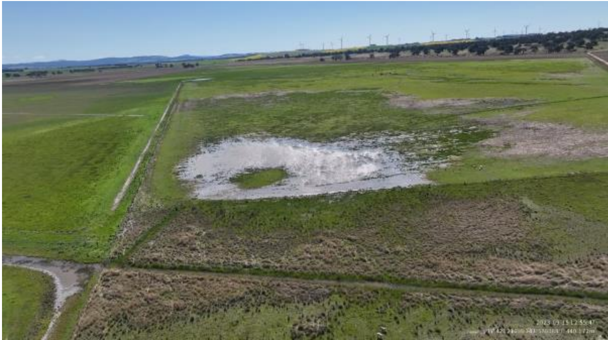
Appendix Plate 147. Waterbody 128; Moderate habitat quality (Ecology and Heritage Partners Pty Ltd 09/2023).