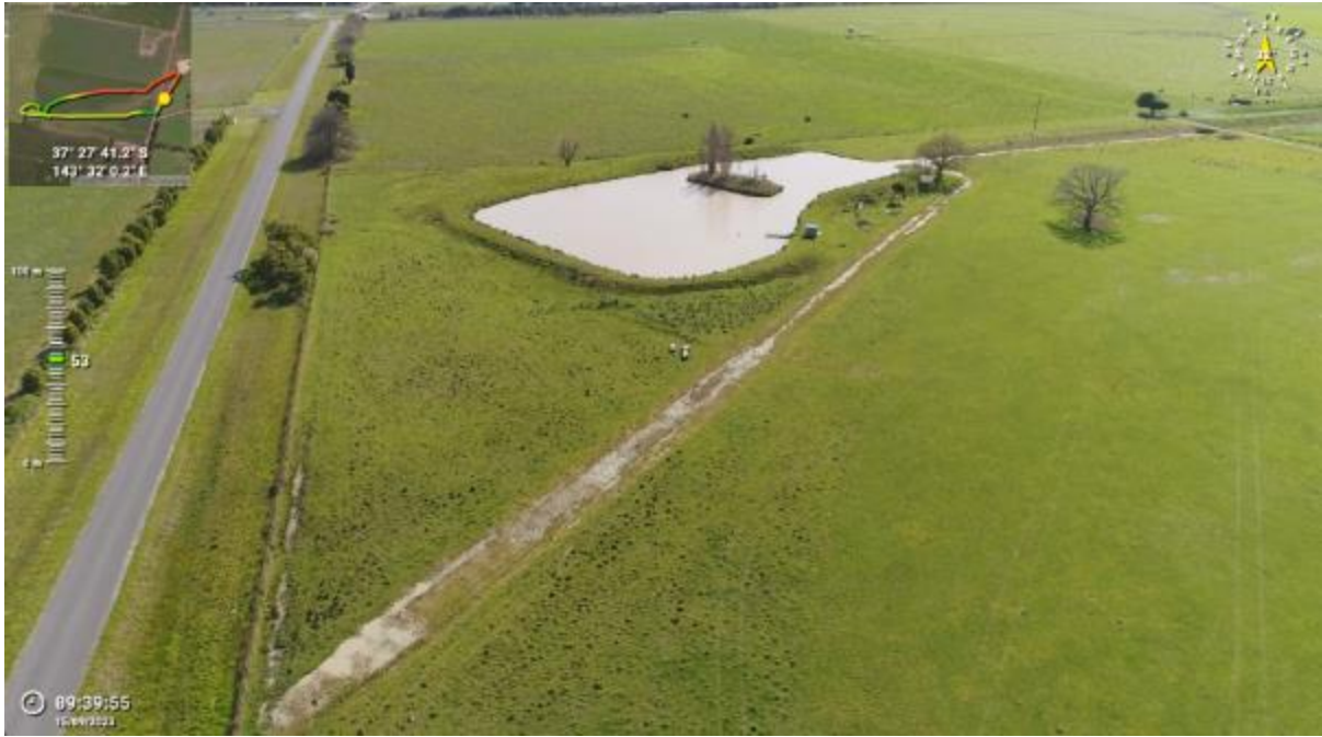
Appendix Plate 145. Waterbody 126; Low habitat quality (Ecology and Heritage Partners Pty Ltd 09/2023).