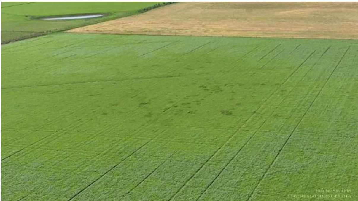
Appendix Plate 160. Waterbody 138; Low habitat quality (Ecology and Heritage Partners Pty Ltd 09/2023).

This copied document to be made available for the sole purpose of enabling its consideration and review as part of a planning process under the Planning and Environment Act 1987. The document must not be used for any purpose which may breach any copyright