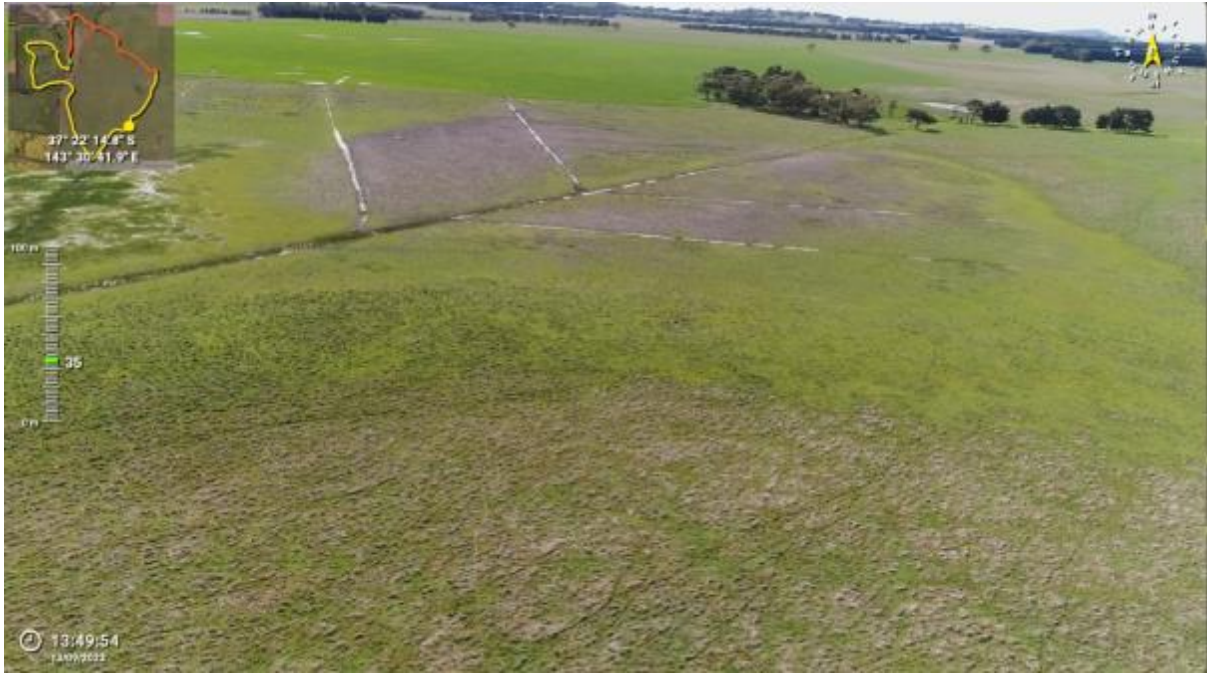
Appendix Plate g1. Waterbody 76; Low habitat quality (Ecology and Heritage Partners Pty Ltd 09/2023).