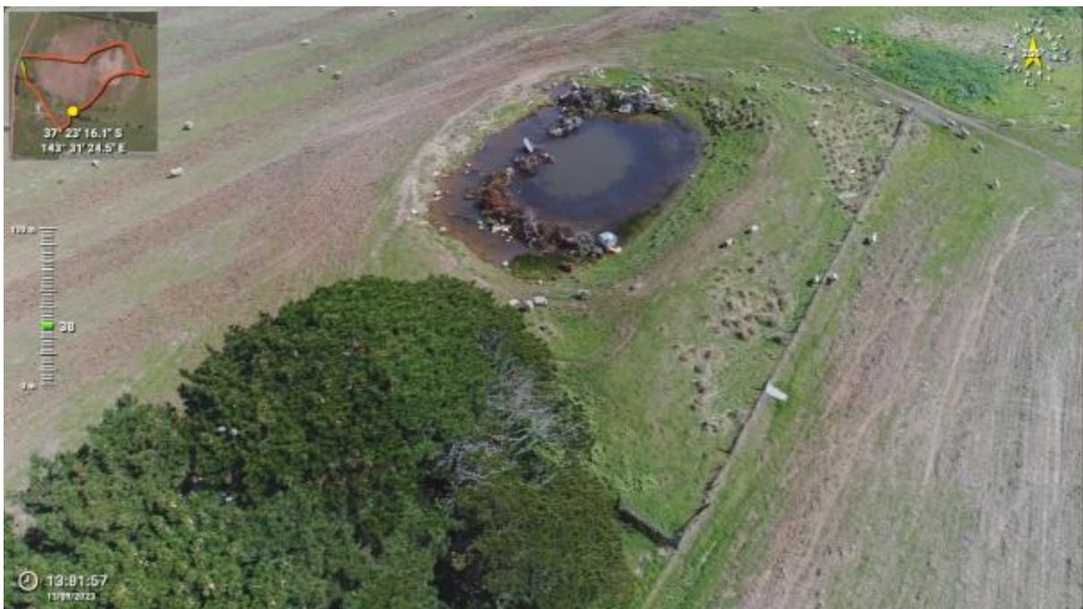
Appendix Plate 120. Waterbody 103; Low habitat quality (Ecology and Heritage Partners Pty Ltd 09/2023).

This copied document to be made available for the sole purpose of enabling its consideration and review as part of a planning process under the Planning and Environment Act 1987. The document must not be used for any purpose which may breach any copyright