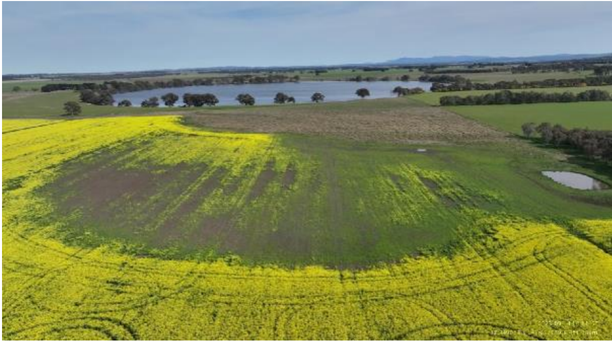
Appendix Plate 175. Waterbody 150; Low habitat quality (Ecology and Heritage Partners Pty Ltd 09/2023).