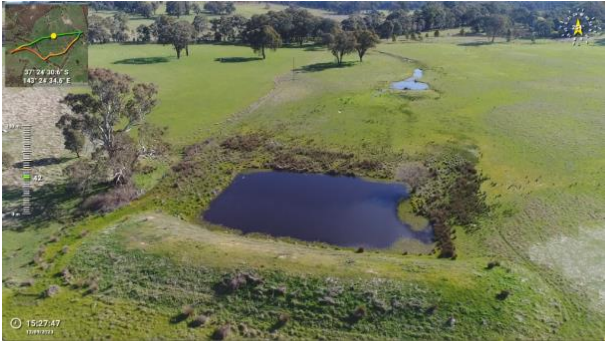
Appendix Plate 69. Waterbody 55; Low habitat quality (Ecology and Heritage Partners Pty Ltd 09/2023).