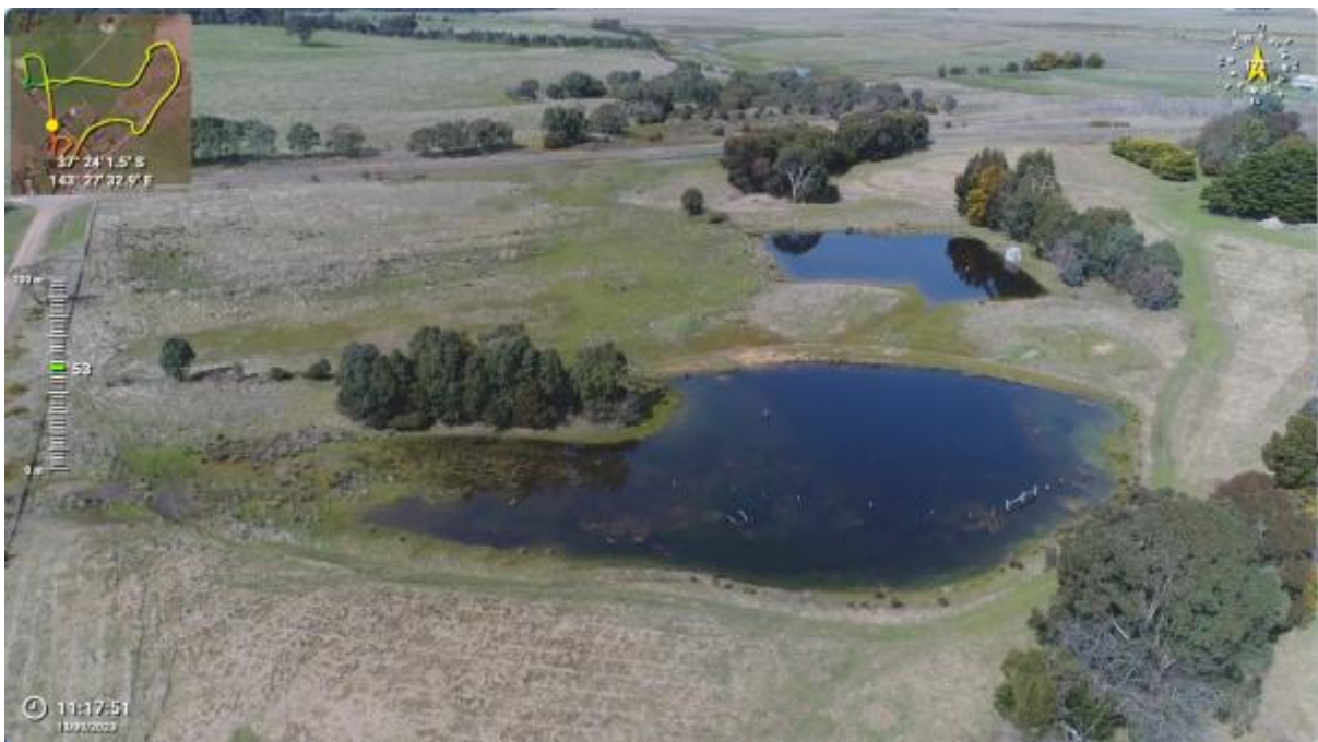
Appendix Plate 78. Waterbody 64; Moderate habitat quality (Ecology and Heritage Partners Pty Ltd 09/2023).

This copied document to be made available for the sole purpose of enabling its consideration and review as part of a planning process under the Planning and Environment Act 1987. The document must not be used for any purpose which may breach any copyright