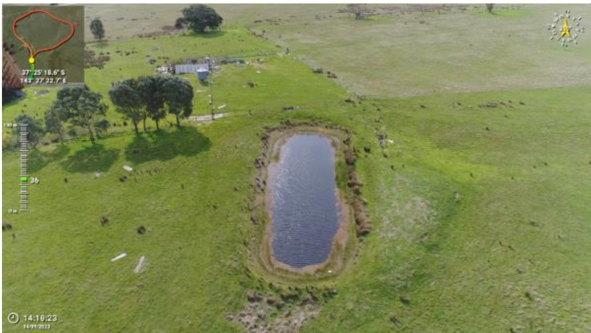
Appendix Plate 128. Waterbody 110; Low habitat quality.

This copied document to be made available for the sole purpose of enabling its consideration and review as part of a planning process under the Planning and Environment Act 1987. The document must not be used for any purpose which may breach any copyright