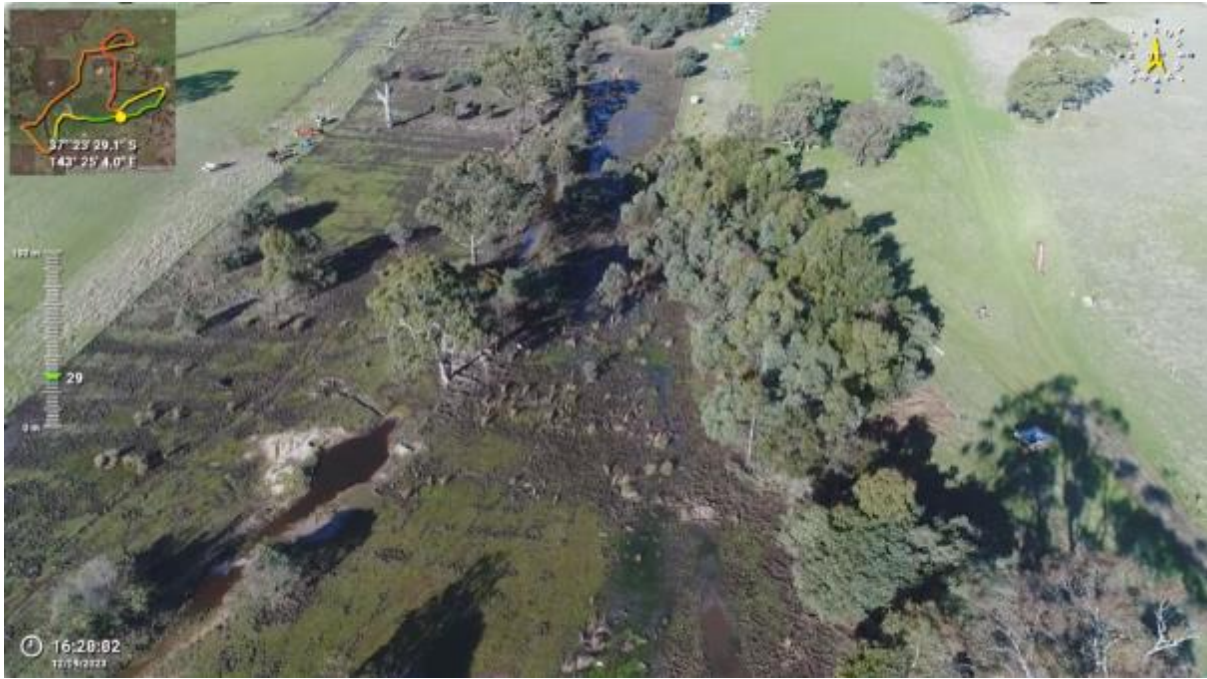
Appendix Plate 39. Waterbody 31; Moderate habitat quality.