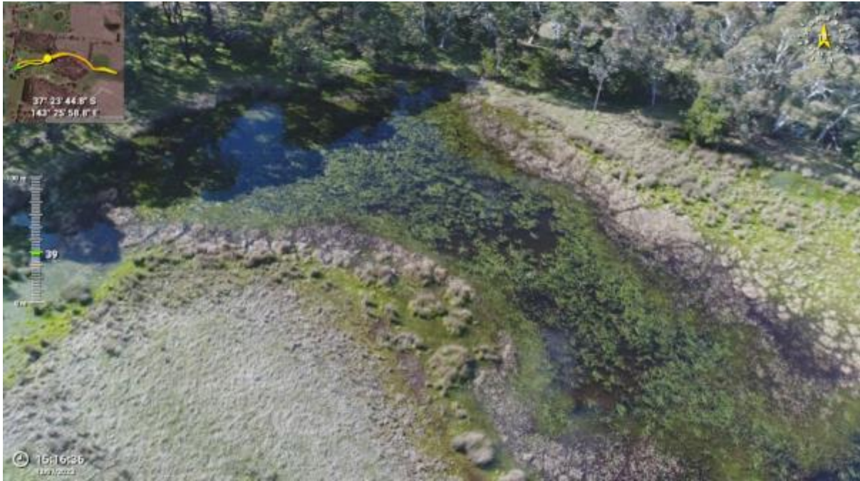
Appendix Plate 3. Waterbody 2; High habitat quality (Ecology and Heritage Partners Pty Ltd 09/2023).