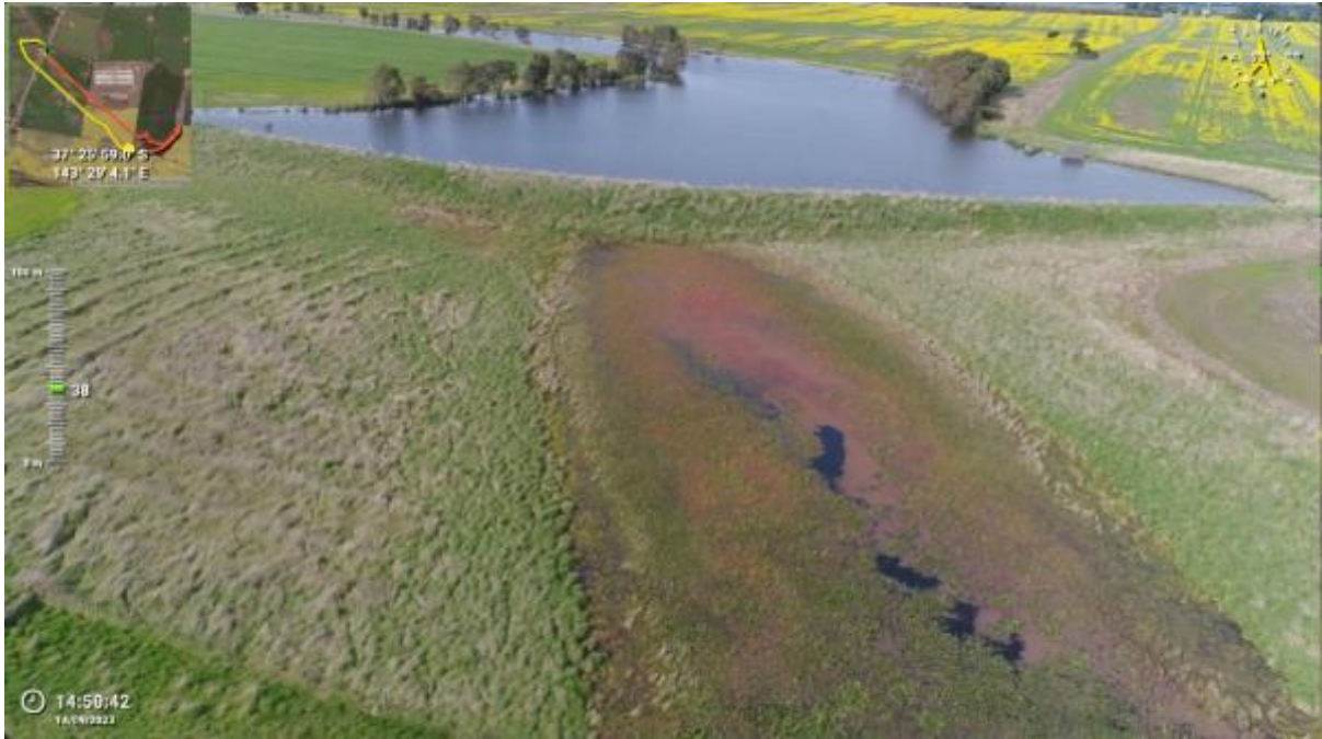
Appendix Plate 325. Waterbody 285; High habitat quality (Ecology and Heritage Partners Pty Ltd 09/2023).