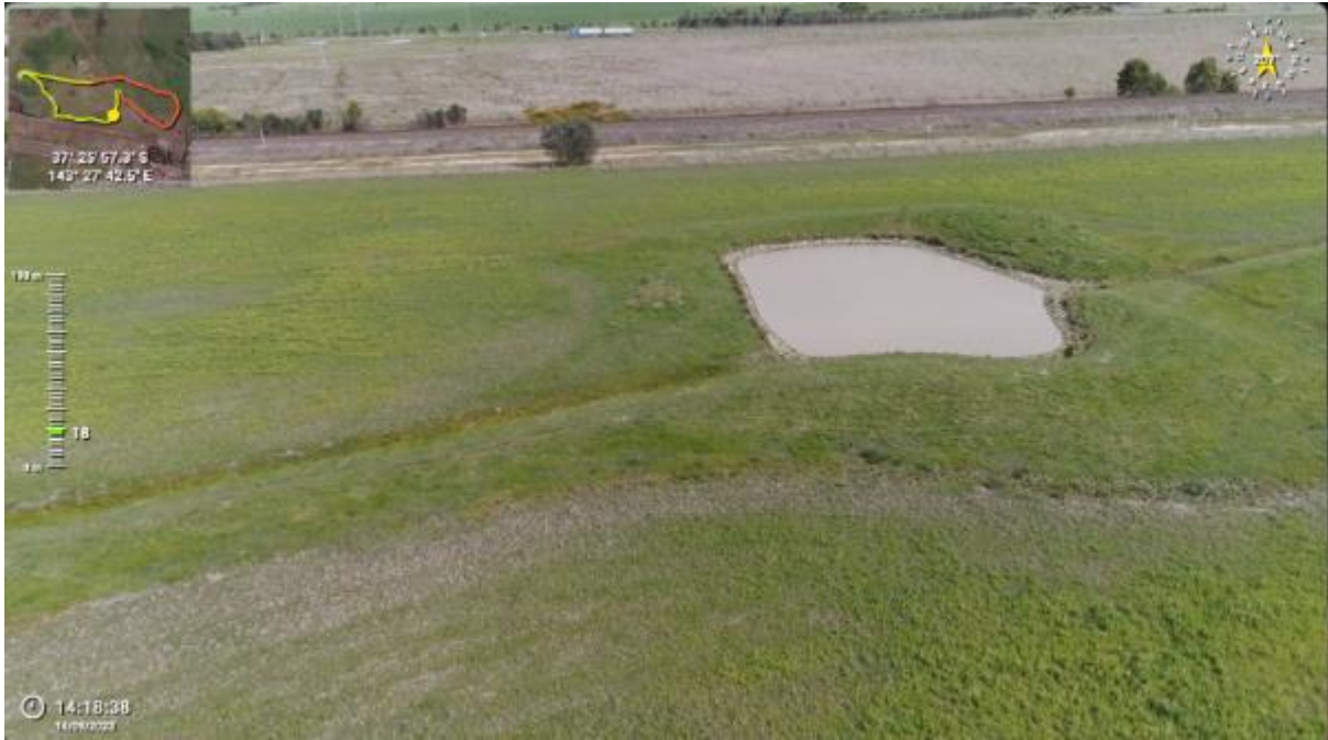
Appendix Plate 131. Waterbody 112; Low habitat quality.