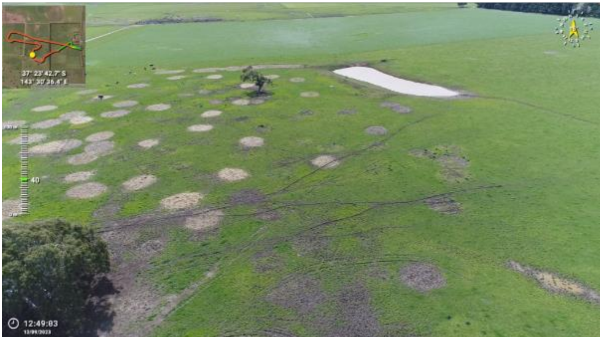
Appendix Plate 122. Waterbody 105; Low habitat quality (Ecology and Heritage Partners Pty Ltd 09/2023).

This copied document to be made available for the sole purpose of enabling its consideration and review as part of a planning process under the Planning and Environment Act 1987. The document must not be used for any purpose which may breach any copyright