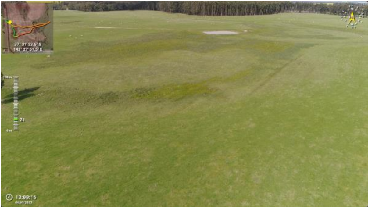
Appendix Plate 167. Waterbody 142; Low habitat quality (Ecology and Heritage Partners Pty Ltd 09/2023).