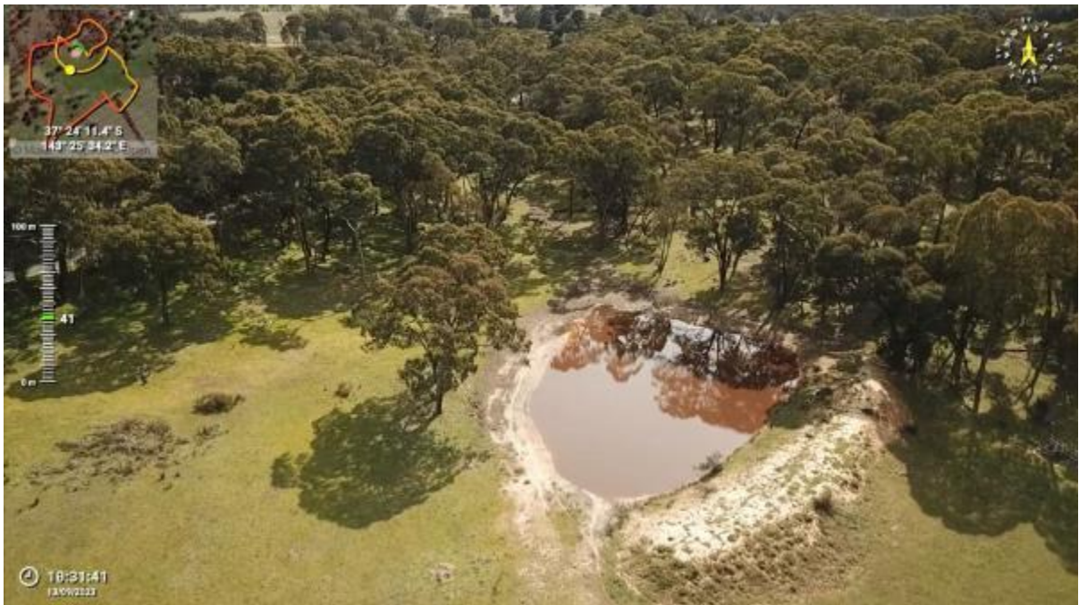
Appendix Plate 64. Waterbody 53; Low habitat quality (Ecology and Heritage Partners Pty Ltd 09/2023).

This copied document to be made available for the sole purpose of enabling its consideration and review as part of a planning process under the Planning and Environment Act 1987. The document must not be used for any purpose which may breach any copyright