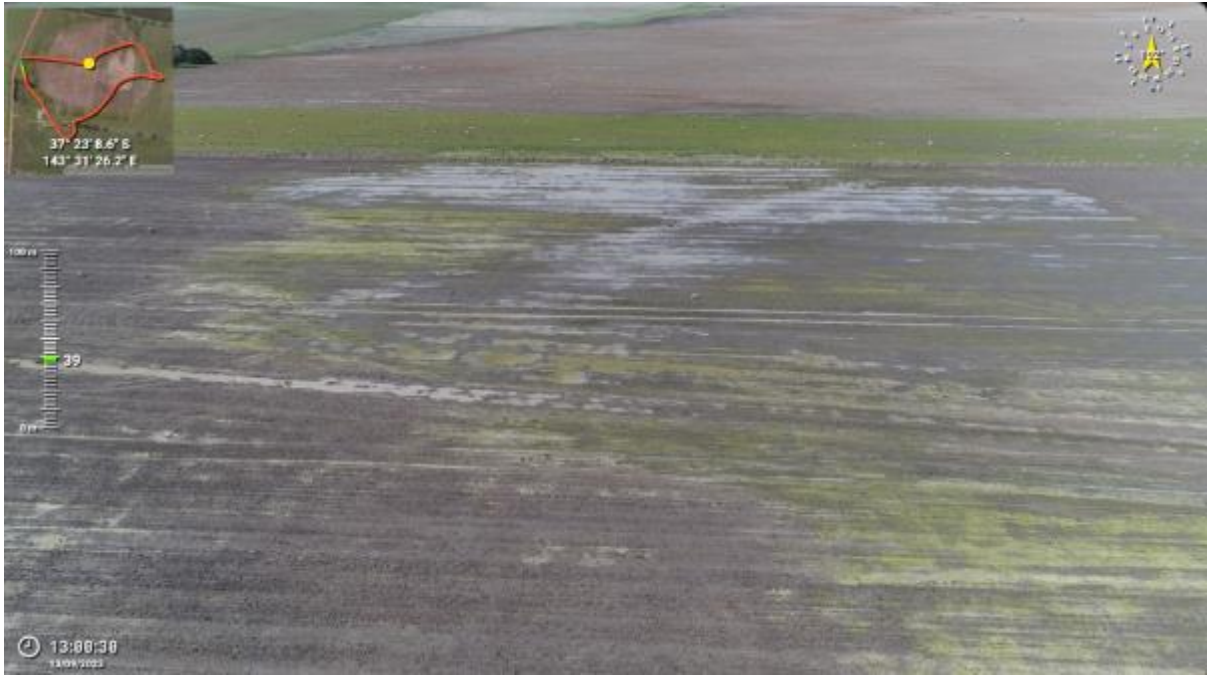
Appendix Plate 225. Waterbody 201; Low habitat quality (Ecology and Heritage Partners Pty Ltd 09/2023).