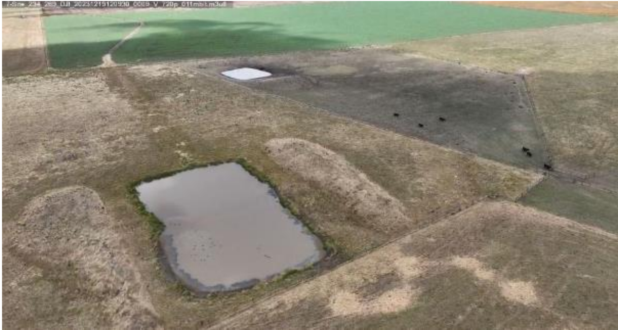
Appendix Plate 305. Waterbody 269; Low habitat quality (Ecology and Heritage Partners Pty Ltd 12/2023).