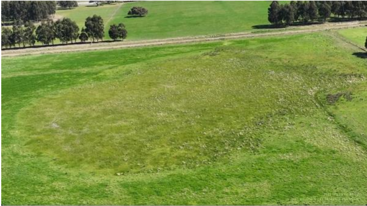
Appendix Plate 163. Waterbody 140; Low habitat quality (Ecology and Heritage Partners Pty Ltd 09/2023).