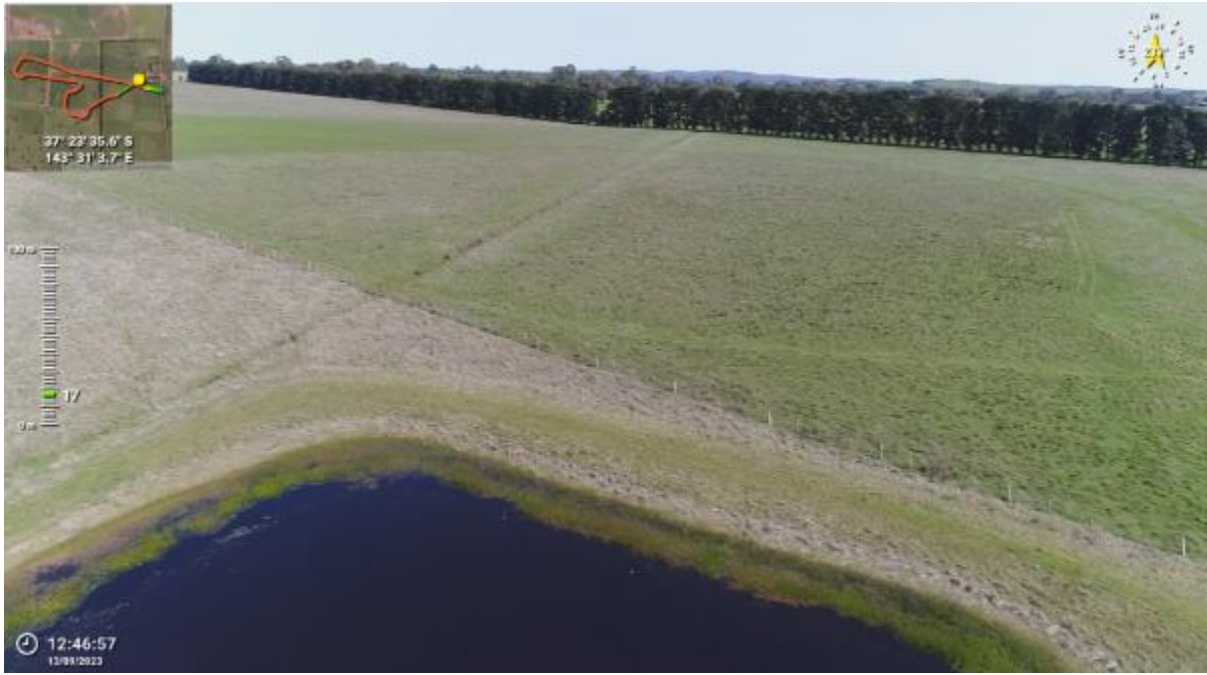
Appendix Plate 117. Waterbody 100; Low habitat quality (Ecology and Heritage Partners Pty Ltd 09/2023).