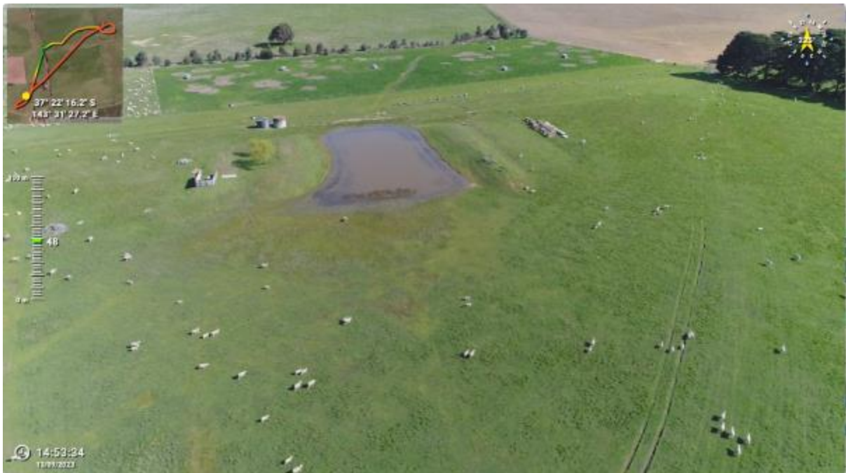
Appendix Plate 104. Waterbody 89; Low habitat quality (Ecology and Heritage Partners Pty Ltd 09/2023).

This copied document to be made available for the sole purpose of enabling its consideration and review as part of a planning process under the Planning and Environment Act 1987. The document must not be used for any purpose which may breach any copyright