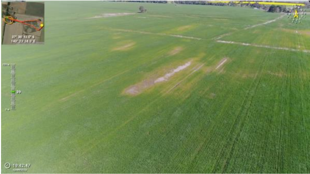
Appendix Plate 335. Waterbody 294; Low habitat quality (Ecology and Heritage Partners Pty Ltd 09/2023).