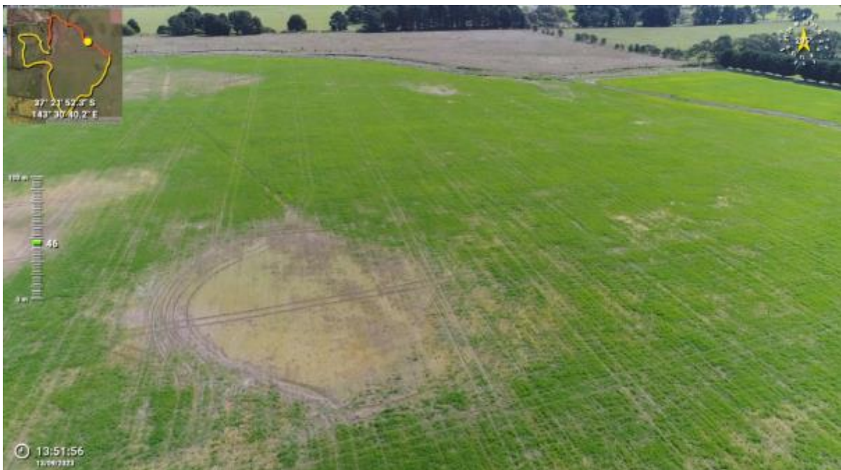
Appendix Plate g2. Waterbody 77; Low habitat quality (Ecology and Heritage Partners Pty Ltd 09/2023).

This copied document to be made available for the sole purpose of enabling its consideration and review as part of a planning process under the Planning and Environment Act 1987. The document must not be used for any purpose which may breach any copyright