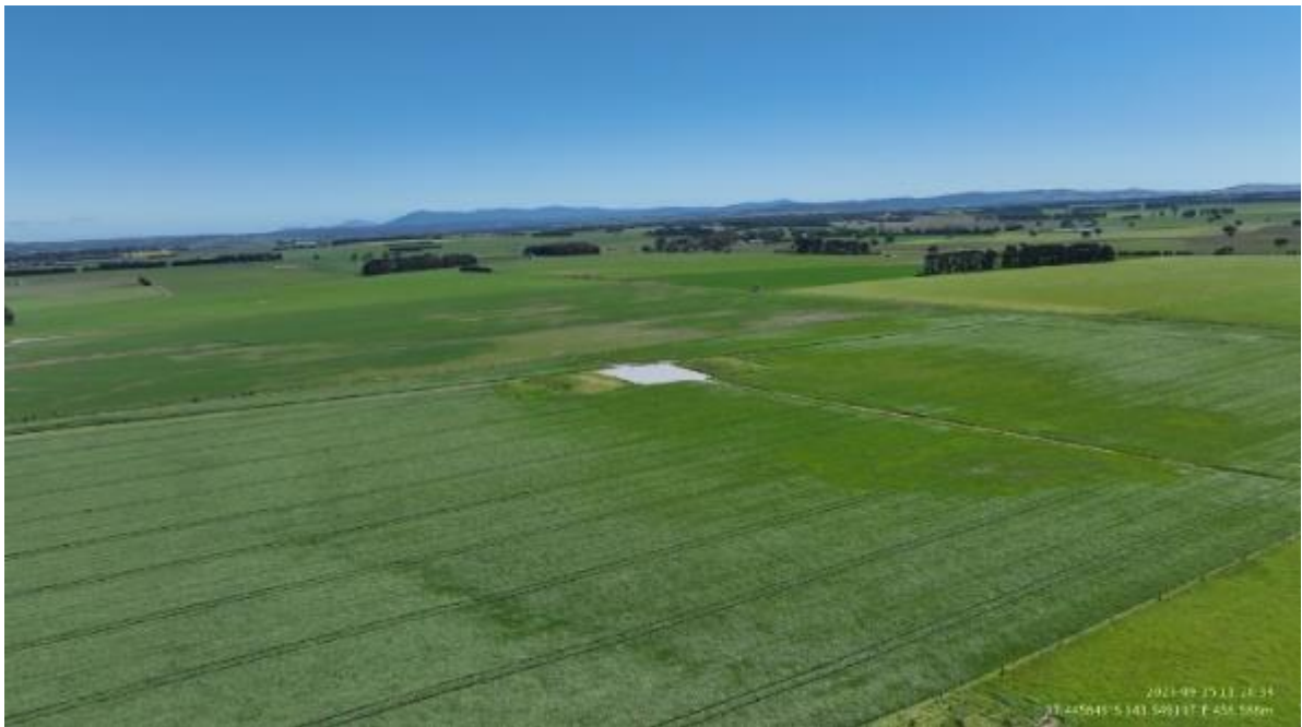
Appendix Plate 218. Waterbody 193; Low habitat quality.

This copied document to be made available for the sole purpose of enabling its consideration and review as part of a planning process under the Planning and Environment Act 1987. The document must not be used for any purpose which may breach any copyright