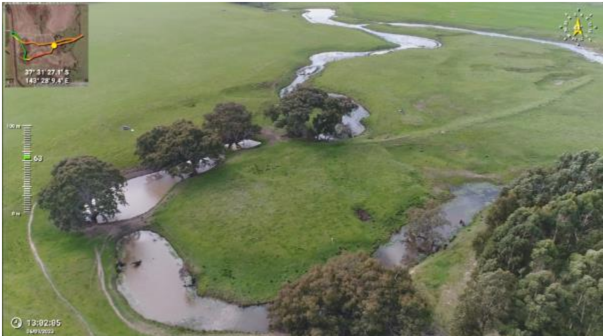
Appendix Plate 194. Waterbody 169; Low habitat quality.

This copied document to be made available for the sole purpose of enabling its consideration and review as part of a planning process under the Planning and Environment Act 1987. The document must not be used for any purpose which may breach any copyright