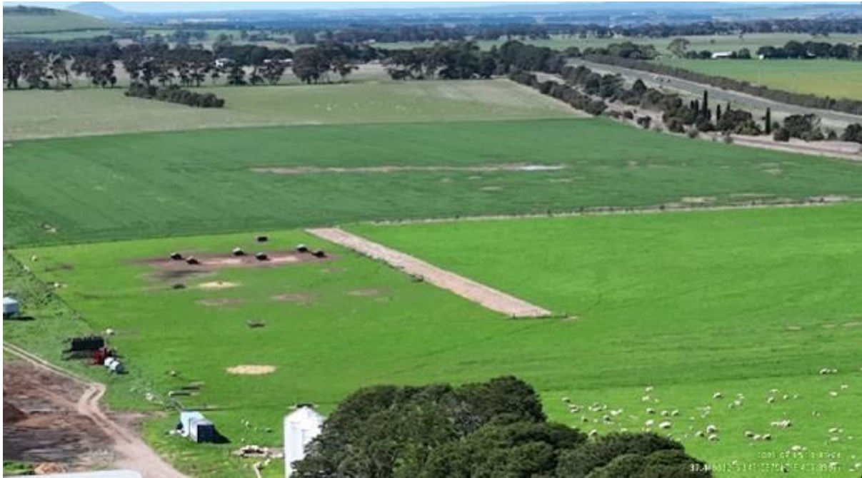
Appendix Plate 181. Waterbody 156; Low habitat quality (Ecology and Heritage Partners Pty Ltd 09/2023).