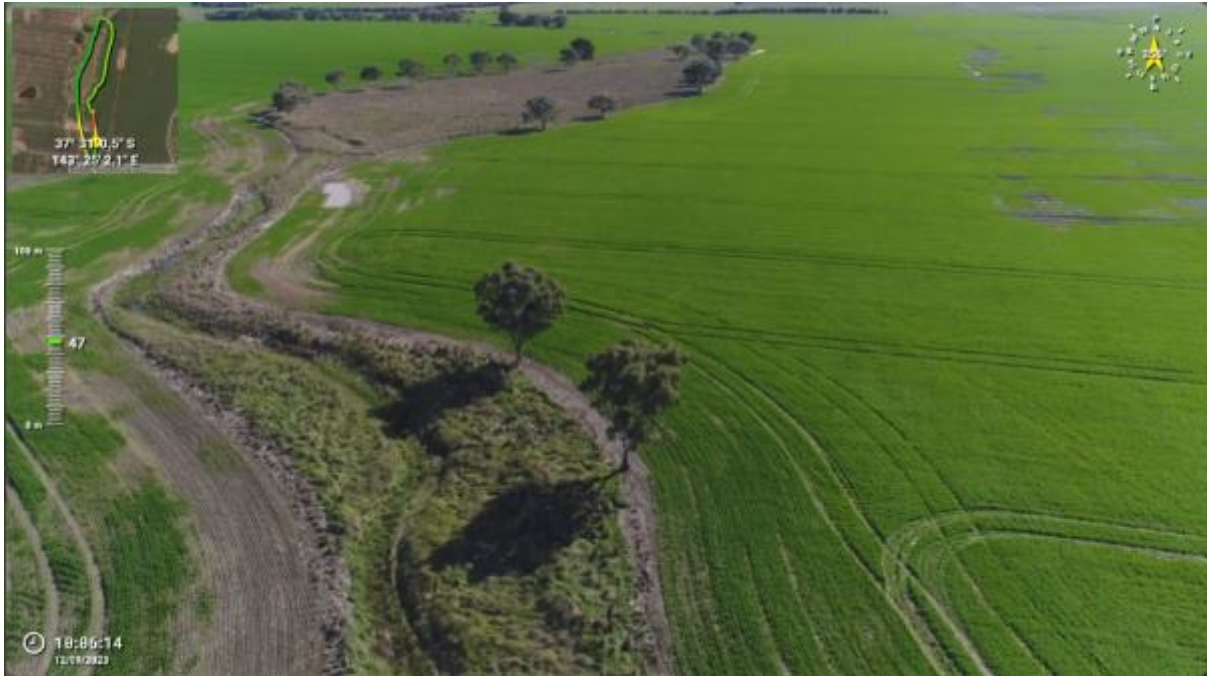
Appendix Plate 223. Waterbody 199; Low habitat quality (Ecology and Heritage Partners Pty Ltd 09/2023).