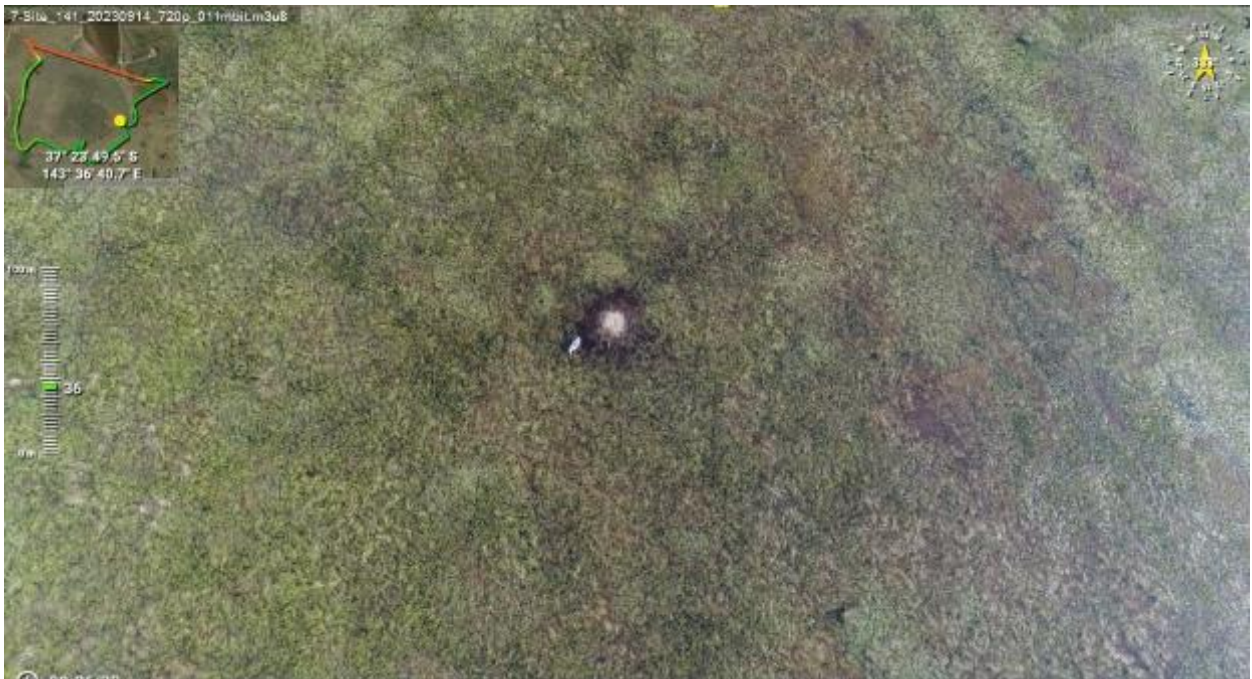
Appendix Plate 166. Waterbody 141; Brolga and nest (Ecology and Heritage Partners Pty Ltd 09/2023).

This copied document to be made available for the sole purpose of enabling its consideration and review as part of a planning process under the Planning and Environment Act 1987. The document must not be used for any purpose which may breach any copyright