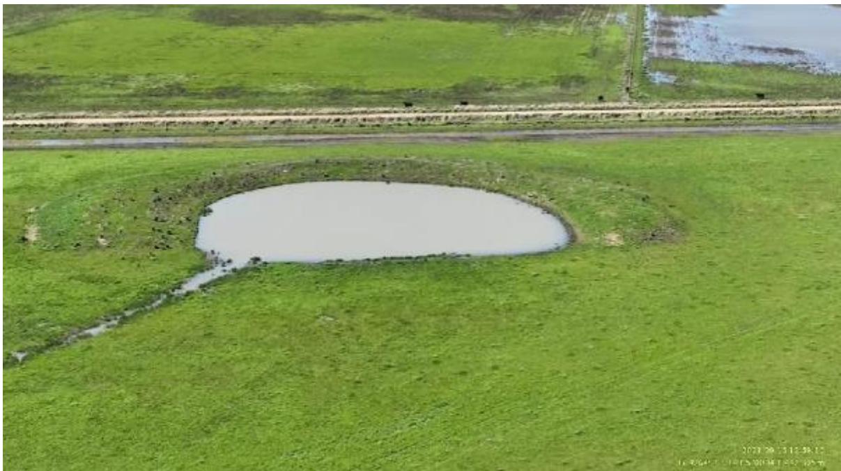
Appendix Plate 148. Waterbody 129; Low habitat quality (Ecology and Heritage Partners Pty Ltd 09/2023).

This copied document to be made available for the sole purpose of enabling its consideration and review as part of a planning process under the Planning and Environment Act 1987. The document must not be used for any purpose which may breach any copyright