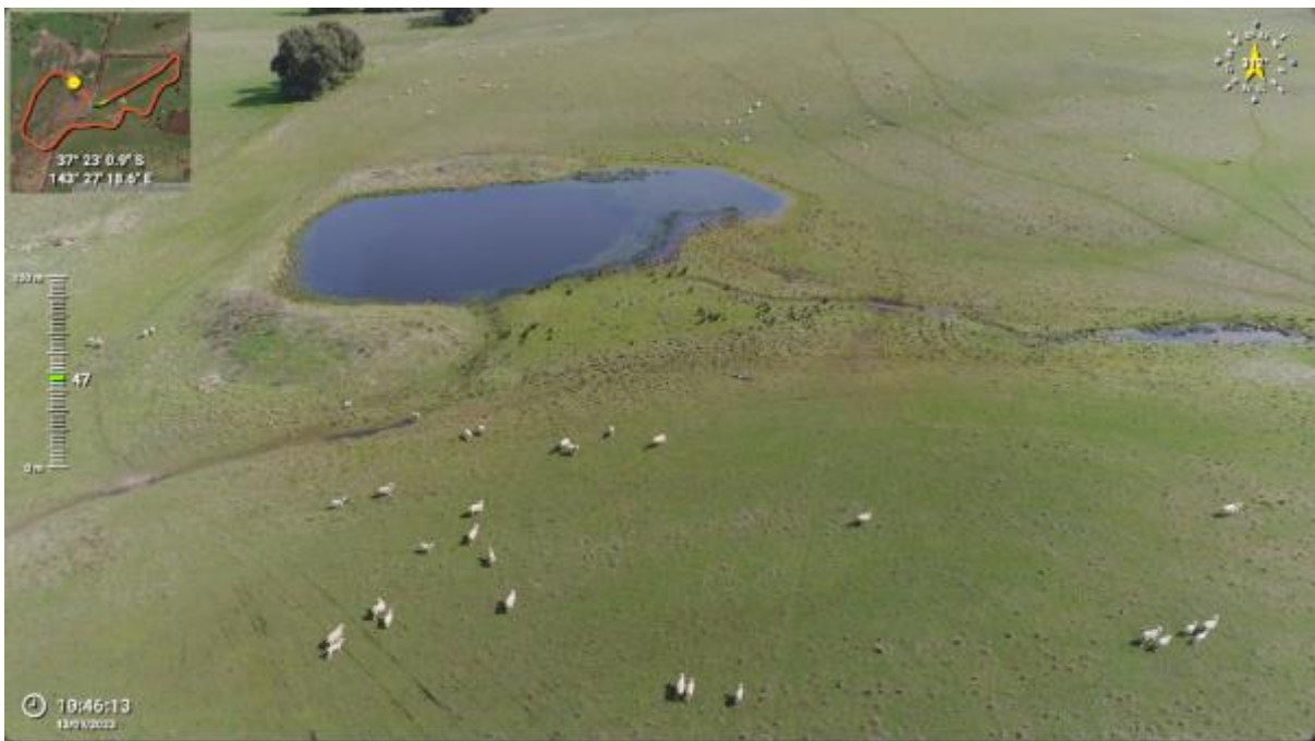
Appendix Plate 12. Waterbody 8; Low habitat quality (Ecology and Heritage Partners Pty Ltd 09/2023).

This copied document to be made available for the sole purpose of enabling its consideration and review as part of a planning process under the Planning and Environment Act 1987. The document must not be used for any purpose which may breach any copyright