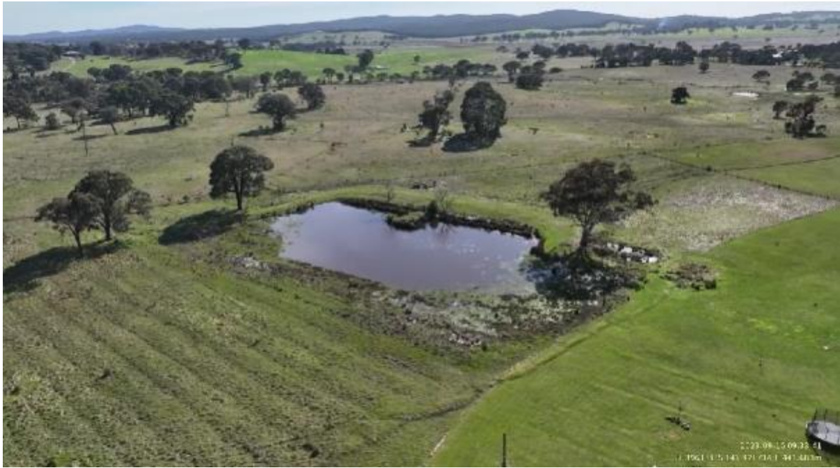
Appendix Plate 53. Waterbody 43; Low habitat quality (Ecology and Heritage Partners Pty Ltd 09/2023).