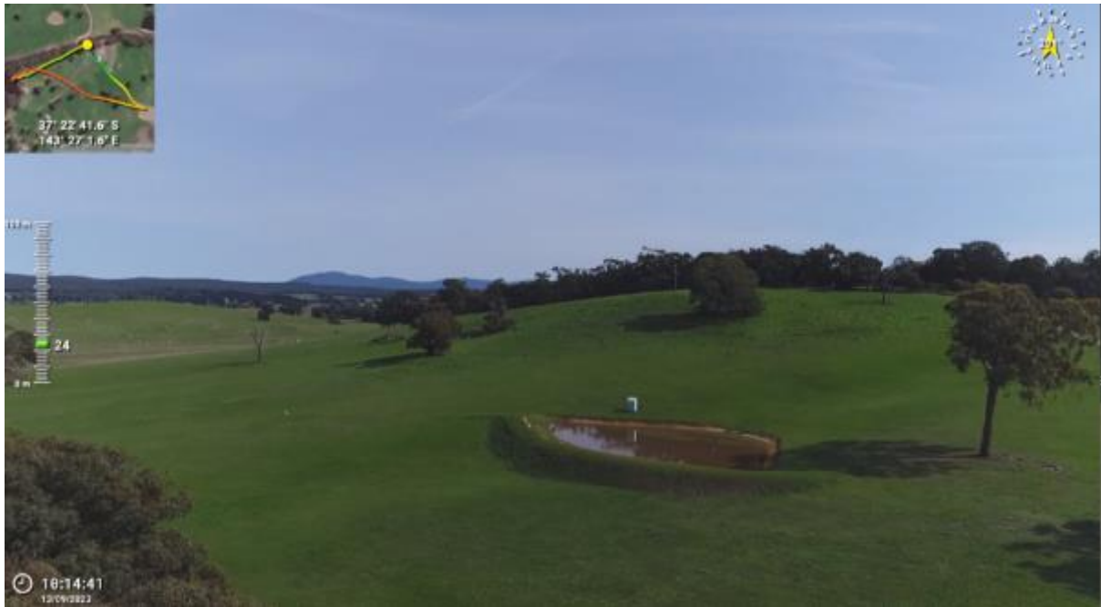
Appendix Plate 19. Waterbody 15; Low habitat quality (Ecology and Heritage Partners Pty Ltd 09/2023).