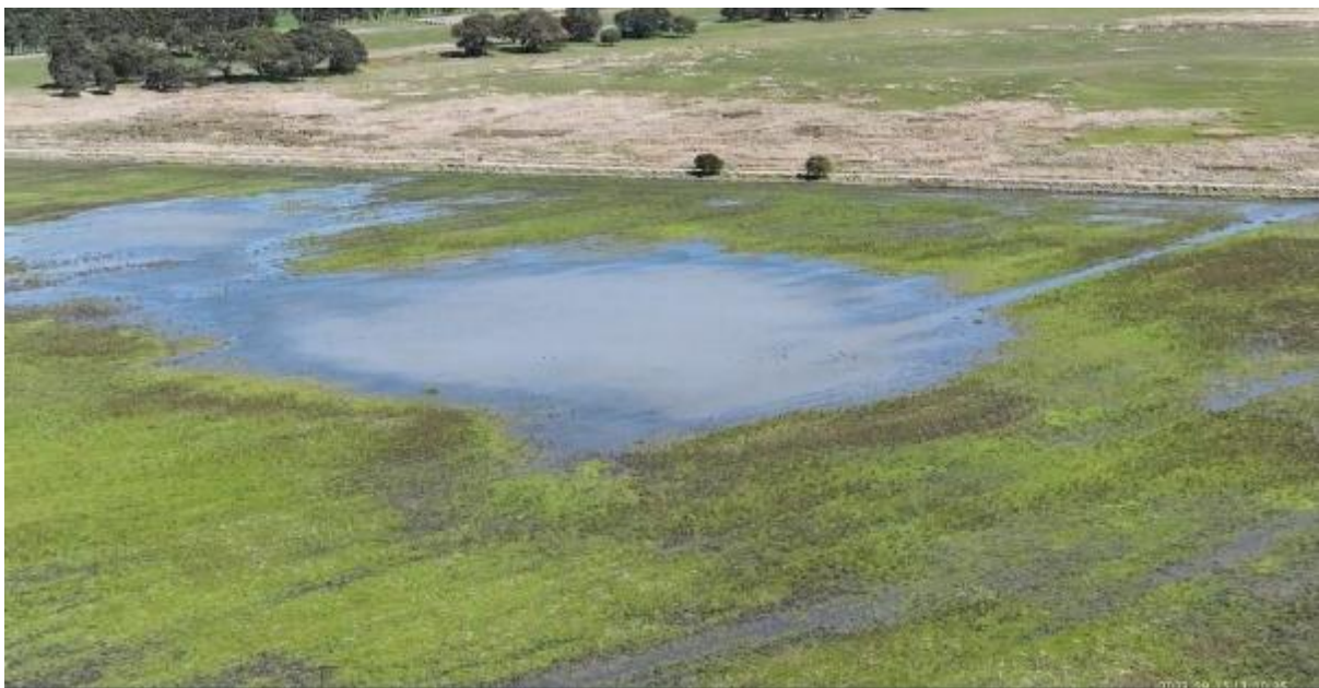
Appendix Plate 214. Waterbody 189; High habitat quality.

This copied document to be made available for the sole purpose of enabling its consideration and review as part of a planning process under the Planning and Environment Act 1987. The document must not be used for any purpose which may breach any copyright