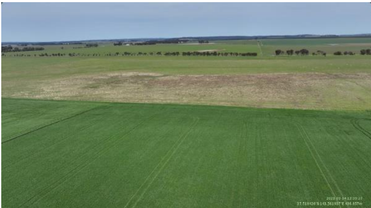
Appendix Plate 308. Waterbody 271; Low habitat quality (Ecology and Heritage Partners Pty Ltd 09/2023).

This copied document to be made available for the sole purpose of enabling its consideration and review as part of a planning process under the Planning and Environment Act 1987. The document must not be used for any purpose which may breach any copyright