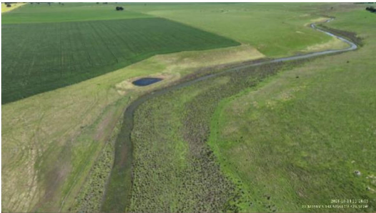
Appendix Plate 184. Waterbody 160; Low habitat quality (Ecology and Heritage Partners Pty Ltd 09/2023).

This copied document to be made available for the sole purpose of enabling its consideration and review as part of a planning process under the Planning and Environment Act 1987. The document must not be used for any purpose which may breach any copyright