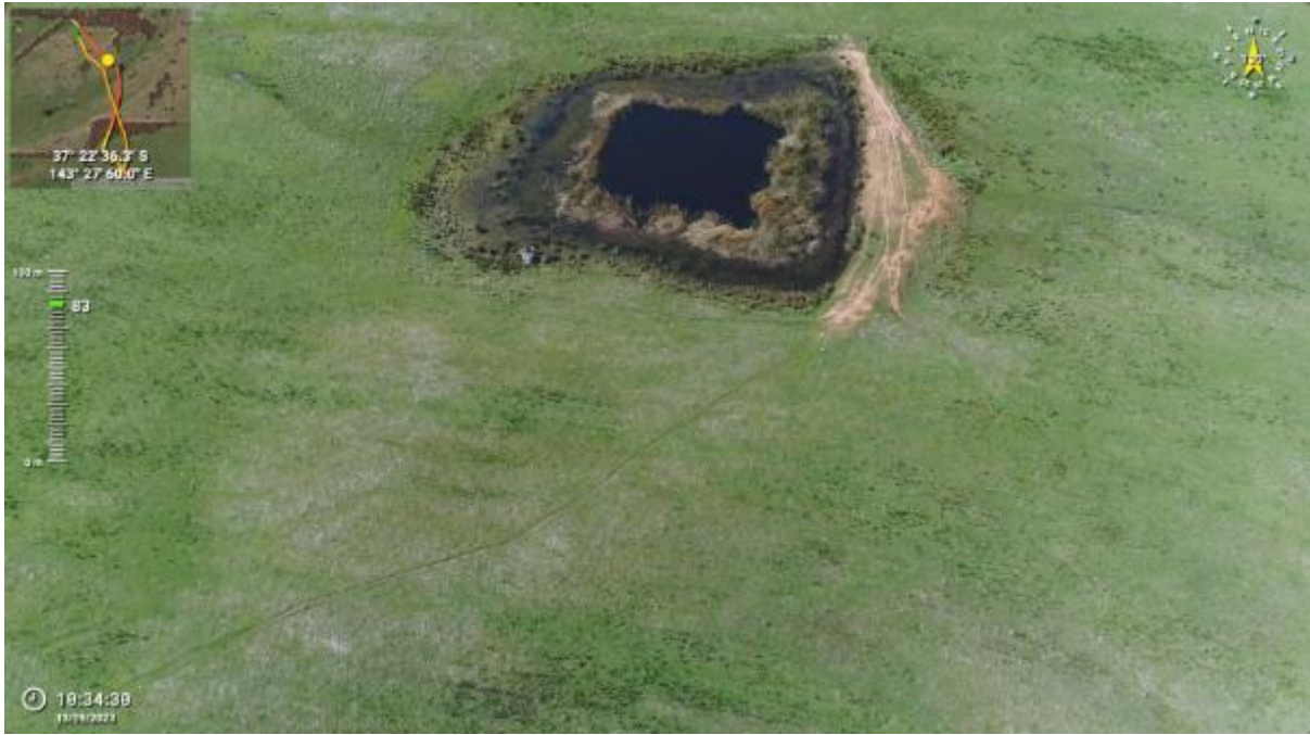
Appendix Plate 17. Waterbody 13; Moderate habitat quality (Ecology and Heritage Partners Pty Ltd 09/2023).