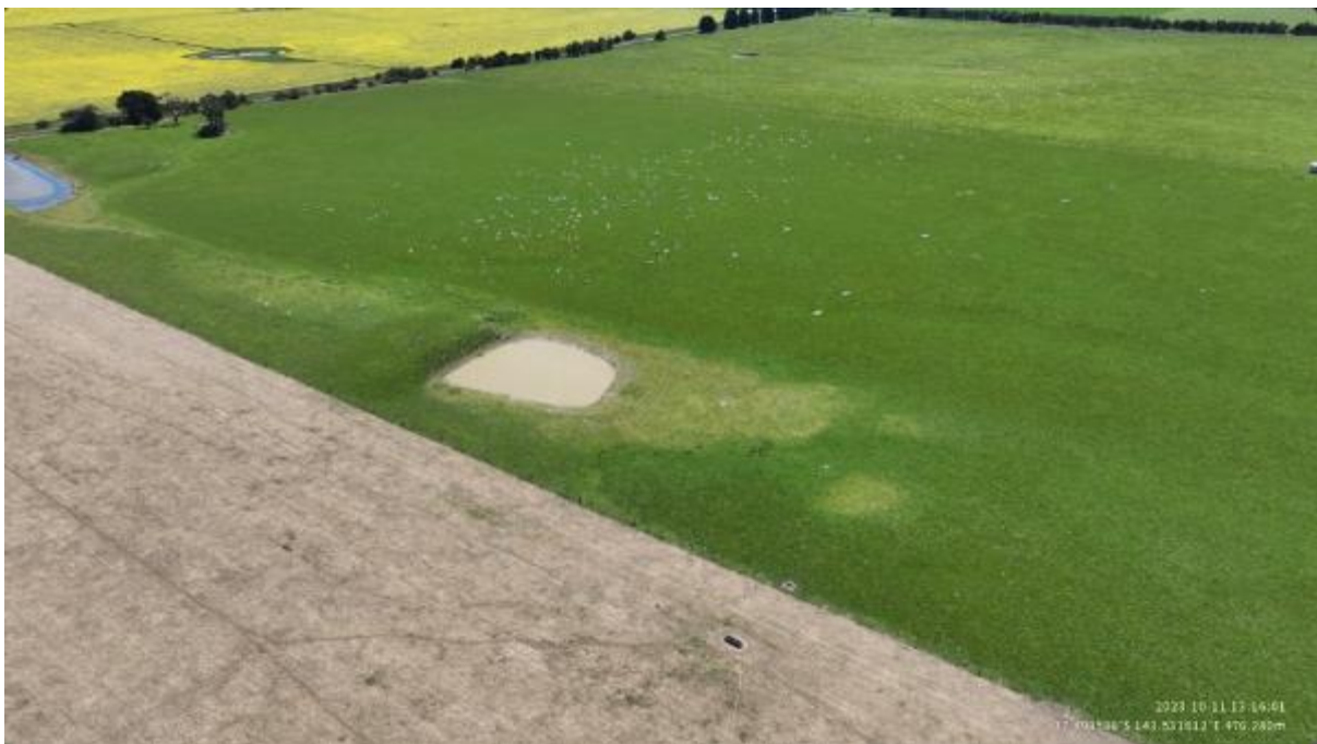
Appendix Plate 180. Waterbody 155; Low habitat quality (Ecology and Heritage Partners Pty Ltd 09/2023).

This copied document to be made available for the sole purpose of enabling its consideration and review as part of a planning process under the Planning and Environment Act 1987. The document must not be used for any purpose which may breach any copyright