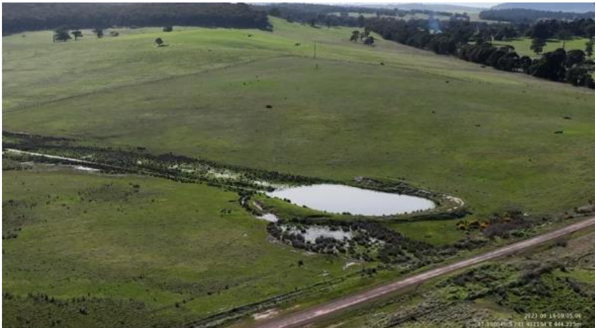
Appendix Plate 24. Waterbody 18; Low habitat quality (Ecology and Heritage Partners Pty Ltd 09/2023).

This copied document to be made available for the sole purpose of enabling its consideration and review as part of a planning process under the Planning and Environment Act 1987. The document must not be used for any purpose which may breach any copyright