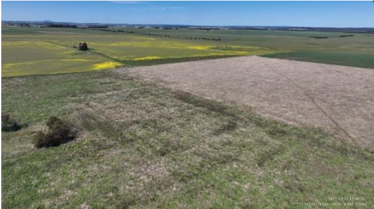
Appendix Plate 267. Waterbody 238; Low habitat quality.