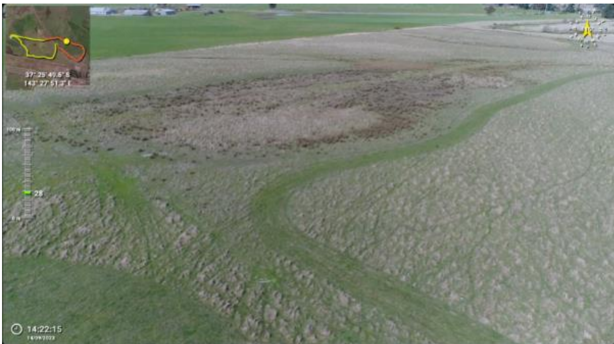
Appendix Plate 264. Waterbody 236; Low habitat quality (Ecology and Heritage Partners Pty Ltd 09/2023).

This copied document to be made available for the sole purpose of enabling its consideration and review as part of a planning process under the Planning and Environment Act 1987. The document must not be used for any purpose which may breach any copyright