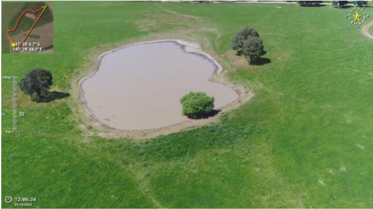
Appendix Plate 137. Waterbody 117; Low habitat quality (Ecology and Heritage Partners Pty Ltd 09/2023).