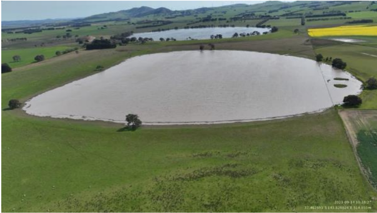
Appendix Plate 239. Waterbody 213; Low habitat quality (Ecology and Heritage Partners Pty Ltd 09/2023).