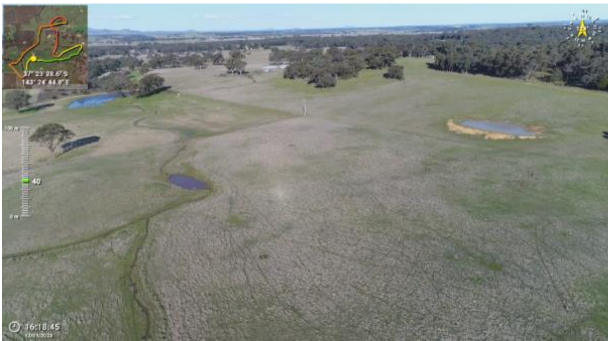
Appendix Plate 40. Waterbody 31; Moderate habitat quality (Ecology and Heritage Partners Pty Ltd 09/2023).

This copied document to be made available for the sole purpose of enabling its consideration and review as part of a planning process under the Planning and Environment Act 1987. The document must not be used for any purpose which may breach any copyright