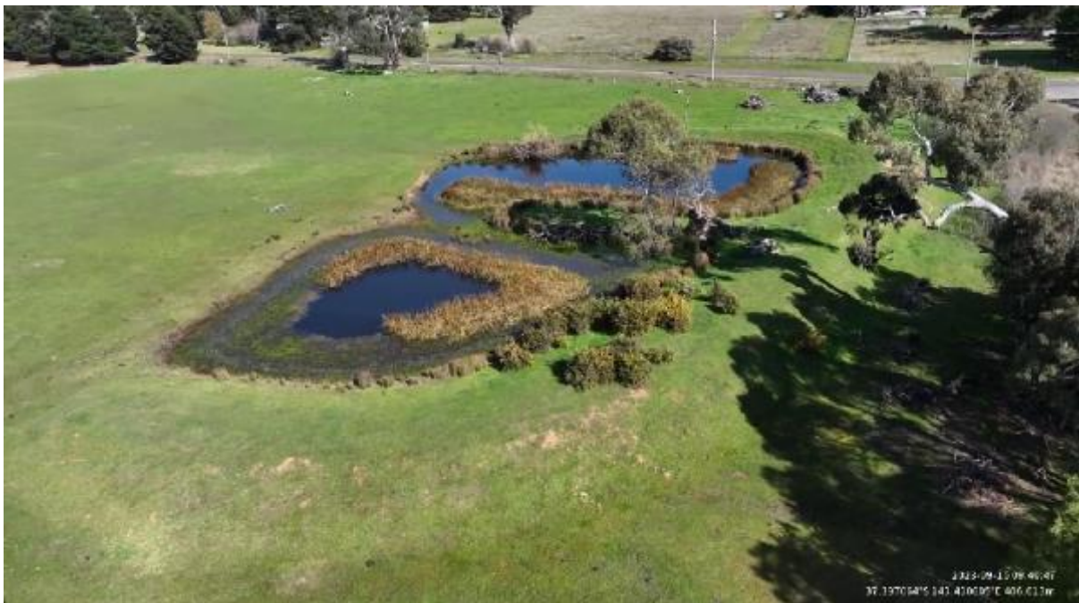
Appendix Plate 44. Waterbody 34; Moderate habitat quality (Ecology and Heritage Partners Pty Ltd 09/2023).

This copied document to be made available for the sole purpose of enabling its consideration and review as part of a planning process under the Planning and Environment Act 1987. The document must not be used for any purpose which may breach any copyright