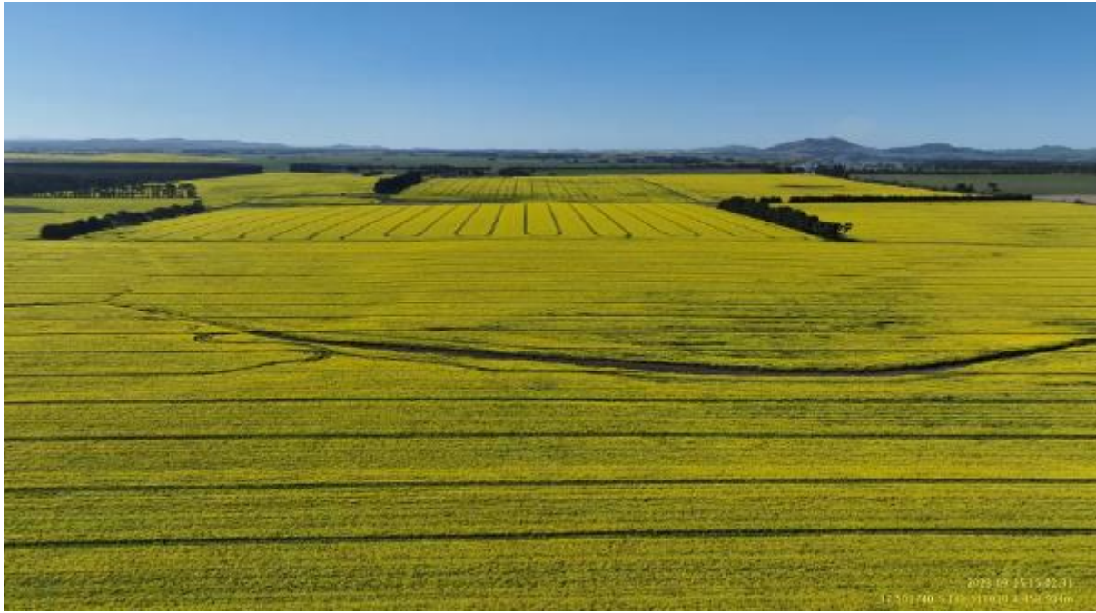
Appendix Plate 183. Waterbody 159; Low habitat quality (Ecology and Heritage Partners Pty Ltd 09/2023).