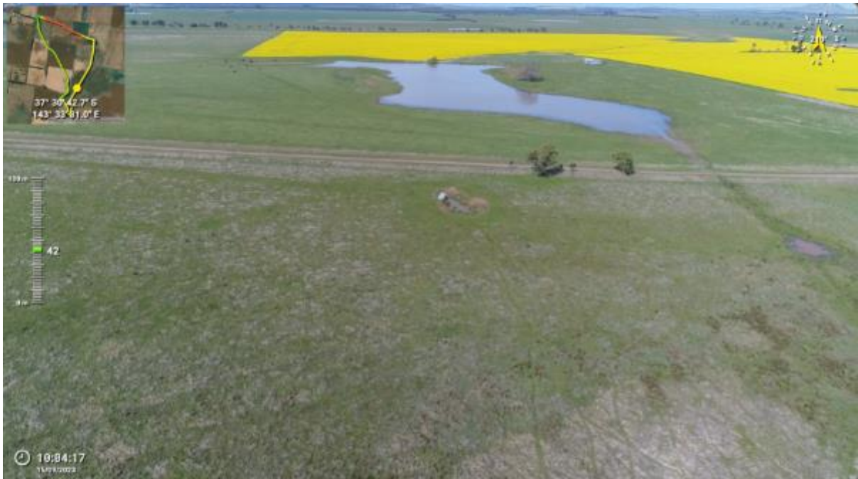
Appendix Plate 316. Waterbody 277; Low habitat quality (Ecology and Heritage Partners Pty Ltd 09/2023).

This copied document to be made available for the sole purpose of enabling its consideration and review as part of a planning process under the Planning and Environment Act 1987. The document must not be used for any purpose which may breach any copyright