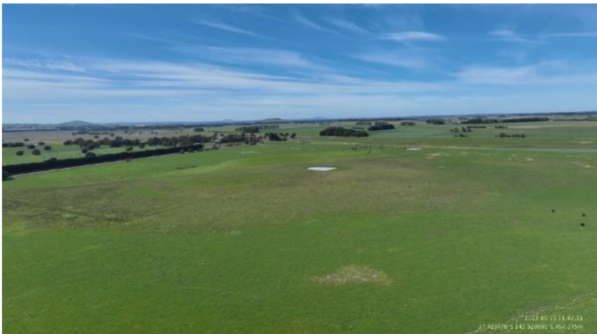
Appendix Plate 270. Waterbody 241; Low habitat quality (Ecology and Heritage Partners Pty Ltd 09/2023).

This copied document to be made available for the sole purpose of enabling its consideration and review as part of a planning process under the Planning and Environment Act 1987. The document must not be used for any purpose which may breach any copyright