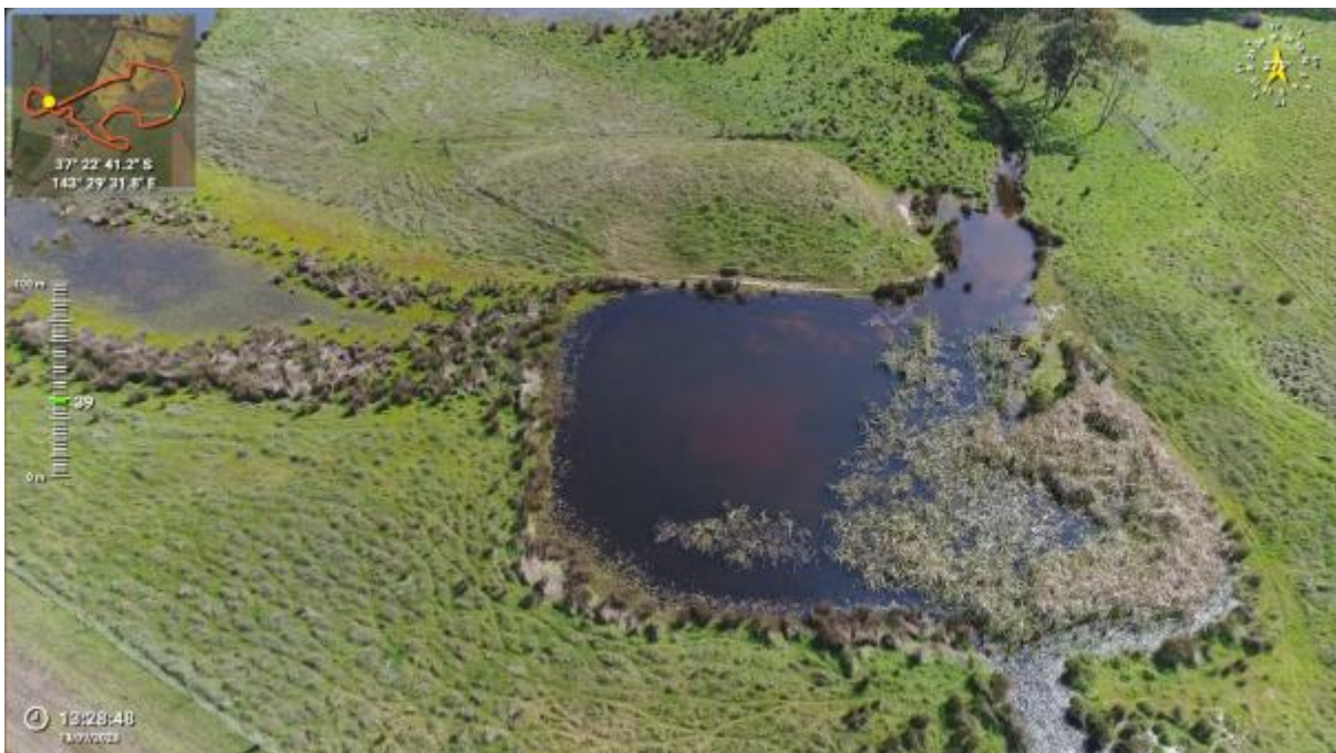
Appendix Plate 88. Waterbody 73; Moderate habitat quality (Ecology and Heritage Partners Pty Ltd 09/2023).

This copied document to be made available for the sole purpose of enabling its consideration and review as part of a planning process under the Planning and Environment Act 1987. The document must not be used for any purpose which may breach any copyright