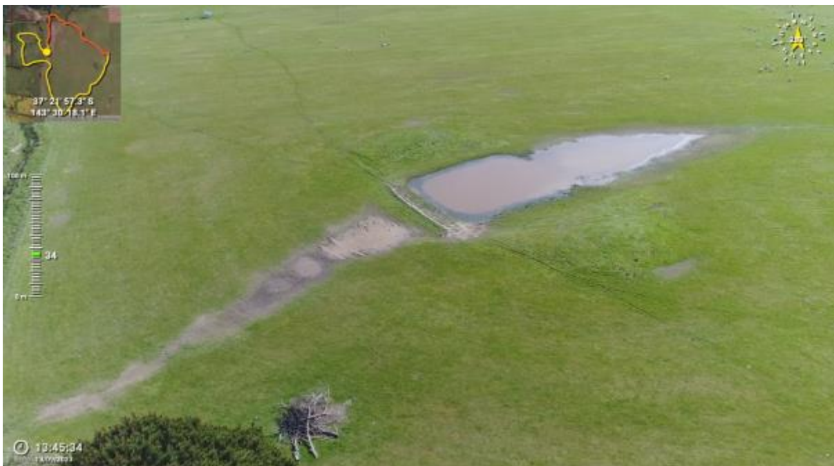
Appendix Plate 90. Waterbody 75; Low habitat quality (Ecology and Heritage Partners Pty Ltd 09/2023).

This copied document to be made available for the sole purpose of enabling its consideration and review as part of a planning process under the Planning and Environment Act 1987. The document must not be used for any purpose which may breach any copyright