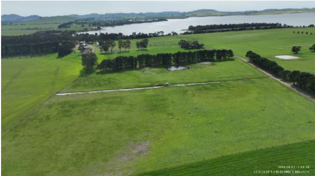
Appendix Plate 311. Waterbody 274; Low habitat quality (Ecology and Heritage Partners Pty Ltd 09/2023).