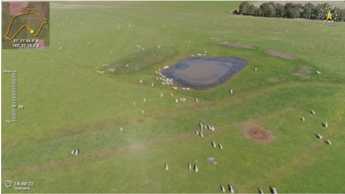
Appendix Plate 99. Waterbody 84; Low habitat quality (Ecology and Heritage Partners Pty Ltd 09/2023).