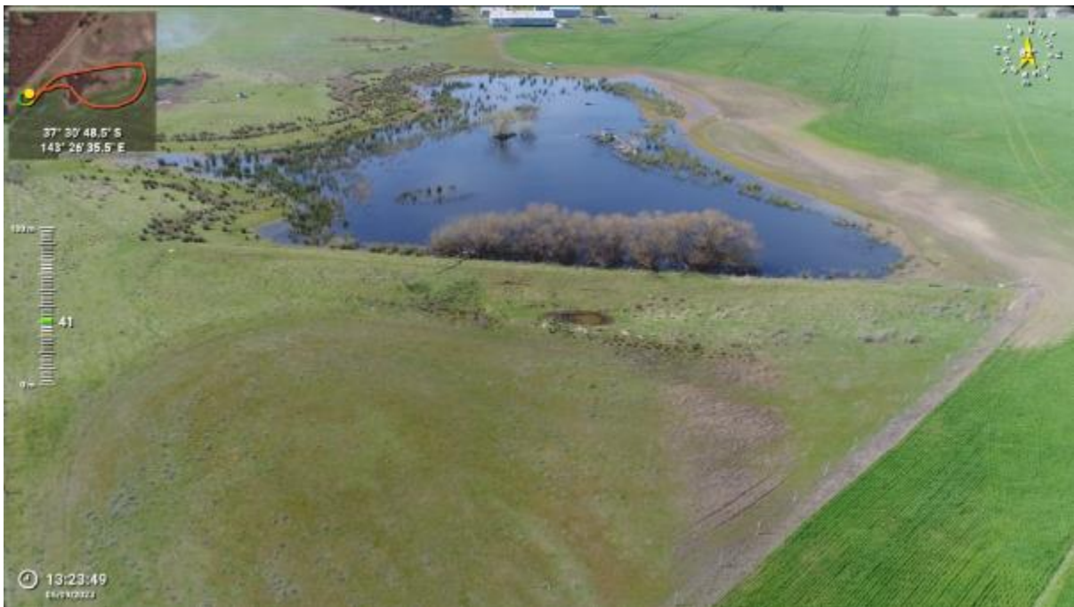
Appendix Plate 324. Waterbody 284; High habitat quality (Ecology and Heritage Partners Pty Ltd 09/2023).

This copied document to be made available for the sole purpose of enabling its consideration and review as part of a planning process under the Planning and Environment Act 1987. The document must not be used for any purpose which may breach any copyright