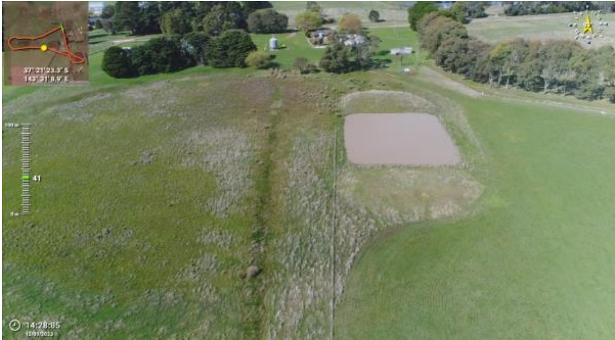
Appendix Plate 95. Waterbody 80; Low habitat quality (Ecology and Heritage Partners Pty Ltd 09/2023).