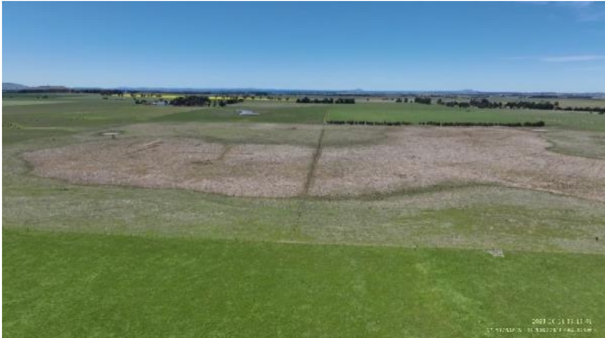
Appendix Plate 201. Waterbody 177; Low habitat quality (Ecology and Heritage Partners Pty Ltd 09/2023).