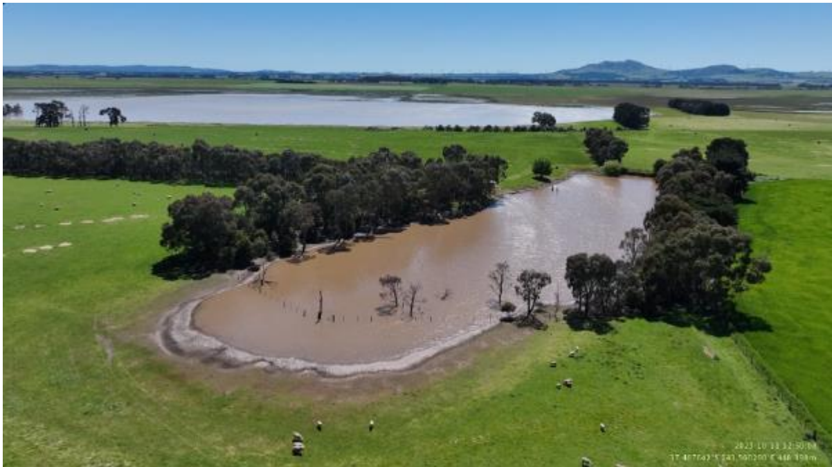
Appendix Plate 302. Waterbody 266; Low habitat quality (Ecology and Heritage Partners Pty Ltd 09/2023).

This copied document to be made available for the sole purpose of enabling its consideration and review as part of a planning process under the Planning and Environment Act 1987. The document must not be used for any purpose which may breach any copyright