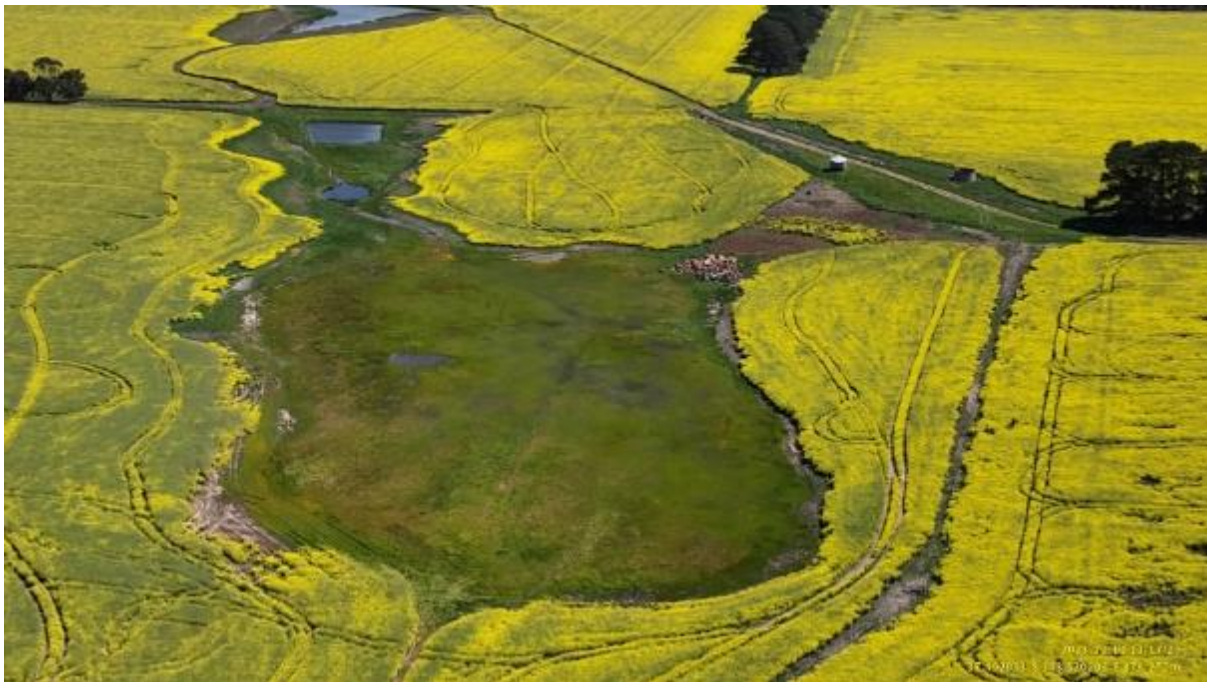
Appendix Plate 152. Waterbody 132; Low habitat quality (Ecology and Heritage Partners Pty Ltd 09/2023).

This copied document to be made available for the sole purpose of enabling its consideration and review as part of a planning process under the Planning and Environment Act 1987. The document must not be used for any purpose which may breach any copyright