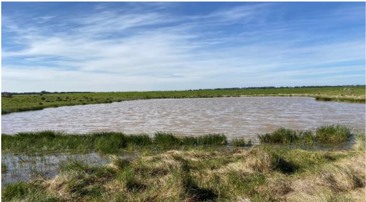
Appendix Plate 306. Waterbody 269; Low habitat quality.

This copied document to be made available for the sole purpose of enabling its consideration and review as part of a planning process under the Planning and Environment Act 1987. The document must not be used for any purpose which may breach any copyright