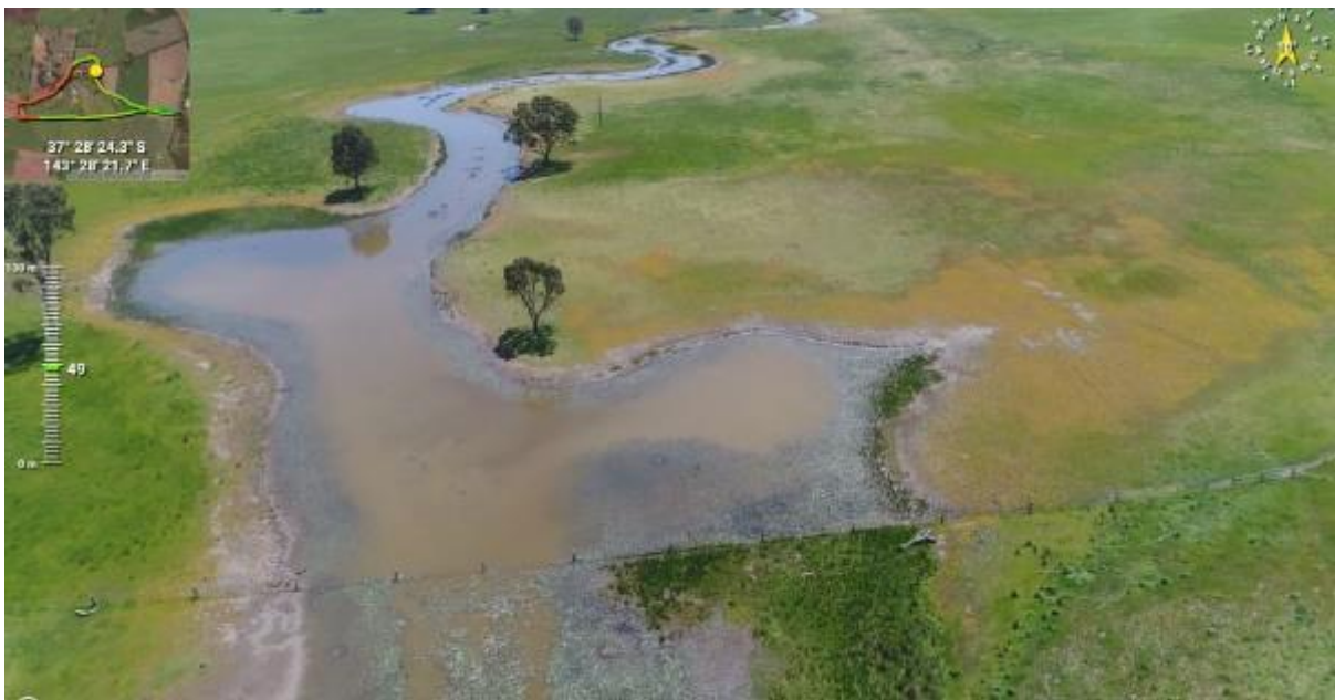
Appendix Plate 338. Waterbody 297; High habitat quality.

This copied document to be made available for the sole purpose of enabling its consideration and review as part of a planning process under the Planning and Environment Act 1987. The document must not be used for any purpose which may breach any copyright