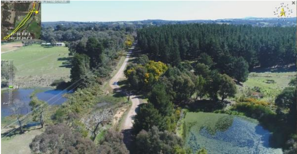
Appendix Plate 235. Waterbody 210; Moderate habitat quality (Ecology and Heritage Partners Pty Ltd 09/2023).