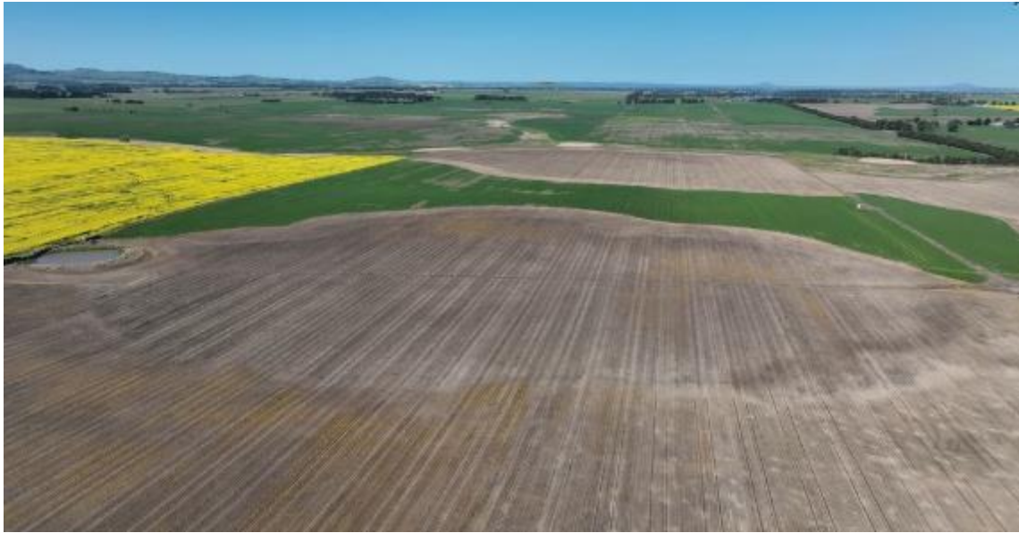
Appendix Plate 139. Waterbody 119; Low habitat quality.