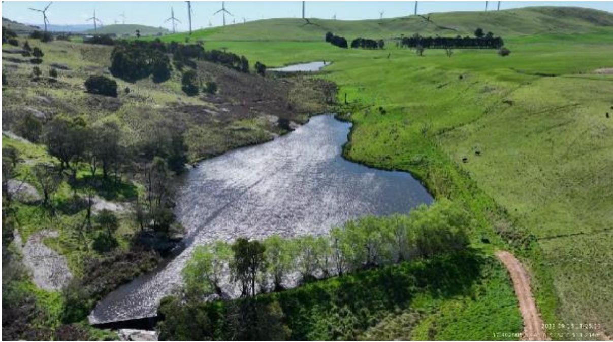
Appendix Plate 151. Waterbody 131; Low habitat quality (Ecology and Heritage Partners Pty Ltd 09/2023).