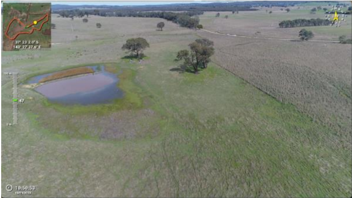
Appendix Plate 11. Waterbody 7; Moderate habitat quality (Ecology and Heritage Partners Pty Ltd 09/2023).