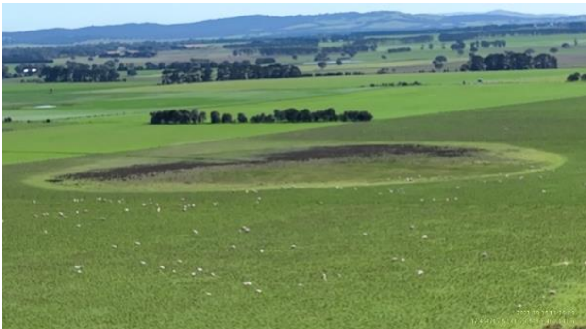
Appendix Plate 312. Waterbody 275; Low habitat quality (Ecology and Heritage Partners Pty Ltd 09/2023).

This copied document to be made available for the sole purpose of enabling its consideration and review as part of a planning process under the Planning and Environment Act 1987. The document must not be used for any purpose which may breach any copyright