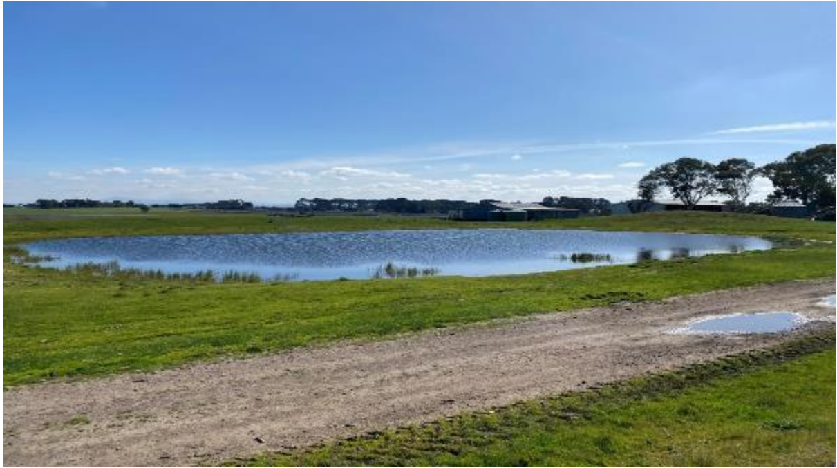
Appendix Plate 261. Waterbody 234; Moderate habitat quality (Ecology and Heritage Partners Pty Ltd 09/2023).