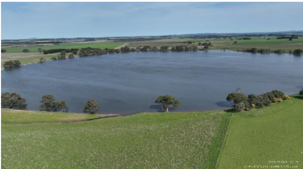
Appendix Plate 174. Waterbody 149; Low habitat quality (Ecology and Heritage Partners Pty Ltd 09/2023).

This copied document to be made available for the sole purpose of enabling its consideration and review as part of a planning process under the Planning and Environment Act 1987. The document must not be used for any purpose which may breach any copyright