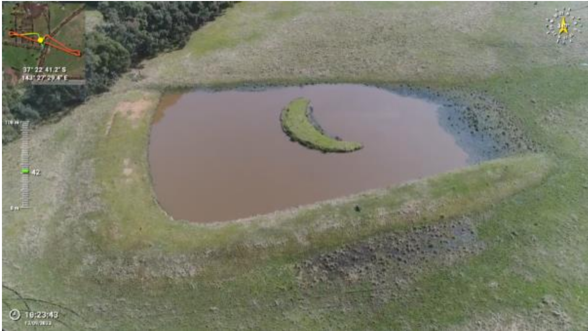
Appendix Plate 13. Waterbody 9; Moderate habitat quality.