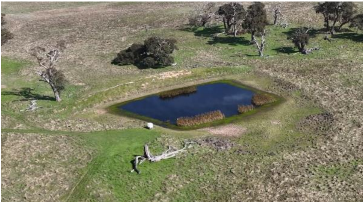
Appendix Plate 82. Waterbody 68; Low habitat quality (Ecology and Heritage Partners Pty Ltd 09/2023).

This copied document to be made available for the sole purpose of enabling its consideration and review as part of a planning process under the Planning and Environment Act 1987. The document must not be used for any purpose which may breach any copyright