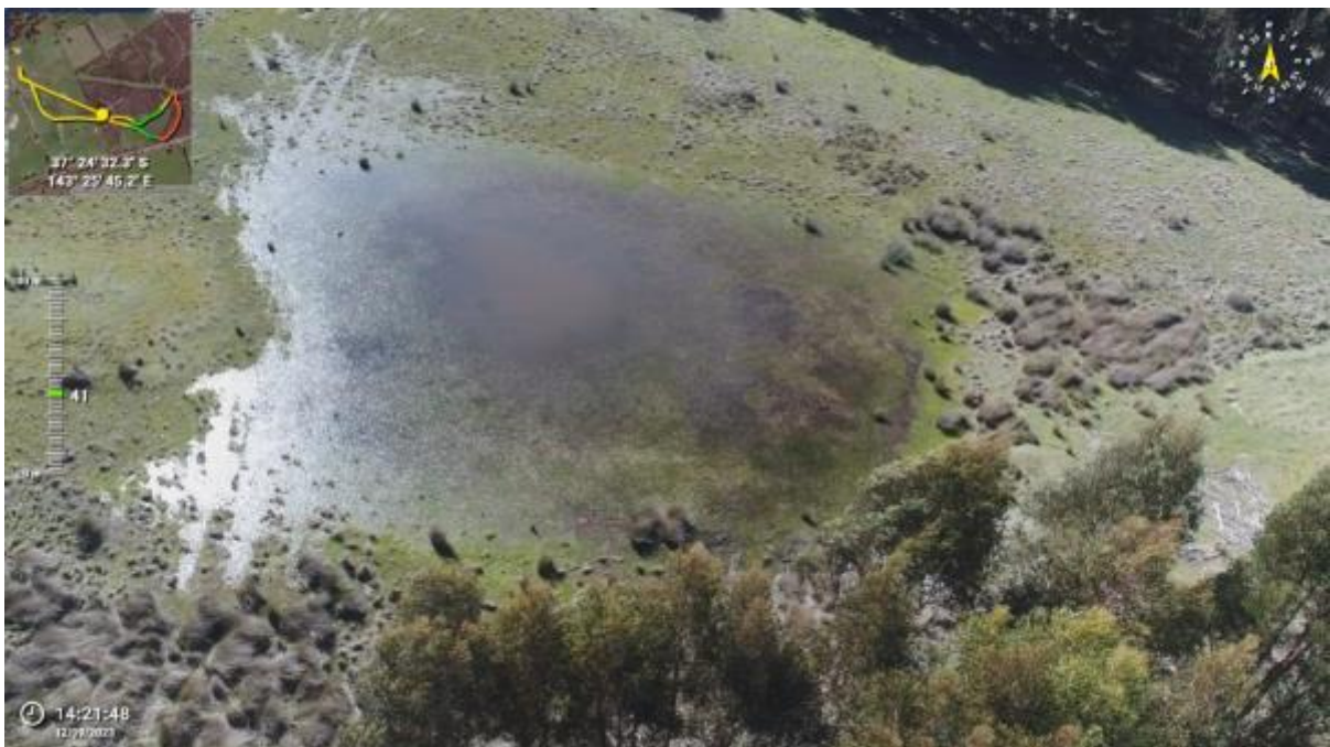
Appendix Plate 56. Waterbody 46; Low habitat quality (Ecology and Heritage Partners Pty Ltd 09/2023).

This copied document to be made available for the sole purpose of enabling its consideration and review as part of a planning process under the Planning and Environment Act 1987. The document must not be used for any purpose which may breach any copyright