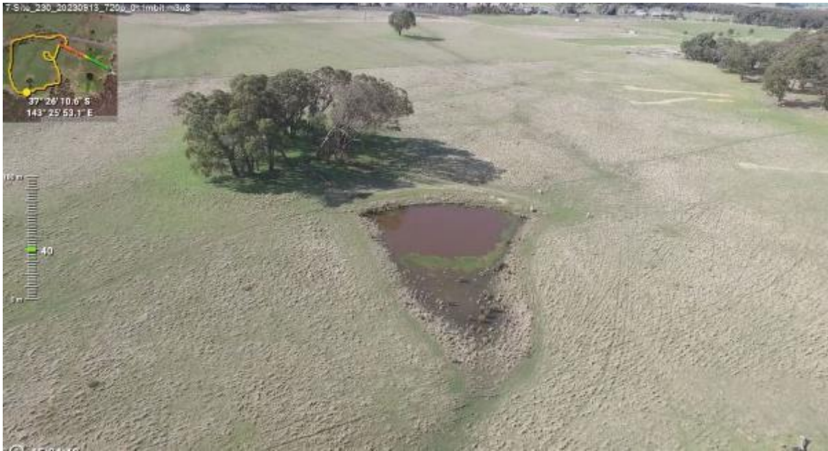
Appendix Plate 257. Waterbody 230; Low habitat quality (Ecology and Heritage Partners Pty Ltd 09/2023).