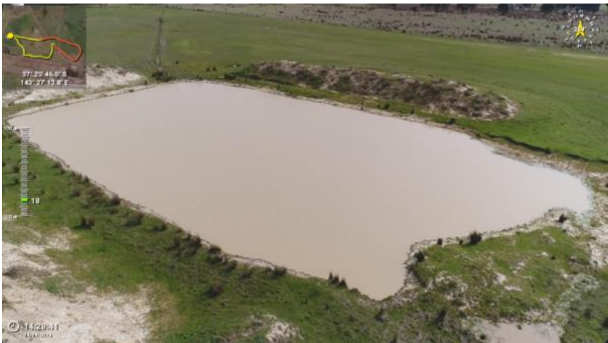
Appendix Plate 132. Waterbody 113; Low habitat quality (Ecology and Heritage Partners Pty Ltd 09/2023).

This copied document to be made available for the sole purpose of enabling its consideration and review as part of a planning process under the Planning and Environment Act 1987. The document must not be used for any purpose which may breach any copyright