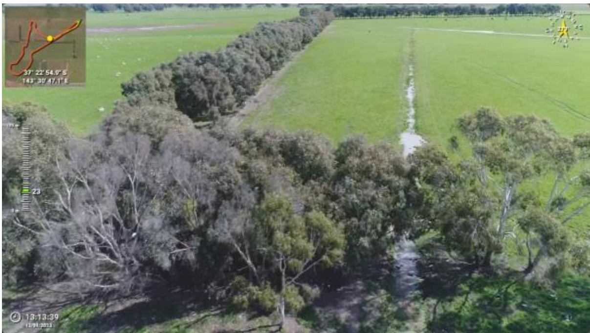
Appendix Plate 110. Waterbody 94; Low habitat quality.

This copied document to be made available for the sole purpose of enabling its consideration and review as part of a planning process under the Planning and Environment Act 1987. The document must not be used for any purpose which may breach any copyright