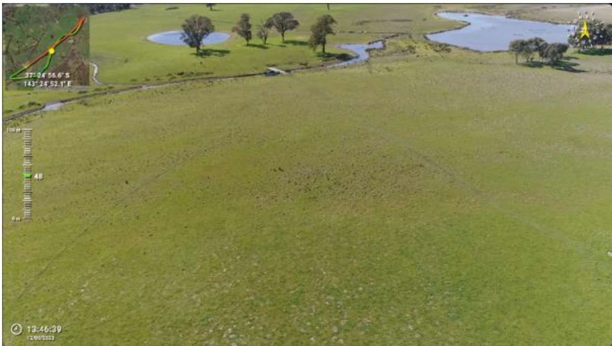
Appendix Plate 50. Waterbody 40; Low habitat quality.

This copied document to be made available for the sole purpose of enabling its consideration and review as part of a planning process under the Planning and Environment Act 1987. The document must not be used for any purpose which may breach any copyright