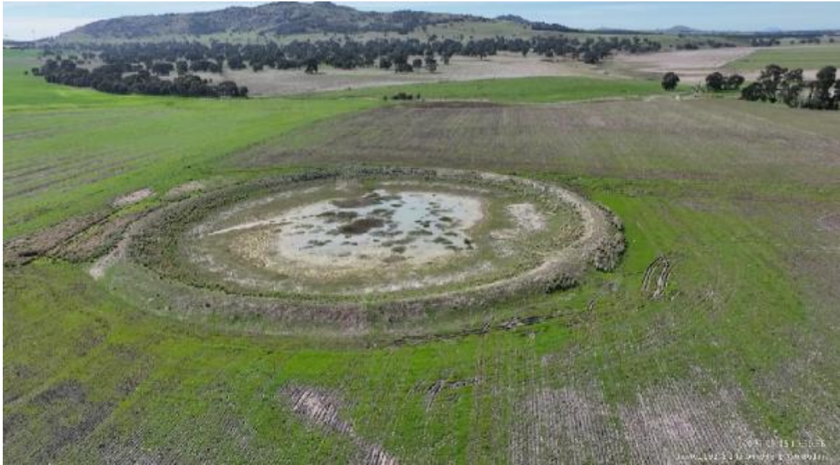
Appendix Plate 159. Waterbody 137; Moderate habitat quality.