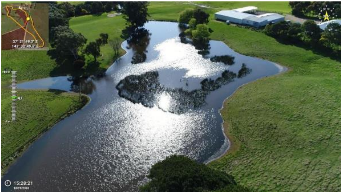
Appendix Plate 170. Waterbody 145; High habitat quality.

This copied document to be made available for the sole purpose of enabling its consideration and review as part of a planning process under the Planning and Environment Act 1987. The document must not be used for any purpose which may breach any copyright