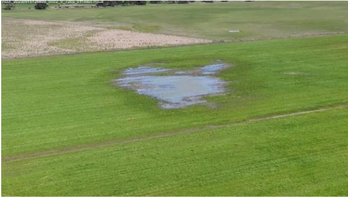
Appendix Plate 301. Waterbody 265; Moderate habitat quality (Ecology and Heritage Partners Pty Ltd 09/2023).