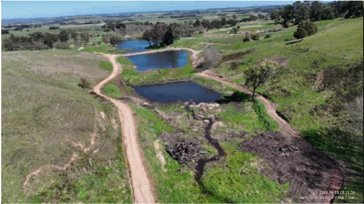
Appendix Plate 319. Waterbody 279; Low habitat quality (Ecology and Heritage Partners Pty Ltd 09/2023).