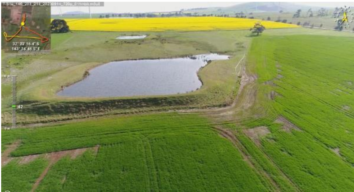
Appendix Plate 240. Waterbody 214; Moderate habitat quality (Ecology and Heritage Partners Pty Ltd 09/2023).