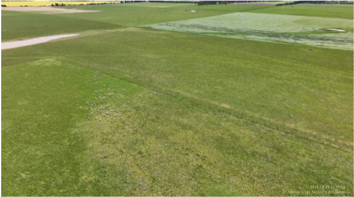
Appendix Plate 237. Waterbody 211; Low habitat quality (Ecology and Heritage Partners Pty Ltd 09/2023).