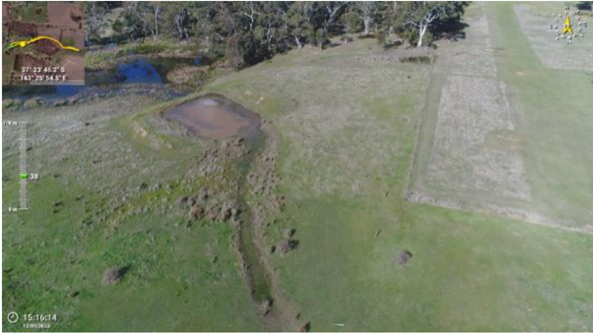
Appendix Plate 1. Waterbody 1; Moderate habitat quality (Ecology and Heritage Partners Pty Ltd 09/2023).