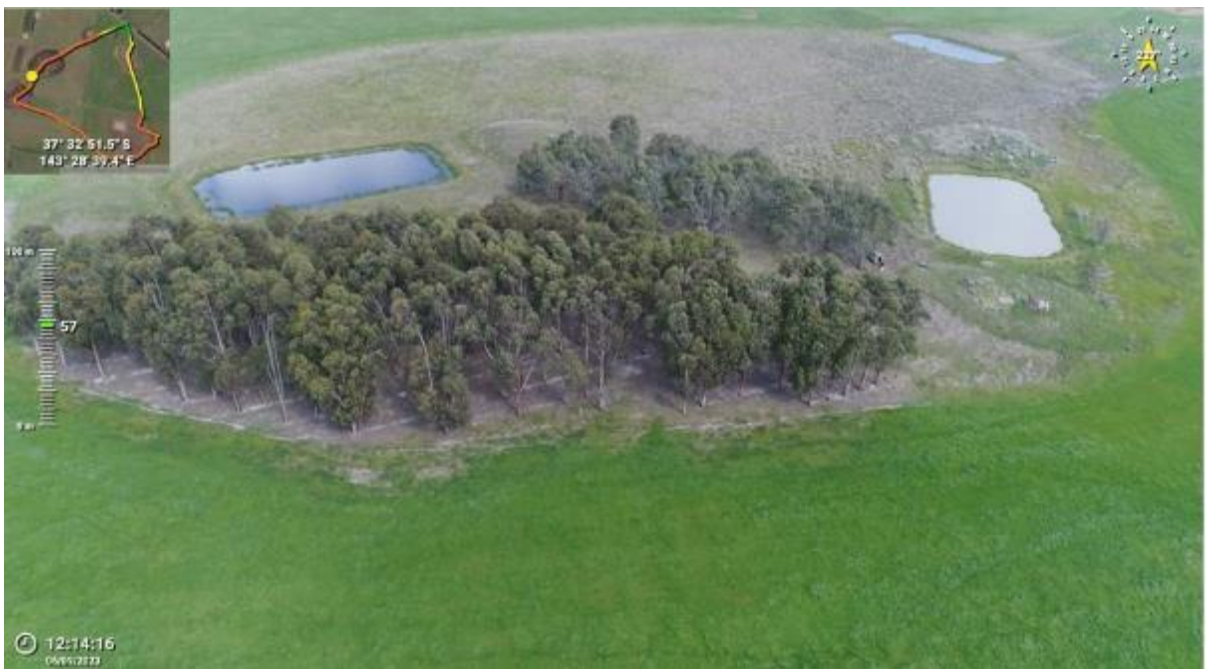
Appendix Plate 168. Waterbody 143; Low habitat quality (Ecology and Heritage Partners Pty Ltd 09/2023).

This copied document to be made available for the sole purpose of enabling its consideration and review as part of a planning process under the Planning and Environment Act 1987. The document must not be used for any purpose which may breach any copyright