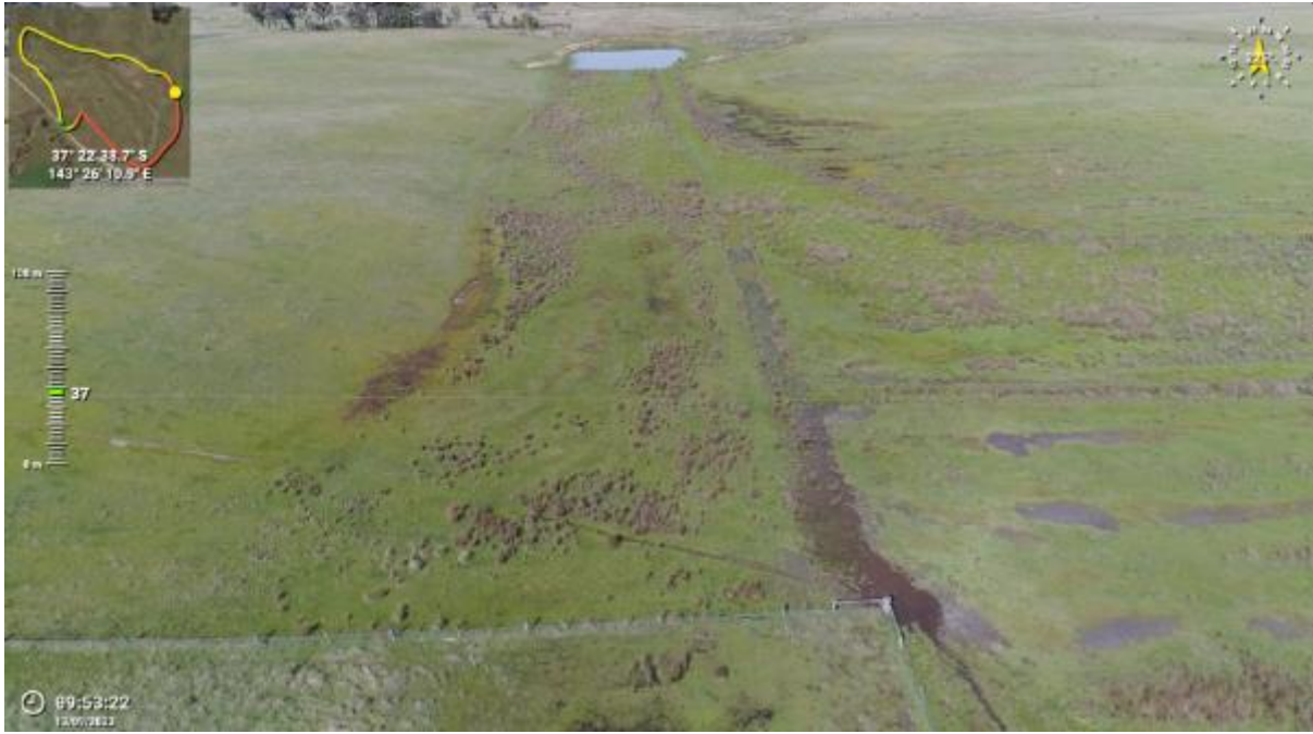
Appendix Plate 23. Waterbody 18; Low habitat quality (Ecology and Heritage Partners Pty Ltd 09/2023).