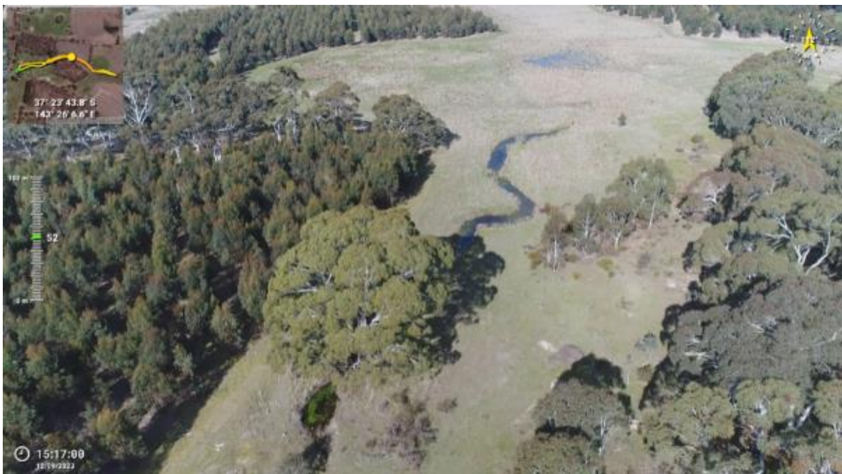
Appendix Plate 4. Waterbody 2; High habitat quality (Ecology and Heritage Partners Pty Ltd 09/2023).

This copied document to be made available for the sole purpose of enabling its consideration and review as part of a planning process under the Planning and Environment Act 1987. The document must not be used for any purpose which may breach any copyright