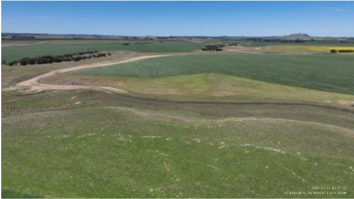
Appendix Plate 185. Waterbody 160; Low habitat quality (Ecology and Heritage Partners Pty Ltd 09/2023).