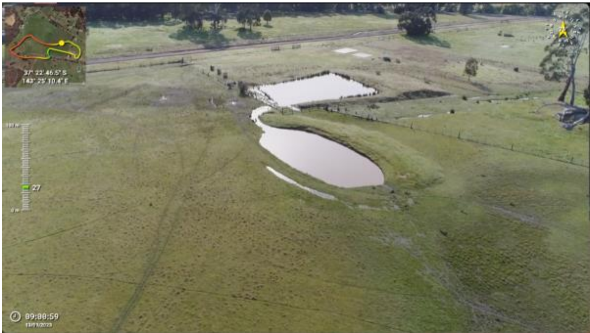
Appendix Plate 32. Waterbody 24; Low habitat quality.

This copied document to be made available for the sole purpose of enabling its consideration and review as part of a planning process under the Planning and Environment Act 1987. The document must not be used for any purpose which may breach any copyright