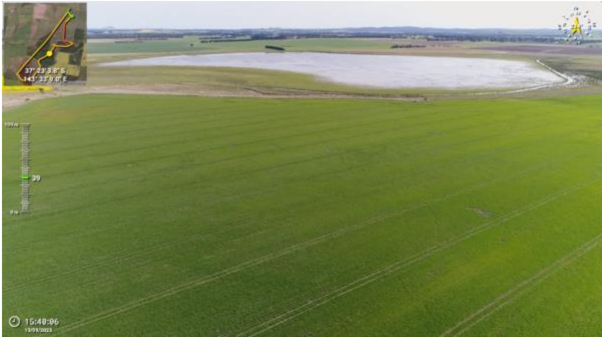
Appendix Plate 271. Waterbody 242; Moderate habitat quality.