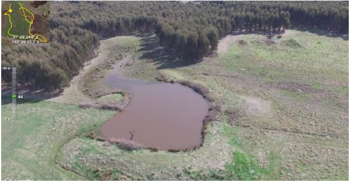
Appendix Plate 205. Waterbody 181; Moderate habitat quality (Ecology and Heritage Partners Pty Ltd 09/2023).