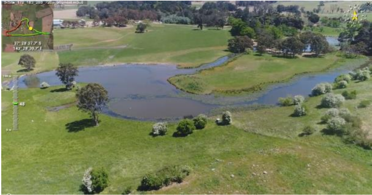
Appendix Plate 207. Waterbody 183; High habitat quality (Ecology and Heritage Partners Pty Ltd 09/2023).