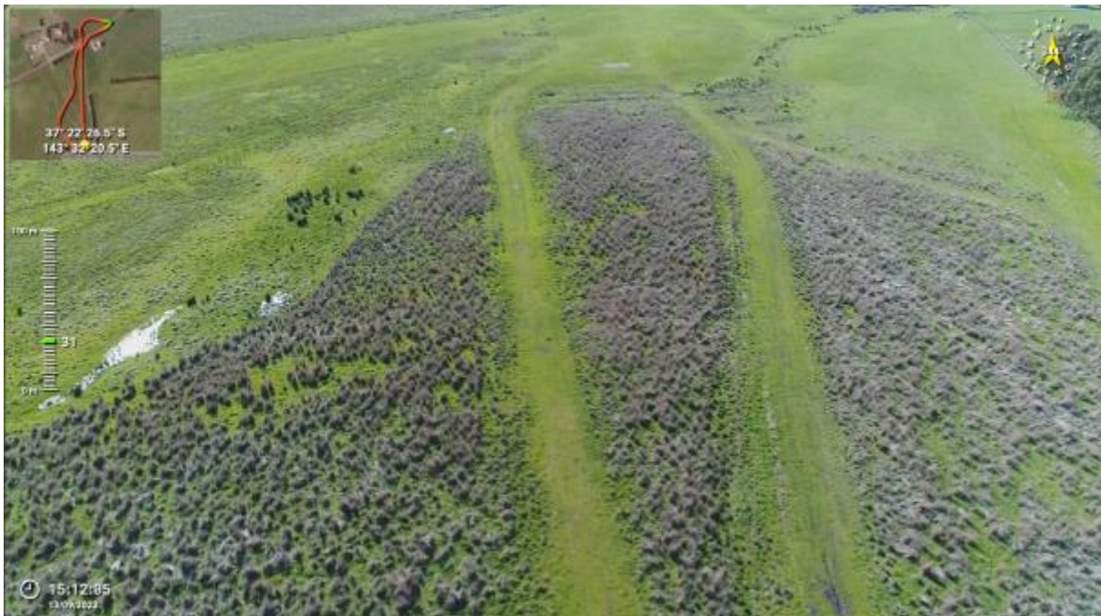
Appendix Plate 108. Waterbody 92; Low habitat quality (Ecology and Heritage Partners Pty Ltd 09/2023).

This copied document to be made available for the sole purpose of enabling its consideration and review as part of a planning process under the Planning and Environment Act 1987. The document must not be used for any purpose which may breach any copyright