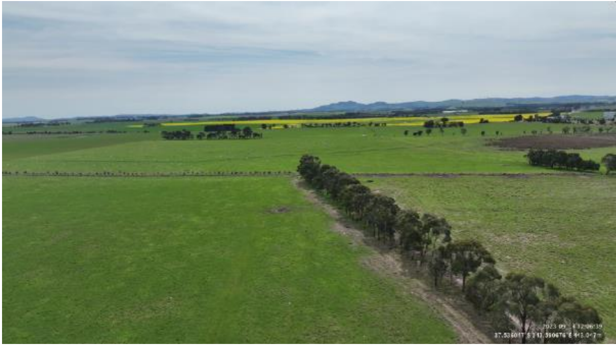
Appendix Plate 217. Waterbody 192; Low habitat quality (Ecology and Heritage Partners Pty Ltd 09/2023).