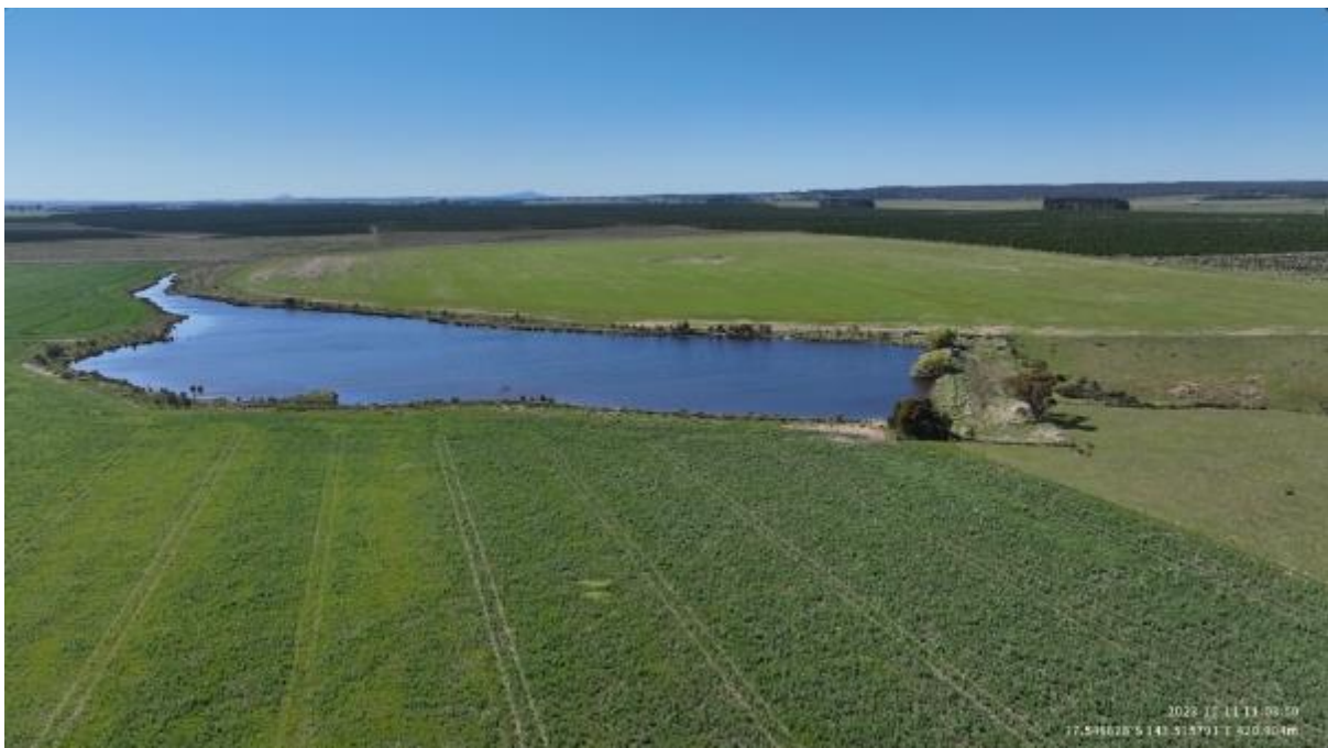
Appendix Plate 186. Waterbody 161; Low habitat quality (Ecology and Heritage Partners Pty Ltd 09/2023).

This copied document to be made available for the sole purpose of enabling its consideration and review as part of a planning process under the Planning and Environment Act 1987. The document must not be used for any purpose which may breach any copyright