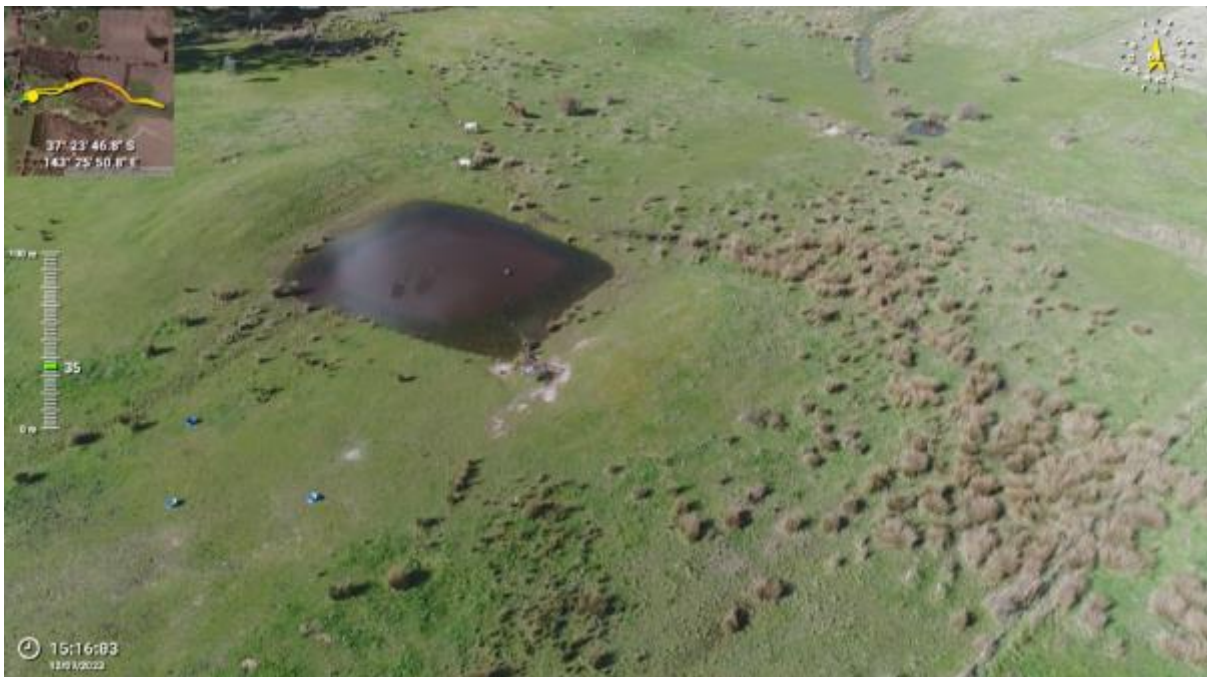
Appendix Plate 2. Waterbody 1; Moderate habitat quality (Ecology and Heritage Partners Pty Ltd 09/2023).

This copied document to be made available for the sole purpose of enabling its consideration and review as part of a planning process under the Planning and Environment Act 1987. The document must not be used for any purpose which may breach any copyright