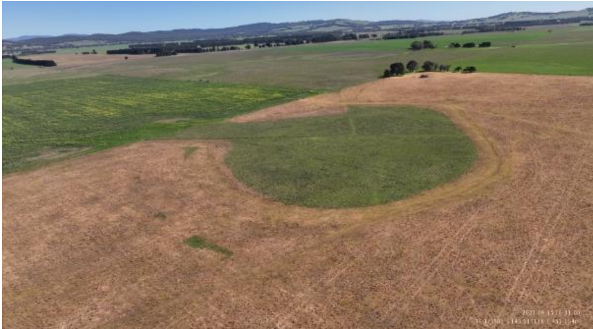
Appendix Plate 103. Waterbody 88; Low habitat quality (Ecology and Heritage Partners Pty Ltd 09/2023).