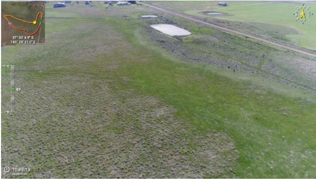
Appendix Plate 329. Waterbody 289; Low habitat quality (Ecology and Heritage Partners Pty Ltd 09/2023).