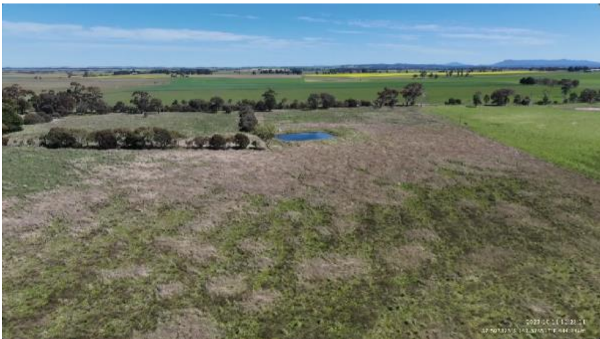
Appendix Plate 216. Waterbody 191; Low habitat quality (Ecology and Heritage Partners Pty Ltd 09/2023).

This copied document to be made available for the sole purpose of enabling its consideration and review as part of a planning process under the Planning and Environment Act 1987. The document must not be used for any purpose which may breach any copyright