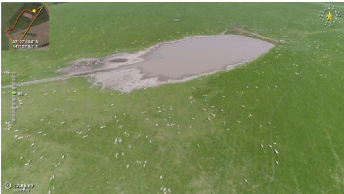
Appendix Plate 138. Waterbody 118; Low habitat quality.

This copied document to be made available for the sole purpose of enabling its consideration and review as part of a planning process under the Planning and Environment Act 1987. The document must not be used for any purpose which may breach any copyright