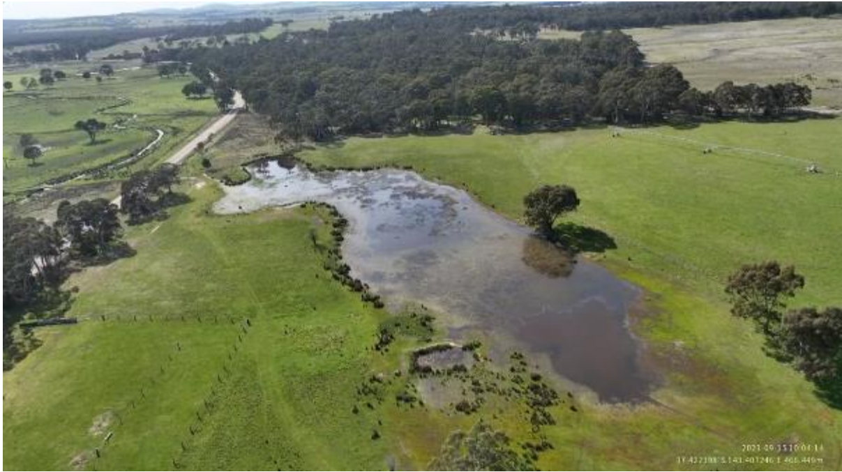
Appendix Plate 73. Waterbody 59; Moderate habitat quality (Ecology and Heritage Partners Pty Ltd 09/2023).