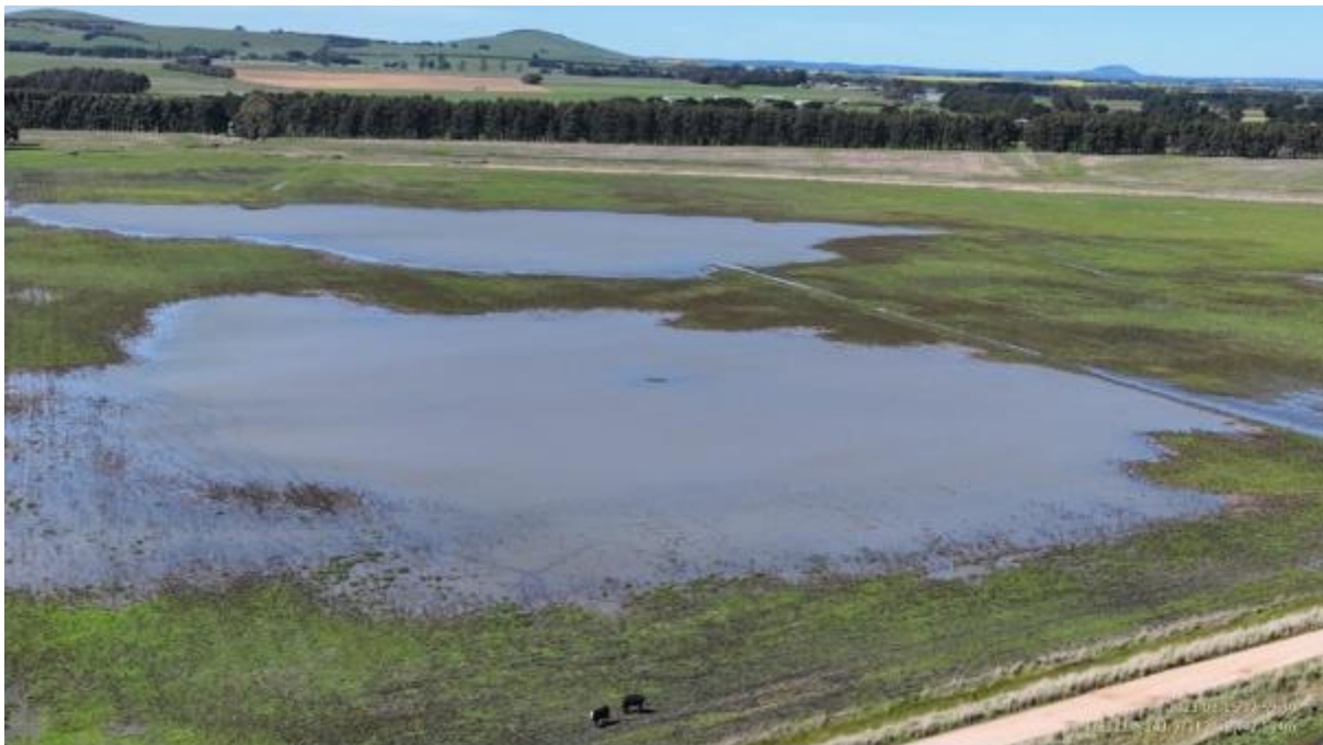
Appendix Plate 150. Waterbody 130; Moderate habitat quality.