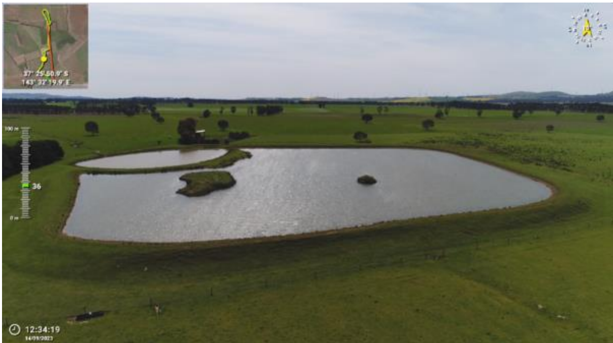
Appendix Plate 178. Waterbody 153; Low habitat quality (Ecology and Heritage Partners Pty Ltd 09/2023).

This copied document to be made available for the sole purpose of enabling its consideration and review as part of a planning process under the Planning and Environment Act 1987. The document must not be used for any purpose which may breach any copyright