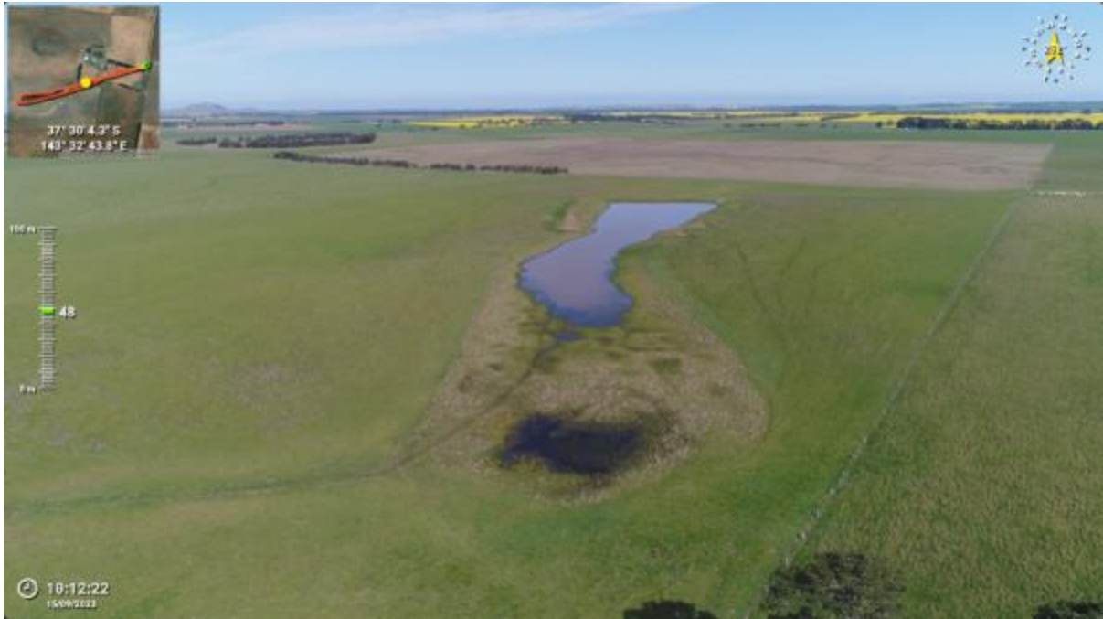
Appendix Plate 279. Waterbody 248; Moderate habitat quality (Ecology and Heritage Partners Pty Ltd 09/2023).