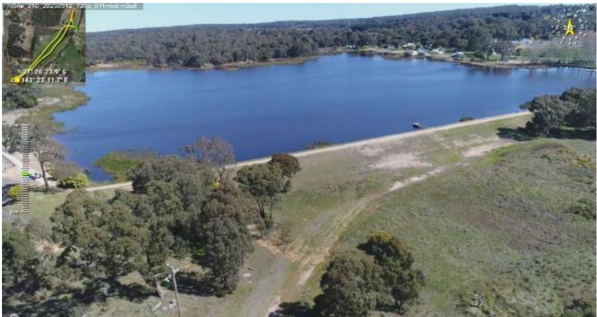
Appendix Plate 304. Waterbody 268; Low habitat quality (Ecology and Heritage Partners Pty Ltd 09/2023).

This copied document to be made available for the sole purpose of enabling its consideration and review as part of a planning process under the Planning and Environment Act 1987. The document must not be used for any purpose which may breach any copyright