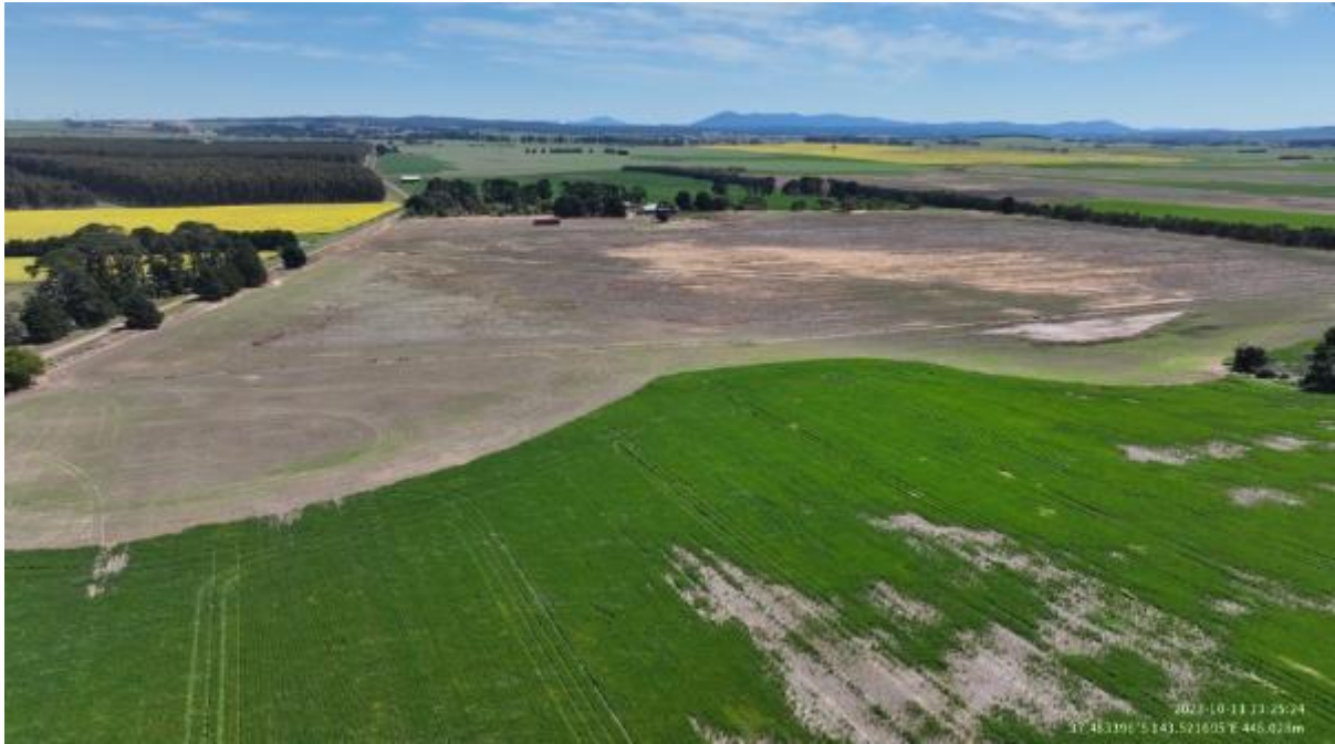
Appendix Plate 169. Waterbody 144; Low habitat quality (Ecology and Heritage Partners Pty Ltd 09/2023).