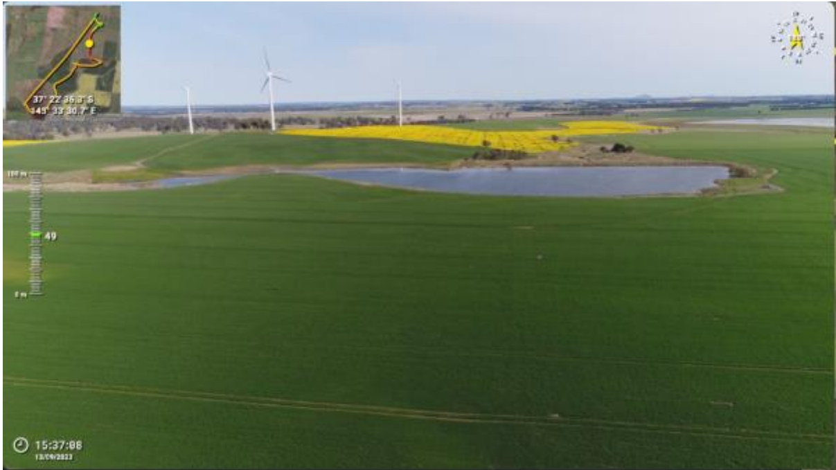
Appendix Plate 321. Waterbody 281; Low habitat quality (Ecology and Heritage Partners Pty Ltd 09/2023).