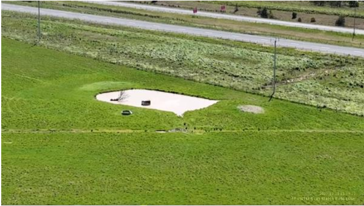
Appendix Plate 241. Waterbody 215; Low habitat quality (Ecology and Heritage Partners Pty Ltd 09/2023).