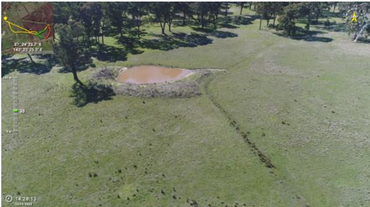
Appendix Plate 54. Waterbody 44; Low habitat quality.

This copied document to be made available for the sole purpose of enabling its consideration and review as part of a planning process under the Planning and Environment Act 1987. The document must not be used for any purpose which may breach any copyright