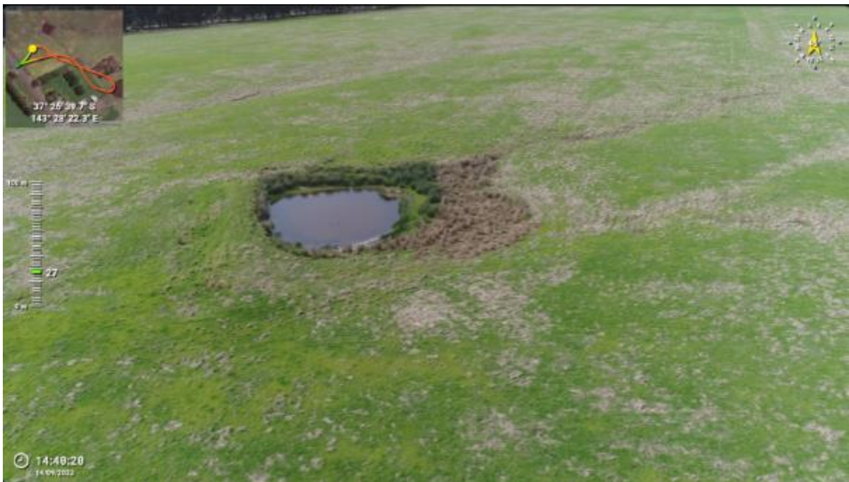
Appendix Plate 134. Waterbody 115; Moderate habitat quality (Ecology and Heritage Partners Pty Ltd 09/2023).