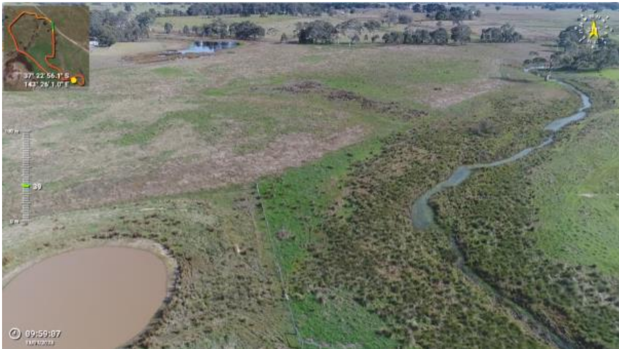
Appendix Plate 26. Waterbody 19; Low habitat quality (Ecology and Heritage Partners Pty Ltd 09/2023).

This copied document to be made available for the sole purpose of enabling its consideration and review as part of a planning process under the Planning and Environment Act 1987. The document must not be used for any purpose which may breach any copyright