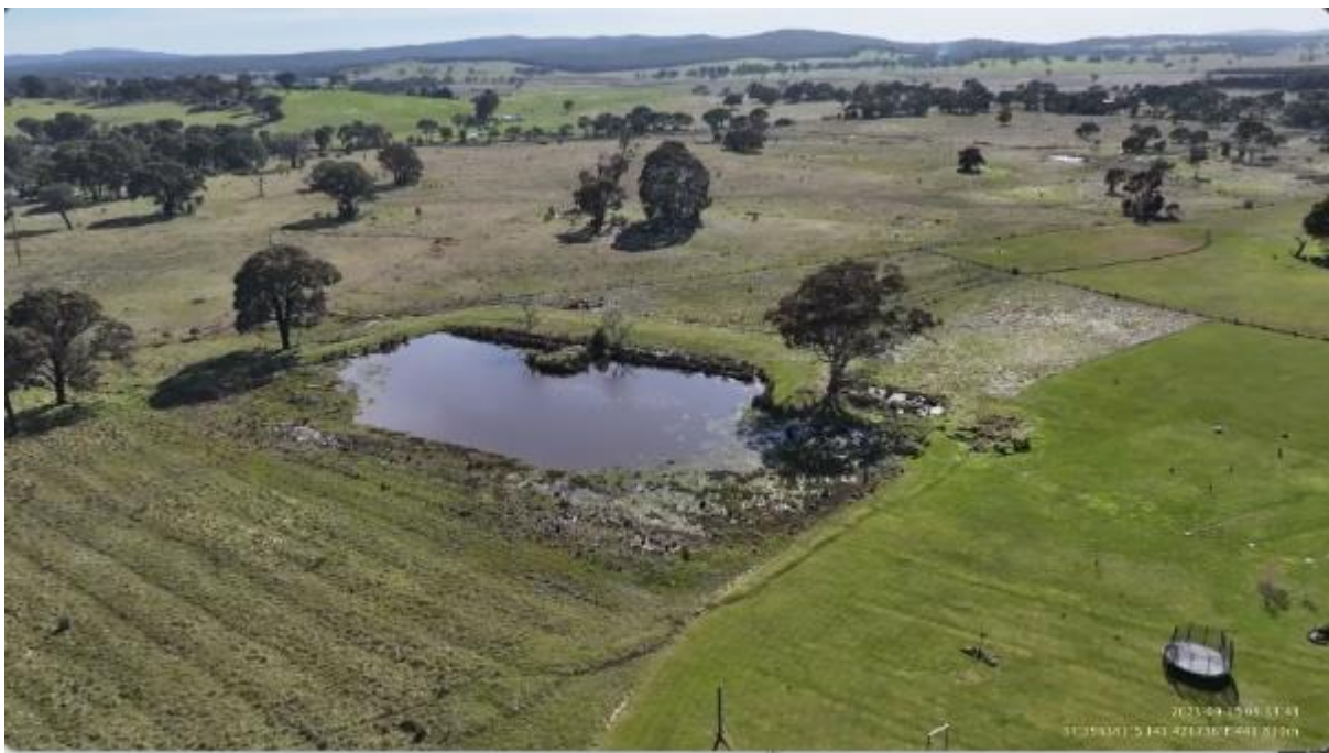
Appendix Plate 42. Waterbody 33; Low habitat quality (Ecology and Heritage Partners Pty Ltd 09/2023).

This copied document to be made available for the sole purpose of enabling its consideration and review as part of a planning process under the Planning and Environment Act 1987. The document must not be used for any purpose which may breach any copyright