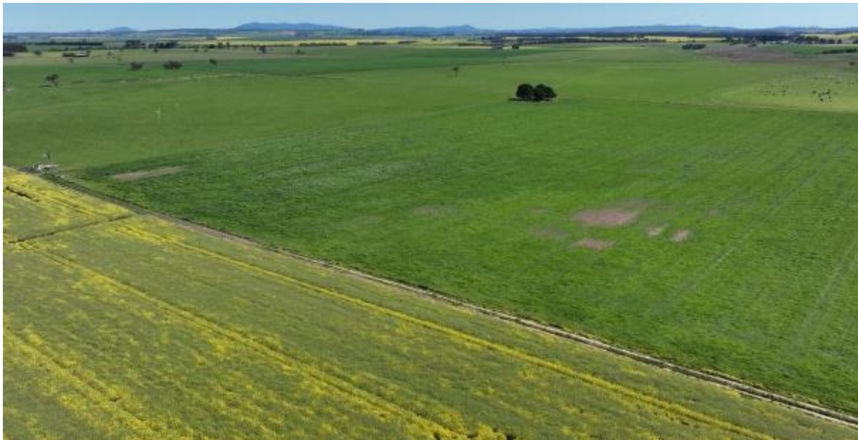
Appendix Plate 198. Waterbody 174; Low habitat quality (Ecology and Heritage Partners Pty Ltd 09/2023).

This copied document to be made available for the sole purpose of enabling its consideration and review as part of a planning process under the Planning and Environment Act 1987. The document must not be used for any purpose which may breach any copyright