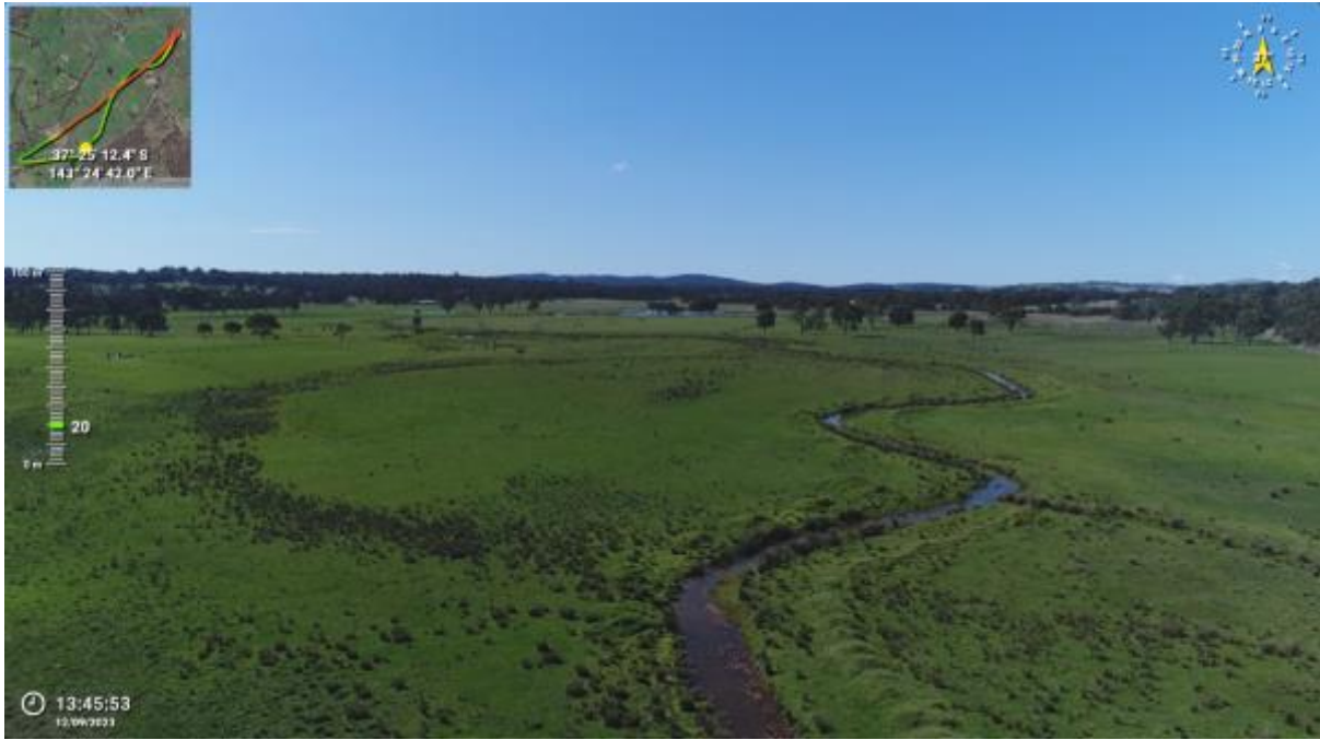
Appendix Plate 47. Waterbody 37; Low habitat quality (Ecology and Heritage Partners Pty Ltd 09/2023).