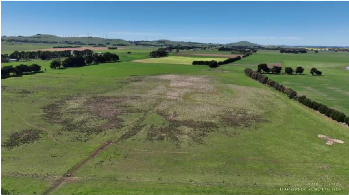
Appendix Plate 277. Waterbody 246; Low habitat quality (Ecology and Heritage Partners Pty Ltd 09/2023).