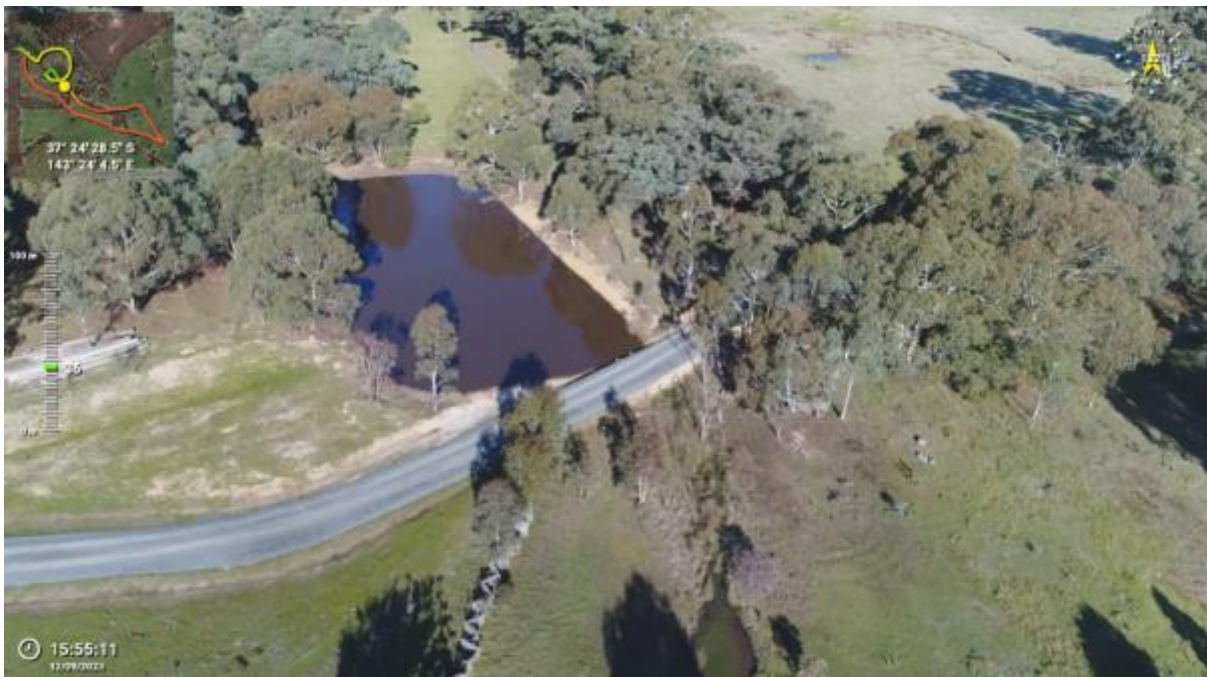
Appendix Plate 68. Waterbody 55; Low habitat quality (Ecology and Heritage Partners Pty Ltd 09/2023).

This copied document to be made available for the sole purpose of enabling its consideration and review as part of a planning process under the Planning and Environment Act 1987. The document must not be used for any purpose which may breach any copyright