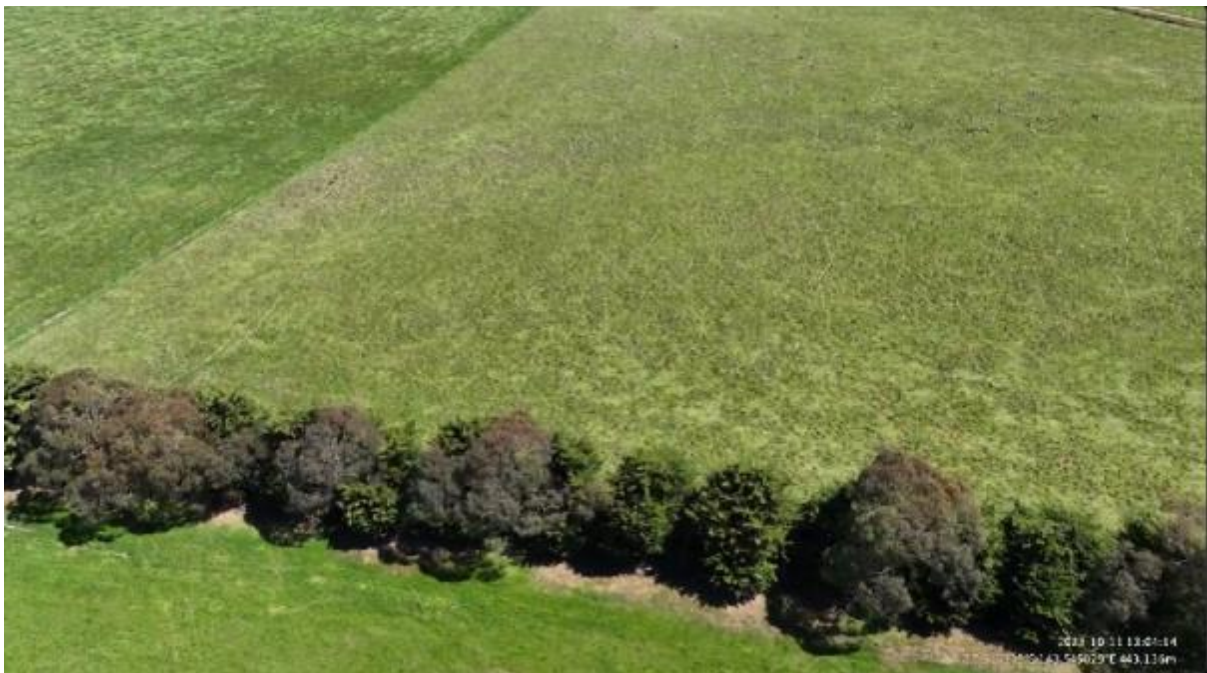
Appendix Plate 284. Waterbody 253; Low habitat quality (Ecology and Heritage Partners Pty Ltd 09/2023).

This copied document to be made available for the sole purpose of enabling its consideration and review as part of a planning process under the Planning and Environment Act 1987. The document must not be used for any purpose which may breach any copyright