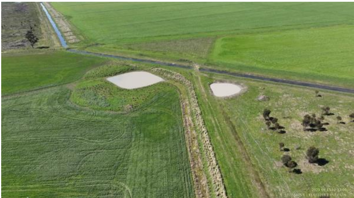
Appendix Plate 294. Waterbody 261; Moderate habitat quality (Ecology and Heritage Partners Pty Ltd 09/2023).