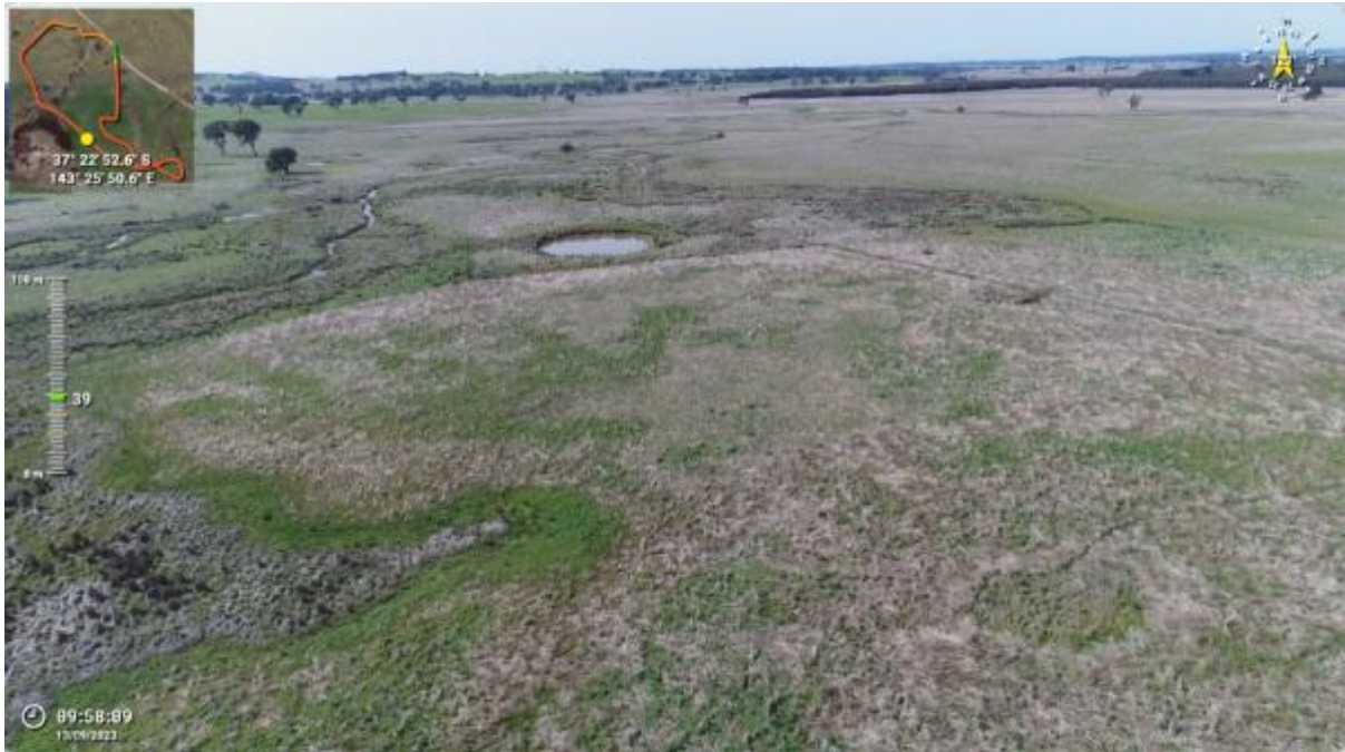
Appendix Plate 27. Waterbody 20; Low habitat quality.