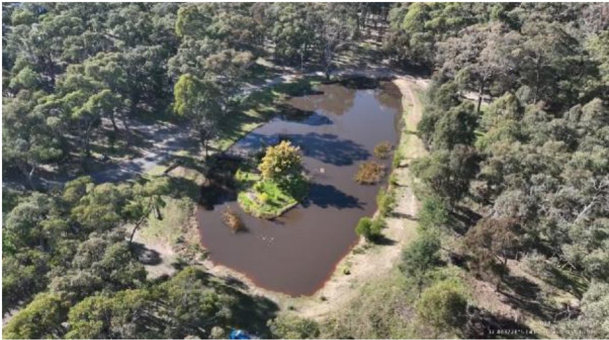
Appendix Plate 70. Waterbody 56; Moderate habitat quality (Ecology and Heritage Partners Pty Ltd 09/2023).

This copied document to be made available for the sole purpose of enabling its consideration and review as part of a planning process under the Planning and Environment Act 1987. The document must not be used for any purpose which may breach any copyright