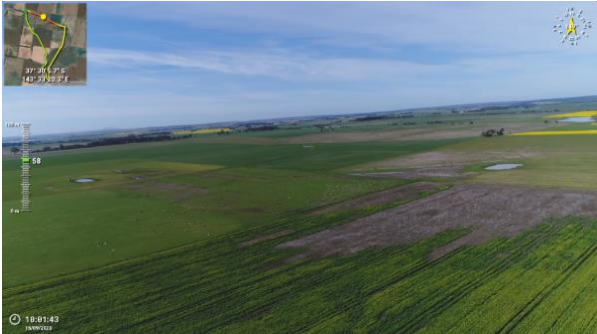
Appendix Plate 213. Waterbody 188; Low habitat quality (Ecology and Heritage Partners Pty Ltd 09/2023).