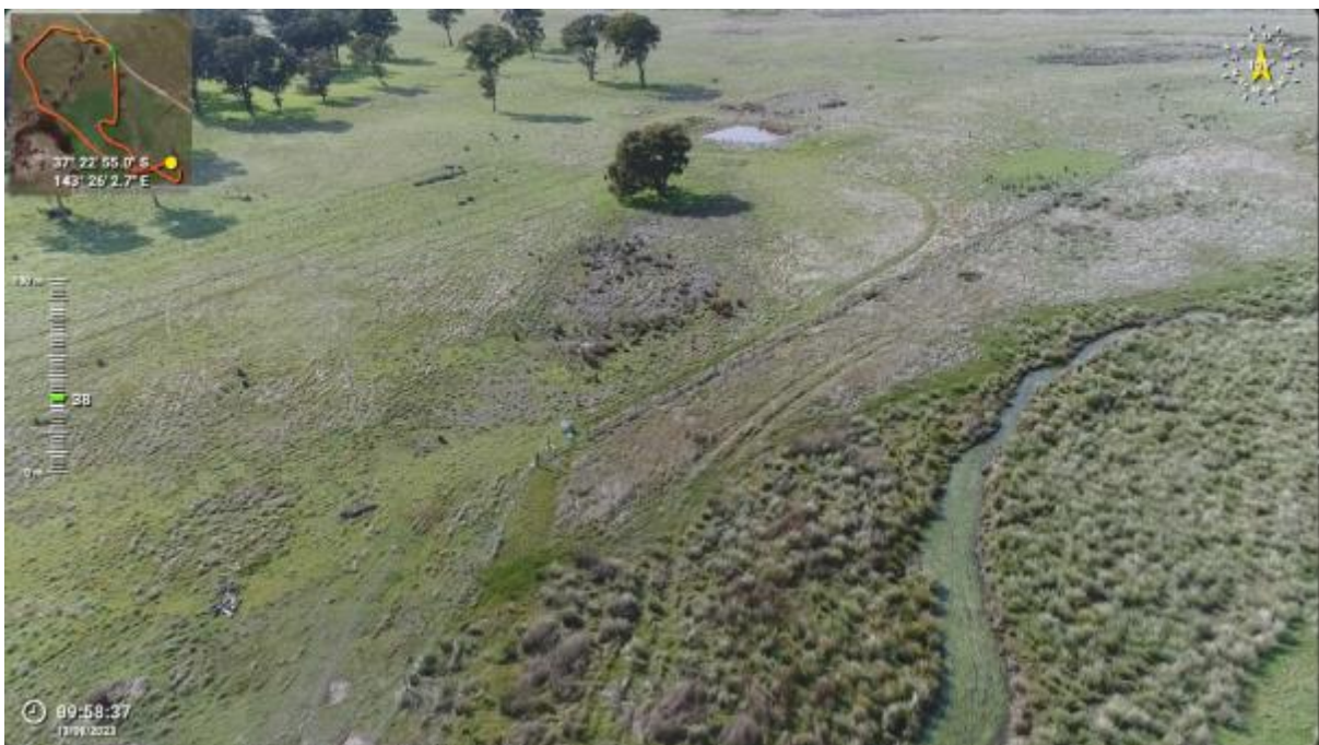
Appendix Plate 28. Waterbody 21; Low habitat quality.

This copied document to be made available for the sole purpose of enabling its consideration and review as part of a planning process under the Planning and Environment Act 1987. The document must not be used for any purpose which may breach any copyright