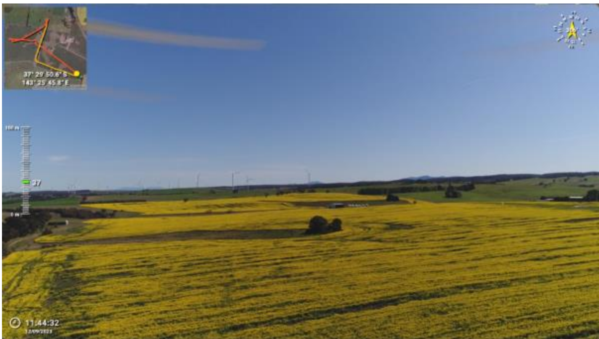
Appendix Plate 242. Waterbody 216; Low habitat quality.

This copied document to be made available for the sole purpose of enabling its consideration and review as part of a planning process under the Planning and Environment Act 1987. The document must not be used for any purpose which may breach any copyright