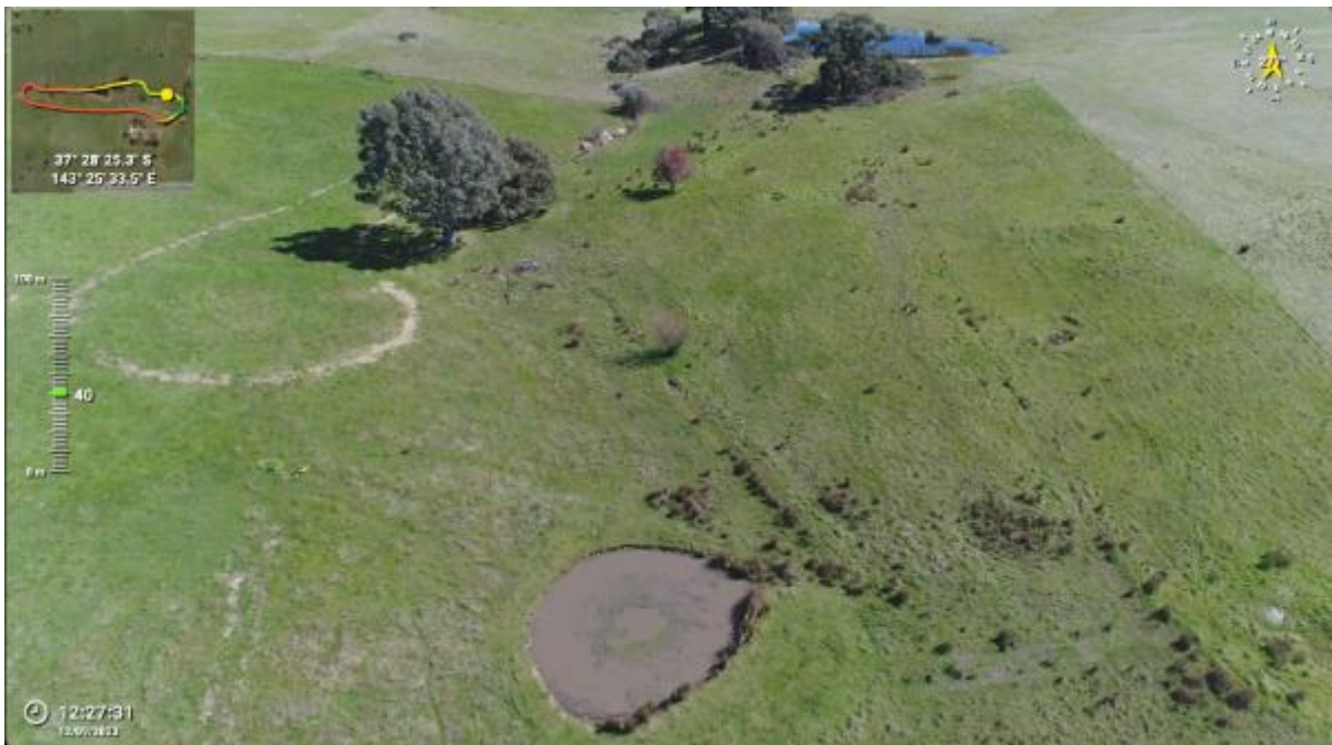
Appendix Plate 188. Waterbody 163; Low habitat quality (Ecology and Heritage Partners Pty Ltd 09/2023).

This copied document to be made available for the sole purpose of enabling its consideration and review as part of a planning process under the Planning and Environment Act 1987. The document must not be used for any purpose which may breach any copyright