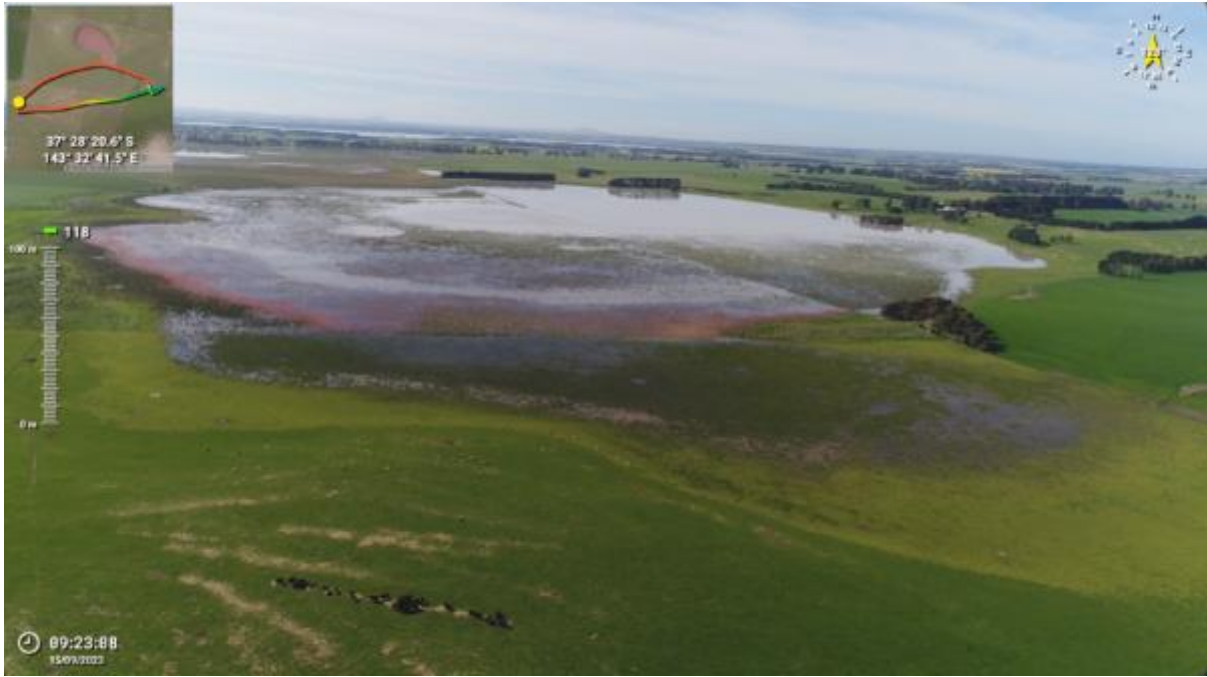
Appendix Plate 161. Waterbody 139; High habitat quality (Ecology and Heritage Partners Pty Ltd 09/2023).