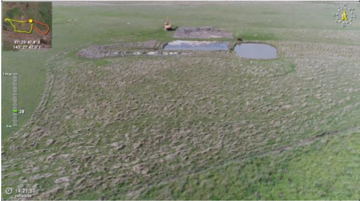
Appendix Plate 265. Waterbody 236; Low habitat quality (Ecology and Heritage Partners Pty Ltd 09/2023).