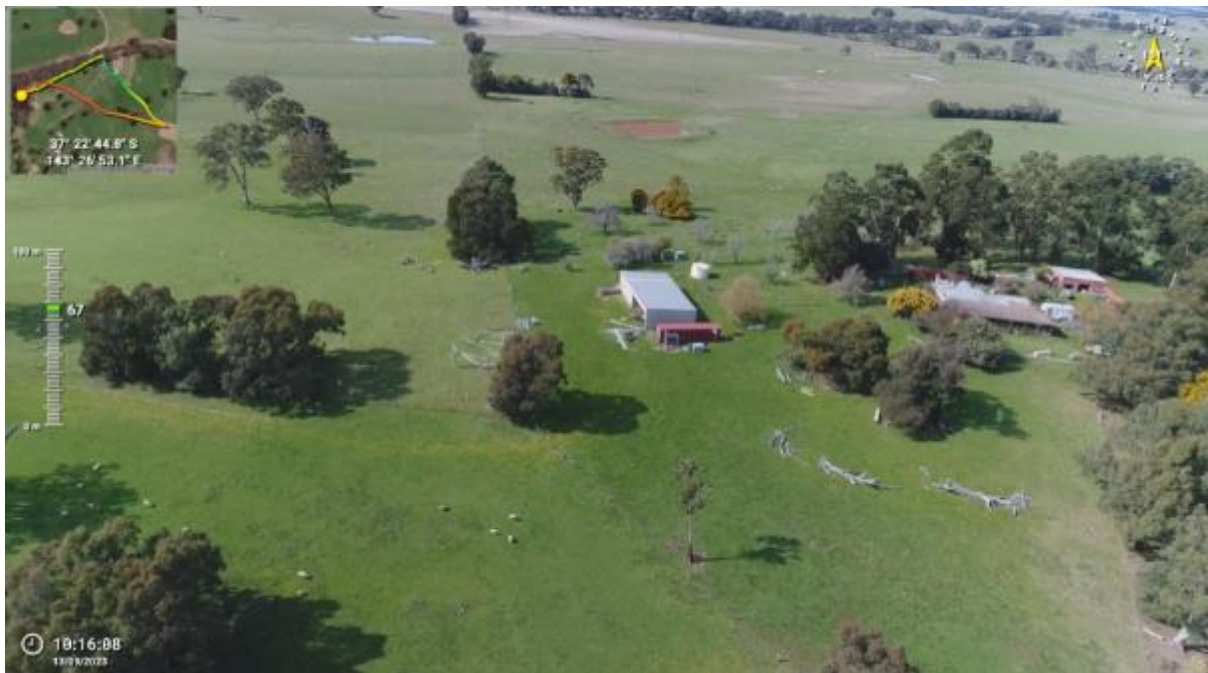
Appendix Plate 20. Waterbody 15; Low habitat quality (Ecology and Heritage Partners Pty Ltd 09/2023).

This copied document to be made available for the sole purpose of enabling its consideration and review as part of a planning process under the Planning and Environment Act 1987. The document must not be used for any purpose which may breach any copyright