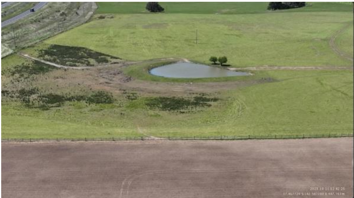
Appendix Plate 272. Waterbody 243; Low habitat quality (Ecology and Heritage Partners Pty Ltd 09/2023).

This copied document to be made available for the sole purpose of enabling its consideration and review as part of a planning process under the Planning and Environment Act 1987. The document must not be used for any purpose which may breach any copyright