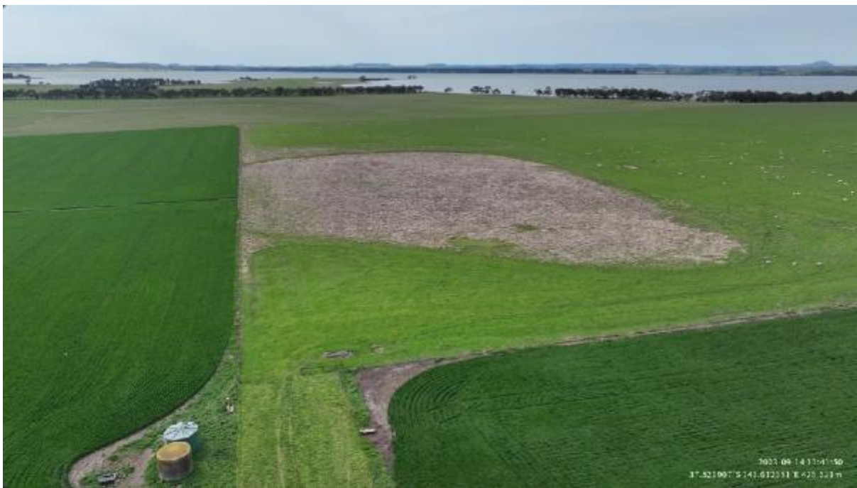
Appendix Plate 230. Waterbody 206; Low habitat quality.

This copied document to be made available for the sole purpose of enabling its consideration and review as part of a planning process under the Planning and Environment Act 1987. The document must not be used for any purpose which may breach any copyright