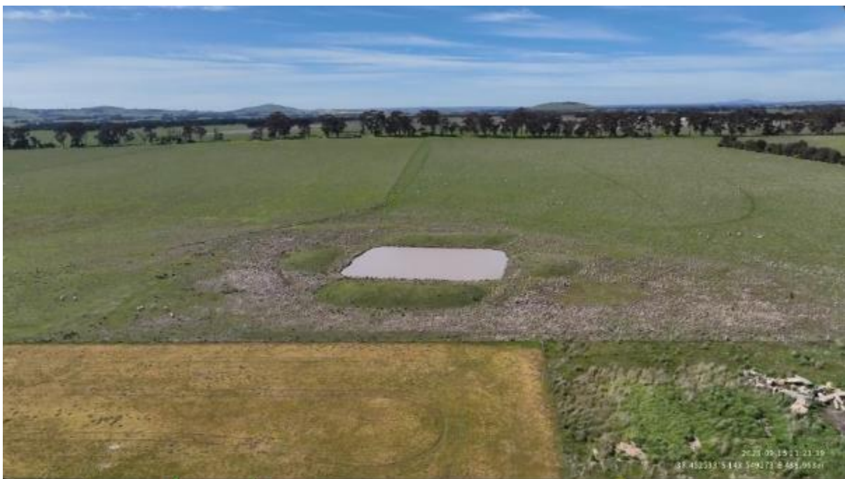
Appendix Plate 314. Waterbody 275; Low habitat quality.

This copied document to be made available for the sole purpose of enabling its consideration and review as part of a planning process under the Planning and Environment Act 1987. The document must not be used for any purpose which may breach any copyright