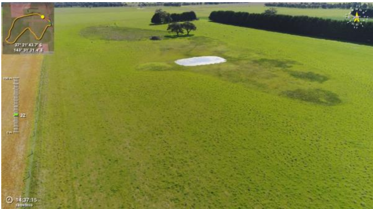
Appendix Plate 98. Waterbody 83; Low habitat quality (Ecology and Heritage Partners Pty Ltd 09/2023).

This copied document to be made available for the sole purpose of enabling its consideration and review as part of a planning process under the Planning and Environment Act 1987. The document must not be used for any purpose which may breach any copyright