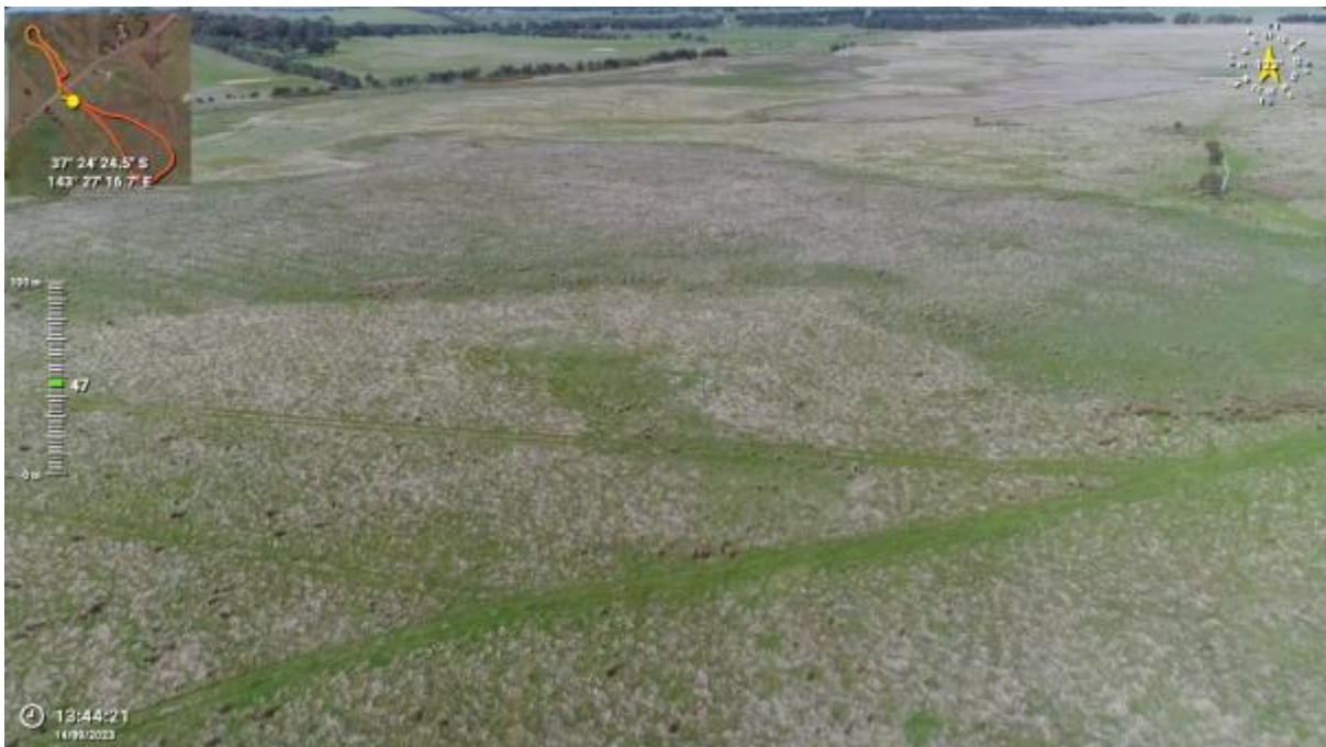
Appendix Plate 76. Waterbody 62; Low habitat quality (Ecology and Heritage Partners Pty Ltd 09/2023).

This copied document to be made available for the sole purpose of enabling its consideration and review as part of a planning process under the Planning and Environment Act 1987. The document must not be used for any purpose which may breach any copyright