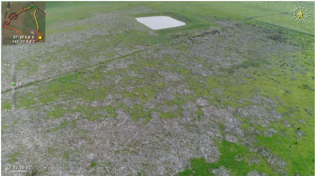
Appendix Plate 282. Waterbody 251; Low habitat quality (Ecology and Heritage Partners Pty Ltd 09/2023).

This copied document to be made available for the sole purpose of enabling its consideration and review as part of a planning process under the Planning and Environment Act 1987. The document must not be used for any purpose which may breach any copyright