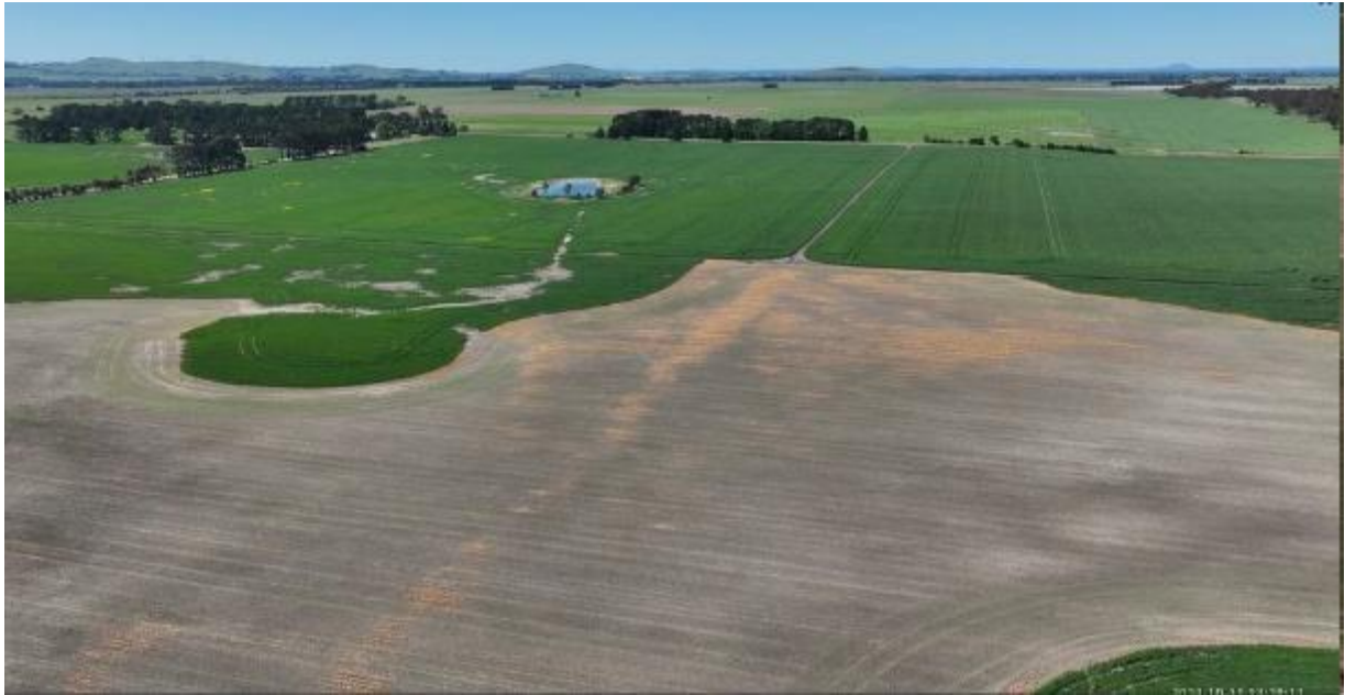
Appendix Plate 143. Waterbody 123; Low habitat quality (Ecology and Heritage Partners Pty Ltd 09/2023).