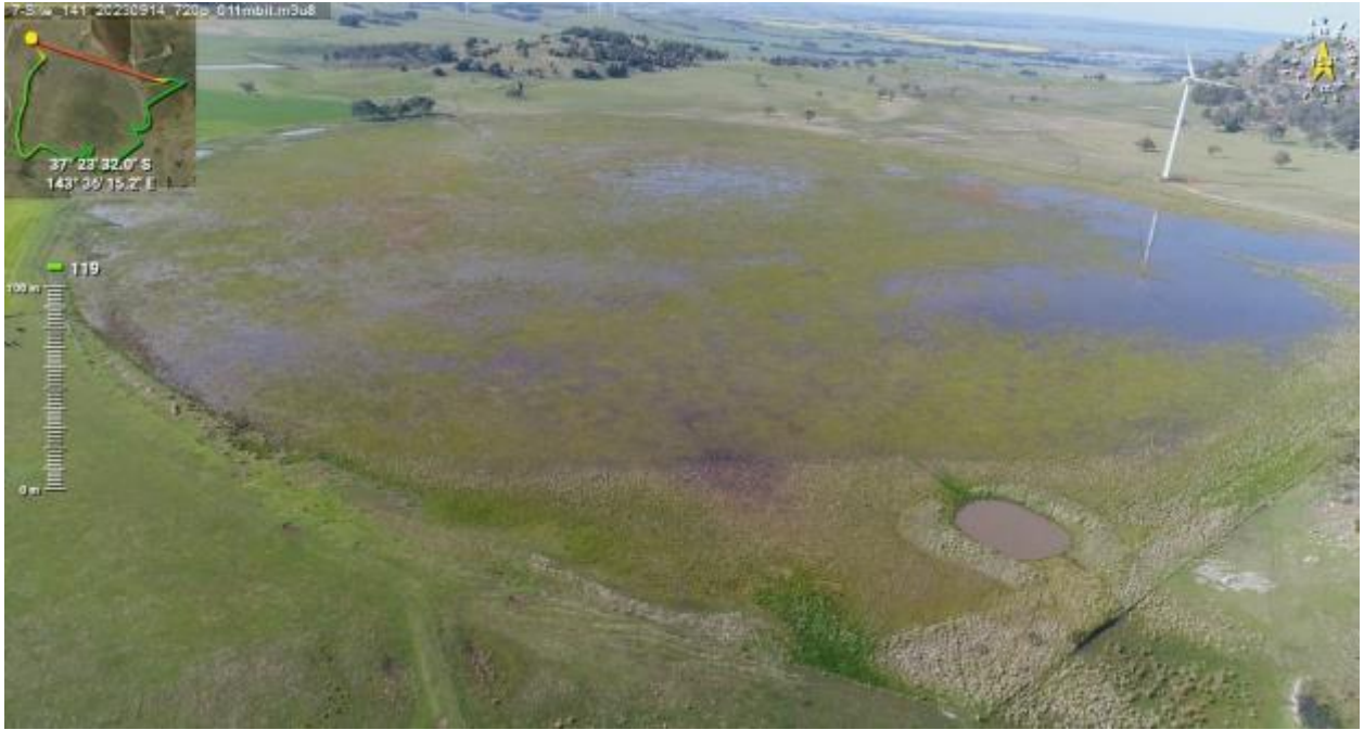
Appendix Plate 165. Waterbody 141; High habitat quality.