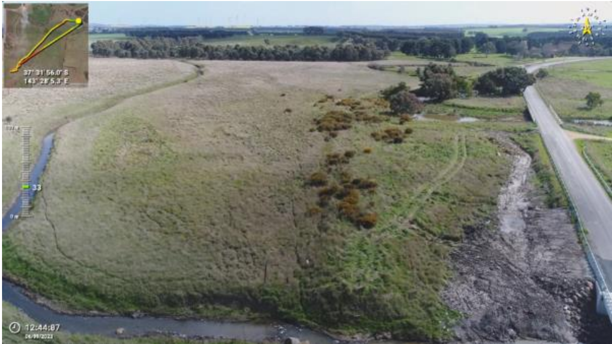
Appendix Plate 233. Waterbody 208; Low habitat quality.