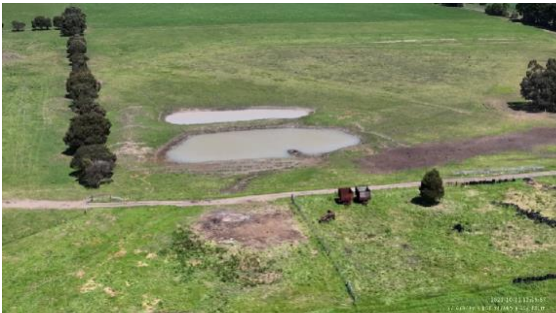
Appendix Plate 146. Waterbody 127; Low habitat quality.

This copied document to be made available for the sole purpose of enabling its consideration and review as part of a planning process under the Planning and Environment Act 1987. The document must not be used for any purpose which may breach any copyright