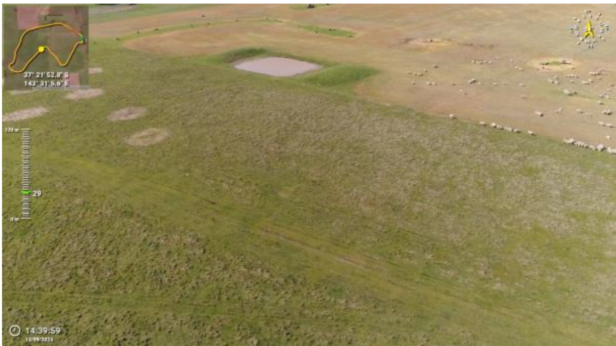
Appendix Plate 100. Waterbody 85; Low habitat quality (Ecology and Heritage Partners Pty Ltd 09/2023).

This copied document to be made available for the sole purpose of enabling its consideration and review as part of a planning process under the Planning and Environment Act 1987. The document must not be used for any purpose which may breach any copyright