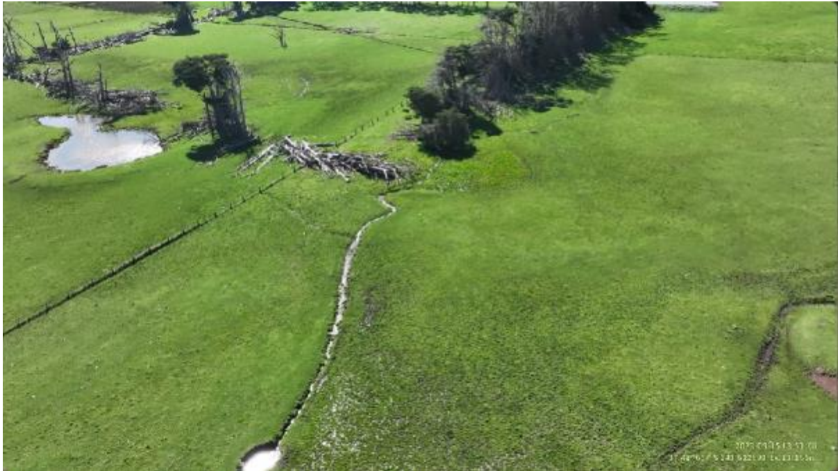
Appendix Plate 273. Waterbody 244; Moderate habitat quality (Ecology and Heritage Partners Pty Ltd 09/2023).