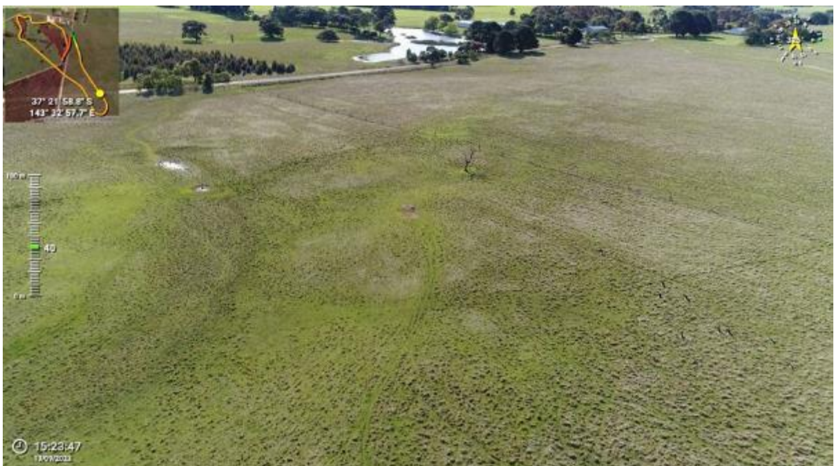
Appendix Plate 176. Waterbody 151; Low habitat quality (Ecology and Heritage Partners Pty Ltd 09/2023).

This copied document to be made available for the sole purpose of enabling its consideration and review as part of a planning process under the Planning and Environment Act 1987. The document must not be used for any purpose which may breach any copyright