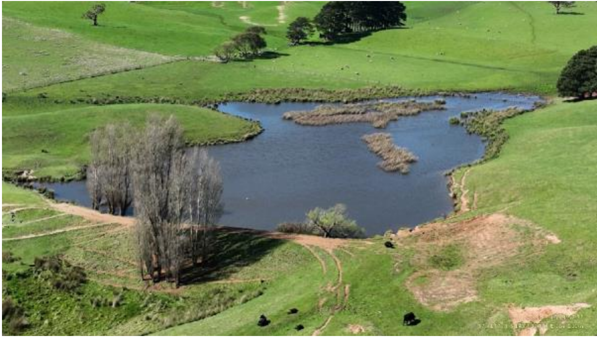
Appendix Plate 275. Waterbody 244; Moderate habitat quality (Ecology and Heritage Partners Pty Ltd 09/2023).