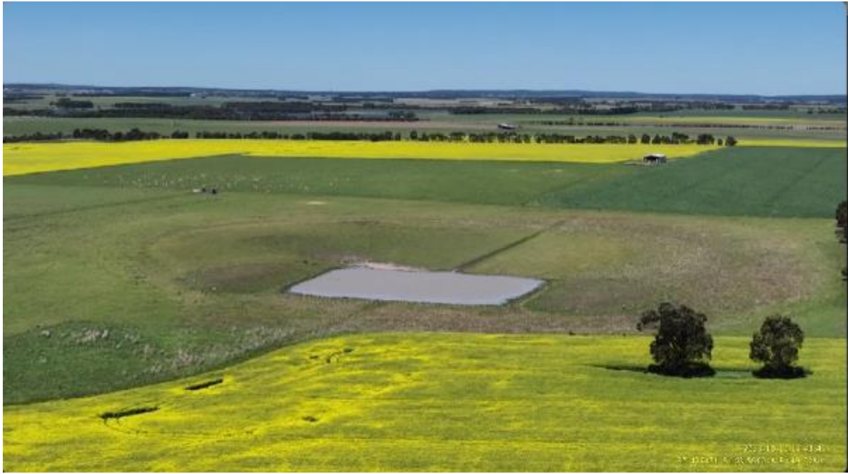
Appendix Plate 243. Waterbody 217; Low habitat quality (Ecology and Heritage Partners Pty Ltd 09/2023).