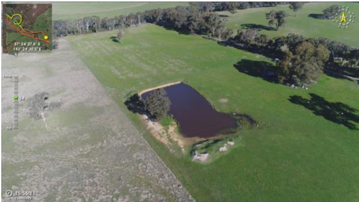
Appendix Plate 66. Waterbody 54; Low habitat quality (Ecology and Heritage Partners Pty Ltd 09/2023).

This copied document to be made available for the sole purpose of enabling its consideration and review as part of a planning process under the Planning and Environment Act 1987. The document must not be used for any purpose which may breach any copyright