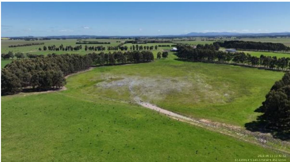
Appendix Plate 248. Waterbody 221; Moderate habitat quality (Ecology and Heritage Partners Pty Ltd 09/2023).