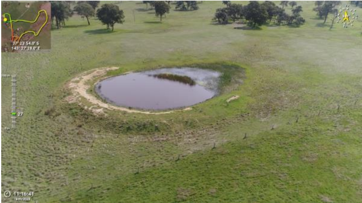
Appendix Plate 77. Waterbody 63; Low habitat quality (Ecology and Heritage Partners Pty Ltd 09/2023).