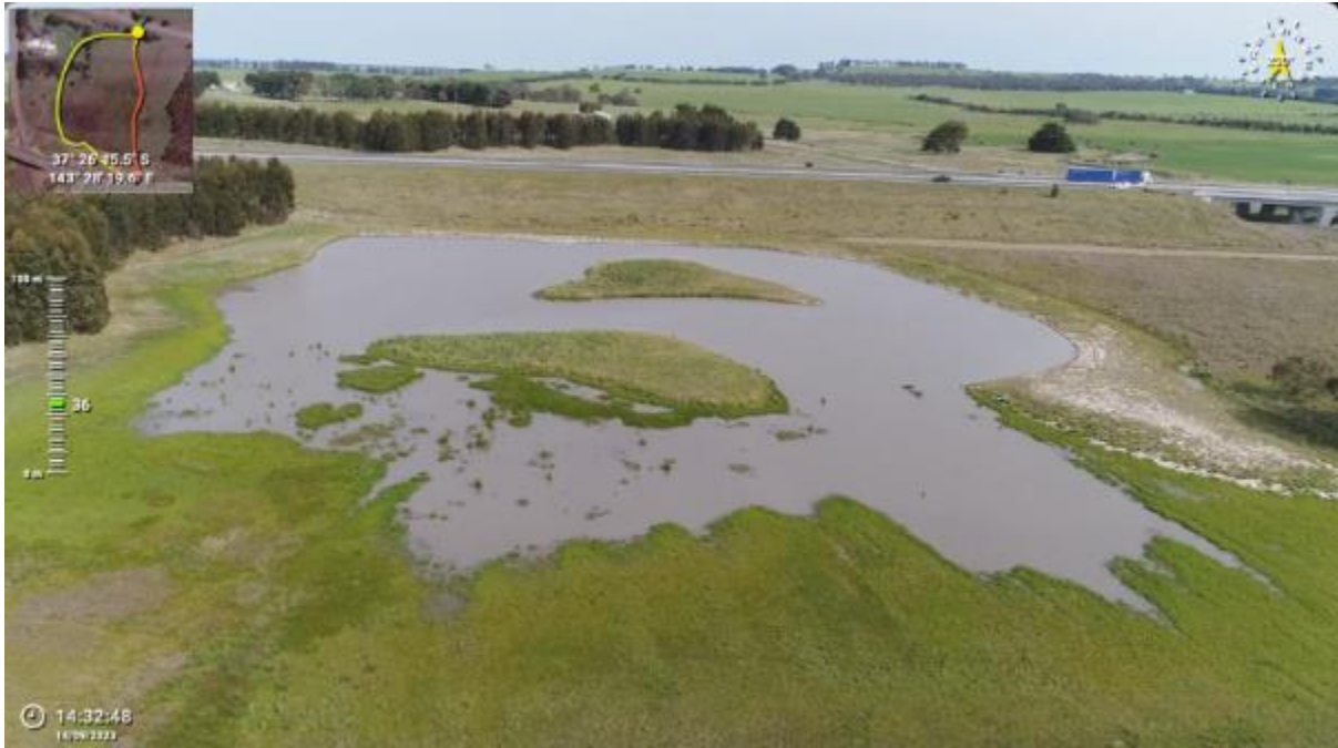
Appendix Plate 133. Waterbody 114; Moderate habitat quality (Ecology and Heritage Partners Pty Ltd 09/2023).