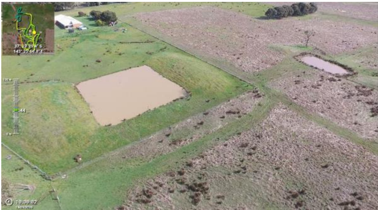
Appendix Plate 46. Waterbody 36; Low habitat quality.

This copied document to be made available for the sole purpose of enabling its consideration and review as part of a planning process under the Planning and Environment Act 1987. The document must not be used for any purpose which may breach any copyright