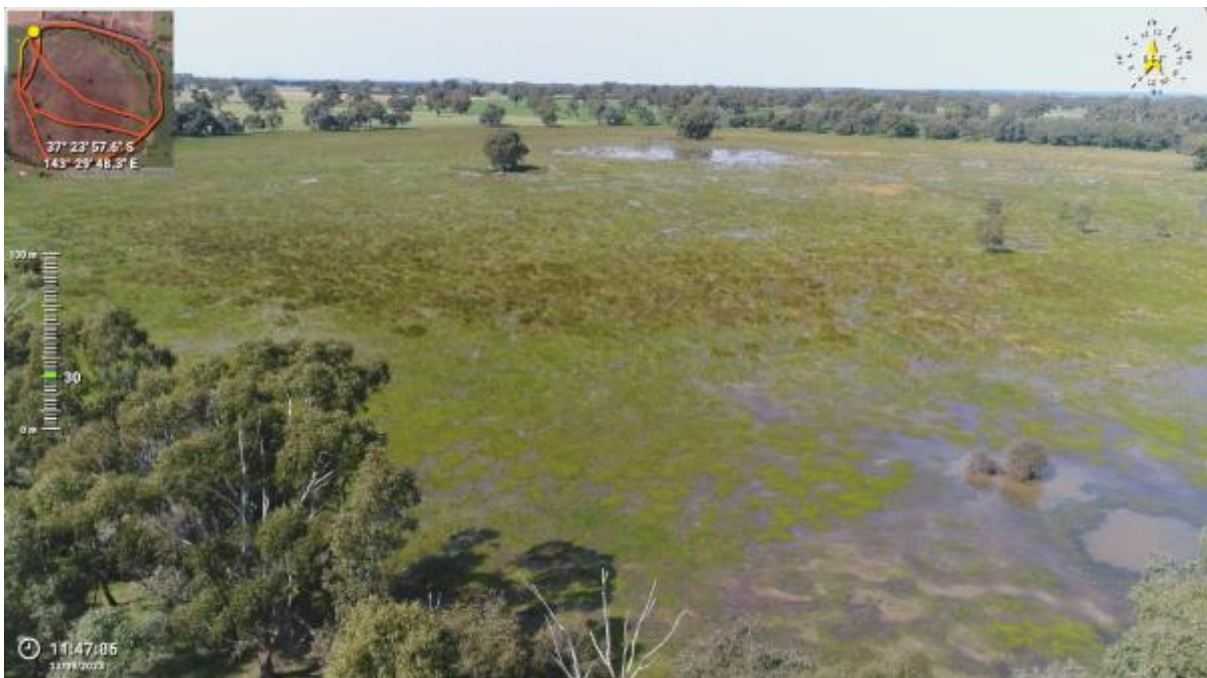
Appendix Plate 124. Waterbody 106; High habitat quality (Ecology and Heritage Partners Pty Ltd 09/2023).

This copied document to be made available for the sole purpose of enabling its consideration and review as part of a planning process under the Planning and Environment Act 1987. The document must not be used for any purpose which may breach any copyright