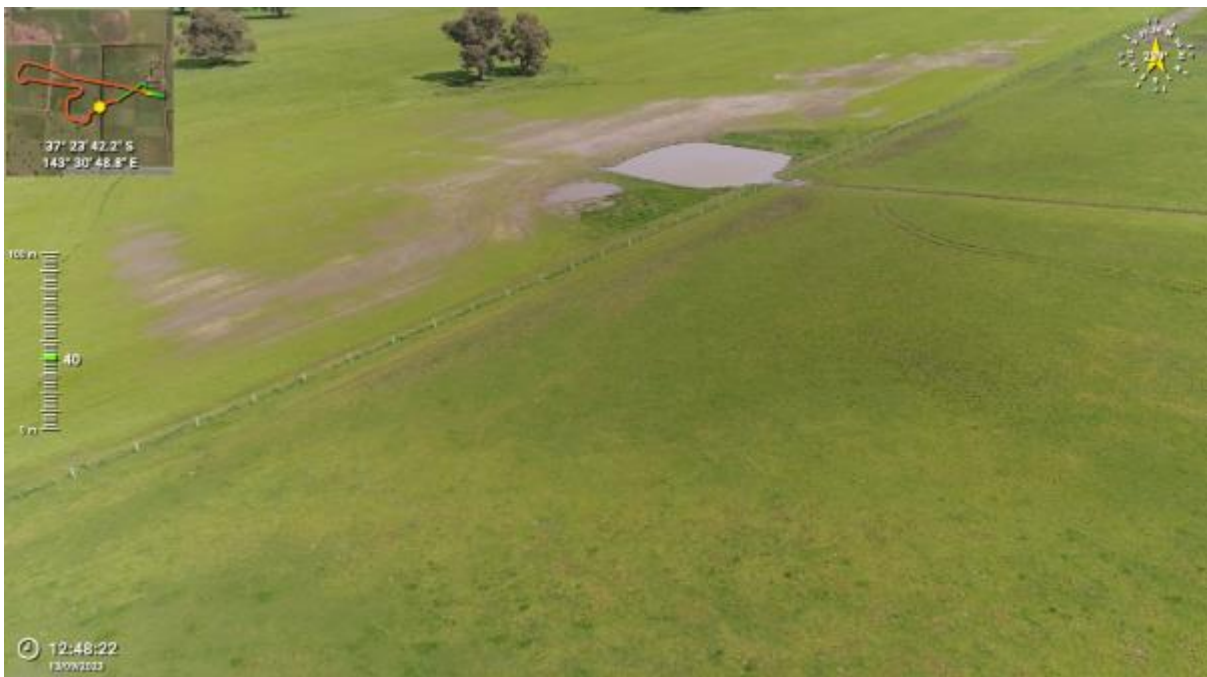
Appendix Plate 118. Waterbody 101; Low habitat quality.

This copied document to be made available for the sole purpose of enabling its consideration and review as part of a planning process under the Planning and Environment Act 1987. The document must not be used for any purpose which may breach any copyright