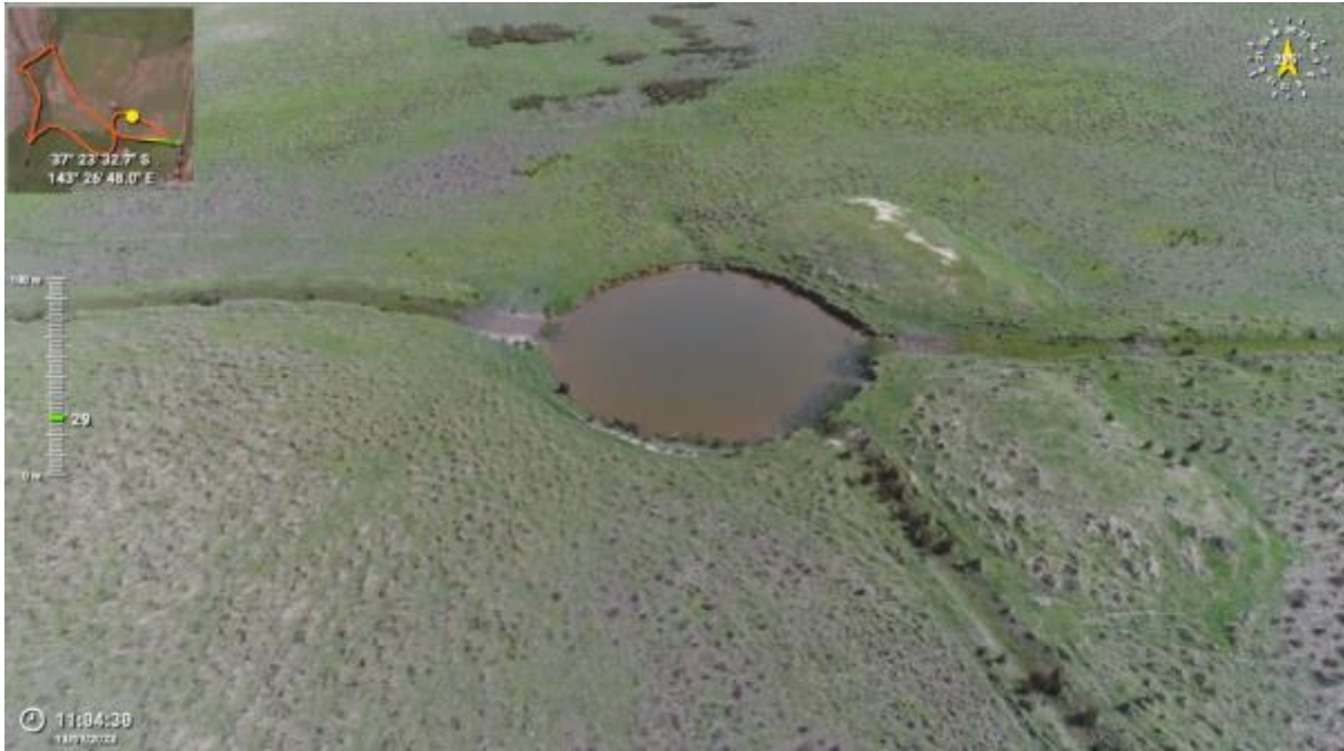
Appendix Plate 7. Waterbody 4; Low habitat quality (Ecology and Heritage Partners Pty Ltd 09/2023).