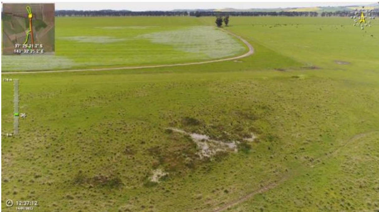
Appendix Plate 158. Waterbody 136; Low habitat quality (Ecology and Heritage Partners Pty Ltd 09/2023).

This copied document to be made available for the sole purpose of enabling its consideration and review as part of a planning process under the Planning and Environment Act 1987. The document must not be used for any purpose which may breach any copyright