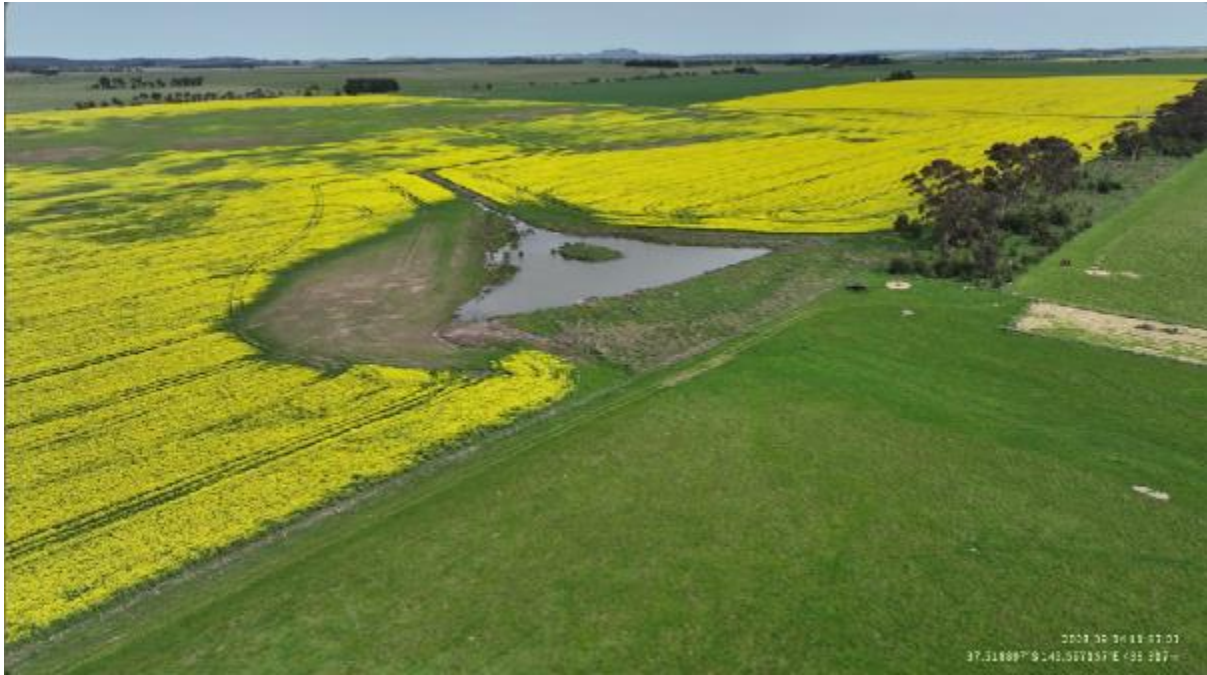
Appendix Plate 195. Waterbody 171; Low habitat quality (Ecology and Heritage Partners Pty Ltd 09/2023).