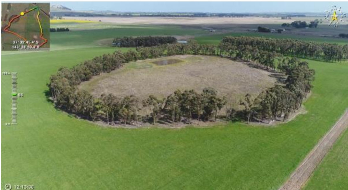
Appendix Plate 252. Waterbody 226; Moderate habitat quality (Ecology and Heritage Partners Pty Ltd 09/2023).