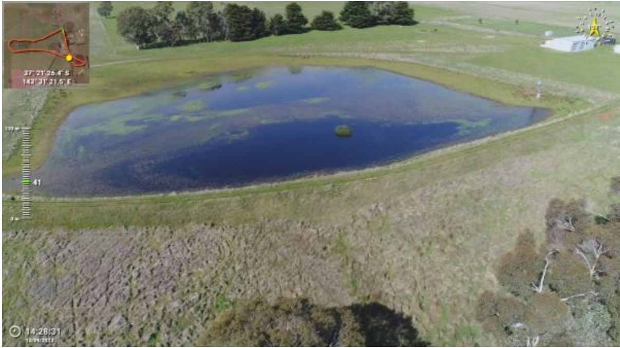
Appendix Plate 97. Waterbody 82; Moderate habitat quality (Ecology and Heritage Partners Pty Ltd 09/2023).