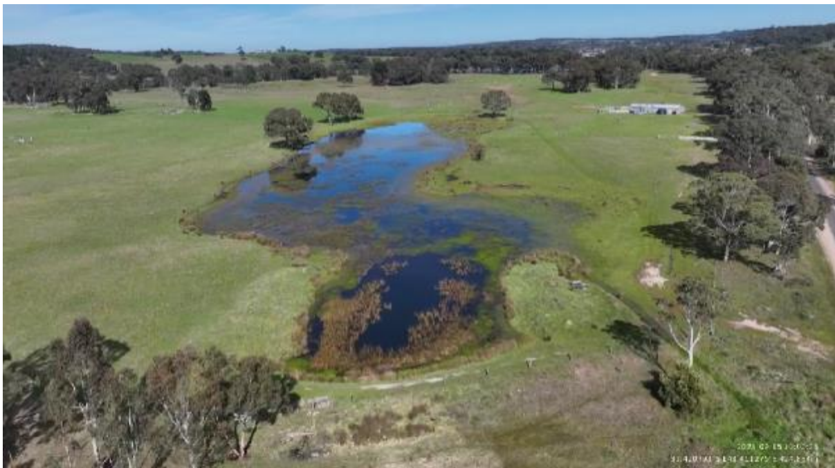
Appendix Plate 74. Waterbody 60; Moderate habitat quality.

This copied document to be made available for the sole purpose of enabling its consideration and review as part of a planning process under the Planning and Environment Act 1987. The document must not be used for any purpose which may breach any copyright