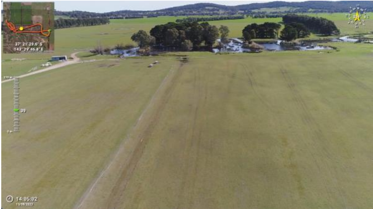
Appendix Plate 289. Waterbody 257; Moderate habitat quality (Ecology and Heritage Partners Pty Ltd 09/2023).