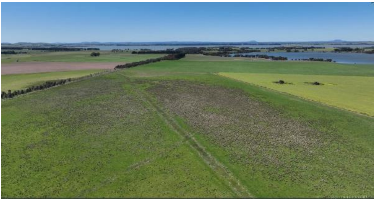
Appendix Plate 222. Waterbody 197; Low habitat quality.

This copied document to be made available for the sole purpose of enabling its consideration and review as part of a planning process under the Planning and Environment Act 1987. The document must not be used for any purpose which may breach any copyright