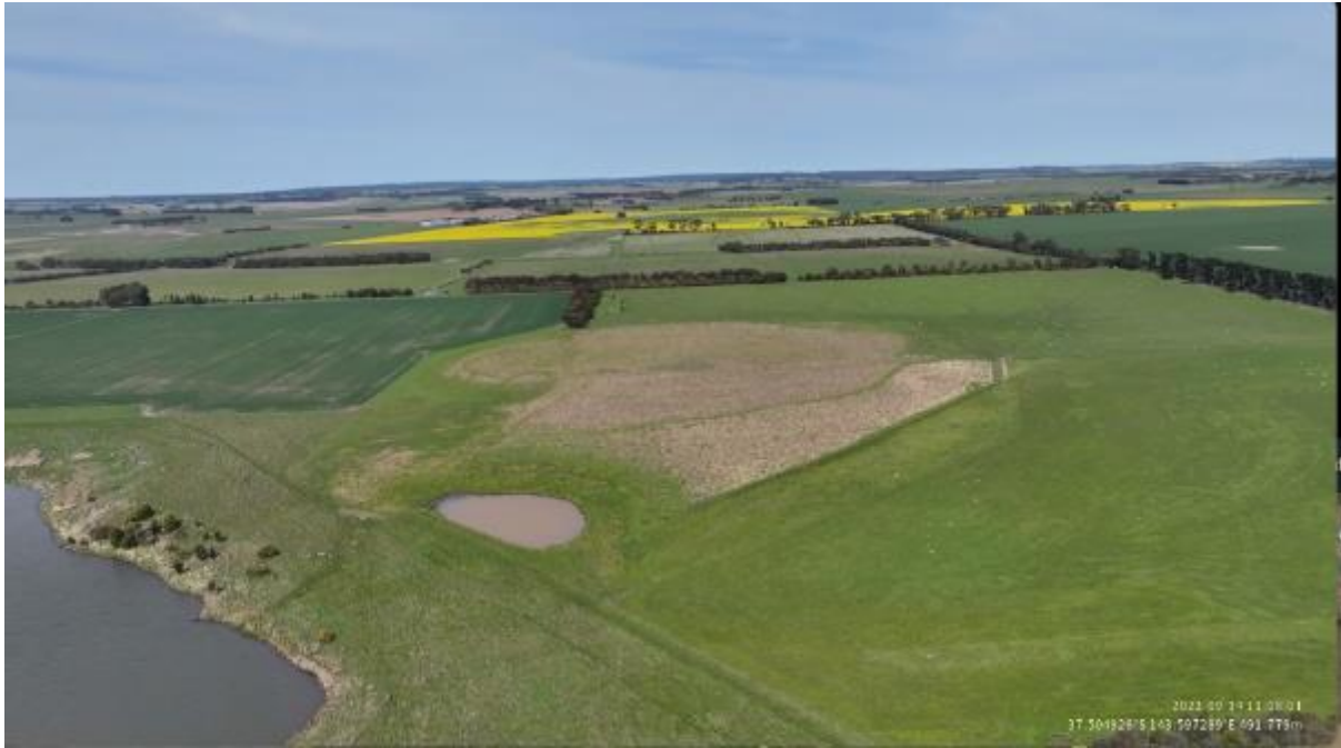
Appendix Plate 197. Waterbody 173; Low habitat quality (Ecology and Heritage Partners Pty Ltd 09/2023).