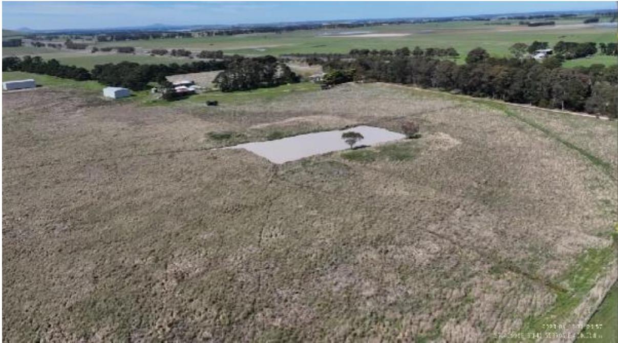
Appendix Plate 313. Waterbody 275; Low habitat quality (Ecology and Heritage Partners Pty Ltd 09/2023).