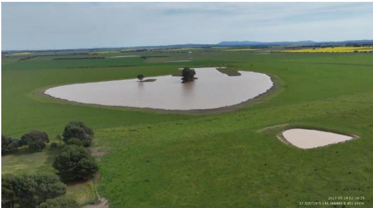
Appendix Plate 204. Waterbody 180; Low habitat quality (Ecology and Heritage Partners Pty Ltd 09/2023).

This copied document to be made available for the sole purpose of enabling its consideration and review as part of a planning process under the Planning and Environment Act 1987. The document must not be used for any purpose which may breach any copyright