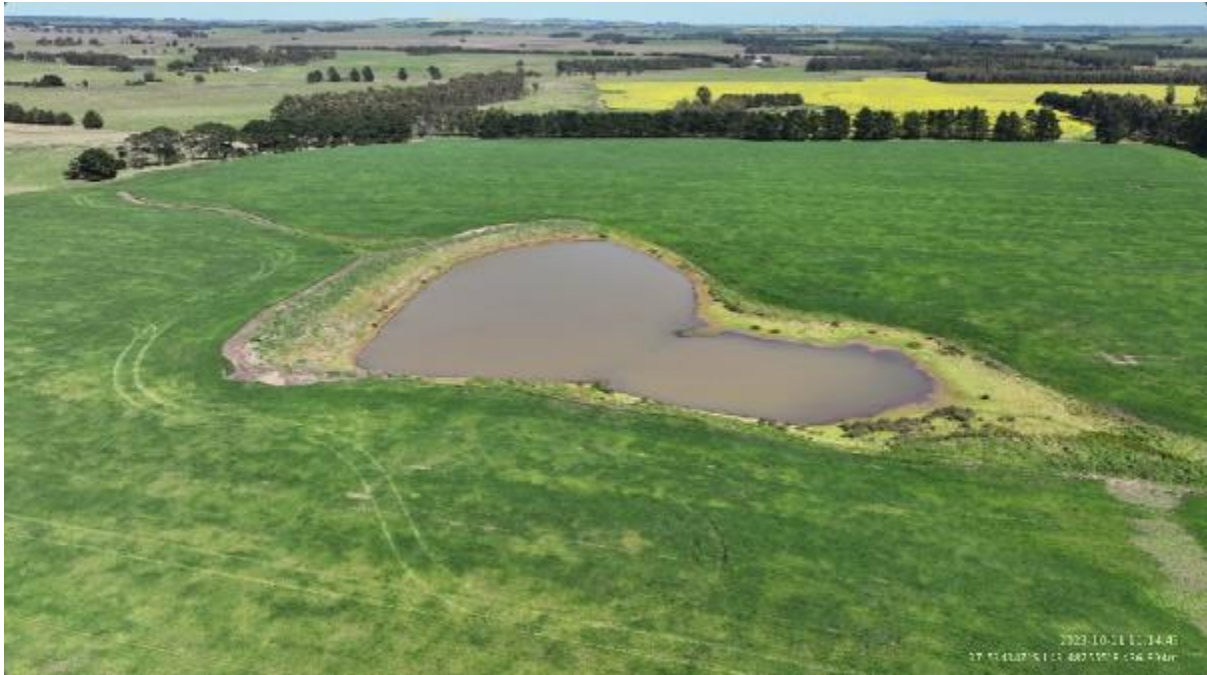
Appendix Plate 173. Waterbody 148; Low habitat quality (Ecology and Heritage Partners Pty Ltd 09/2023).