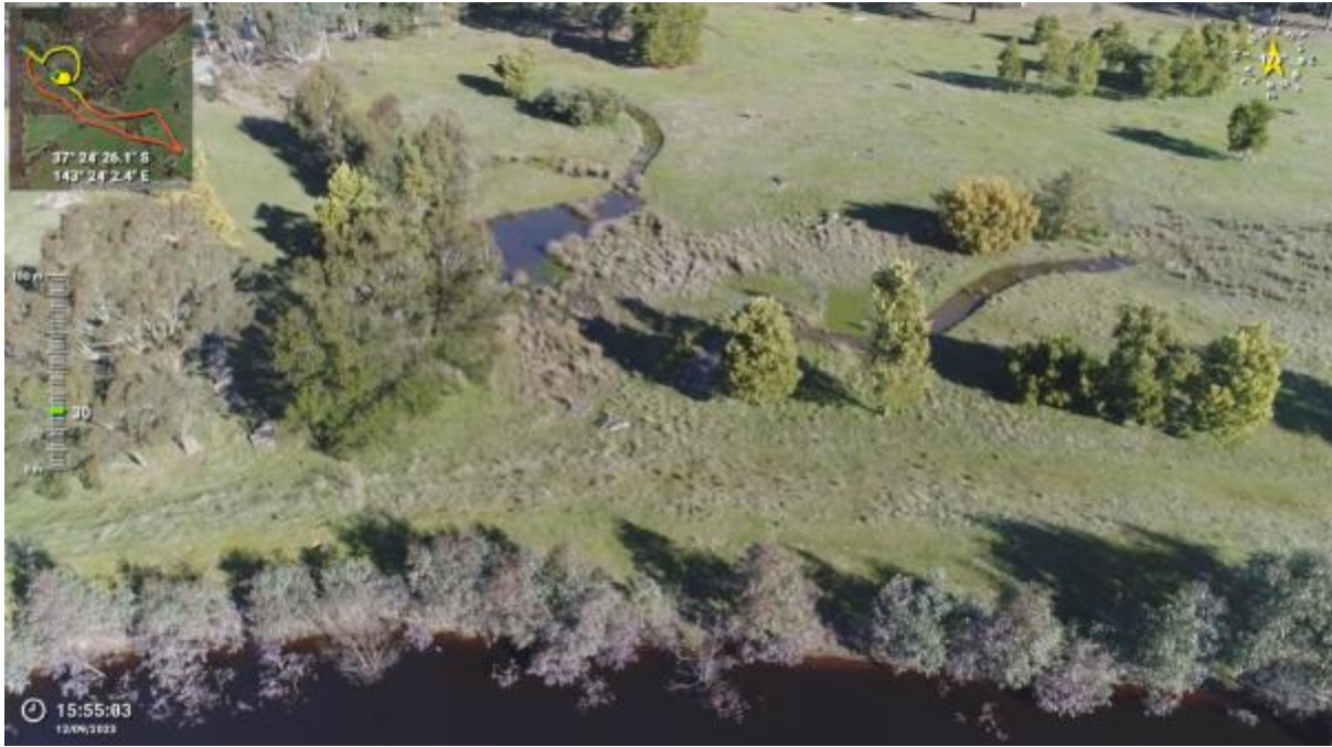
Appendix Plate 67. Waterbody 55; Low habitat quality (Ecology and Heritage Partners Pty Ltd 09/2023).