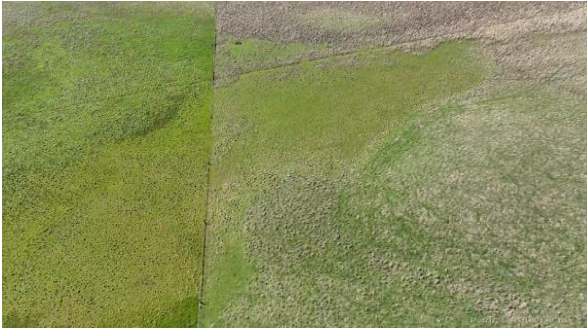
Appendix Plate 83. Waterbody 69; Low habitat quality.