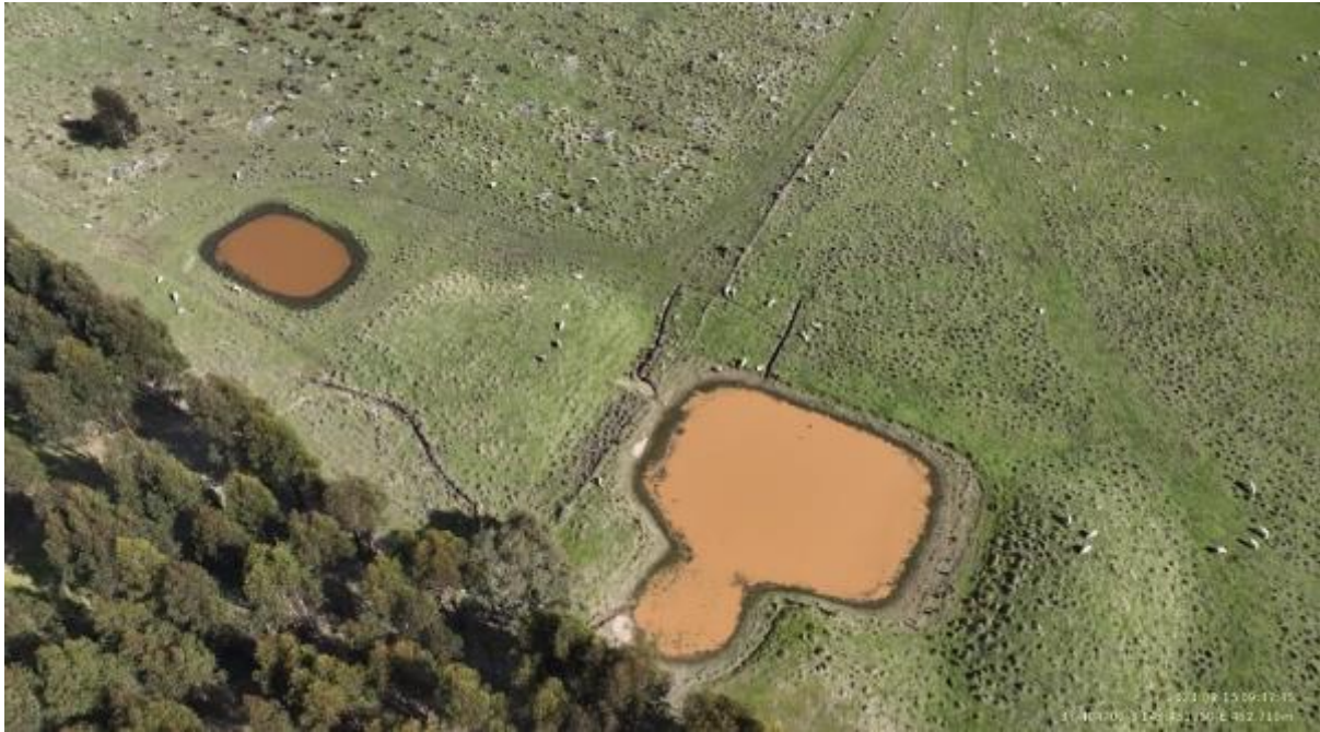
Appendix Plate 63. Waterbody 52; Low habitat quality.