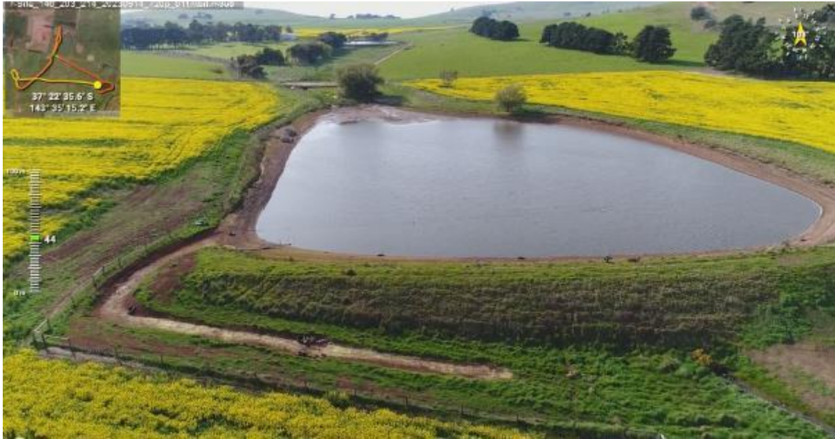
Appendix Plate 171. Waterbody 146; Low habitat quality (Ecology and Heritage Partners Pty Ltd 09/2023).