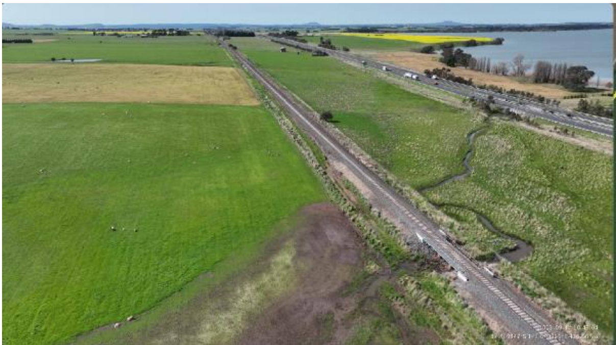
Appendix Plate 172. Waterbody 147; Low habitat quality (Ecology and Heritage Partners Pty Ltd 09/2023).

This copied document to be made available for the sole purpose of enabling its consideration and review as part of a planning process under the Planning and Environment Act 1987. The document must not be used for any purpose which may breach any copyright