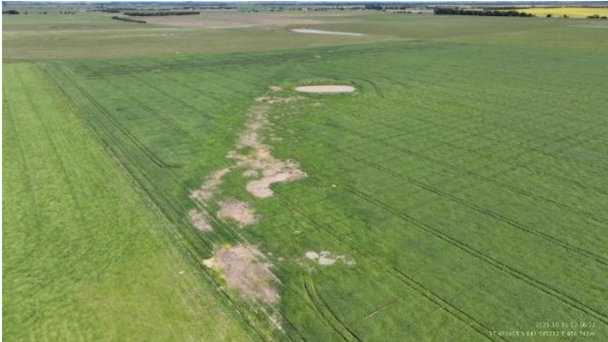
Appendix Plate 247. Waterbody 220; Low habitat quality (Ecology and Heritage Partners Pty Ltd 09/2023).