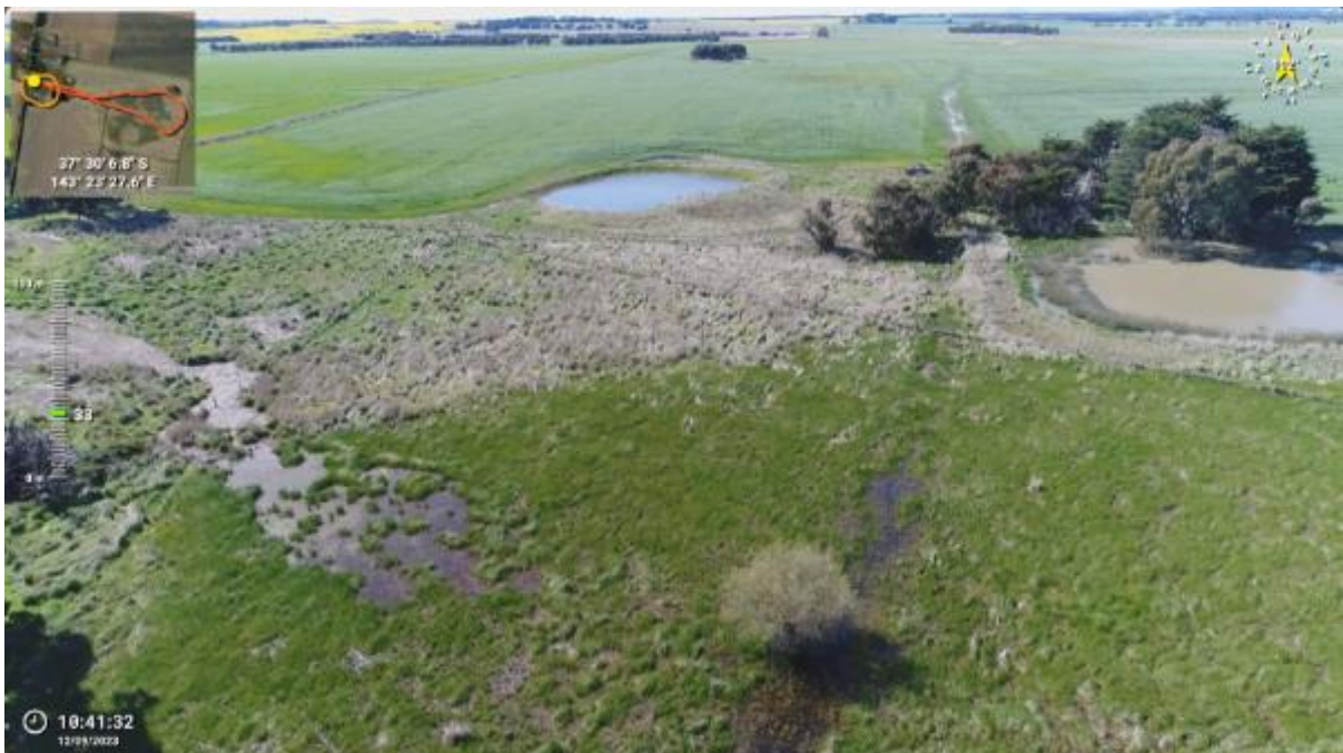
Appendix Plate 328. Waterbody 288; Moderate habitat quality (Ecology and Heritage Partners Pty Ltd 09/2023).