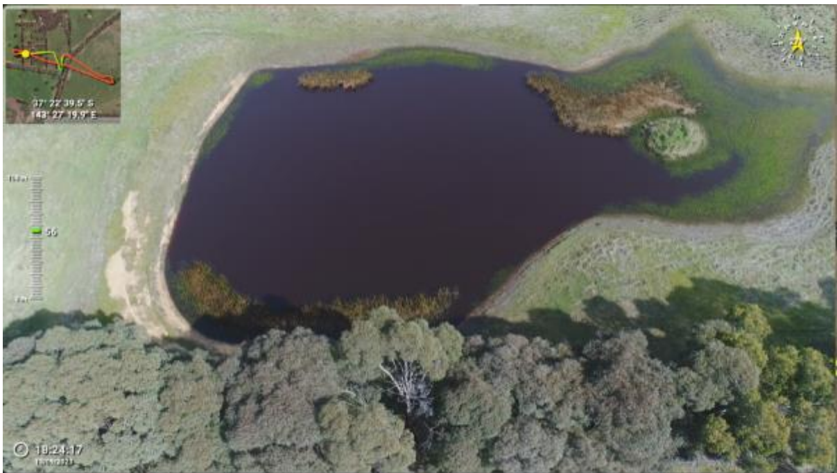
Appendix Plate 18. Waterbody 14; Moderate habitat quality.

This copied document to be made available for the sole purpose of enabling its consideration and review as part of a planning process under the Planning and Environment Act 1987. The document must not be used for any purpose which may breach any copyright