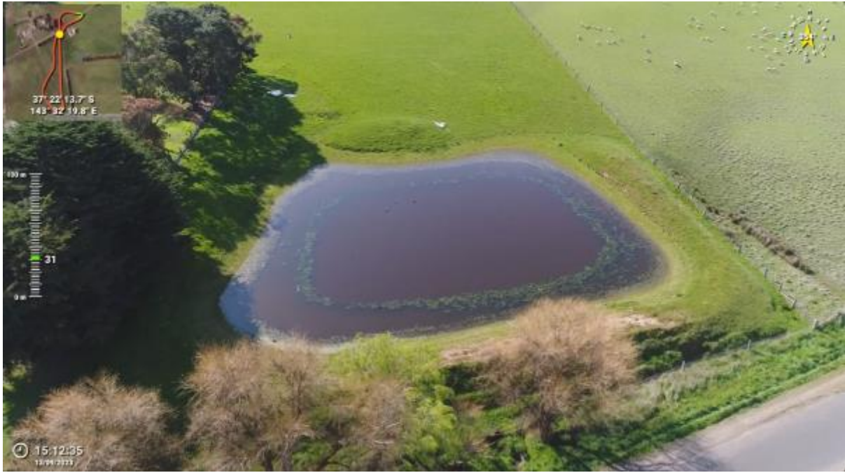
Appendix Plate 107. Waterbody 91; Low habitat quality (Ecology and Heritage Partners Pty Ltd 09/2023).