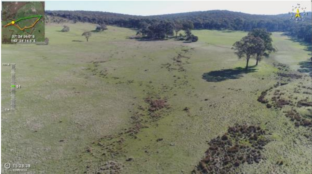
Appendix Plate 71. Waterbody 57; Low habitat quality (Ecology and Heritage Partners Pty Ltd 09/2023).