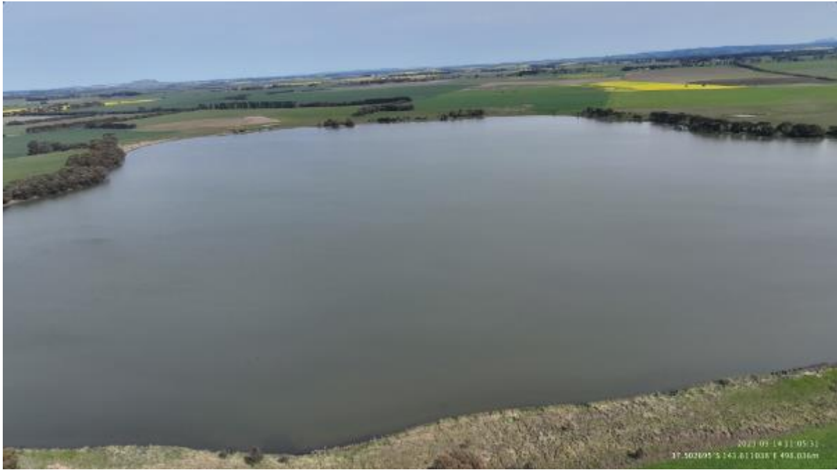
Appendix Plate 229. Waterbody 205; Low habitat quality (Ecology and Heritage Partners Pty Ltd 09/2023).