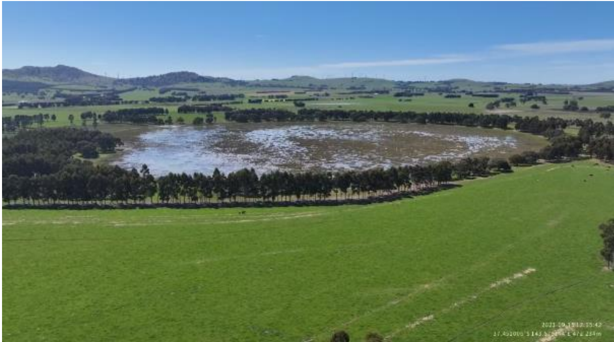
Appendix Plate 249. Waterbody 222; Moderate habitat quality (Ecology and Heritage Partners Pty Ltd 09/2023).