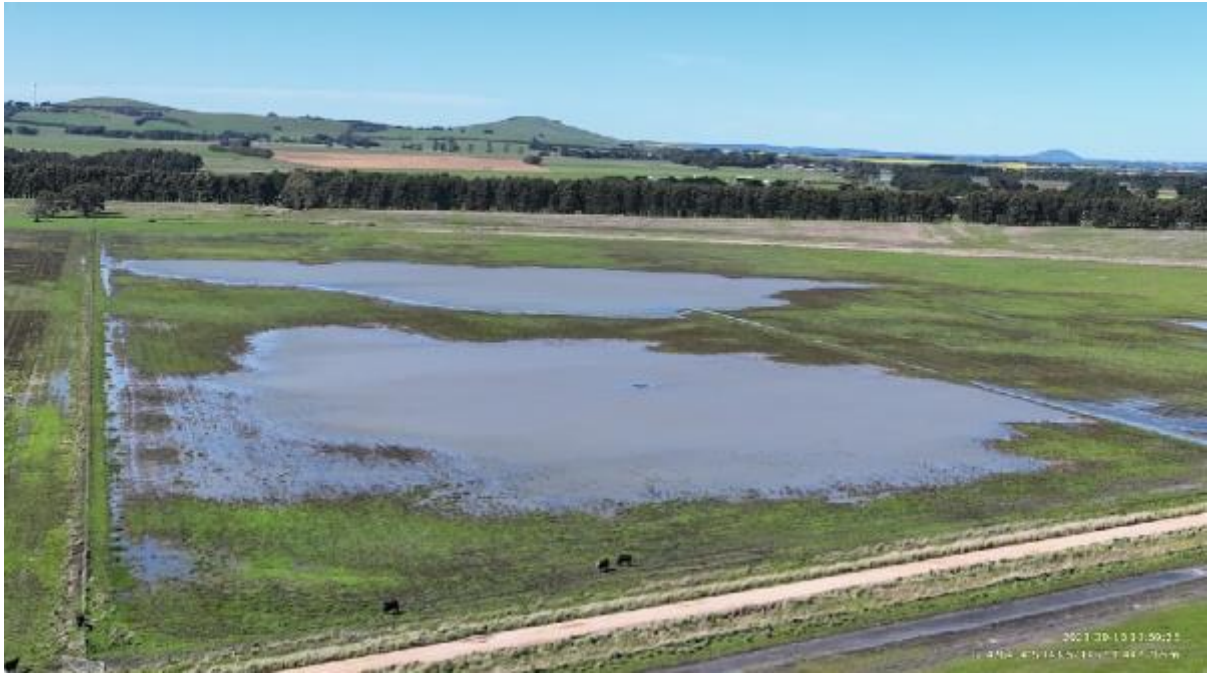
Appendix Plate 303. Waterbody 267; Moderate habitat quality (Ecology and Heritage Partners Pty Ltd 09/2023).