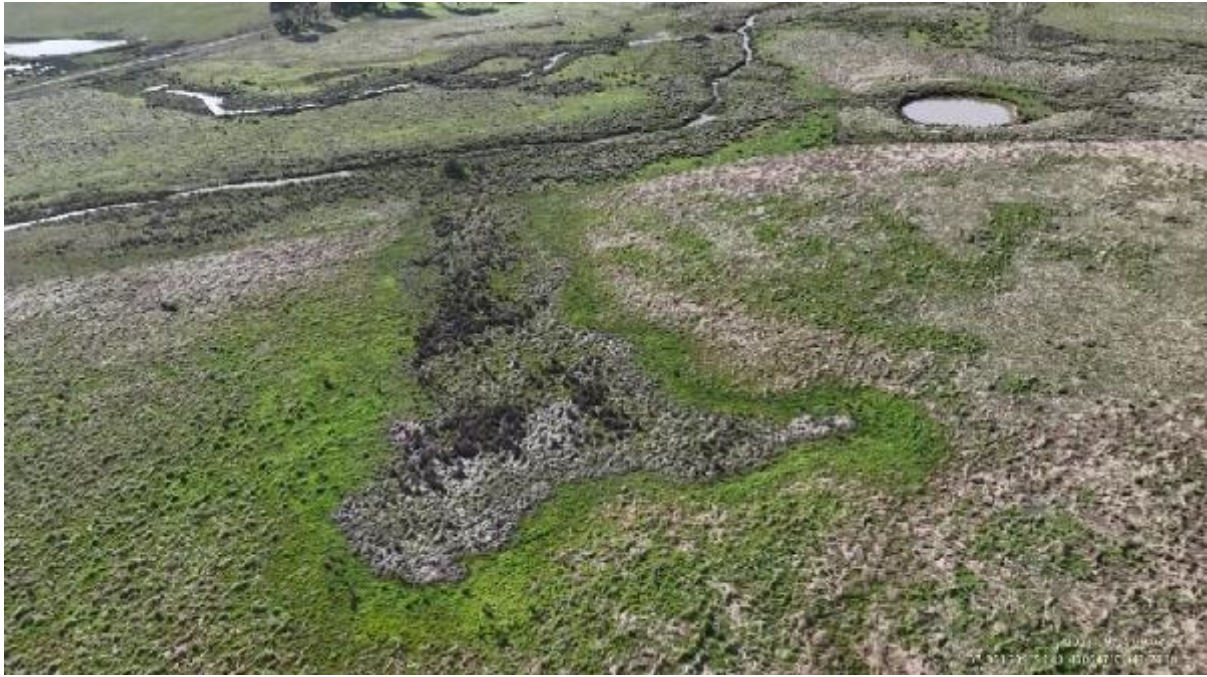
Appendix Plate 29. Waterbody 22 and 23; Low habitat quality (Ecology and Heritage Partners Pty Ltd 09/2023).