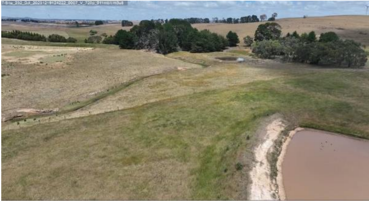
Appendix Plate 259. Waterbody 232; Low habitat quality.