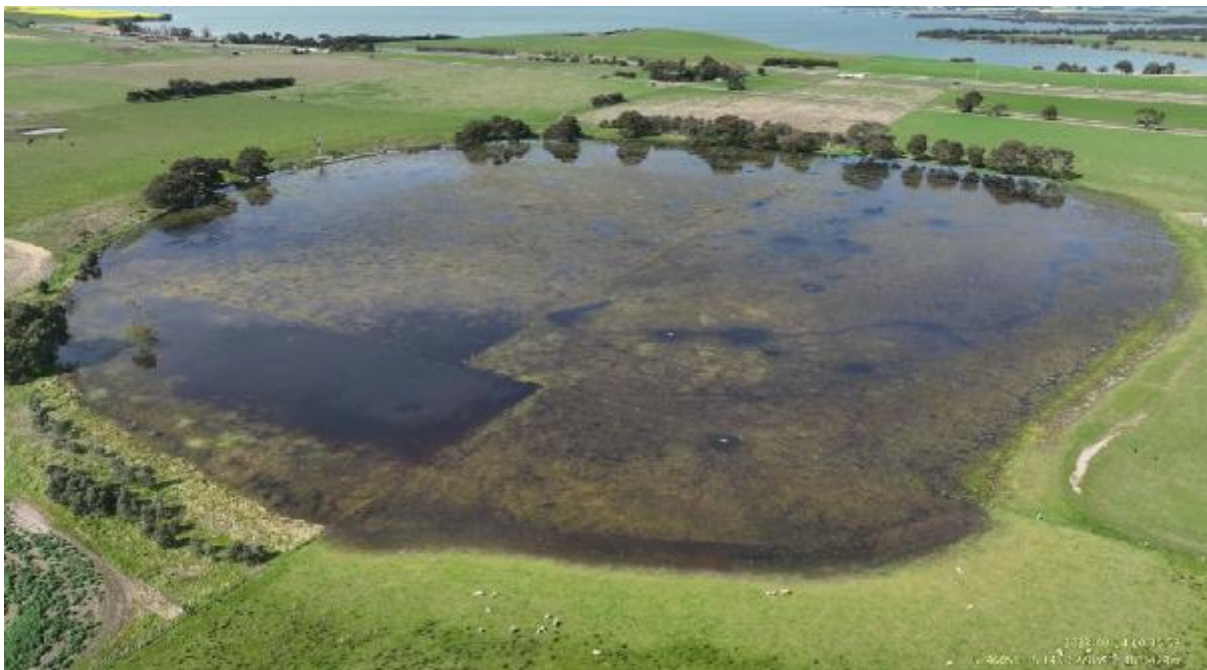
Appendix Plate 296. Waterbody 262; Moderate habitat quality (Ecology and Heritage Partners Pty Ltd 09/2023).