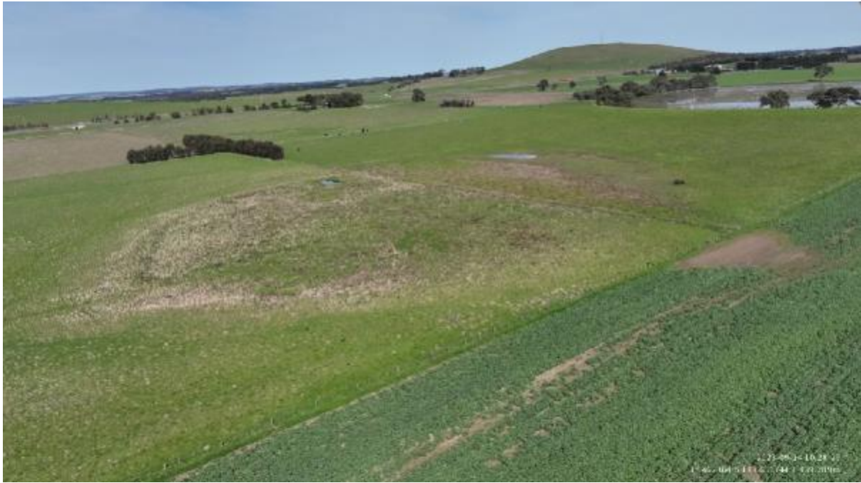
Appendix Plate 297. Waterbody 263; Low habitat quality (Ecology and Heritage Partners Pty Ltd 09/2023).