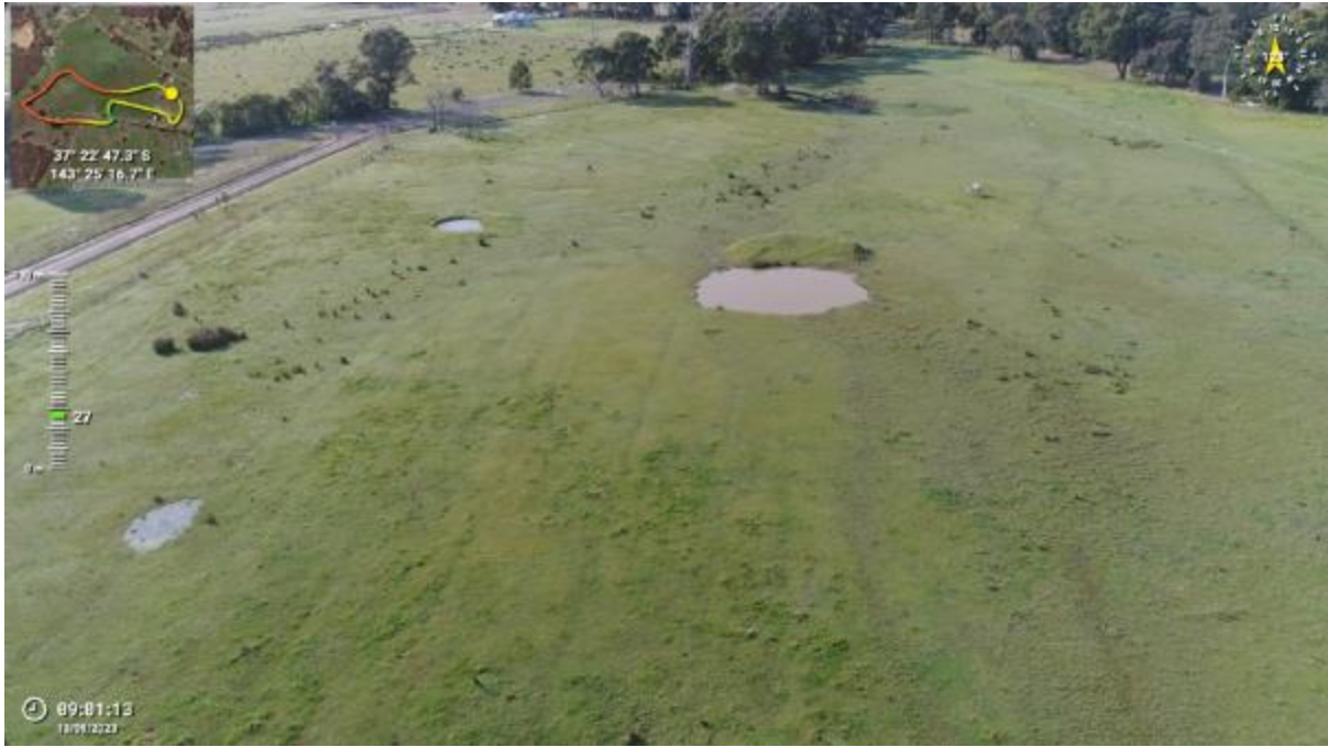
Appendix Plate 37. Waterbody 28 and 29; Low habitat quality (Ecology and Heritage Partners Pty Ltd 09/2023).