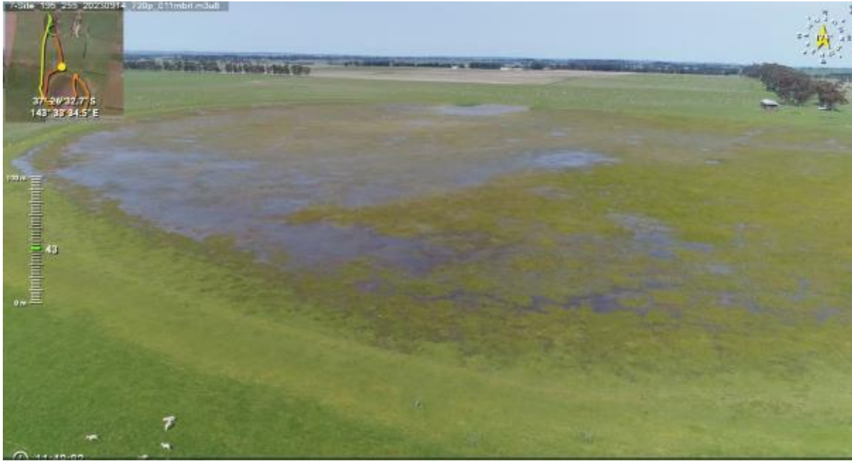
Appendix Plate 287. Waterbody 255; High habitat quality (Ecology and Heritage Partners Pty Ltd 09/2023).