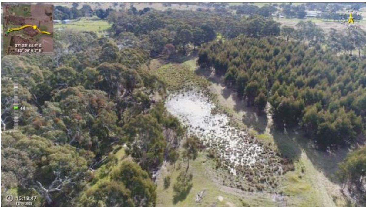
Appendix Plate 6. Waterbody 3; High habitat quality (Ecology and Heritage Partners Pty Ltd 09/2023).

This copied document to be made available for the sole purpose of enabling its consideration and review as part of a planning process under the Planning and Environment Act 1987. The document must not be used for any purpose which may breach any copyright