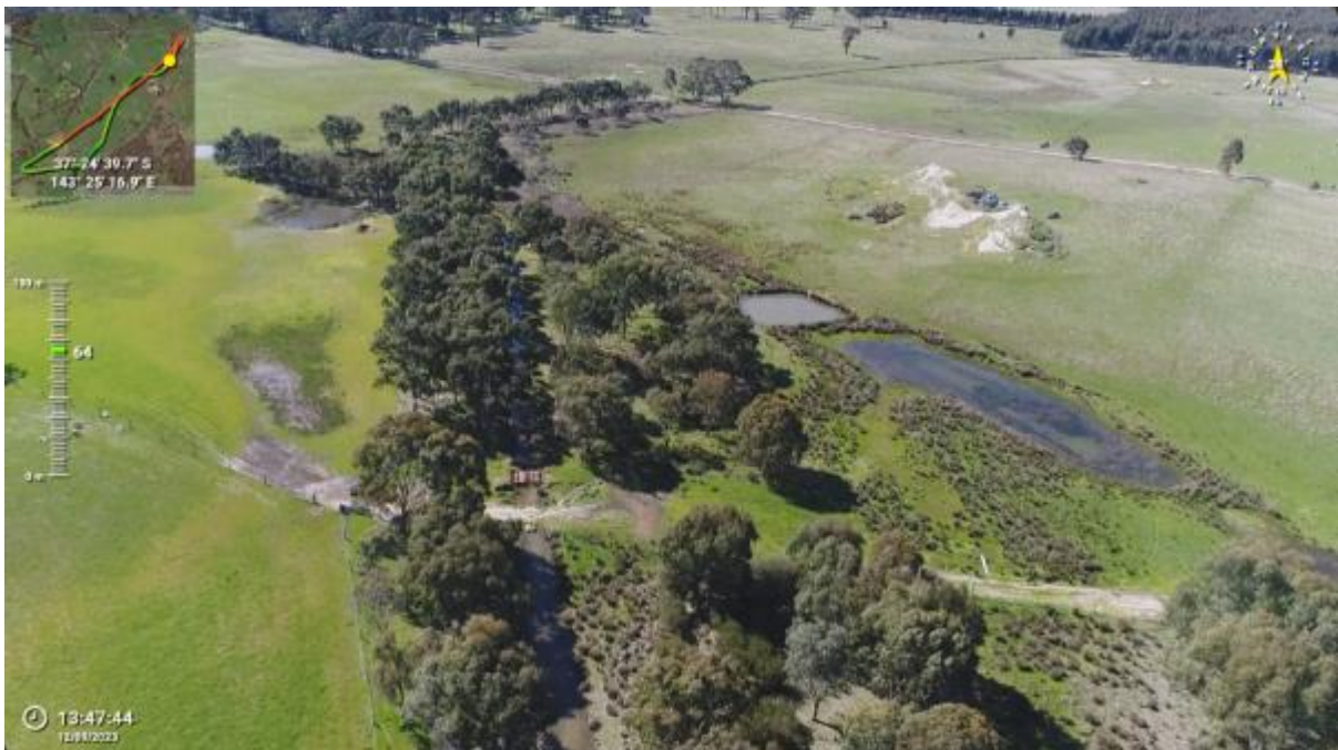
Appendix Plate 52. Waterbody 42; Low habitat quality (Ecology and Heritage Partners Pty Ltd 09/2023).

This copied document to be made available for the sole purpose of enabling its consideration and review as part of a planning process under the Planning and Environment Act 1987. The document must not be used for any purpose which may breach any copyright