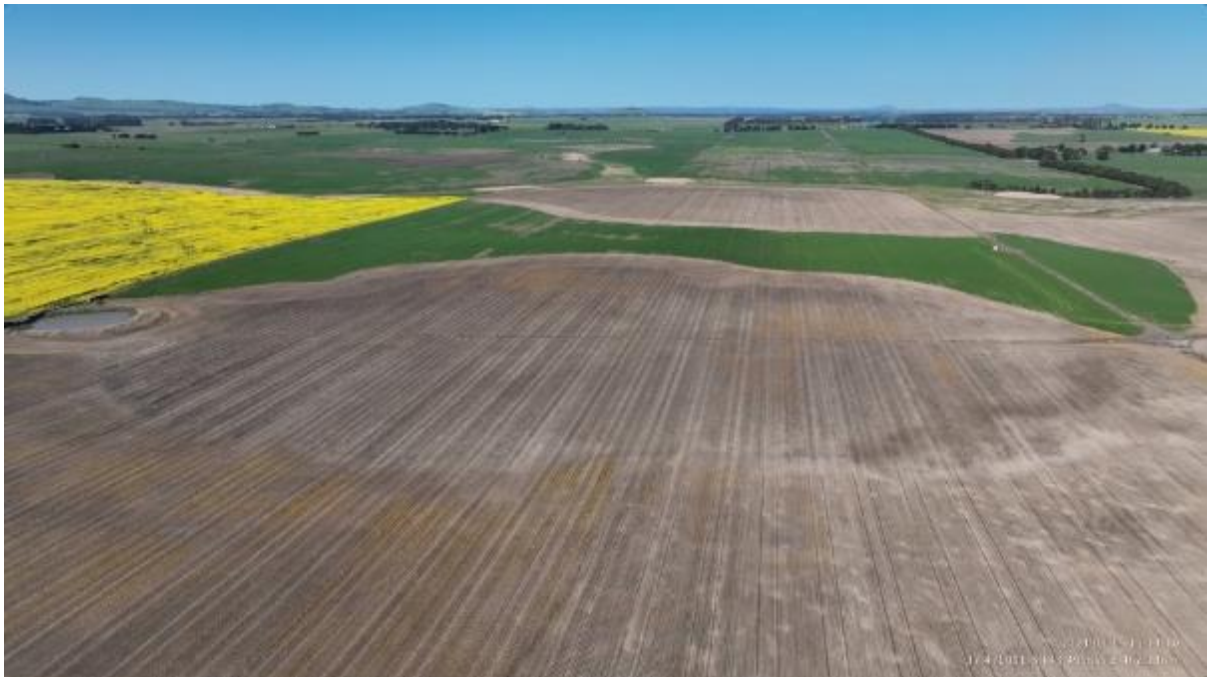
Appendix Plate 136. Waterbody 116; Low habitat quality.

This copied document to be made available for the sole purpose of enabling its consideration and review as part of a planning process under the Planning and Environment Act 1987. The document must not be used for any purpose which may breach any copyright