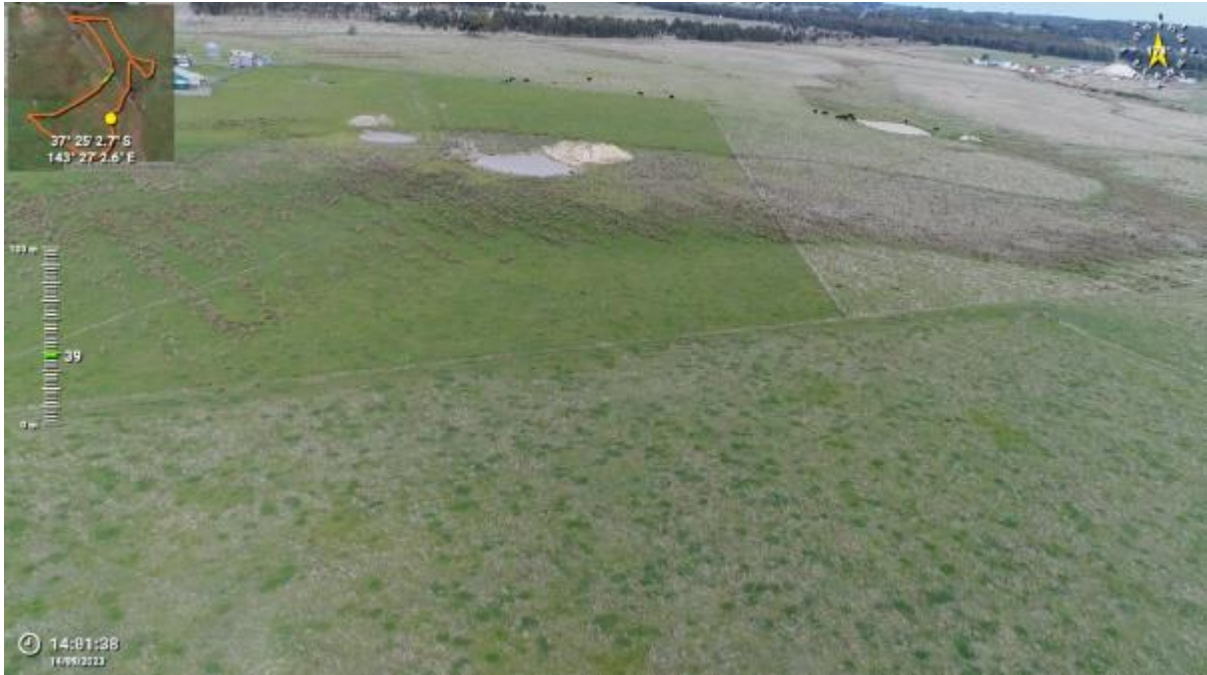
Appendix Plate 317. Waterbody 278; Low habitat quality (Ecology and Heritage Partners Pty Ltd 09/2023).