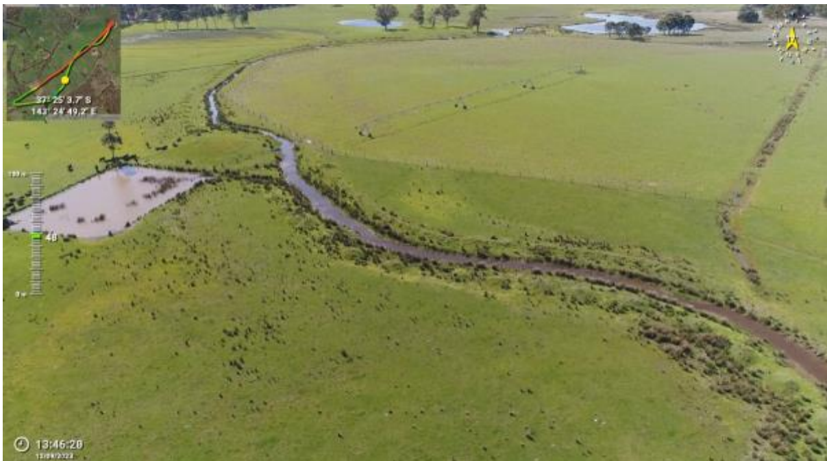
Appendix Plate 48. Waterbody 37; Low habitat quality.

This copied document to be made available for the sole purpose of enabling its consideration and review as part of a planning process under the Planning and Environment Act 1987. The document must not be used for any purpose which may breach any copyright