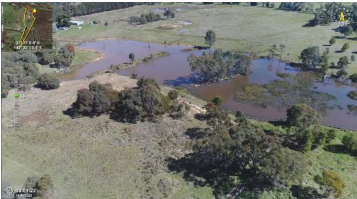
Appendix Plate 326. Waterbody 287; Moderate habitat quality (Ecology and Heritage Partners Pty Ltd 09/2023).