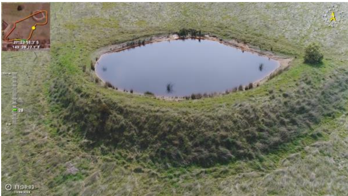
Appendix Plate 80. Waterbody 66; Low habitat quality (Ecology and Heritage Partners Pty Ltd 09/2023).

This copied document to be made available for the sole purpose of enabling its consideration and review as part of a planning process under the Planning and Environment Act 1987. The document must not be used for any purpose which may breach any copyright