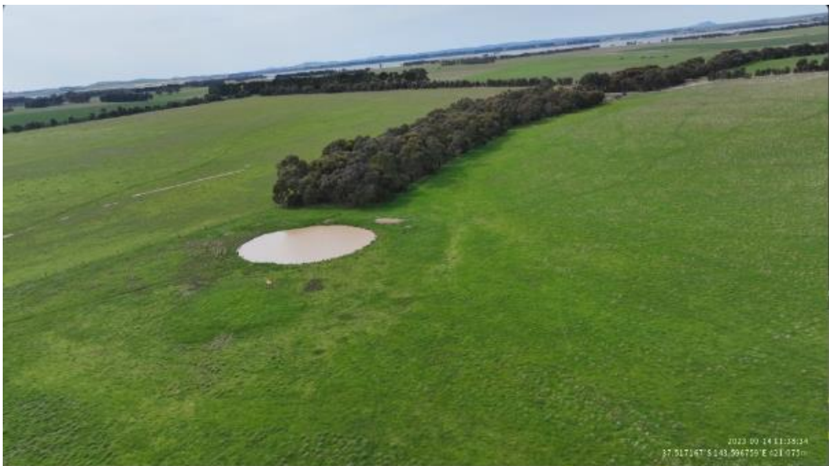
Appendix Plate 196. Waterbody 172; Low habitat quality (Ecology and Heritage Partners Pty Ltd 09/2023).

This copied document to be made available for the sole purpose of enabling its consideration and review as part of a planning process under the Planning and Environment Act 1987. The document must not be used for any purpose which may breach any copyright