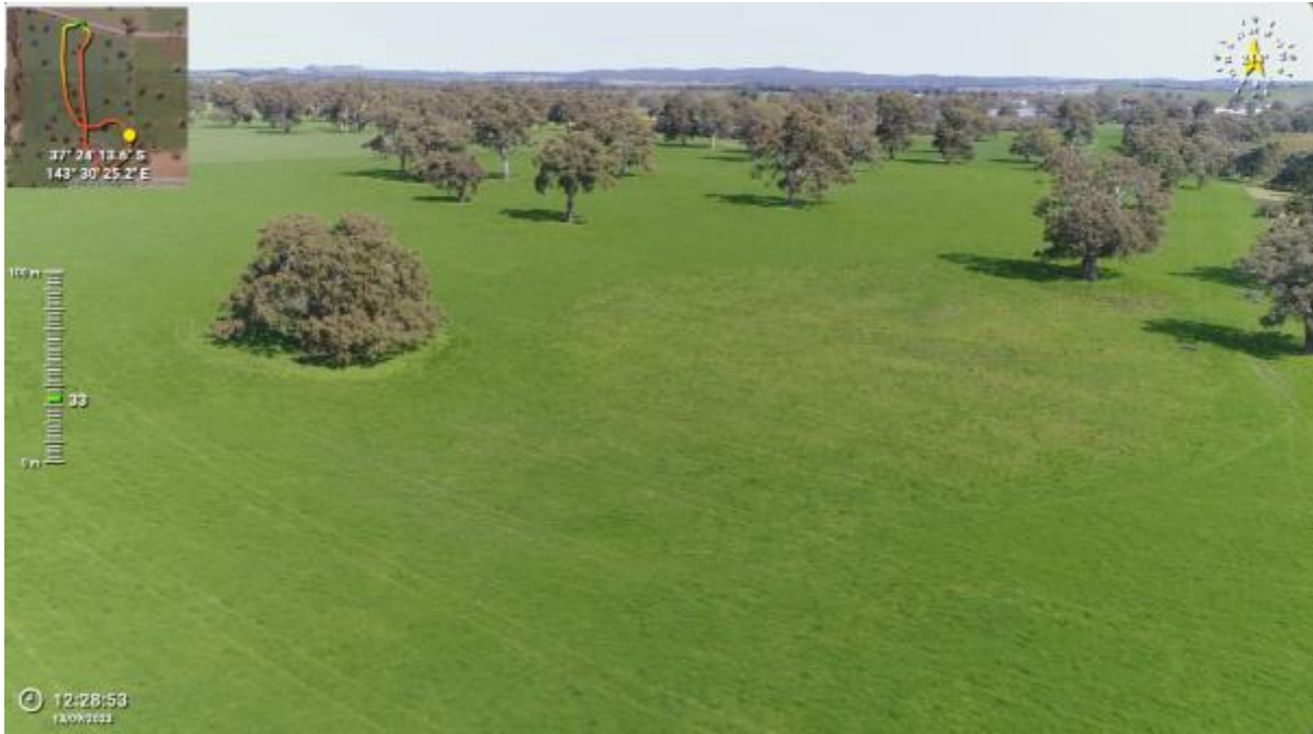
Appendix Plate 125. Waterbody 107; Low habitat quality (Ecology and Heritage Partners Pty Ltd 09/2023).