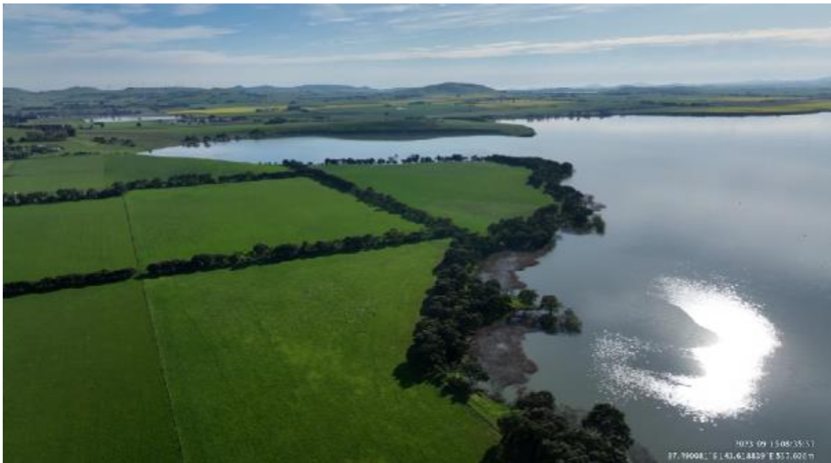
Appendix Plate 182. Waterbody 157; Low habitat quality (Ecology and Heritage Partners Pty Ltd 09/2023).

This copied document to be made available for the sole purpose of enabling its consideration and review as part of a planning process under the Planning and Environment Act 1987. The document must not be used for any purpose which may breach any copyright