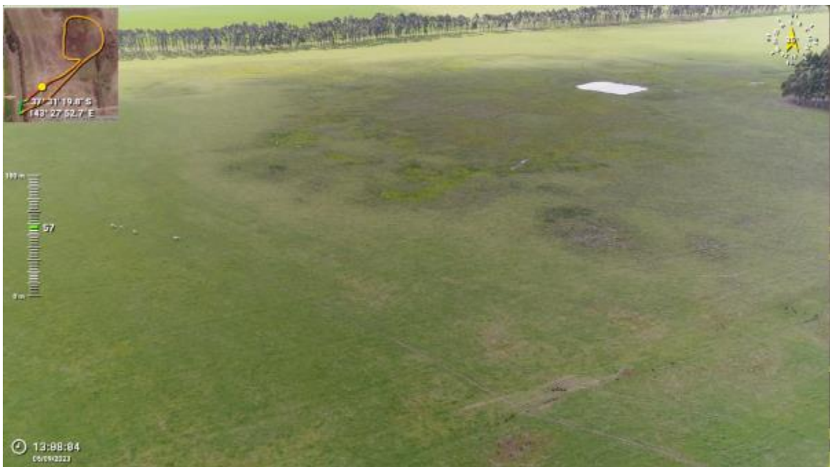
Appendix Plate 322. Waterbody 282; Moderate habitat quality (Ecology and Heritage Partners Pty Ltd 09/2023).