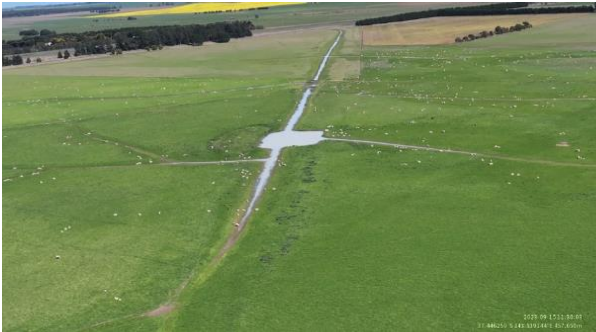
Appendix Plate 156. Waterbody 135; Low habitat quality (Ecology and Heritage Partners Pty Ltd 09/2023).

This copied document to be made available for the sole purpose of enabling its consideration and review as part of a planning process under the Planning and Environment Act 1987. The document must not be used for any purpose which may breach any copyright