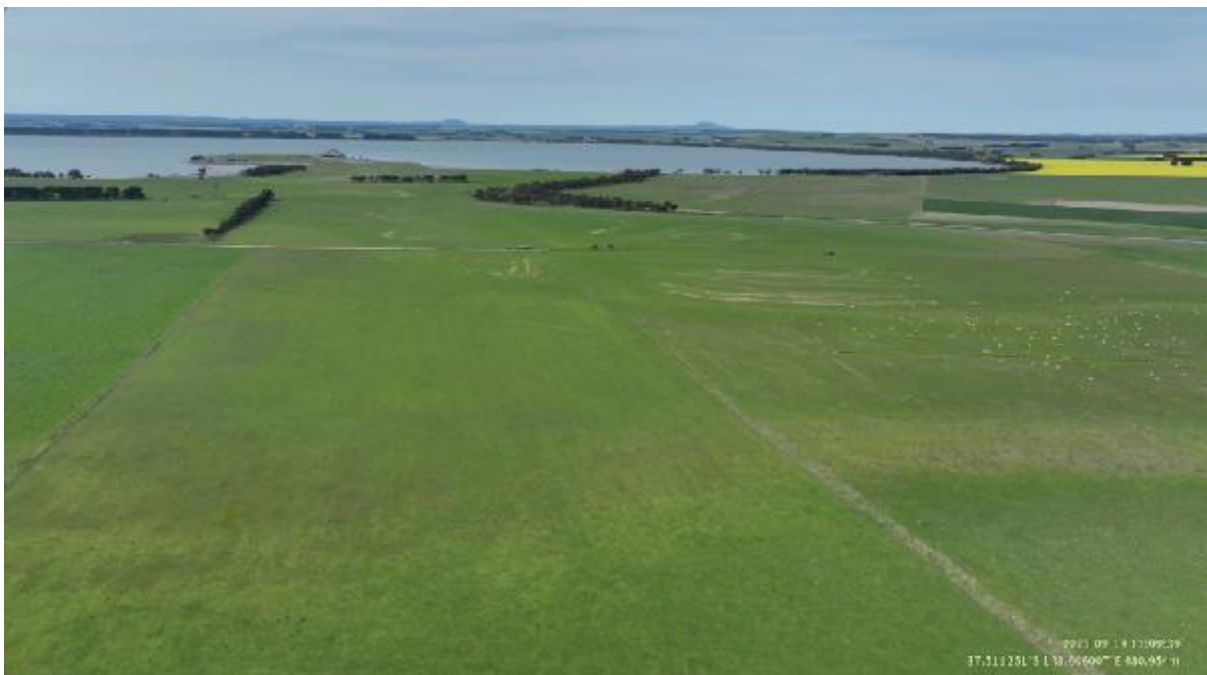
Appendix Plate 190. Waterbody 165; Low habitat quality (Ecology and Heritage Partners Pty Ltd 09/2023).

This copied document to be made available for the sole purpose of enabling its consideration and review as part of a planning process under the Planning and Environment Act 1987. The document must not be used for any purpose which may breach any copyright