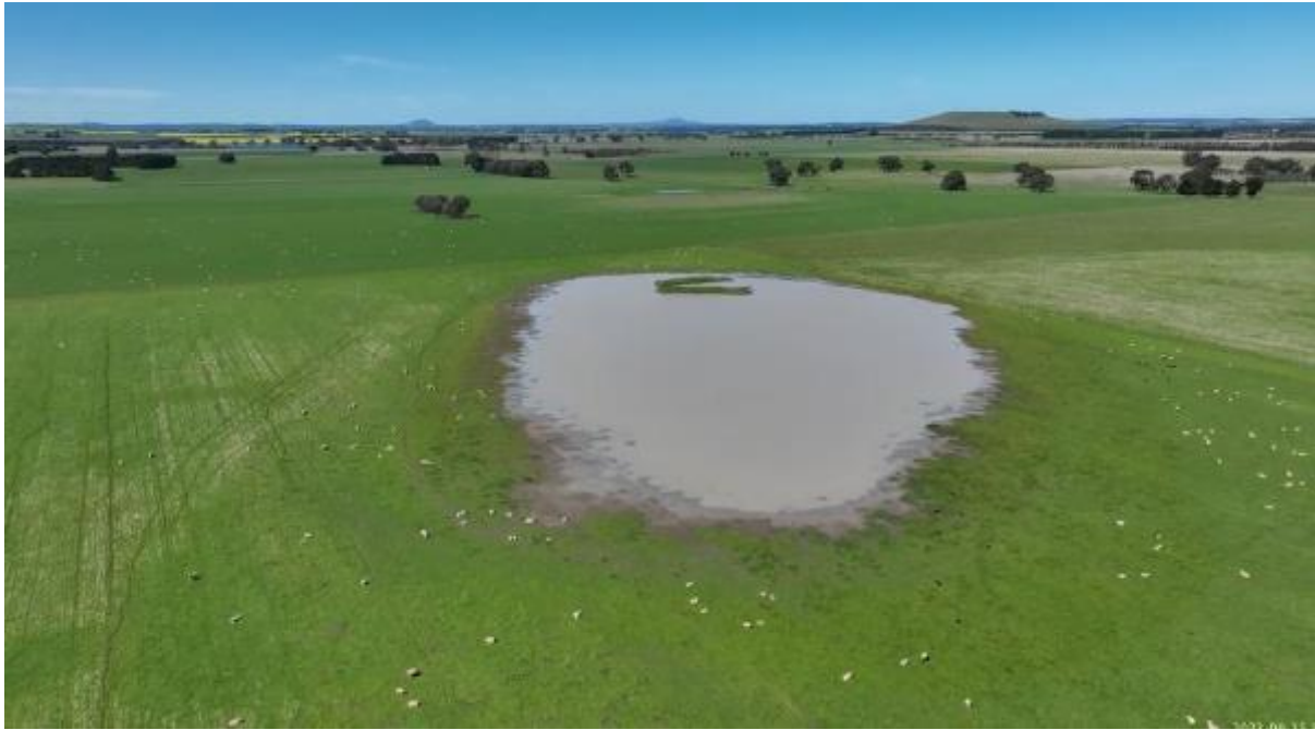
Appendix Plate 177. Waterbody 152; Low habitat quality (Ecology and Heritage Partners Pty Ltd 09/2023).