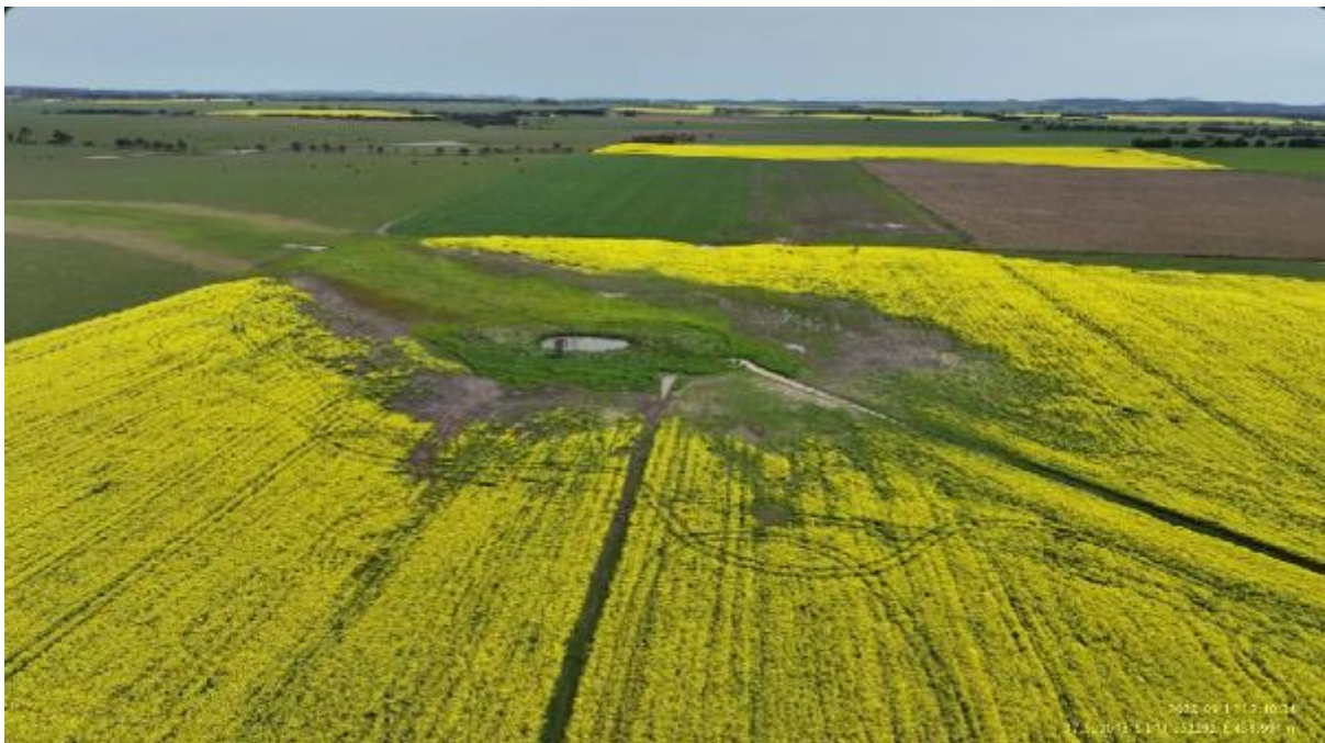
Appendix Plate 250. Waterbody 223; Low habitat quality (Ecology and Heritage Partners Pty Ltd 09/2023).

This copied document to be made available for the sole purpose of enabling its consideration and review as part of a planning process under the Planning and Environment Act 1987. The document must not be used for any purpose which may breach any copyright